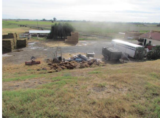
Looking east at garbage at landside toe.