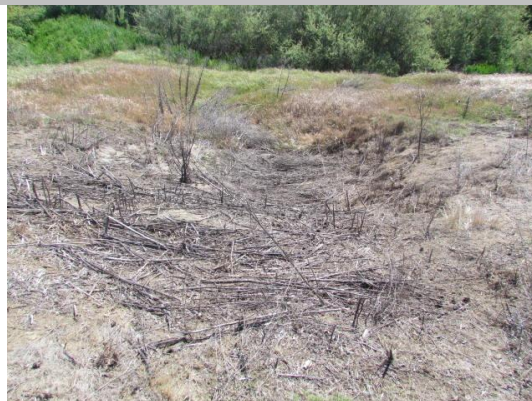
Looking north on depression on landward slope.

LS : Land Side N/A : Not Applicable WS : Water Side CR : Crown