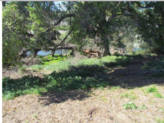
Looking east at downed tree on waterward slope.