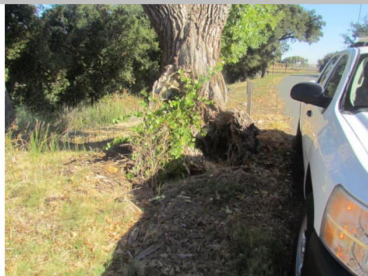
Looking east at hole at base of tree on waterward shoulder. (2014)