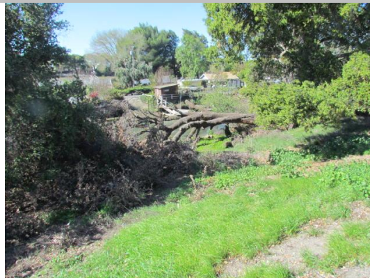
Looking southeast at downed tree on waterward slope.