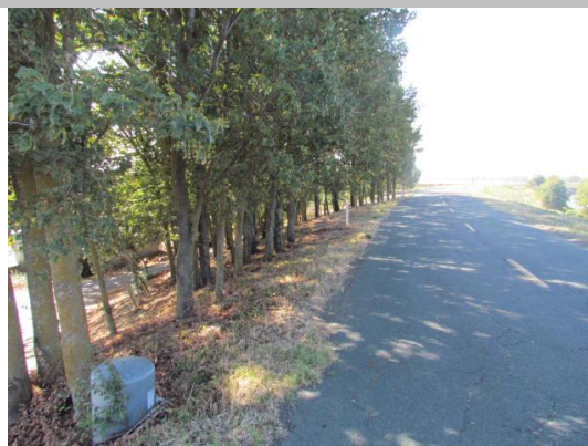
Looking southeast at trees on landward shoulder and slope.