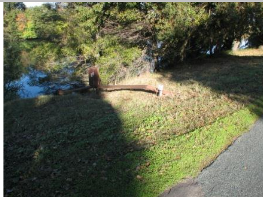
Irrigation intake pipe from Steamboat Slough.