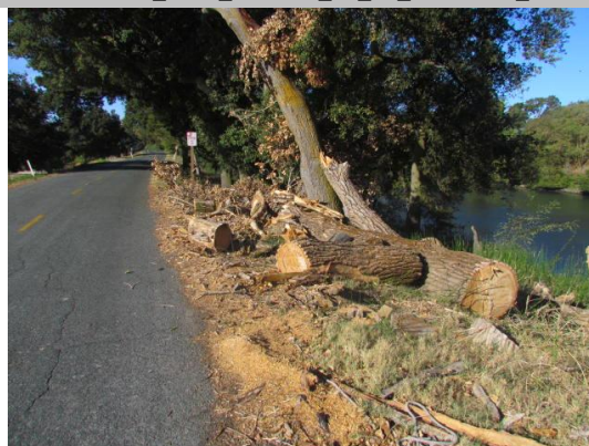
Looking south at tree branches on waterward shoulder.(Spring 2014)