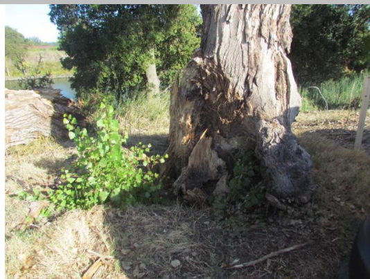
Looking west at a hole next to oak tree on waterward shoulder.