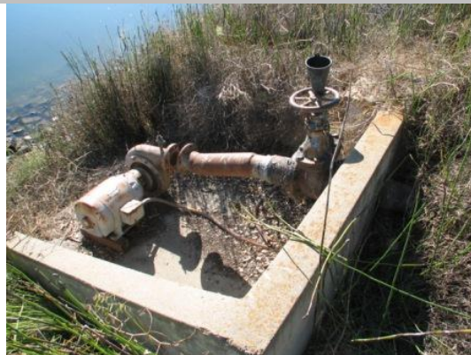
Pipe penetration, closure valve in open position.