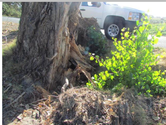
Looking east at a hole next to oak tree on waterward shoulder.