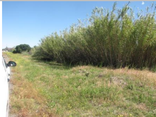
Looking northeast at bamboo on waterside slope.