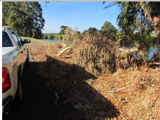
Looking southwest at broken tree limbs on waterward shoulder and slope.