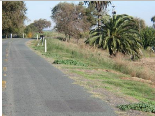
Vegetation on levee slopes and toe partially obstruct visibility.

* Location LS : Land Side N/A : Not Applicable WS : Water Side CR : Crown