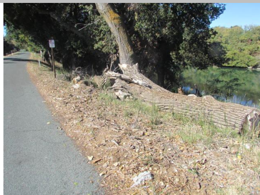
Looking west at tree branch on waterward shoulder and slope. (Fall 2014)