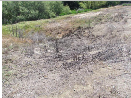
Looking east at depression on landward slope.