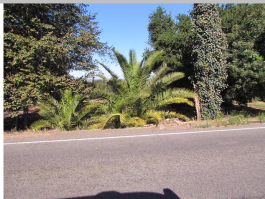
Looking west at palm trees on landward shoulder and slope.