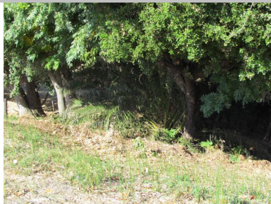
Looking west at palm tree on landward toe.