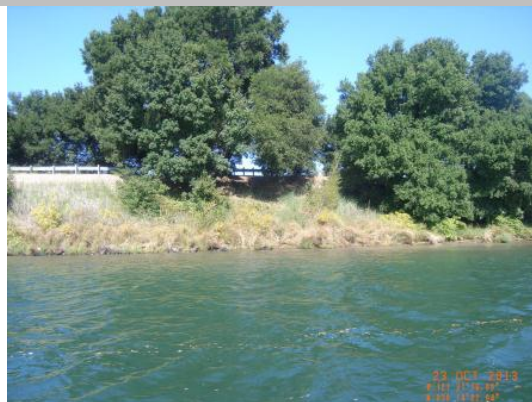
USACE 2013 Photo #2