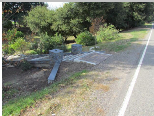
Looking northwest at stairs on landside slope.