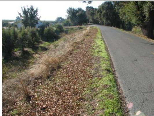
Grass on levee slope and toe exceeds 12" and partially obstructs visibility.