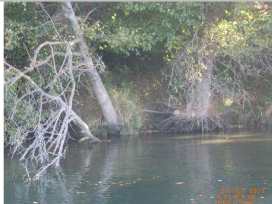
USACE 2013 Photo #2