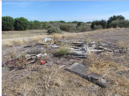
Looking northwest at garbage on landward slope.