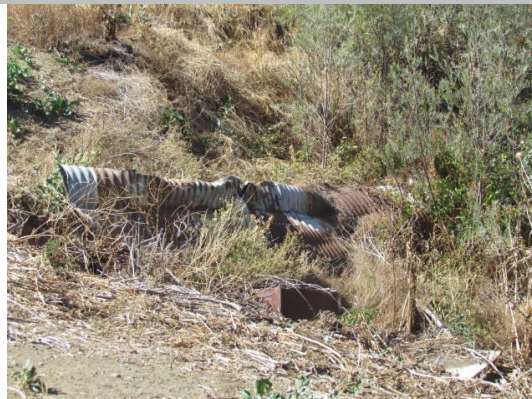
Looking southeast at old corrugated pipe on waterward slope.