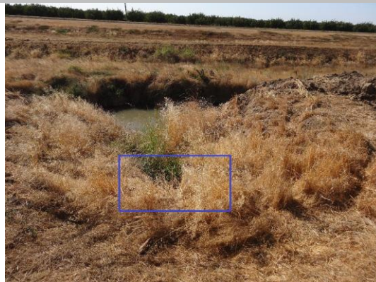
WS view: U type concrete headwall and channel on waterside.