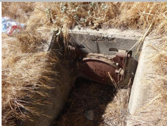
WS view: U typed concrete headwall, CM pipe, and flap gate.