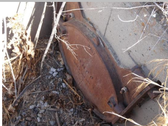
WS view: U typed concrete headwall, CM pipe, and flap gate. Spillway needs to be cleared.