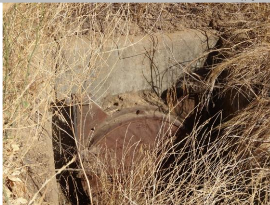
WS view: U typed concrete headwall, CM pipe and flap gate. Vegetation and debris need to be cleared.