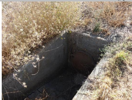
WS view: U typed concrete headwall, CM pipe, and flap gate. Vegetation needs to be cleared on spillway.