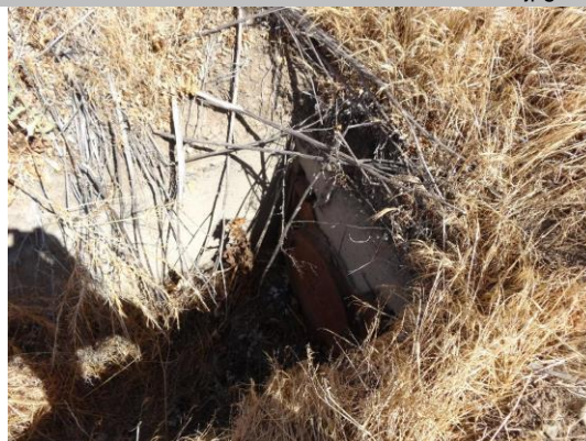
WS view: concrete spillway and channel on waterside. Dense vegetation on levee slope and spillway.