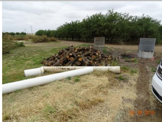
View of wood pile and pipes on waterside slope. (Spring 2019)