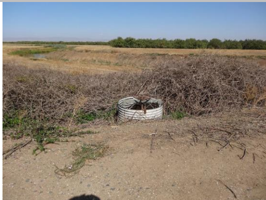
LS view: overview of CM pipe riser with slide gate. Dense vegetation on landside.