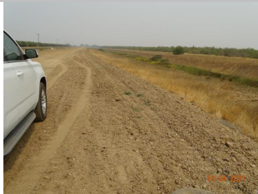
Dredgings have been leveled but still left within the channel. (Fall 2021)