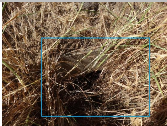
LS view: concrete headwall and CM pipe. Inlet needs cleaning.