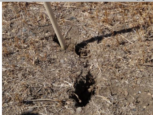
WS view: significant levee cracks along the pipe alignment. Needs detailed investigation on the issue.