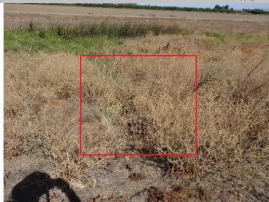
WS view: Dense vegetation on levee slope and spillway.