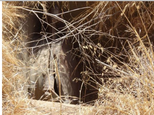
WS view: U typed concrete headwall, CM pipe, and flap gate. Flap gate was not properly closed.