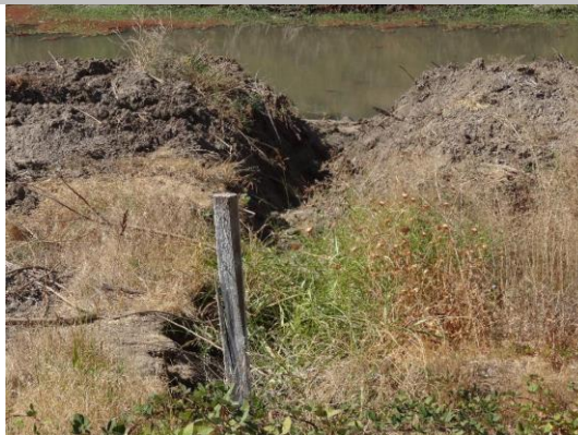
WS view: cobble spillway and channel on waterside.