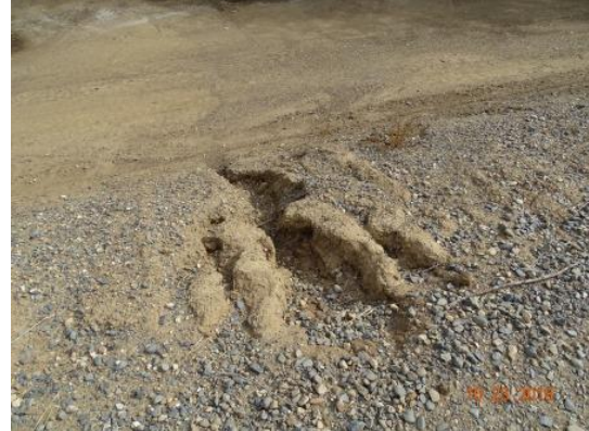
View of large finger erosion in landside slope. (Fall 2018)