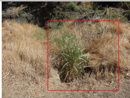
WS view: cobble spillway and channel on waterside. Dense vegetation on levee slope and spillway.