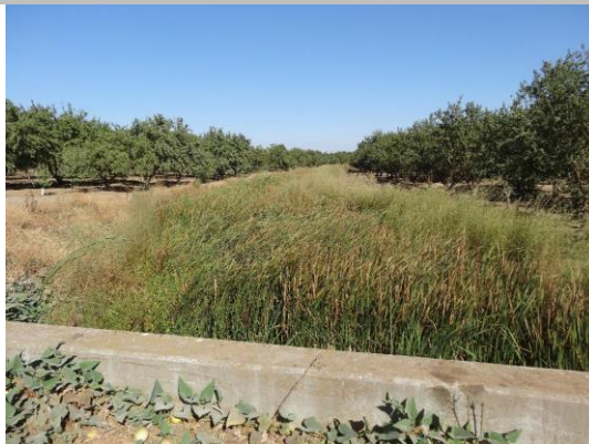
LS view: concrete headwall in drainage ditch. Dense vegetation in drainage ditch.