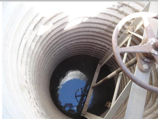
WS view: inside view of CMP standpipe with slide gate.

* Location LS : Land Side N/A : Not Applicable WS : Water Side CR : Crown