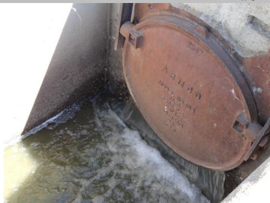
WS view: U typed concrete headwall, CM pipe, and flap gate. Drainage was working during survey.