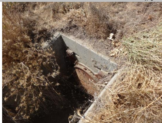
WS view: U typed concrete headwall, CM pipe, and flap gate. Vegetation needs to be cleared.