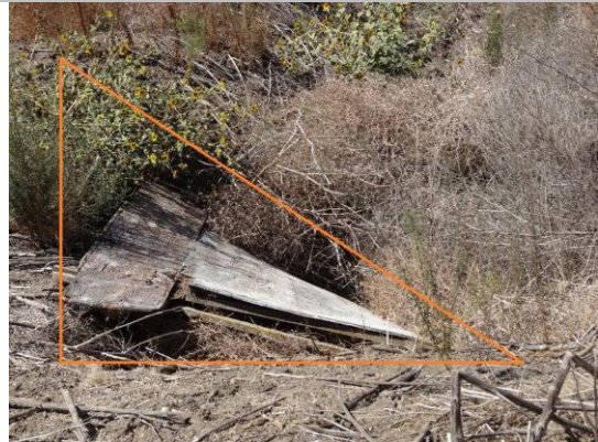
LS view: Debris dumped on inlet structure. Needs to be cleared or abandoned properly.