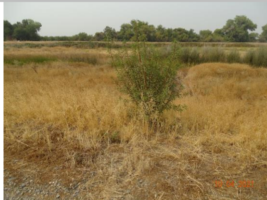
Sapling growing in the waterside shoulder. (Fall 2021)

* Location LS : Land Side N/A : Not Applicable WS : Water Side CR : Crown