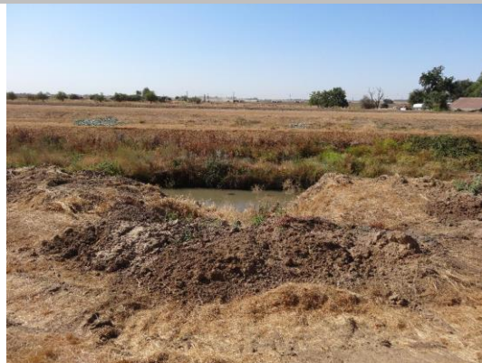
WS view: concrete headwall and CM pipe burried under debris and mud.