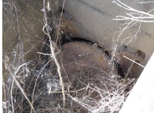
WS view: U typed concrete headwall, CM pipe, and flap gate. Damaged flap gate.