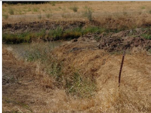
WS view: cobble spillway and channel on waterside.