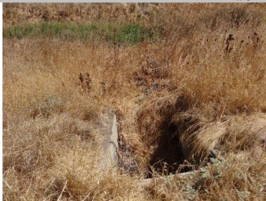
WS view: Silt needs to be removed. Vegetations needs to be cleared.