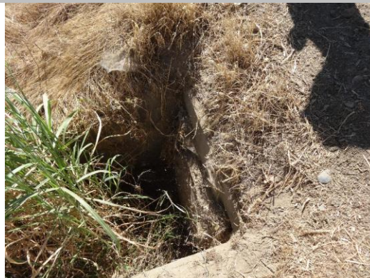
WS view: U typed concrete headwall, CM pipe, and flap gate. Vegetation needs to be cleared.