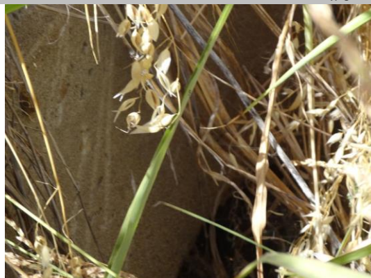
LS view: concrete headwall and CM pipe. Inlet needs cleaning.