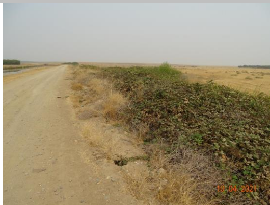
View of blackberry bushes growing on the the waterside slope. (Fall 2021)