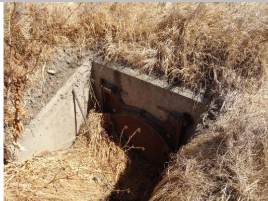
WS view: U typed concrete headwall, CM pipe, and flap gate. Dirt and vegetations need to be removed and cleared.