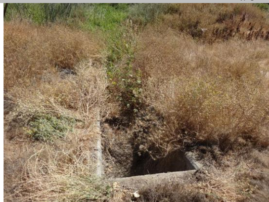
WS view: cobble spillway and channel on waterside. Dense vegetation on levee slope.