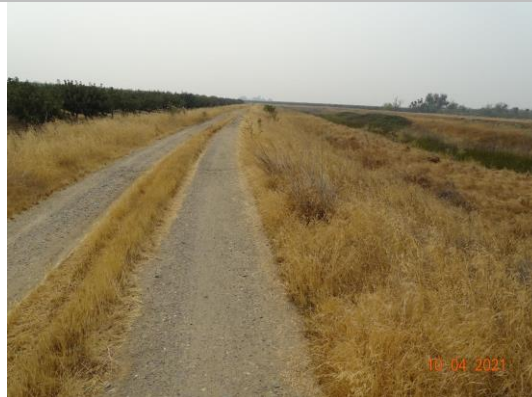
View of vegetation growing along the waterside slope. (Fall 2021)