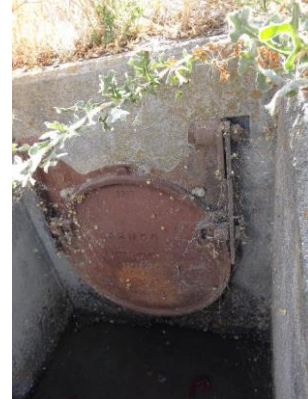
WS view: U typed concrete headwall, CM pipe, and flap gate.