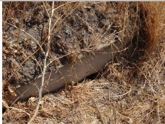
LS view: concrete headwall and CM pipe. Inlet needs cleaning and silt removed.