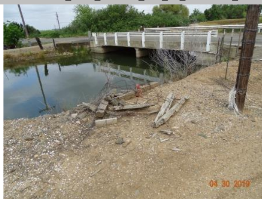
View of barbed wire gate discarded on levee. (Spring 2019)

* Location LS : Land Side N/A : Not Applicable WS : Water Side CR : Crown