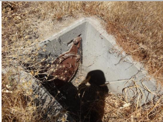
WS view: U typed concrete headwall, CM pipe, and flap gate. Vegetation needs to be cleared.