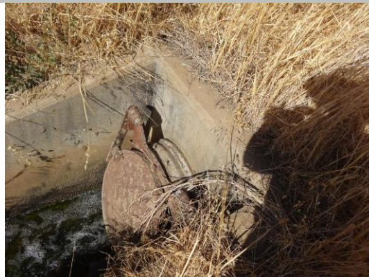
WS view: U typed concrete headwall, CM pipe, and flap gate. It was working during field inspection.