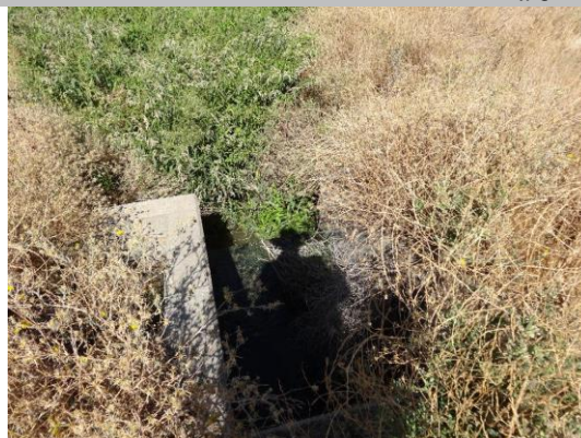
WS view: concrete spillway and channel on waterside. Dense vegetation on levee slope and spillway.