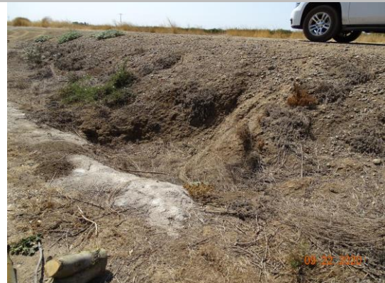
View of erosion pocket in the landside slope and toe. (Fall 2020)