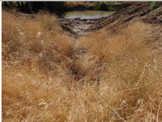
WS view: overview of outlet area and channel. Debris and vegetations on spillway.