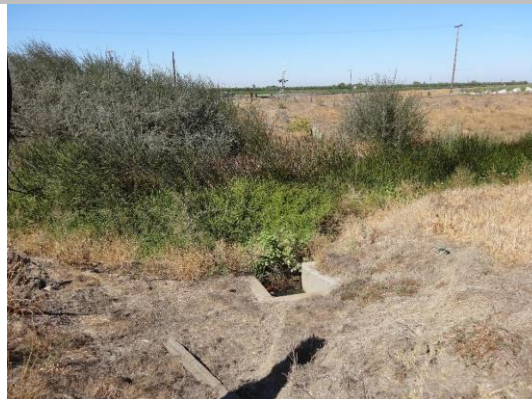
WS view: U typed concrete headwall and channel on waterside.