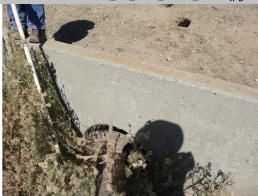
LS view: concrete headwall and CM pipe. Inlet needs clearing.