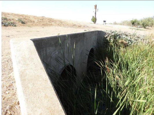
LS view: two CM pipes and U typed headwall on levee toe. Green vegetation in drainage channel.