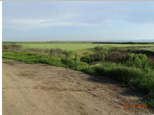
View of ramp on waterside slope looking Northeast. (Spring 2020)