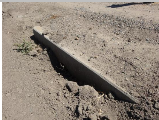
LS view: concrete headwall and CM pipe. Inlet needs clearing &amp;