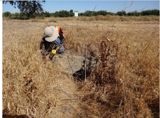
LS view: concrete headwall and CM pipe. Inlet silt needs clearing.