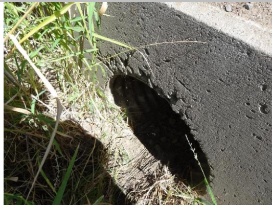
LS view: concrete headwall and CM pipe. Inlet needs clearing.