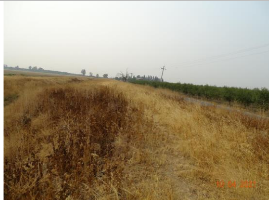
View of the levee crown looking downstream. (Fall 2021)

* Location LS : Land Side N/A : Not Applicable WS : Water Side CR : Crown