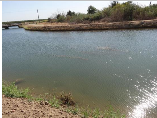
WS view: no signs of pipe and appurtenances on levee slope and channel bank.