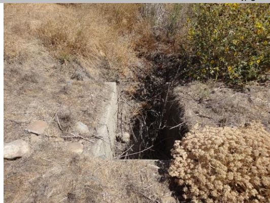
WS view: U typed concrete headwall, cobble spillway, and channel on waterside.