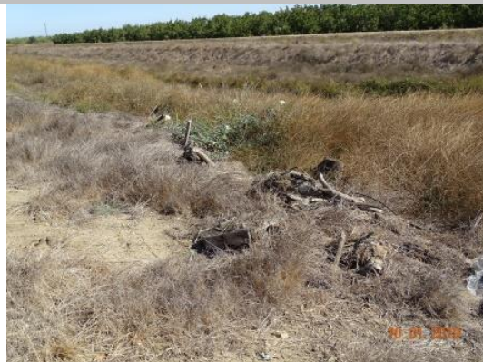
Debris and garbage on waterside slope. (Fall 2019)