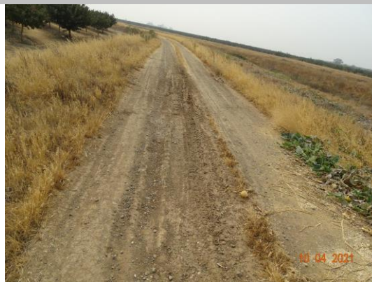
View of depressions in the levee crown from vehicle traffic. (Fall 2021)