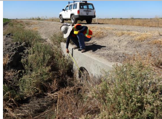
LS view: concrete headwall and CM pipe.