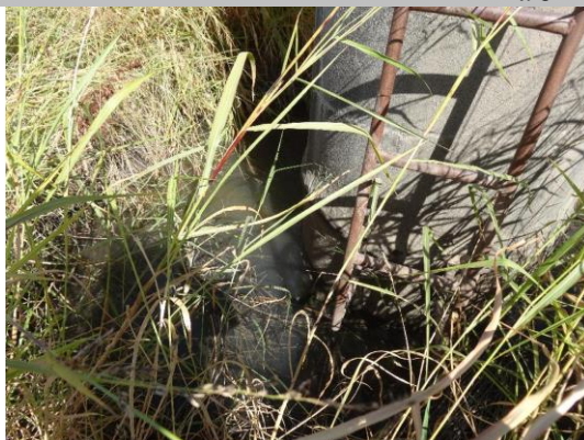
WS view: concrete standpipe with water ponding at its base.