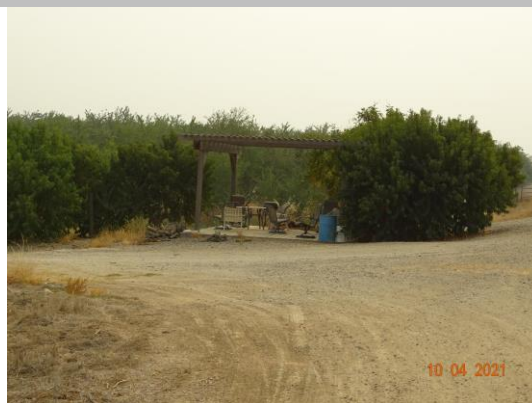
Unauthorized patio and fruit trees installed on the landside slope. (Fall 2021)