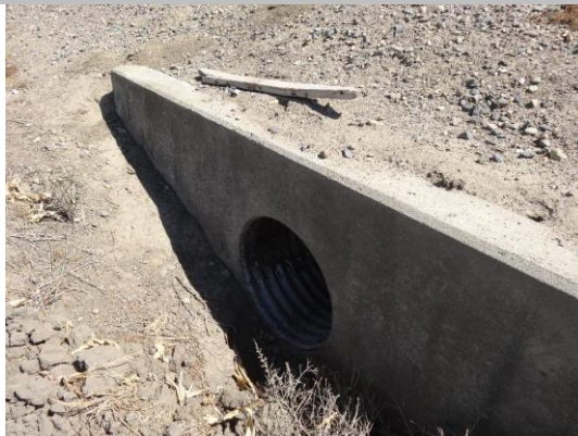
LS view: concrete headwall and CM pipe.