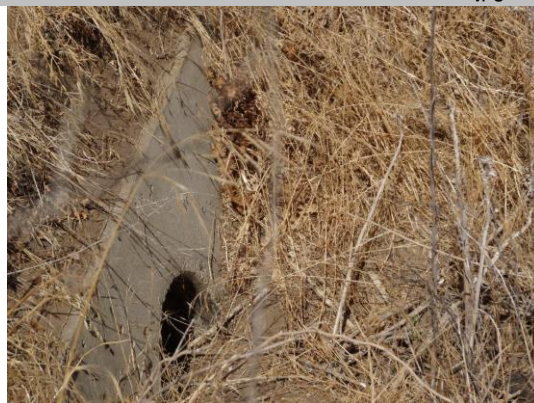
LS view: concrete headwall and CM pipe. Inlet silt needs clearing.

* Location LS : Land Side N/A : Not Applicable WS : Water Side CR : Crown