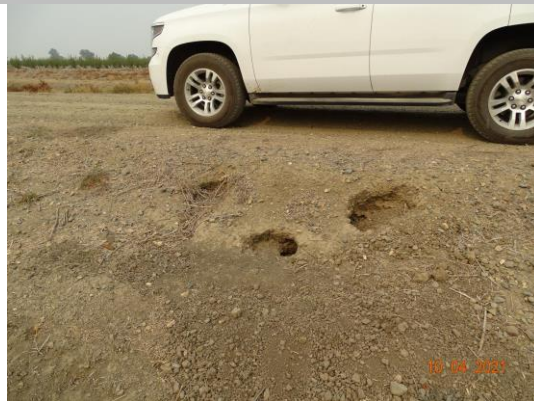
View of rodent burrows in the landside slope. (Fall 2021)

* Location LS : Land Side N/A : Not Applicable WS : Water Side CR : Crown