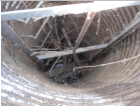
LS view: inside view of CM pipe riser with slide gate.