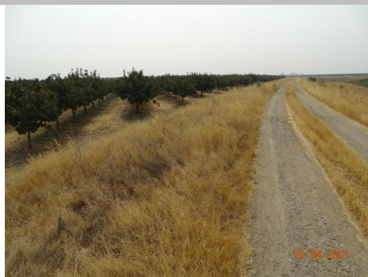
Looking downstream along the landside slope. (Fall 2021)

* Location LS : Land Side N/A : Not Applicable WS : Water Side CR : Crown