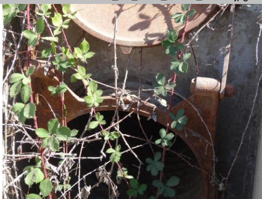
WS view: U typed concrete headwall, CM pipe, and flap gate. Flap gate was not closed. Vegetation needs to be cleared.