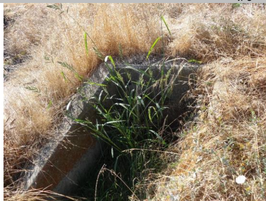
WS view: concrete spillway and channel on waterside. Dense vegetation on levee slope and spillway.