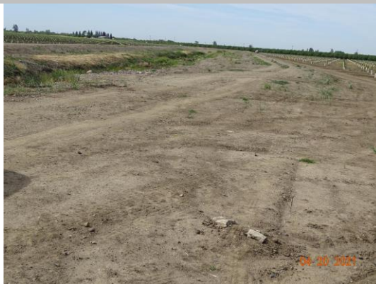
View of depression on landside slope and levee crown. (Spring 2021)