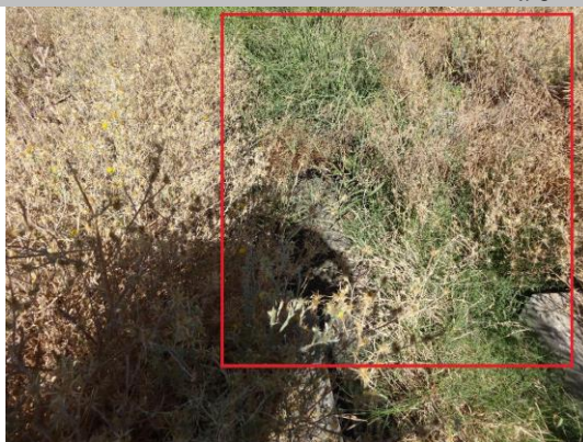
WS view: Dense vegetation on levee slope and spillway.