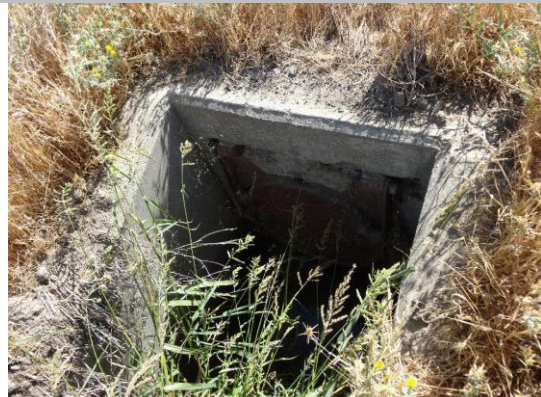
WS view: U typed concrete headwall, CM pipe, and flap gate. Vegetation needs to be cleared.