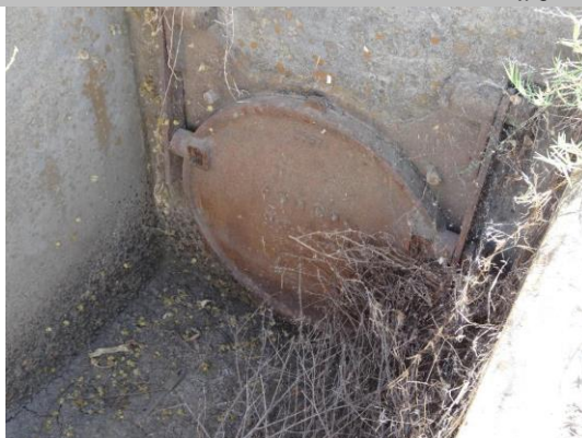
WS view: CM pipe and flap gate. Vegetation needs to be cleared.