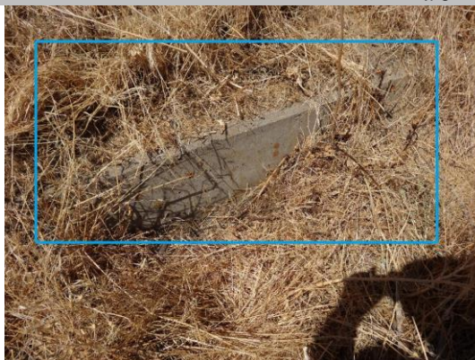
LS view: concrete headwall and buried CM pipe. Dirt removal and clearing needed in inlet.