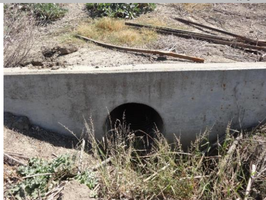
LS view: concrete headwall and CM pipe. Inlet needs clearing.