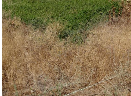
WS view: Dense vegetation on levee slope and spillway.