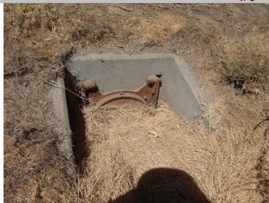
WS view: U typed concrete headwall, CM pipe, and flap gate. Vegetation needs to be cleared.