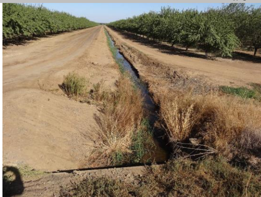
LS view: concrete headwall on levee toe and drainage ditch.