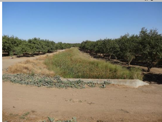
LS view: headwall on levee toe. Green vegetation in drainage channel.