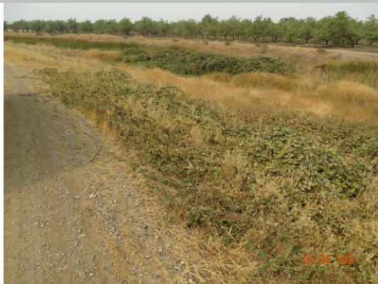
Blackberry bushes are beginning to grow up the waterside slope and shoulder. (Fall 2021)

* Location LS : Land Side N/A : Not Applicable WS : Water Side CR : Crown