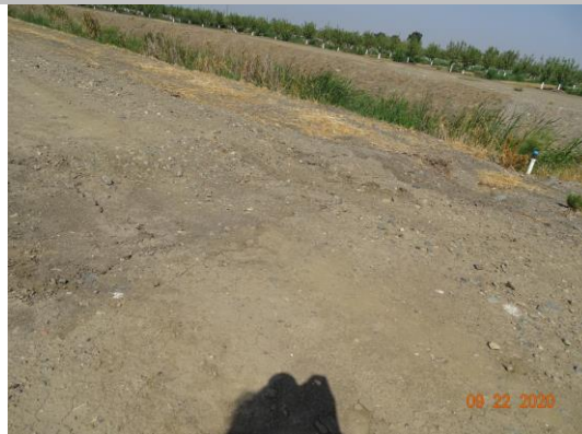
View of depression across the levee crown and waterside slope. (Fall 2020)