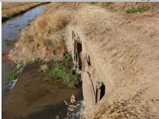
WS view: two CMPs with flap gate, concrete spillway and channel on waterside.