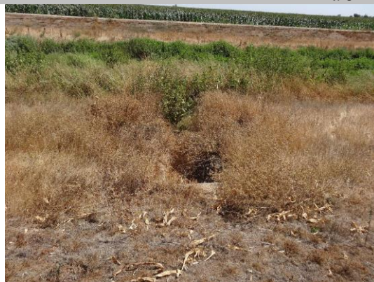
WS view: overview of spillway/outlet area on waterside.