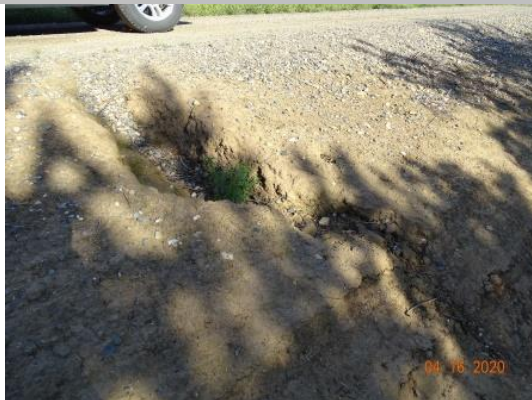
Looking at finger erosion on the landside slope. (Spring 2020)