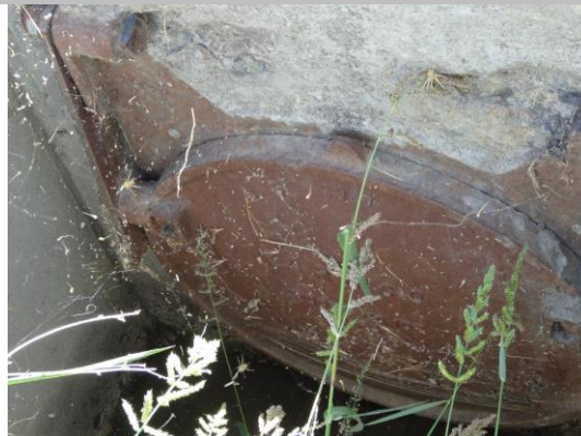
WS view: CM pipe and flap gate. Vegetation needs to be cleared.