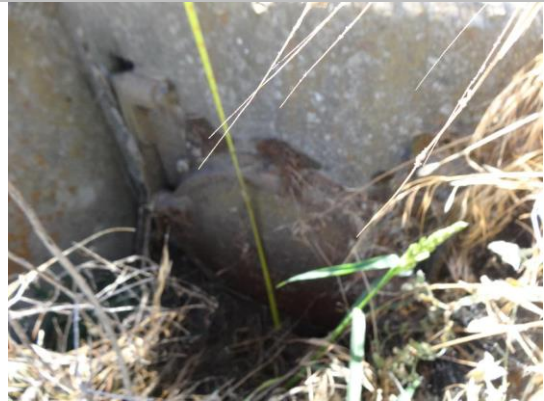
WS view: U typed concrete headwall, CM pipe, and flap gate. Vegetation and silt need to be cleared.