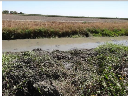
WS view: U typed concrete headwall, CM pipe, and flap gate buried under mud/debris.