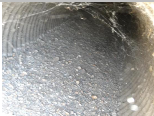
LS view: inside view of CM pipe. Inlet pipe needs clearing.