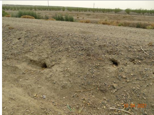
Rodent holes observed on the landside slope. (Fall 2021)