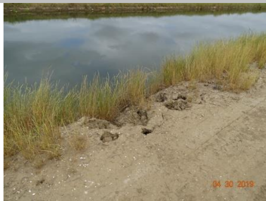
View of erosion on landside slope. (Spring 2019)