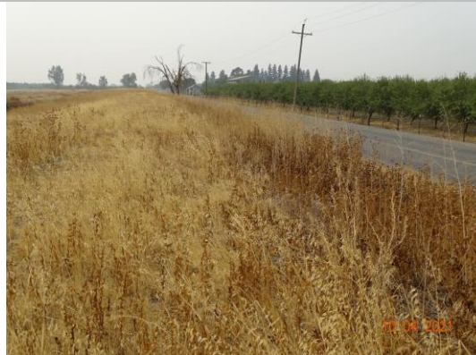
View of the landside slope looking downstream. (Fall 2021)