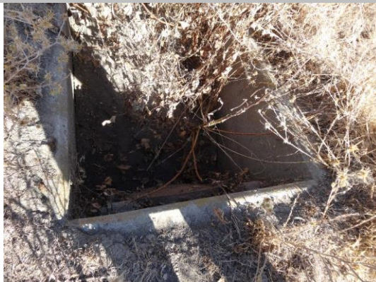
WS view: U typed concrete headwall, CM pipe, and flap gate. Vegetation needs to be cleared.