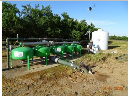
Tank and filtration system installed on the landside easement. ( Spring 2020)