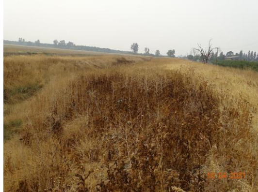
View of vegetation growing on the waterside slope. (Fall 2021)