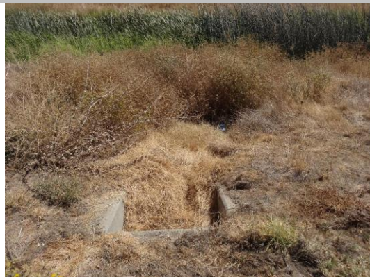
WS view: cobble spillway and channel on waterside.