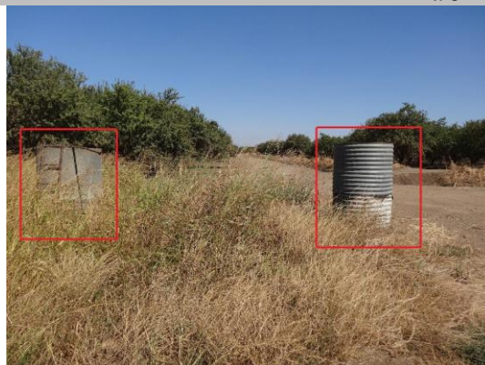
WS view: concrete standpipe (left) and CMP standpipe (right).