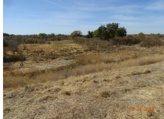
View looking downslope at vegetation on the landside slope (Fall 2019).