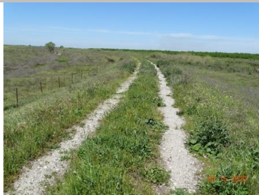
Looking downstream along the levee crown. (Spring 2020)