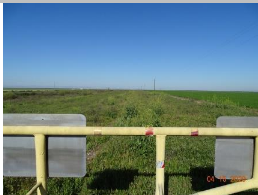
Looking downstream at the levee crown at LM 4.05. ( Spring 2020)