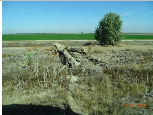
View of dead tree on the landside slope. (Fall 2018)