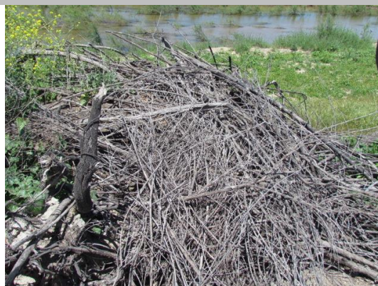
Fresno River waterside levee mile 7.96.