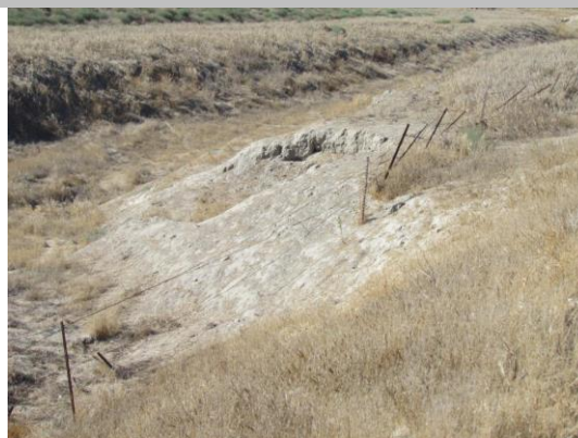
Looking downstream at the old erosion site landside slope.

Photo 1 of 1 : SP_2020_NA0011_147_20_20200225_00008.jpg