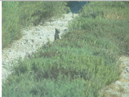
Berenda Slough Unit 3 looking upstream from levee miles 0.71 - to 1.51.