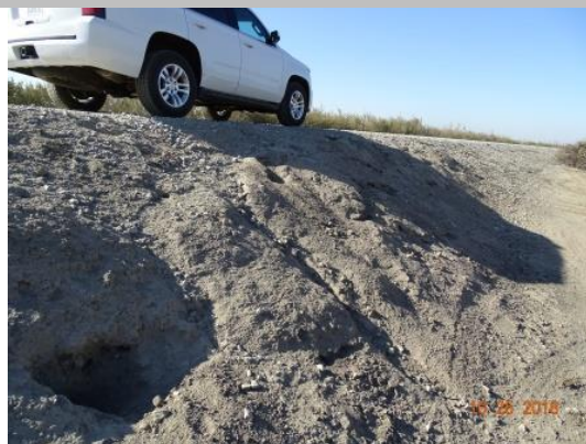
Rodent activity on landside slope. (Fall 2018)

* Location LS : Land Side N/A : Not Applicable WS : Water Side CR : Crown