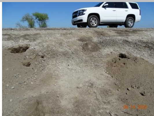
Representative view of rodent holes observed in this section. (Spring 2020)