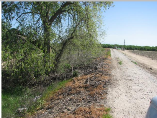
Looking downstream at untrimmed tree on waterward slope. (Spring 2018)