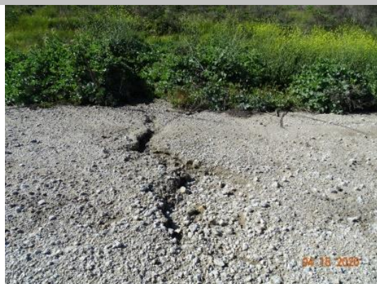
Finger erosion on the waterside slope. (Spring 2020)