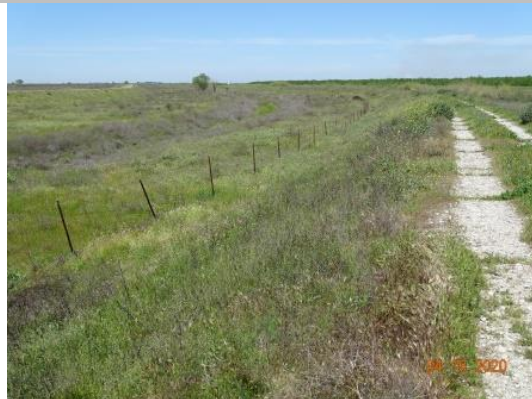
View of vegetation along the landside slope looking downstream. (Spring 2020)

LS : Land Side N/A : Not Applicable WS : Water Side CR : Crown