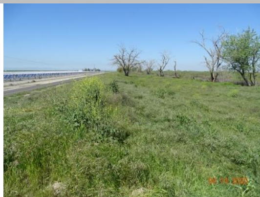
View of the waterside slope looking downstream. (Spring 2020)