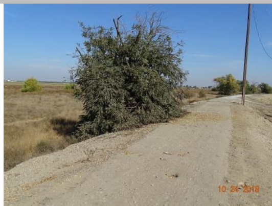
Trim tree on waterside shoulder. (Fall 2018)

Photo 1 of 1 : SP_2020_NA0011_145_27_20200225_00022.jpg