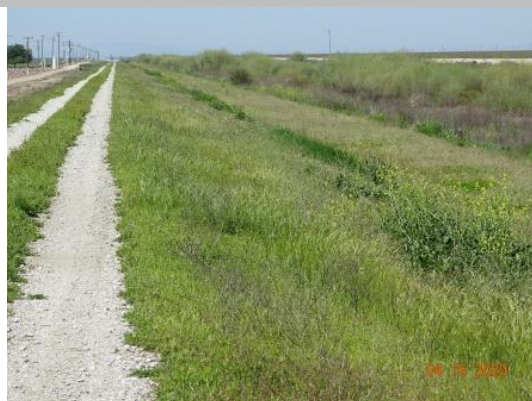
View of waterside slope looking downstream. (Spring 2020)

Photo 1 of 1 : SP_2020_NA0011_147_61_20200504_00063.jpg