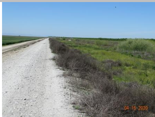
View of vegetation along the waterside slope. (Spring 2020)

Photo 1 of 1 : SP_2020_NA0011_147_70_20200504_00058.jpg