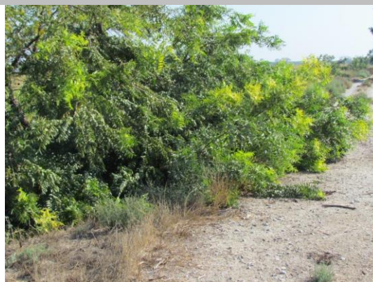
Walnut trees blocking the view of the landside levee section.