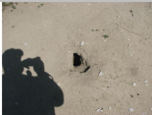
Looking at rodent hole on levee crown. (Spring 2018)