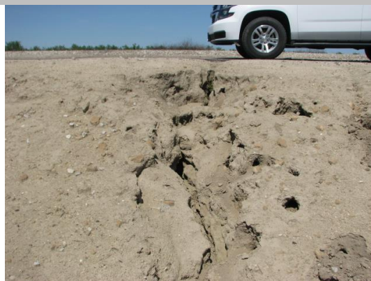
Looking at finger erosion on landward slope. (Spring 2018)