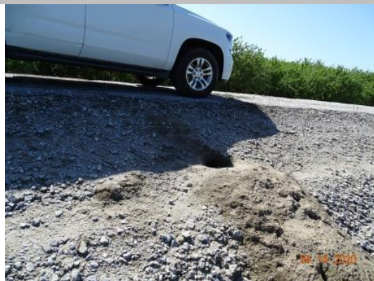
Several large rodent holes on waterside slope. (Spring 2020)