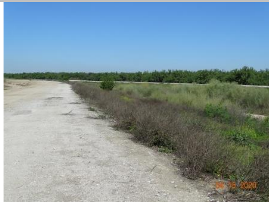
View of the waterside slope looking downstream. (Spring 2020)