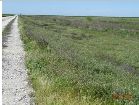
Looking downstream along the waterside slope. (Spring 2020)

LS : Land Side N/A : Not Applicable WS : Water Side CR : Crown