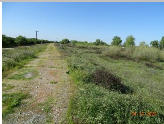
View of the vegetation on the waterside slope looking downstream. (Spring 2020)

Photo 1 of 1 : SP_2020_NA0011_143_37_20200417_00050.jpg