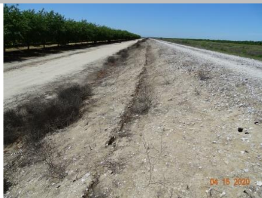
Vehicle tracks in the landside slope. (Spring 2020)