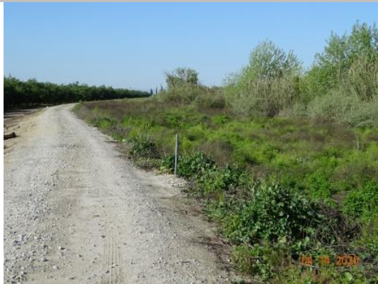
Vegetation growing on the waterside slope. (Spring 2020)