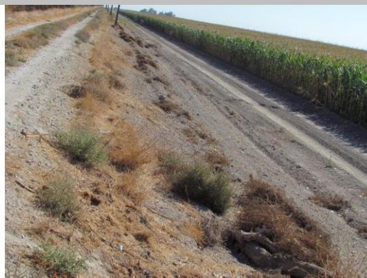
Berenda Slough Unit 4 Looking upstream from levee mile 0.14-0.97.

* Location LS : Land Side N/A : Not Applicable WS : Water Side CR : Crown