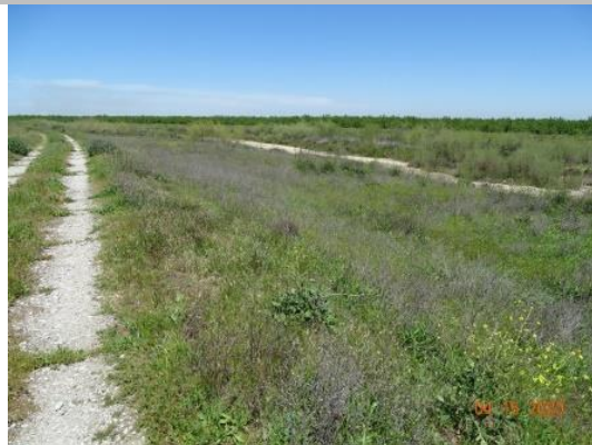
View of the waterside slope looking downstream. (Spring 2020)