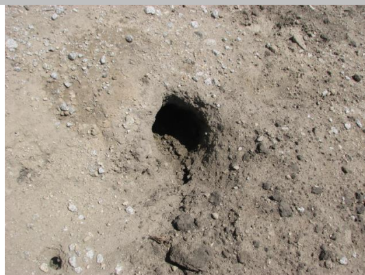
Looking at typical rodent hole on landward slope. (Spring 2018)