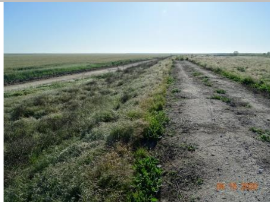
View of the landside slope at LM 0.00. (Spring 2020)