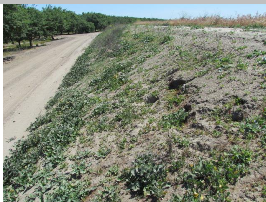
Fresno River landside levee slope levee mile 6.75-6.95.

Photo 1 of 1 : SP_2020_NA0011_146_28_20200225_00020.jpg