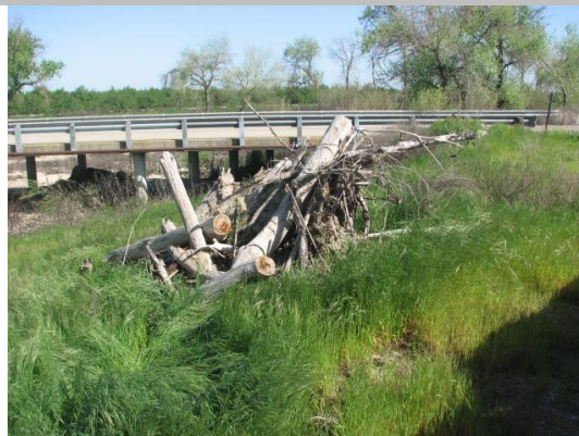
Looking downstream at bush pile on waterward slope. (Spring 2018)

Photo 1 of 1 : SP_2020_NA0011_143_34_20200225_00027.jpg