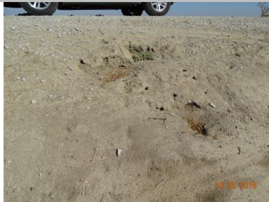
Minor erosion on landside slope. (Fall 2018)