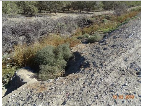
View of damage to landside slope. (Fall 2019)