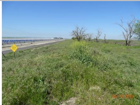
Looking upstream along the levee crown. (Spring 2020)