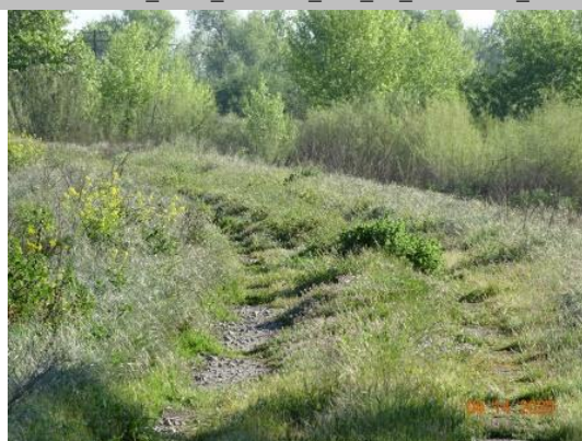
View of vegetation along the levee crown. (Spring 2020)

Photo 1 of 1 : SP_2020_NA0011_142_30_20200417_00042.jpg