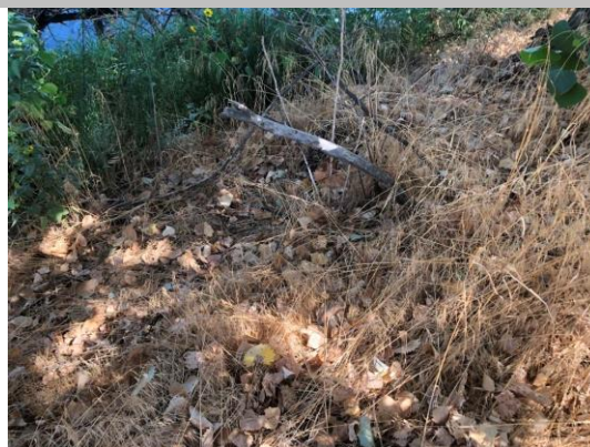
View of the erosion site from the levee crest.