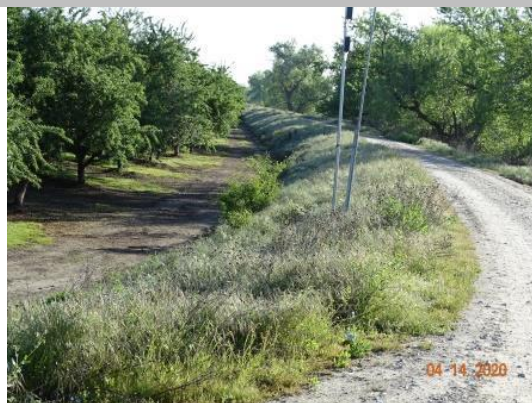
View of the landside slope looking upstream. (Spring 2020)

* Location LS : Land Side N/A : Not Applicable WS : Water Side CR : Crown