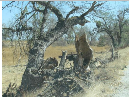
Berenda Slough looking upstream from the levee mile 0.14.