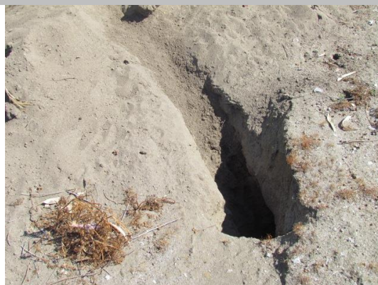
Active rodents spotted in the area waterside slope levee mile 0.00- 1.67.