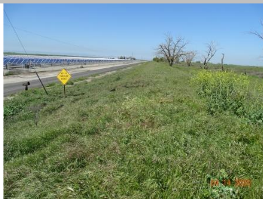
Looking upstream at LM 1.50 along the landside slope. (Spring 2020)