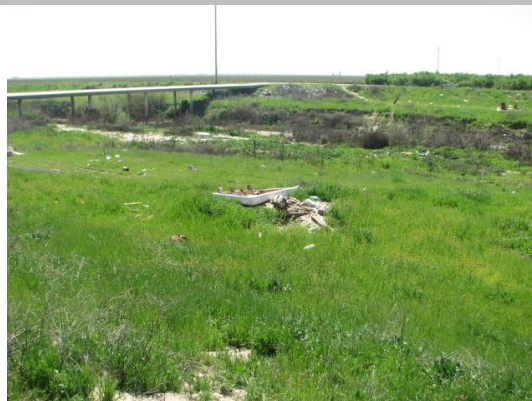
Looking west at garbage in channel. (Spring 2018)

LS : Land Side N/A : Not Applicable WS : Water Side CR : Crown