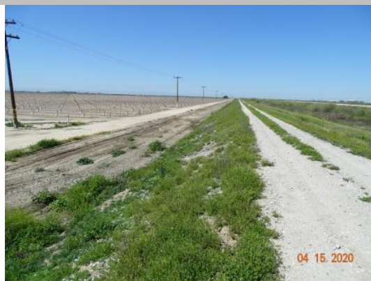
View of the landside slope looking downstream. (Spring 2020)

* Location LS : Land Side N/A : Not Applicable WS : Water Side CR : Crown