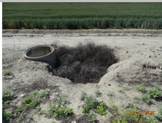
Looking west at large hole next concrete riser (no pipe) on landward slope. (Spring 2020)