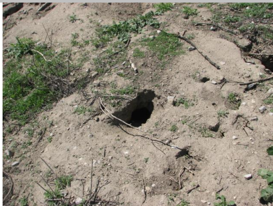
Looking at large rodent hole on landward slope. (Spring 2018)

Photo 1 of 1 : SP_2020_NA0011_145_19_20200225_00017.jpg