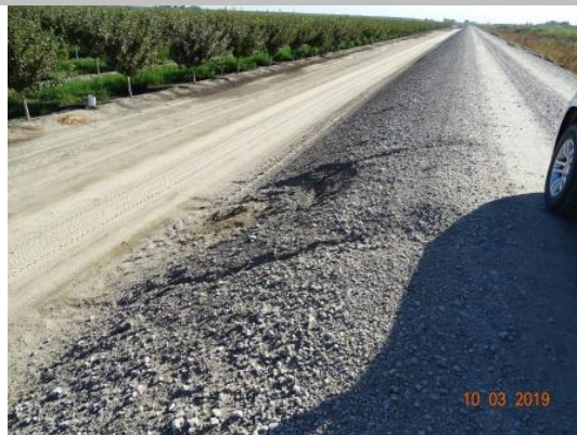
View of landside slope erosion looking upstream. (Fall 2019)

LS : Land Side N/A : Not Applicable WS : Water Side CR : Crown