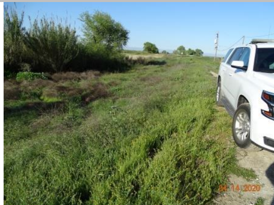
View of vegetation on the waterside slope looking downstream. (Spring 2020)