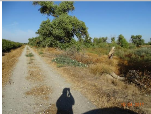
Remove downed tree from waterside slope.

LS : Land Side N/A : Not Applicable WS : Water Side CR : Crown