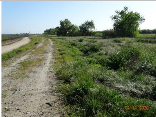
View of vegetation growing along the waterside slope looking upstream. (Spring 2020)