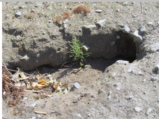
Other rodent holes noted in the slope waterside levee section.

* Location LS : Land Side N/A : Not Applicable WS : Water Side CR : Crown