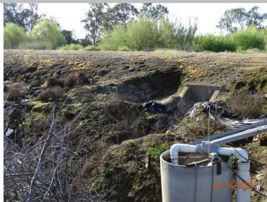
View of slope damage next to pipe headwall structure. (Spring 2020)