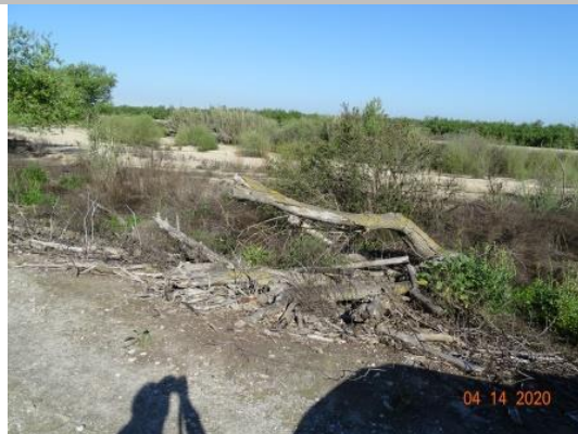
Branches left along the waterside slope from high flow. (Spring 2020)