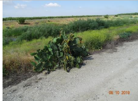
Cactus growing on waterside shoulder. (Spring 2019)