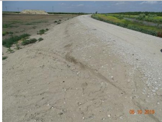
View of vehicle tracks on landside slope. (Spring 2019)

* Location LS : Land Side N/A : Not Applicable WS : Water Side CR : Crown