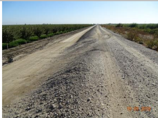
Damage to landside shoulder and slope looking upstream. (Fall 2019)