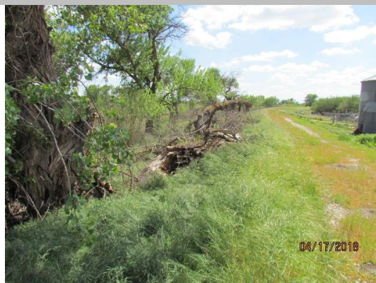
Looking west at tree limbs and branches on waterward slope. (Spring 2018)