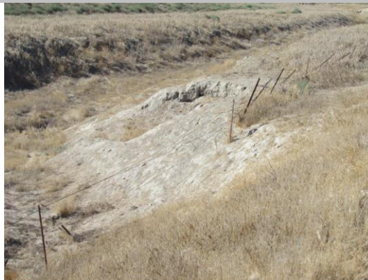
Looking downstream at the old erosion site landside slope.

* Location LS : Land Side N/A : Not Applicable WS : Water Side CR : Crown