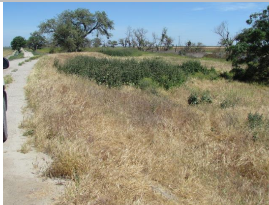
Looking upstream from the waterside shoulder wild growth covering slope and toe.