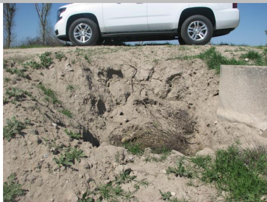
Looking east at large hole next to riser (no pipe) on landward slope. (Spring 2018)