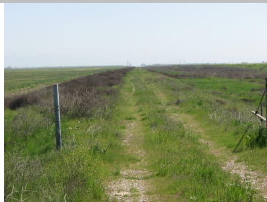
Looking downstream at levee crown from 0.00. (Spring 2018)