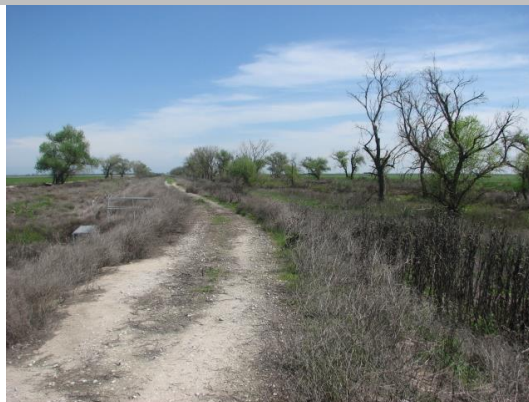
Looking downstream at wild growth on waterward slope. (Spring 2018)