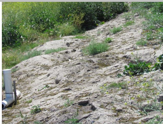
Berenda Slough looking downstream levee 0.62 landside slope covered with rodent holes to levee mile 2.09.