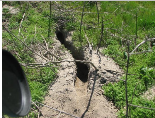
Looking at rodent hole with erosion on landward slope. (Spring 2018)