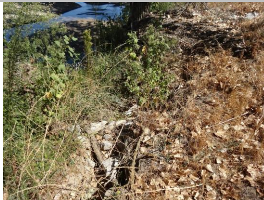
Vegetation debris at the site.