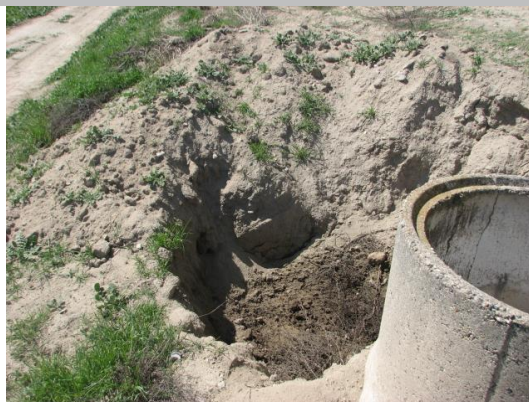
Looking upstream at large hole on landward slope. (Spring 2018)