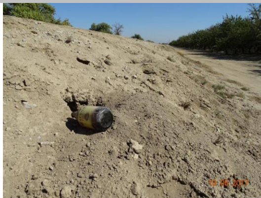
Rodent activity at LM 2.27.