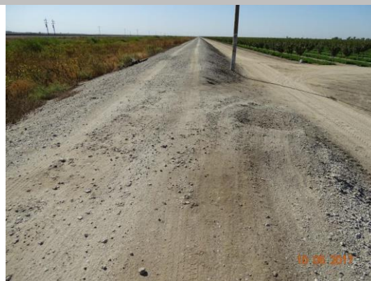
Repair damage from vehicle traffic on slope and shoulder.