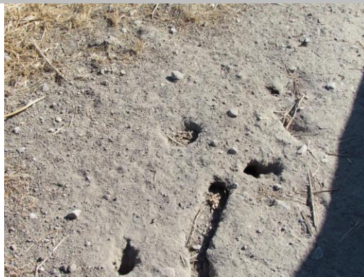
More active rodents holes and foot traffic seen around holes though no rodents observed.