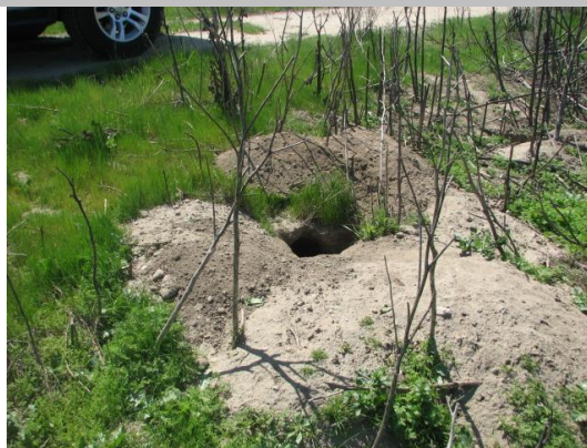
Looking at rodent hole with erosion on landward slope. (Spring 2018)