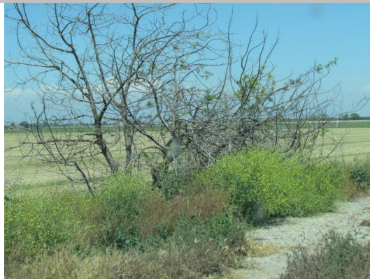
levee mile 1.04-1.05 landside slope and shoulder wild walnut tree growth was covered with leaves that blocked the view of the levee section.