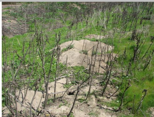
Looking at typical rodent holes within this section (Spring 2018)