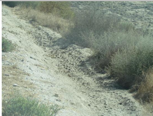
Berenda Slough looking back upstream waterside at the shoulder and slope levee miles 1.24-1.25.