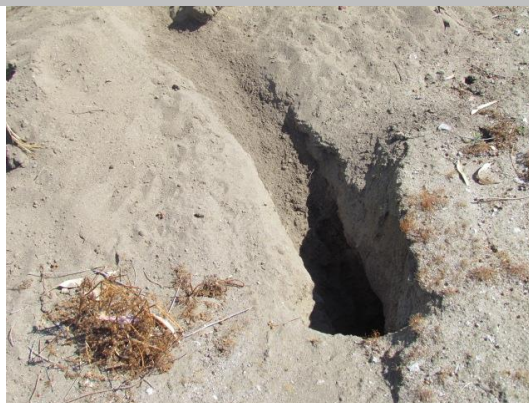
Active rodents spotted in the area waterside slope levee mile 0.00- 1.67.