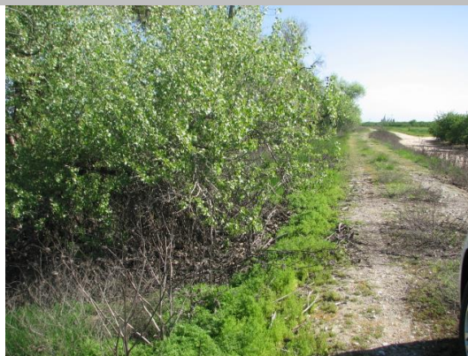
Looking downstream at untrimmed tree on waterward shoulder and slope. (Spring 2018)