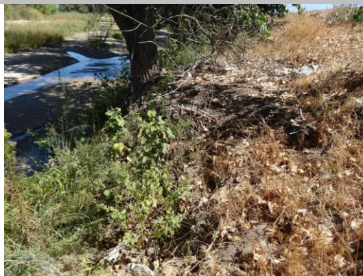
Close view of the site.