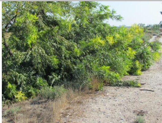
Berenda Slough Unit 3 looking upstream from levee mile 1.04-1.05 walnut trees blocking the view of the landside levee section.