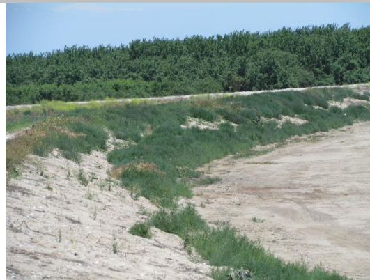
Fresno River landside levee mile 7.71-8.59.