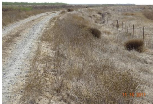
Landside vegetation should be managed to allow inspection and access.