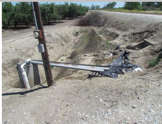
There is damage to the landside levee slope next to the concrete inlet structure.