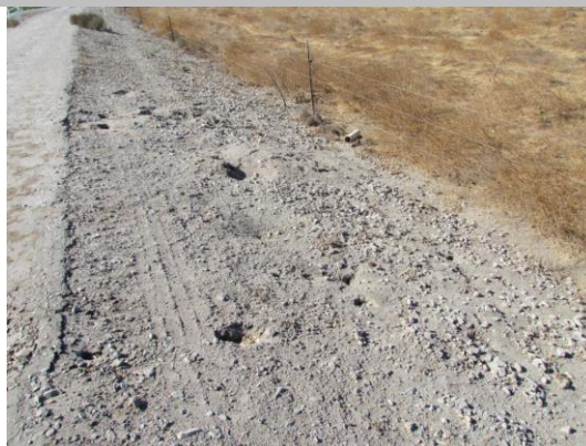
Berenda Slough levee mile 1.63-2.23 looking upstream at waterside slope.