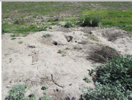
Looking upstream at rodent activity on landward slope and toe.