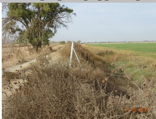
Manage landside vegetation to allow inspection and access to levee slope and toe.