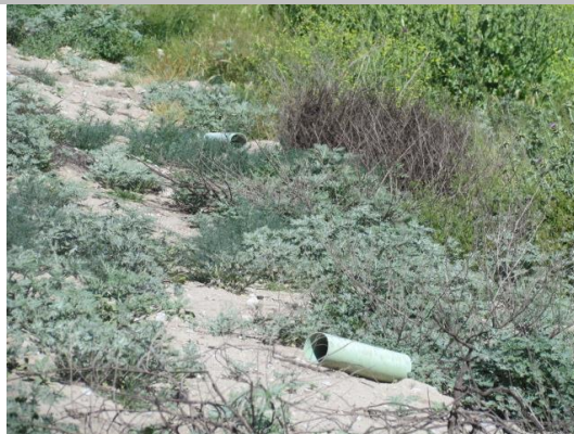
Berenda Slough looking upstream levee mile 0.62 landward.