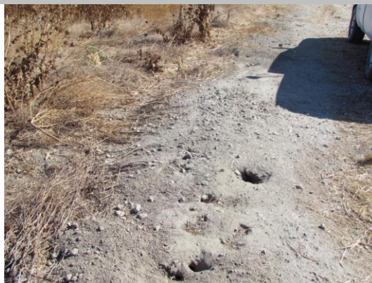
Berenda Slough Unit 3 levee miles 0.40-1.51 landside shoulder and slope.