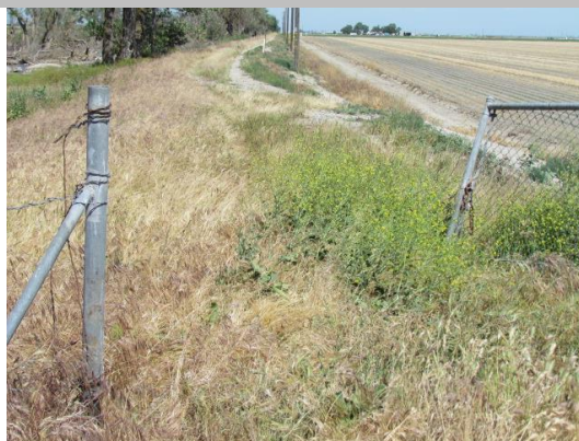
Looking upstream from levee mile 0.01 at the wild vegetation growing on the grown roadway.