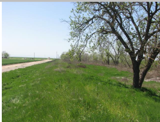
Looking upstream at tree on waterward slope. (Spring 2018)