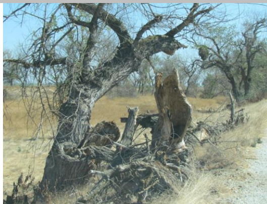
Berenda Slough looking upstream from the levee mile 0.14.