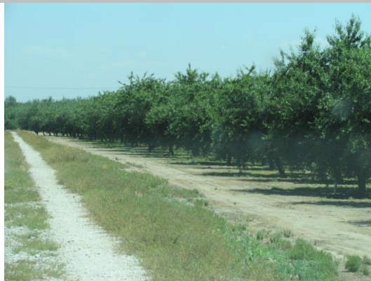
Looking upstream from levee mile 1.66-2.00 tall weeds present on the landside slope.