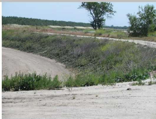
Fresno River Unit 5 levee mile 6.58 looking upstream to 7.04 unsatisfactory weed growth covering levee slope.

* Location LS : Land Side N/A : Not Applicable WS : Water Side CR : Crown