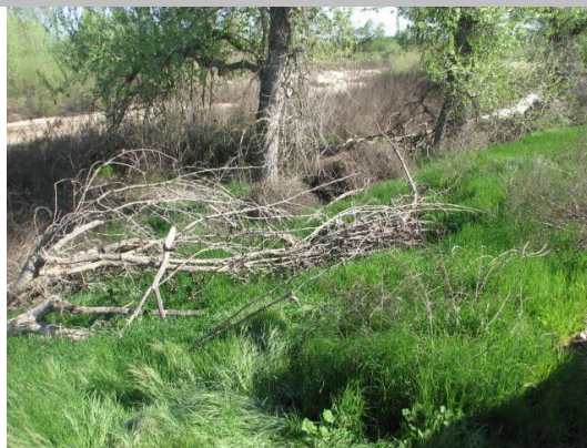
Looking downstream at tree limbs on waterward slope and toe. (Spring 2018)