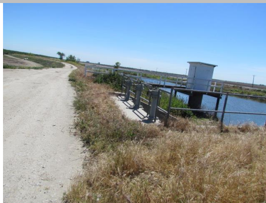
Fresno River waterside looking upstream from levee mile 6.57, wild weed growth present on slope and shoulder.