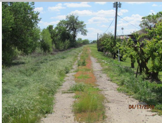
Looking west at veg on levee crown within the section. (Spring 2018)