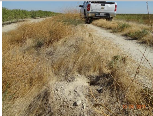
Rodent activity on landside slope.