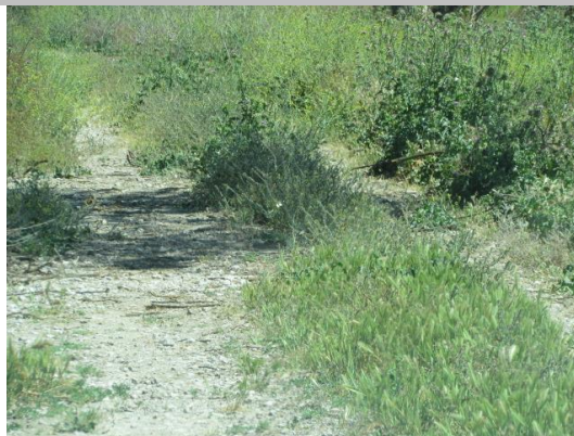
Looking upstream at the crown roadway that's covered with wild vegetation.