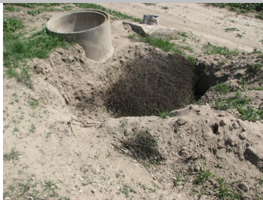
Looking west at large hole next concrete riser (no pipe) on landward slope. (Spring 2018)