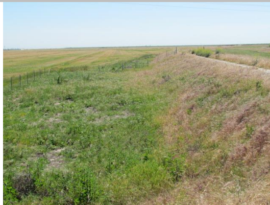
Looking upstream from levee mile 0.00 landside slope unwanted tall weeds block view of levee slope.