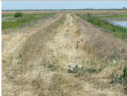
Fresno River looking upstream from levee mile 0.01 to 0.95.