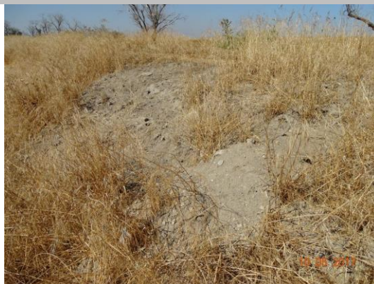
Rodent activity at LM 1.44.