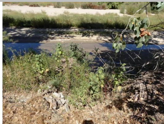
View of the erosion site from the levee crest.