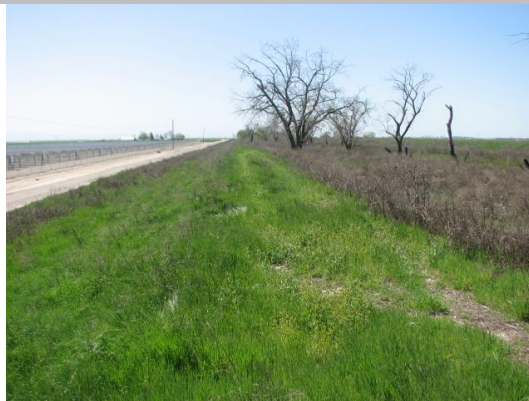
Looking upstream from 0.00 at wild growth on levee crown. (Spring 2018)