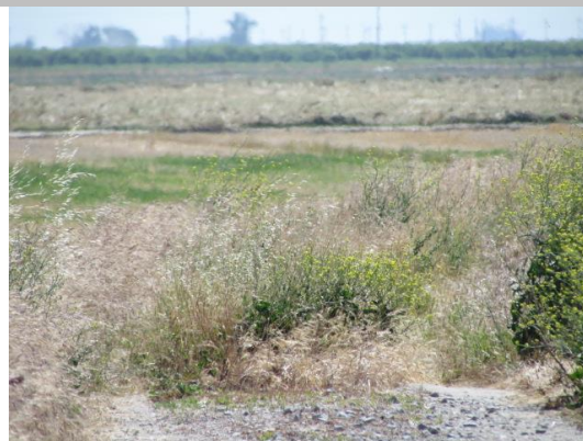
Fresno River looking upstream levee mile 0.00.

LS : Land Side N/A : Not Applicable WS : Water Side CR : Crown