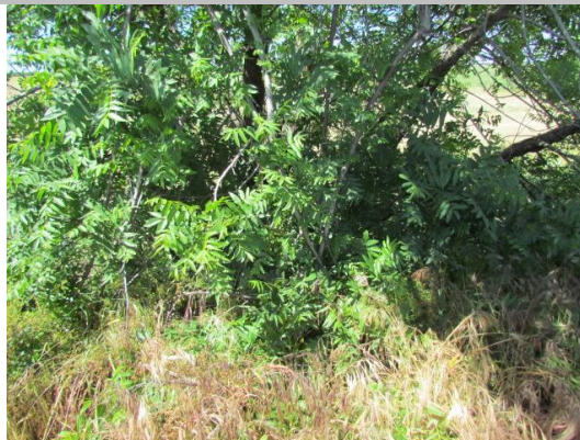
Looking upstream from landside slope tree has blocked view of the slope and shoulder.