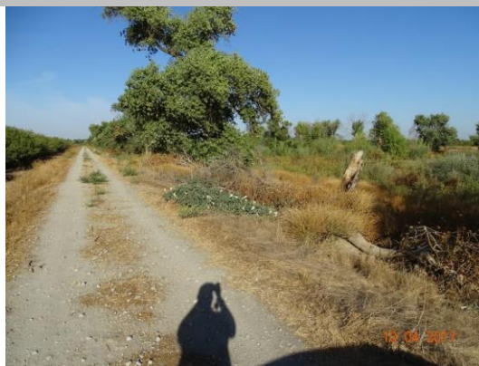
Remove downed tree from waterside slope.