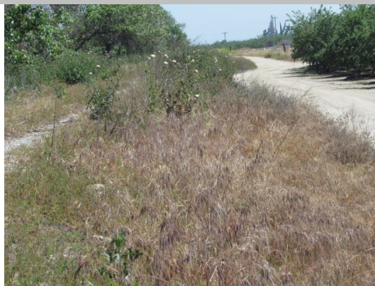
Unwanted vegetation on the waterside levee slope.