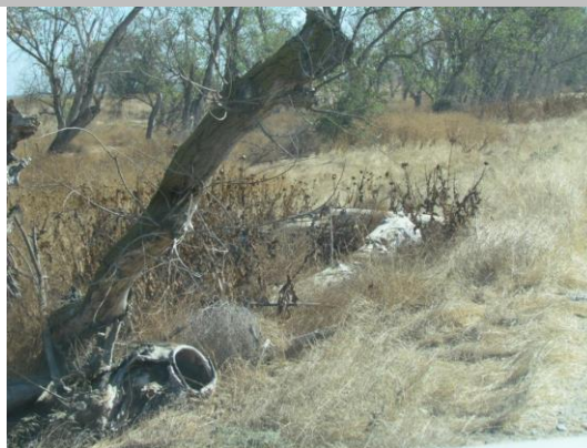
Berenda Slough Unit 4 levee mile 0.47 looking back upstream.