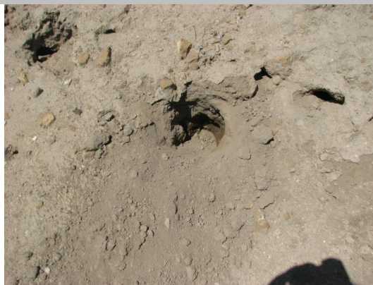
Looking at typical rodent holes on landward slope. (Spring 2018)