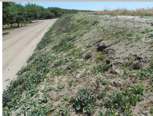
Fresno River landside levee slope levee mile 6.75-6.95.