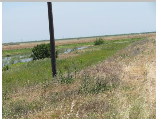
Fresno River levee mile 0.01 looking upstream wild weed growth present on the slope and shoulder.