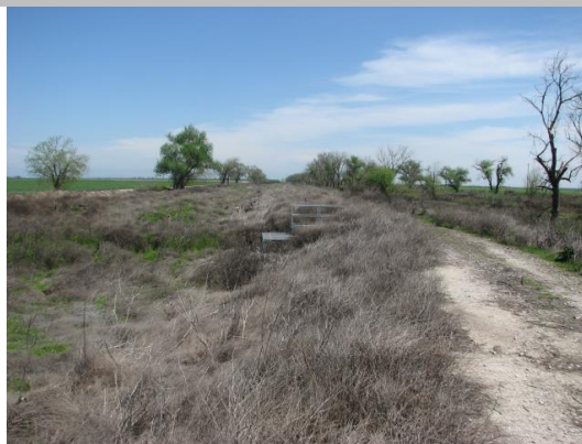
Looking downstream at landward slope. (Spring 2018)