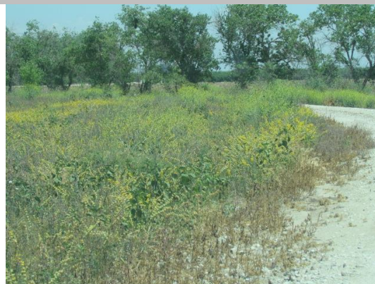
Unwanted tall weed growth on the landside shoulder and slope.