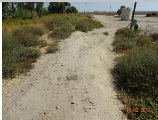
A proper ramp should be permitted and created to replace vehicle erosion site on landside levee slope. Slope should be repaired.