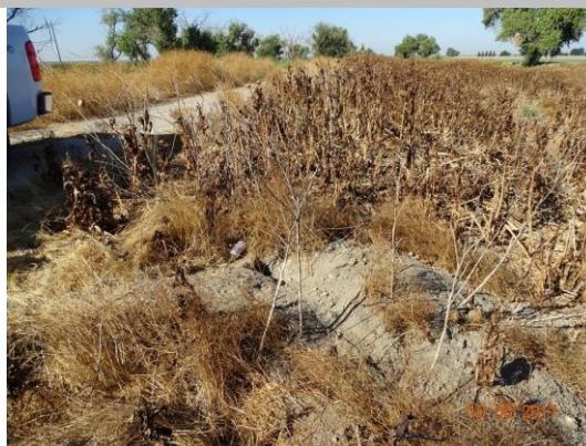
Continued rodent activity.