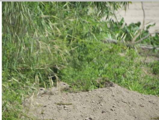
Active colony of rodents in process of borrowing in the levee section.