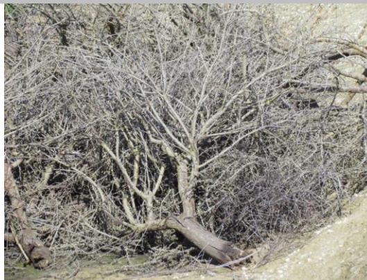
Looking upstream from the landward toe Tree trimmings covering the slope and toe