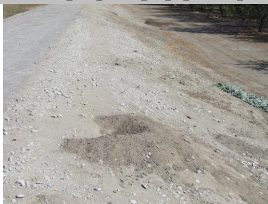
Berenda Slough looking downstream from the landside slope at large rodent holes on the slope shoulder and crown roadway.