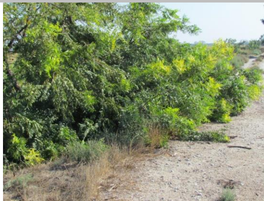
Berenda Slough Unit 3 looking upstream from levee mile 1.04-1.05 walnut trees blocking the view of the landside levee section.