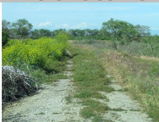
Looking upstream from the levee mile 0.59 to 2.35 tall weeds growing on the crown roadway.