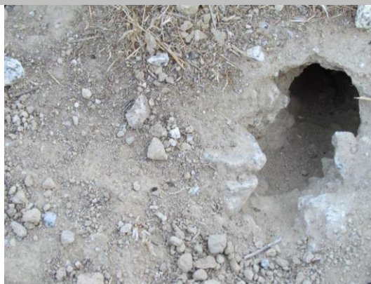
Crown road way levee mile 2.80 to 3.23 covered with active rodent holes.