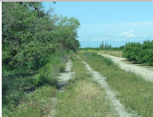
Looking downstream crown roadway from levee mile 0.33-0.96.