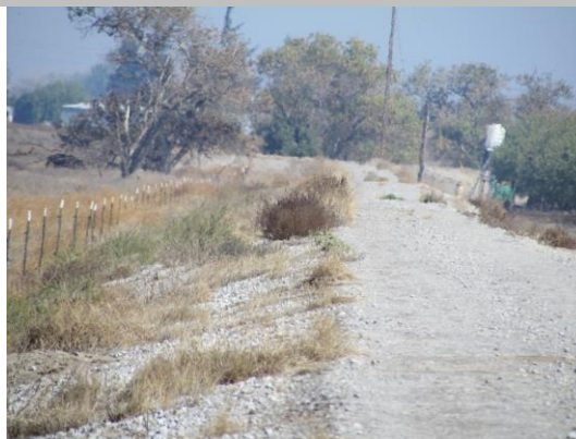
Berenda Slough looking upstream water side levee slope covered with rodent holes.