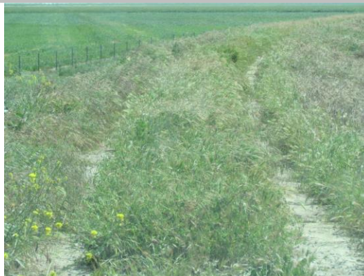
Looking upstream of crown roadway from levee mile 7.11- 7.52.