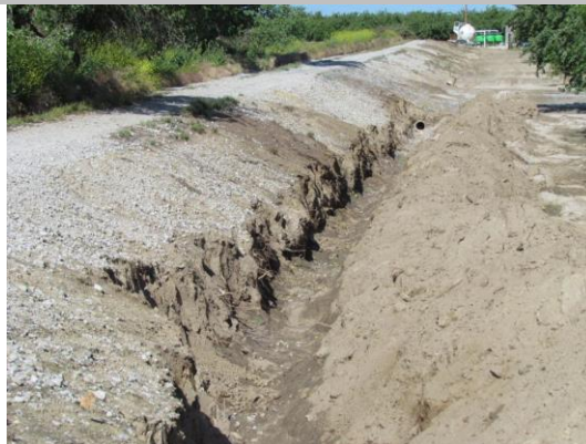
Looking upstream from the landside slope pipe work being performed.