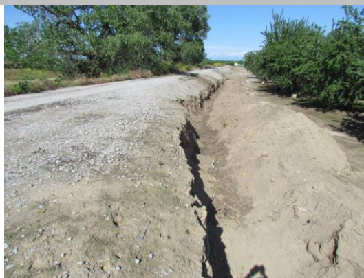
Standing at levee mile 1.49 looking towards levee mile 1.52