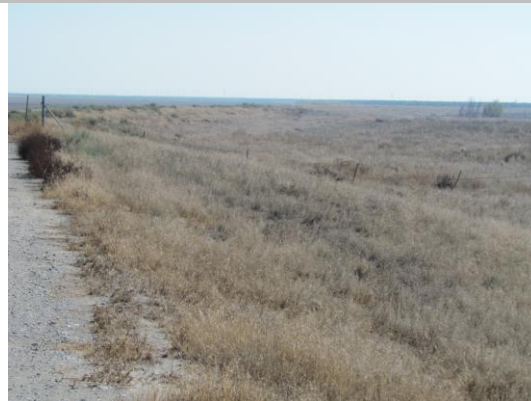
Fresno River levee mile 0.00 looking upstream to levee mile 4.06 waterside slope and toe is covered with wild growth.