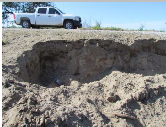
Standing at the downstream end of cut landward levee toe mile 1.49.