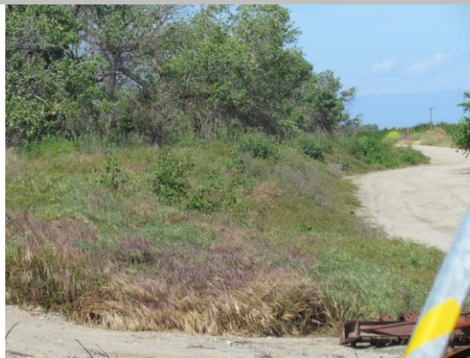
Looking upstream from levee mile 0.31 to 1.62 landside slope.