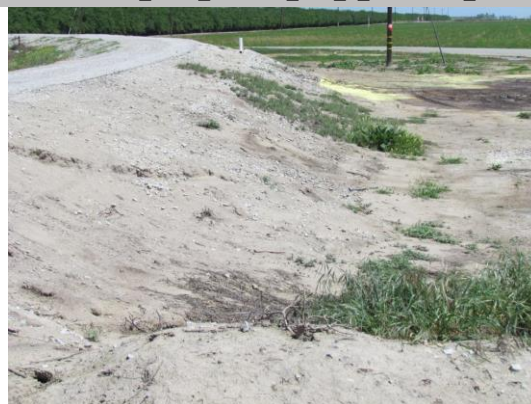
Levee mile 1.51 landside slope damaged by the landowner.