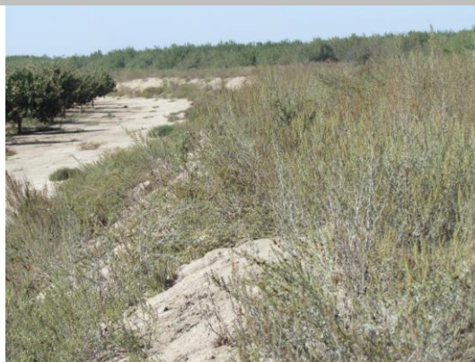
Fresno River Looking at the landside levee slope unsatisfactory tall weeds has covered the slope, shoulder and crown.