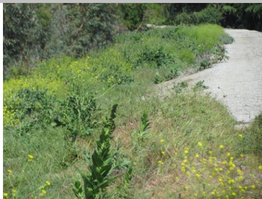
levee mile 0.00 to 2.03 unsatisfactory tall weeds present on the levee slope and toe.