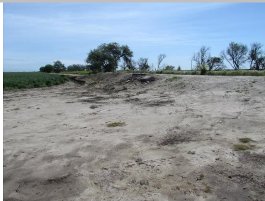
Looking upstream Unit 3 landside levee mile 0.00 - 0.06.