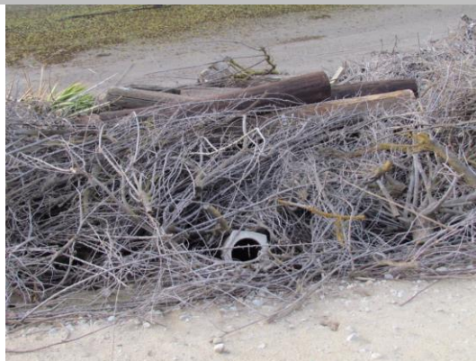
Unwanted brush pile on the landside toe and slope.