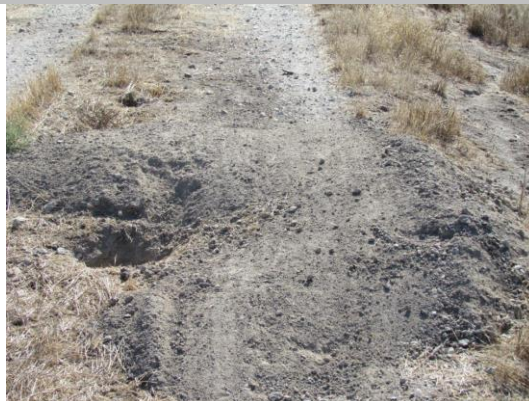
Huge rodent holes in the crown road way levee mile 0.39 to 0.43.