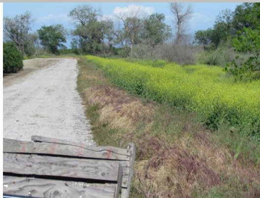
Unit 1 Ash Slough looking upstream waterside slope. Tall Mustard grass and other unwanted tall weeds covering the slope and shoulder.