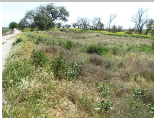
Looking upstream levee mile 0.00-1.51 tall weeds on the shoulder and slope water ward.