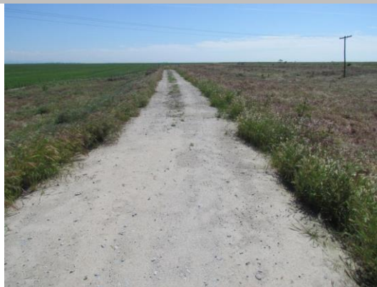
Levee mile 0.00 crown roadway.