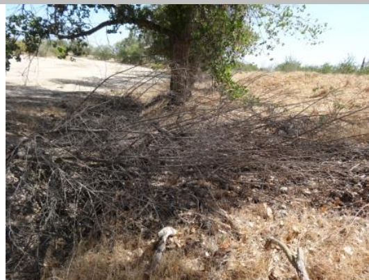
Close view of the site with the dead tree.