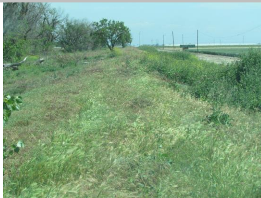
Berenda Slough waterside wild weeds has blocked view of the slope from 0.01 to 1.60. This photo shows entire levee covered with wild weeds.