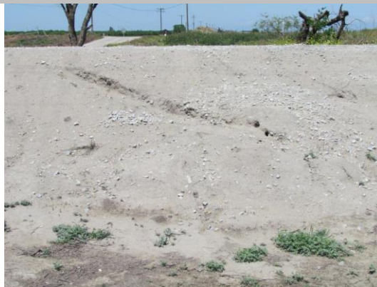
Another view of the slope damage.