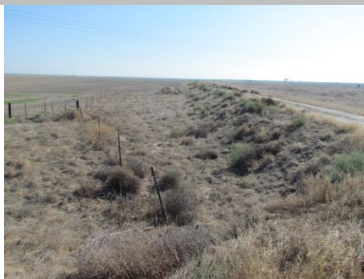
Fresno River levee mile 0.00 looking upstream landside levee slope and toe covered with tall weeds.