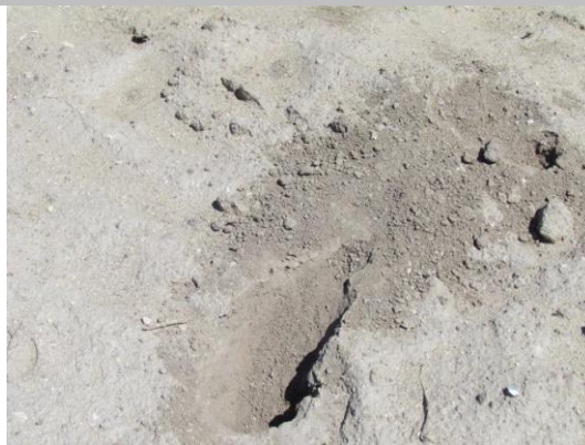
There are fresh rodent holes but so view of rodent.