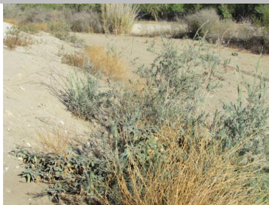
The levee slope has been damaged by equipment, the farmer has cut the toe away while working too close to the levee.