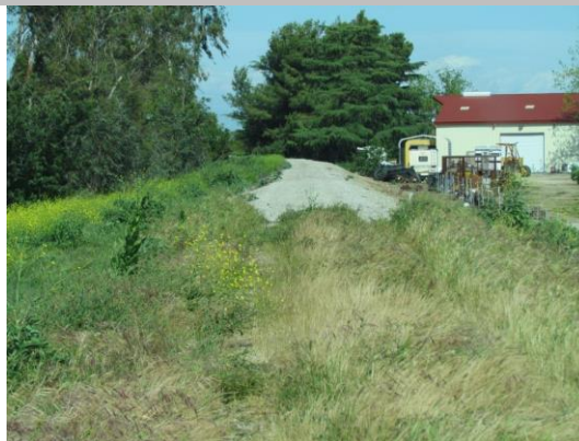
Unsatisfactory tall weeds on the landside slope and crown.