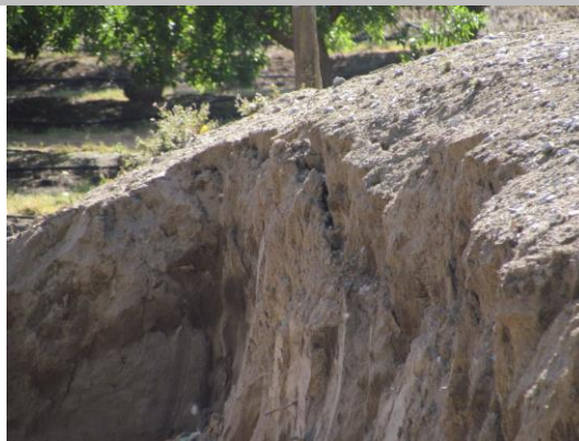
Looking downstream from the landside slope.