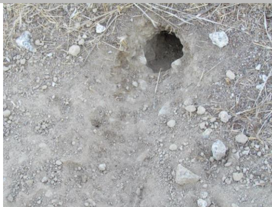
Rodent holes in the crown roadway(fresh).