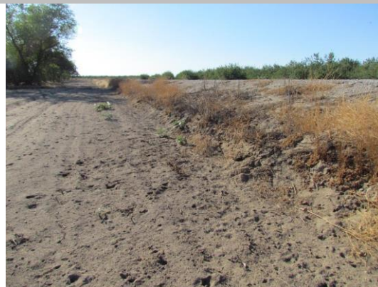
Slope damage at toe of the water side levee section.