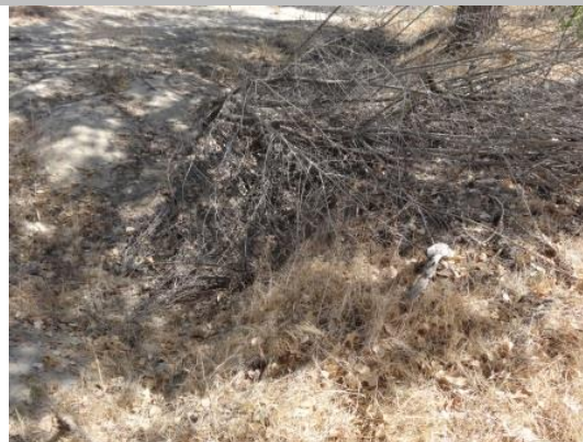
Debris at the site.