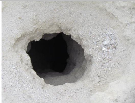
Huge Rodent hole in crown roadway and many other holes at this location on the slope and toe.