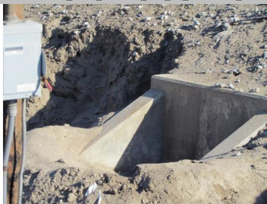
There is damage to the landside slope near the concrete wing wall.