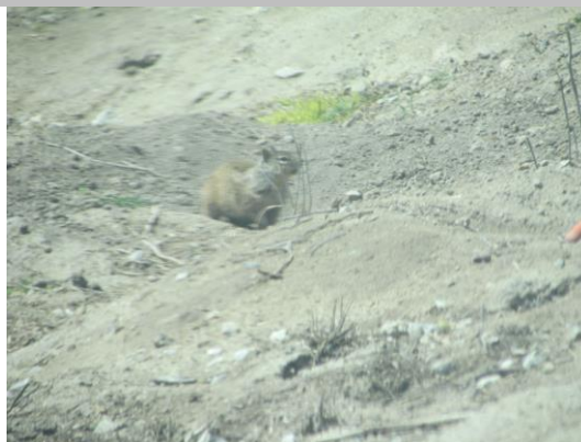
One of many active rodent captured in this photo.