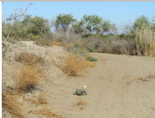
Another view of the damaged toe.