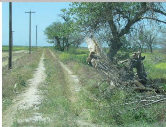
Levee mile 0.47 dead tree partially blocking the levee section along the waterside.