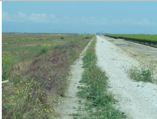
Looking upstream from levee mile 2.49-3.68 weeds present on the crown roadway.