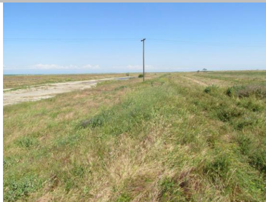
Looking upstream from levee mile 0.00 -3.63 unwanted tall weeds covering the water side levee section.