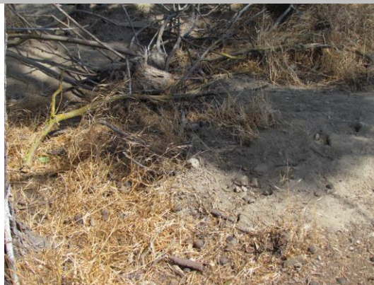
Rodents are active at this location.