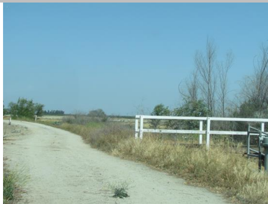
Looking upstream at the waterside with tall weeds on the levee slope.