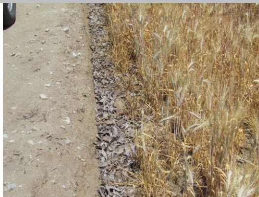
The hinge point has been disced from levee mile 1.42 -2.07.