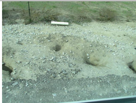
Berenda Slough looking downstream along the waterside slope at large rodent holes on slope. No new photo.