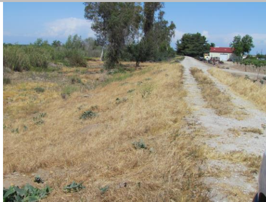
Ash Slough looking upstream from the waterside at unsatisfactory tall weeds on the levee slope.