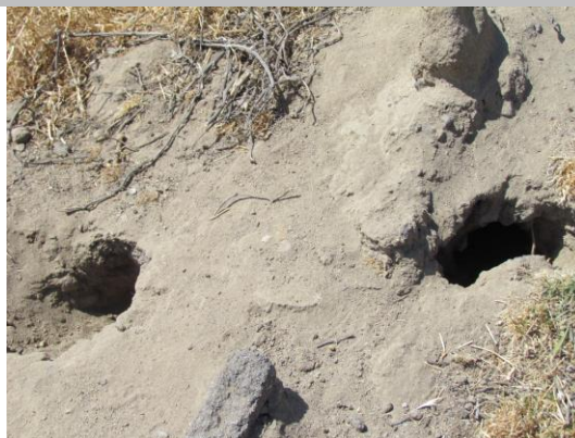
There are many rodent holes present on the shoulder and slope of the landside section.