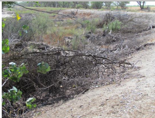
Levee mile 0.03 landside dead trees still remain on the levee slope from last inspection.