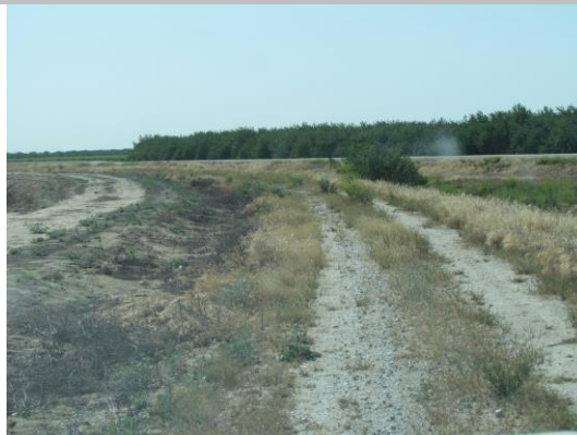
Fresno River Unit 6 from levee mile 7.90-8.39 weeds are growing on crown roadway.