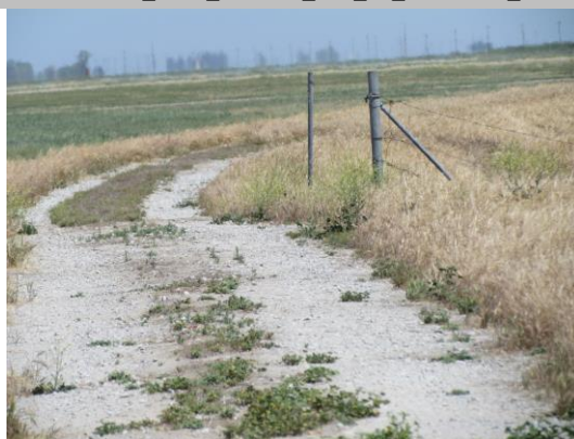
Looking downstream at the crown roadway. It should be free of vegetation.