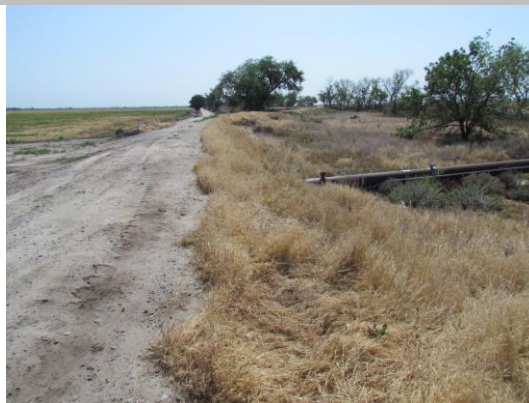
Berenda Slough looking upstream from the waterside at unwanted tall weeds on the shoulder and slope.