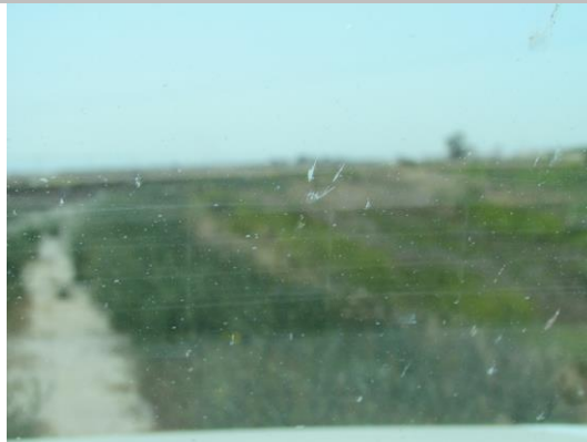
View of unacceptable tall weeds on the waterside slope.