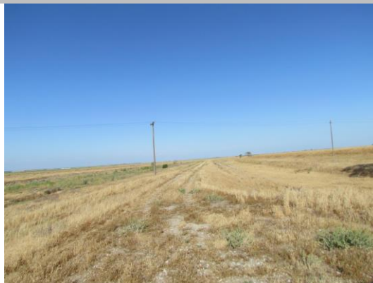
View of weeds on both slopes and crown roadway.