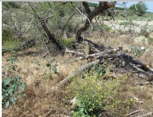
This dead tree has not been removed since last inspection.