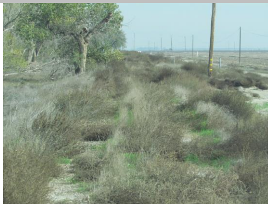
Unwanted tall weeds completely covering the levee crown roadway. No new photo.