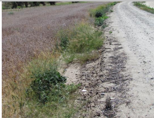
View looking downstream at the waterside toe damage.