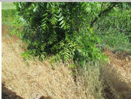
Young nut tree on the landside levee slope.