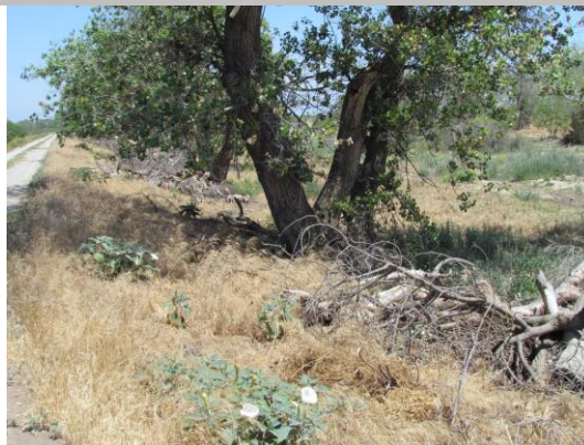
Dead trees on the waterside slope that should have been removed already.