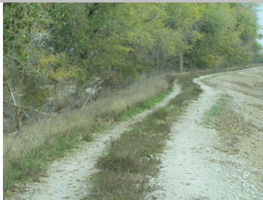
View of the crown roadway with tall grasses present. No new picture.