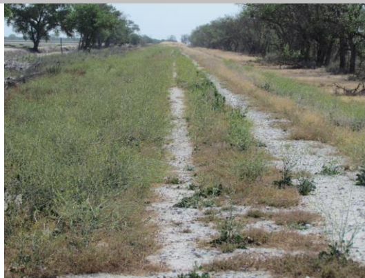
Crown roadway need to be free of vegetation.