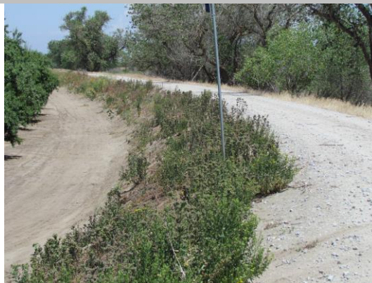
Unsatisfactory tall weeds on the landside slope.