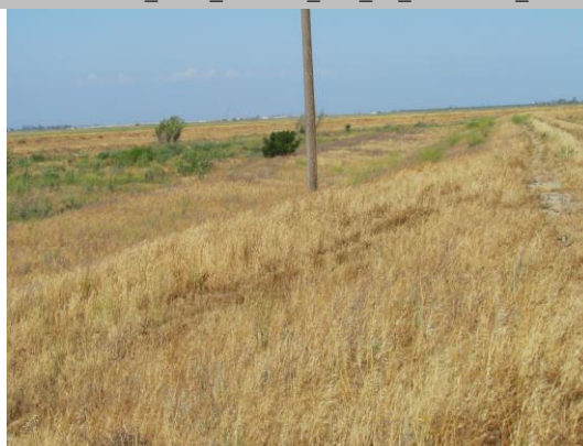
Fresno River looking upstream at tall weeds on the waterside slope.