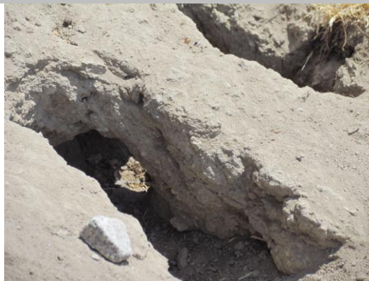
Another view of the activity in area.