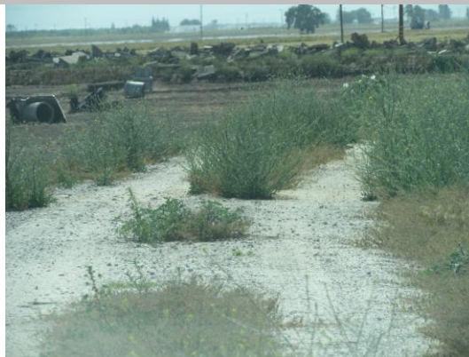
View of unacceptable tall weeds growing on crown roadway.