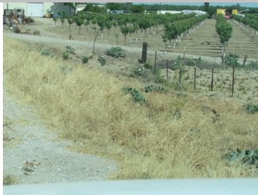
Tall weeds present on the landside shoulder and slope.