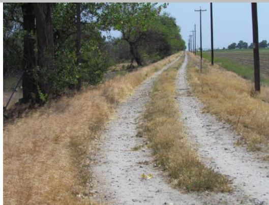
Unacceptable wild growth on the waterside slope and shoulder.