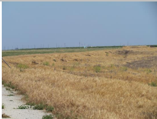
Looking downstream from levee mile 0.03 tall weeds on the waterside slope.