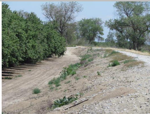
The rodents are very active in this area.