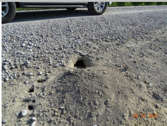
Large rodent hole observed on the waterside slope. (Spring 2021)