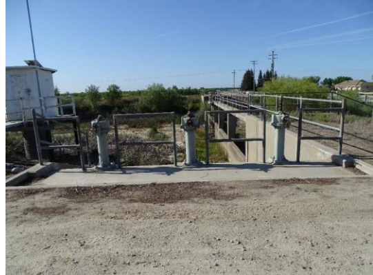
WS view: Looking from crown; slide gate operator on shoulder.