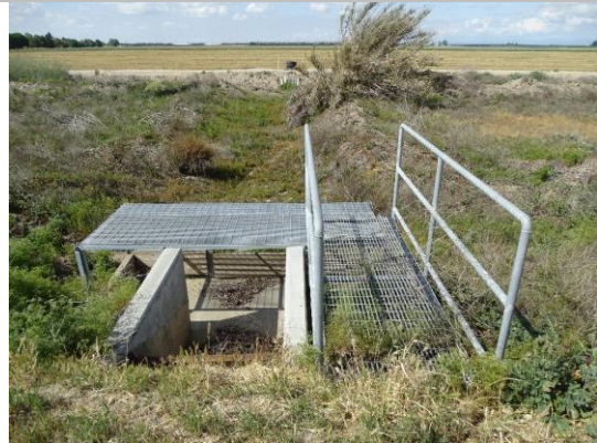
LS view: Looking from crown; concrete headwall and walk way.