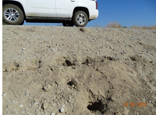
Multiple rodent holes observed in the landside slope. (Fall 2022)