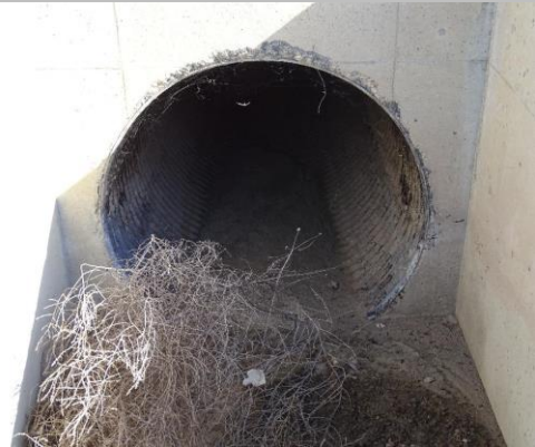
LS view: Close-up view of CMP inlet; cleared of sediment.