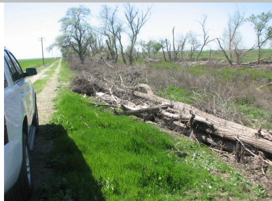
Looking upstream at fallen tree on waterward slope. (Spring 2018)