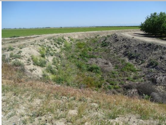
LS view: Looking from levee; drainage channel leading to drainage structure.