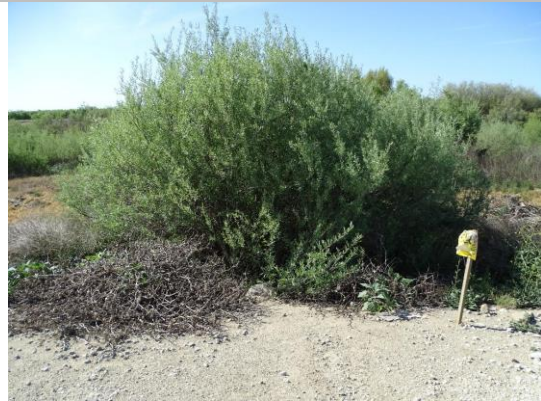
WS view: Looking from levee; dense and overgrown vegetation around headwall.