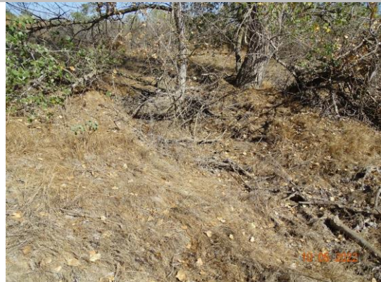
Erosion on the waterside toe around a fallen tree limb and tree trunk. (Fall 2022)