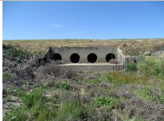
LS view: Looking toward levee; concrete headwall and pipe inlet of drainage structure.