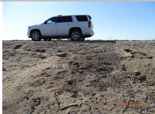
Several rodent holes observed at this location. (Fall 2019)