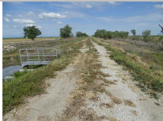
Levee crown looking upstream.