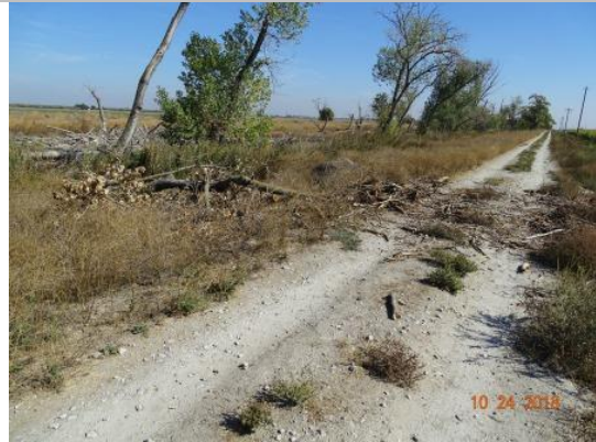
Tree branches strewn across levee crown and both shoulders. (Fall 2018)