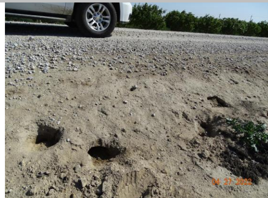
View of rodent burrows in the waterside slope. (Spring 2022)