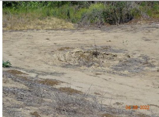
Large hole in the channel approximately 15 feet from the waterside toe. (Spring 2022)