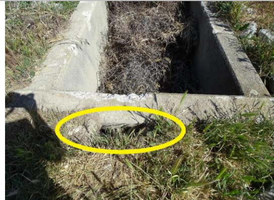
LS view: Rodent activity behind headwall on slope.