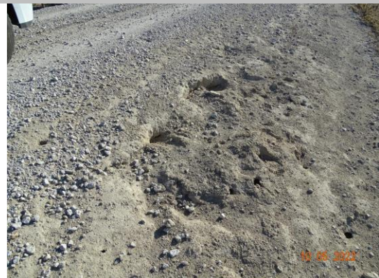
Partially collapsed rodent holes on the waterside slope. (Fall 2022)