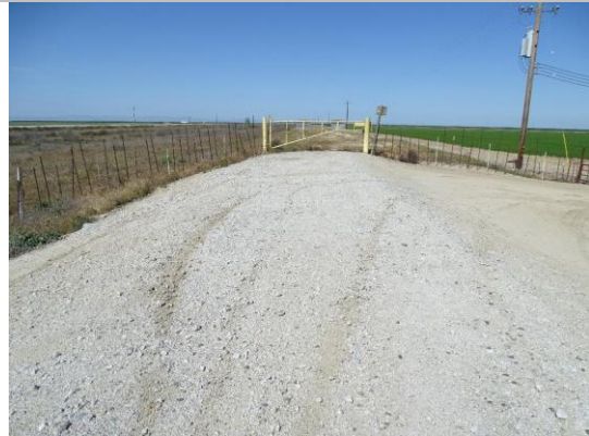
Levee crown looking downstream.