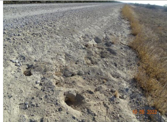
View of burrows on the waterside slope. (Fall 2022)