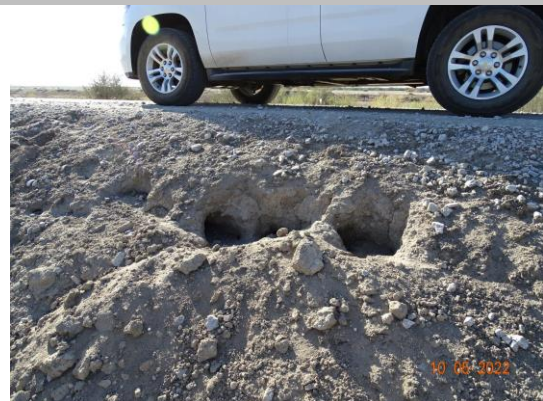
View of rodent holes on the landside slope. (Fall 2022)