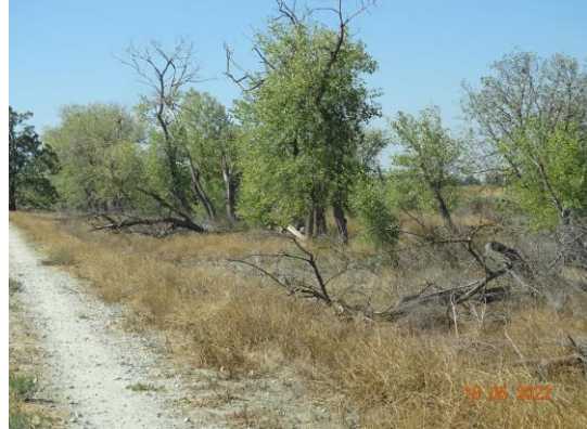
Fallen trees washed up on the waterside slope and berm from high water. (Fall 2022)