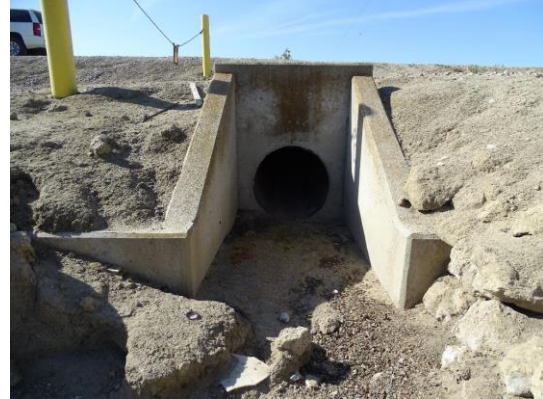
LS view: Concrete headwall and pipe inlet.