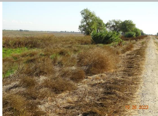
View of vegetation growing along the landside slope. (Fall 2023)