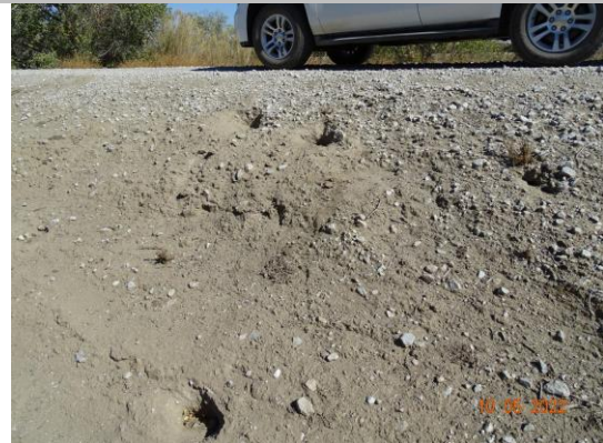
Multiple rodent holes observed on the landside slope. (Fall 2022)