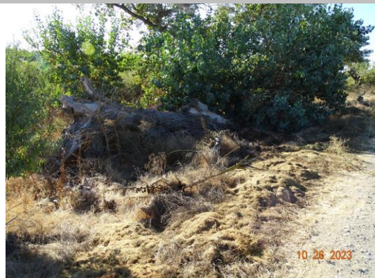
Tree limbs and trunks are on the waterside shoulder and slope. (Fall 2023)