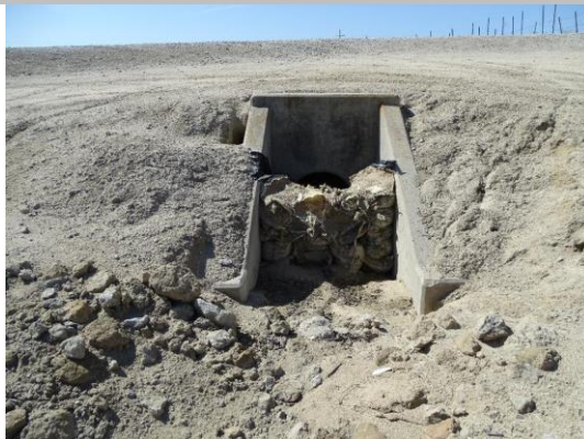
LS view: Concrete headwall at toe; stacked sandbags are blocking pipe inlet.