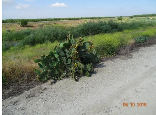
Cactus growing on waterside shoulder. (Spring 2019)