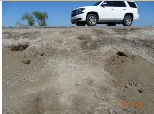
Representative view of rodent holes observed in this section. (Spring 2020)