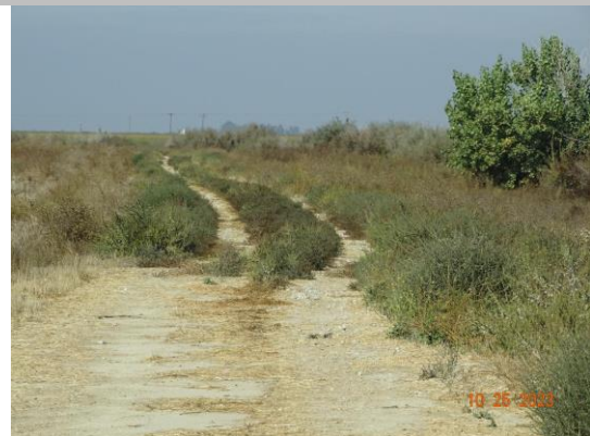
View of vegetation growing along the levee crown. (Fall 2023)