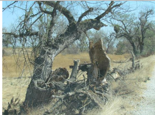
Berenda Slough looking upstream from the levee mile 0.14.