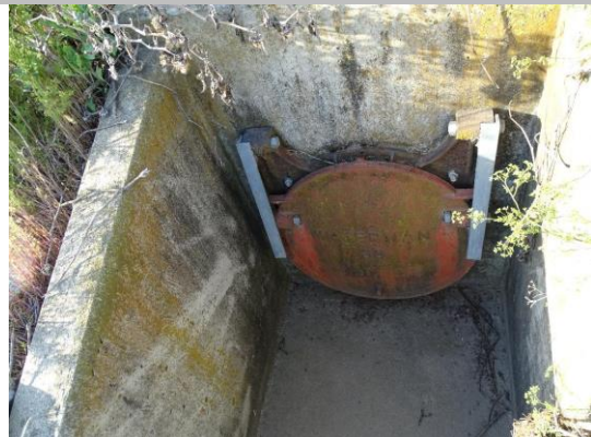
WS view: Concrete headwall and flap gate.