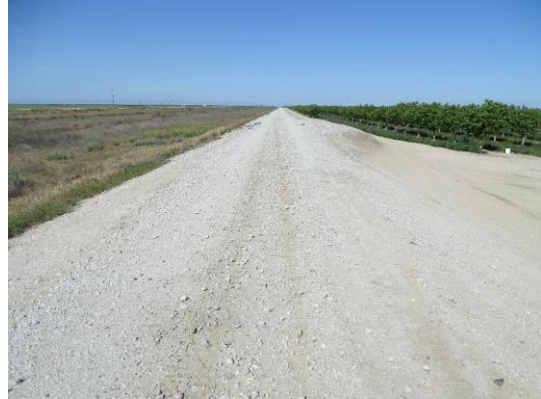
Levee crown looking downstream.