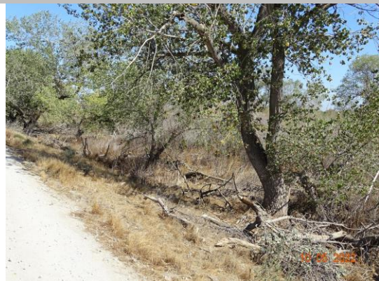
Tree limbs on the waterside slope and toe should be removed. (Fall 2022)