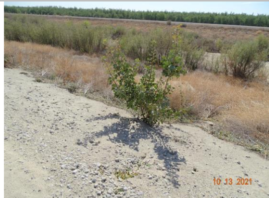
Sapling growing on the waterside shoulder. (Fall 2021)