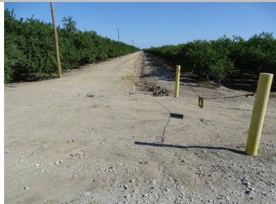
LS view: Looking from crown; concrete headwall approximately 20 feet off toe.