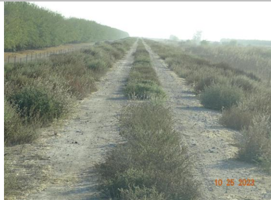
Looking upstream along the levee crown. (Fall 2023)