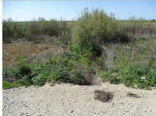
WS view: Concrete headwall on toe; overgrown vegetation around headwall.