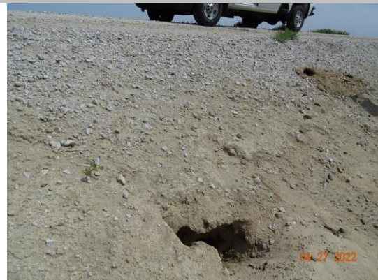
Multiple rodent holes observed in this section of the levee. (Spring 2022)