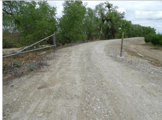
Levee crown looking upstream.