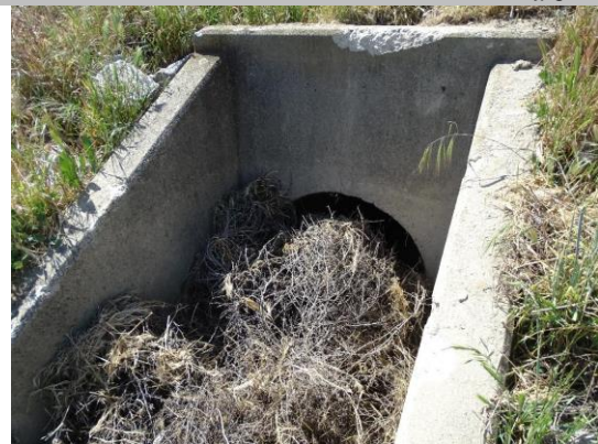
LS view: Concrete headwall and pipe inlet; tumbleweeds in front of inlet.