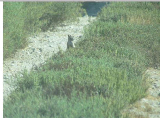
Berenda Slough Unit 3 looking upstream.

Photo 1 of 1 : FA_2023_NA0011_144_8_20230821_00003.jpg