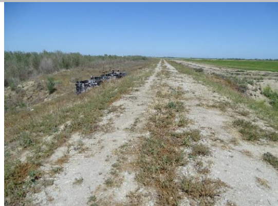
Levee crown looking downstream.