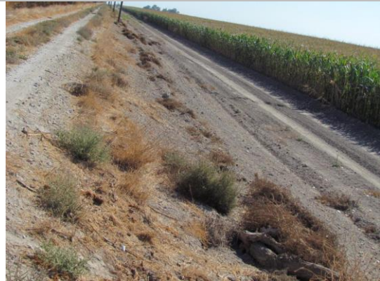
Berenda Slough Unit 4 looking upstream landside.