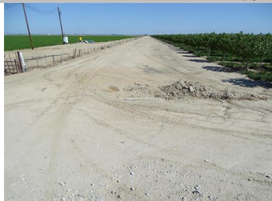
LS view: Looking from crown; top of concrete headwall on toe.