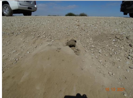
View of large rodent hole in the landside slope. (Fall 2021)

Photo 1 of 1 : FA_2023_NA0011_147_78_20230821_00024.jpg