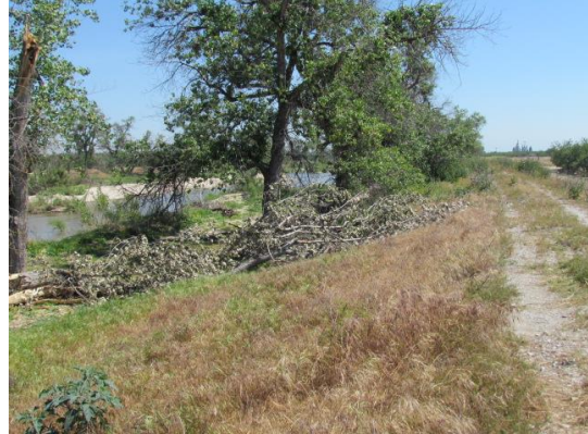
Dead fallen trees on the waterside levee slope and shoulder.