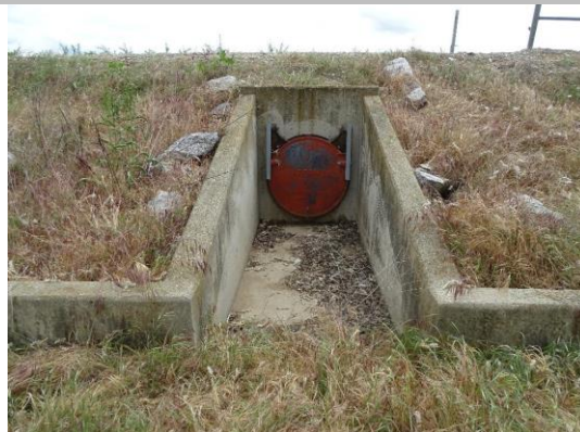
WS view: Concrete headwall and flap gate on toe.