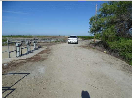
Levee crown looking downstream.