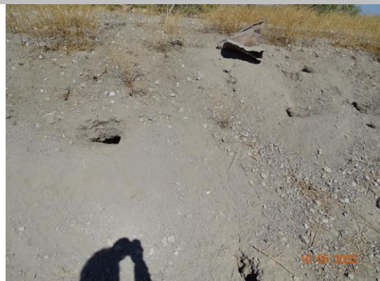
Multiple burrows observed on the landside slope. (Fall 2022)