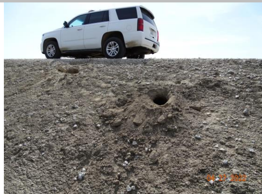
Representative view of rodent burrow on the landside slope. (Spring 2022)