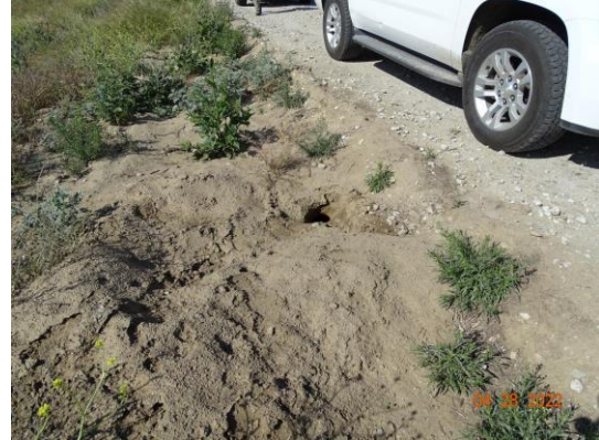
Rodent burrows observed on the waterside slope. (Spring 2022)