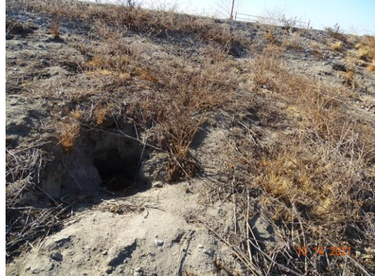
Representative view of rodent burrows on the waterside slope. (Fall 2021)