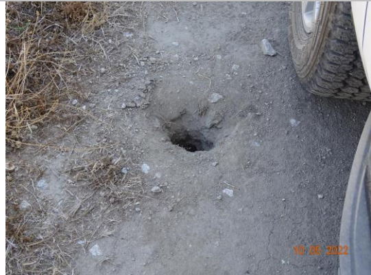
View of a rodent hole on levee crown. (Fall 2022)