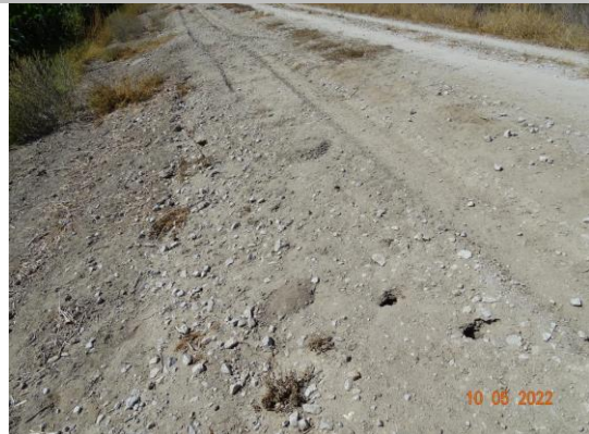
View of small rodent burrows observed on the landside slope. (Fall 2022)