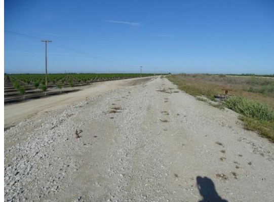
Levee crown looking downstream.