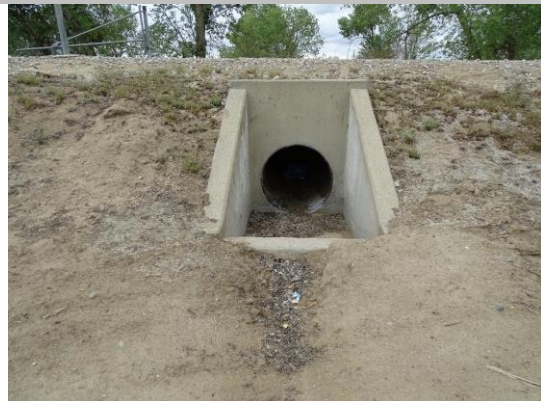
LS view: Concrete headwall and pipe inlet on toe.