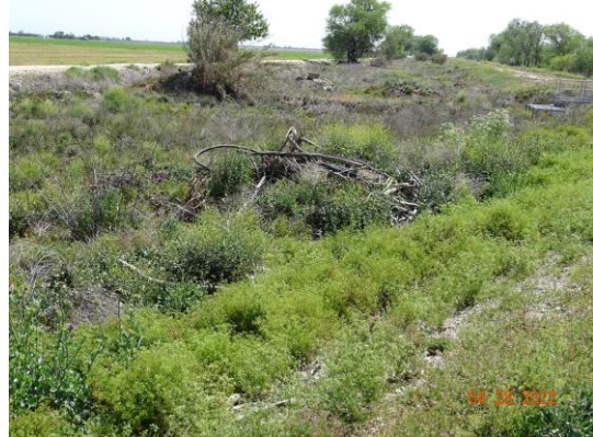
Looking at prunings on landward slope. (Spring 2022)