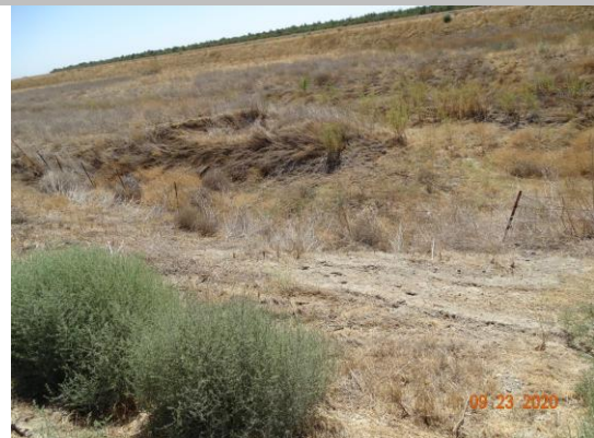
View of erosion on the landside slope. (Fall 2020)