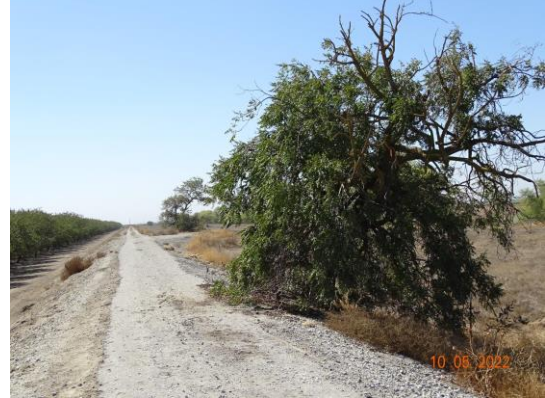
Trim tree on waterside shoulder. (Fall 2022)