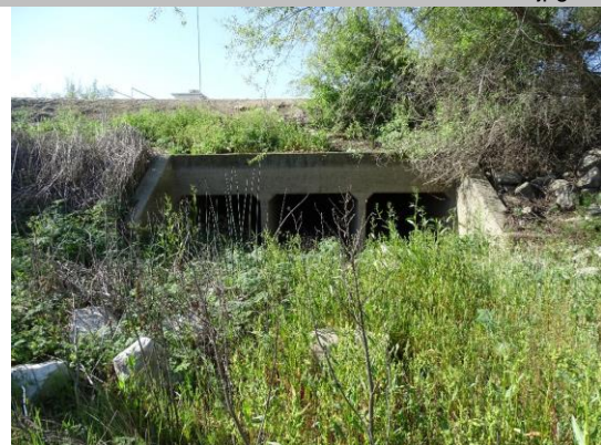
LS view: Looking toward levee; inlet of reinforced concrete box culvert.