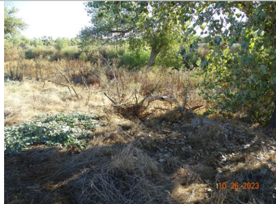
View of tree limbs on the waterside slope. (Fall 2023)