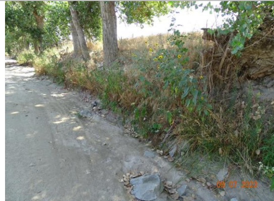
9/14/2023: View of the erosion on the levee toe.