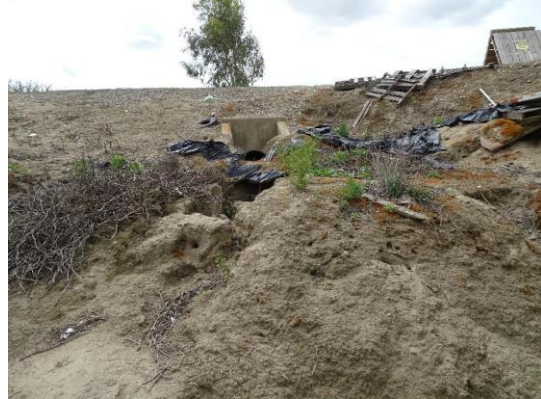
LS view: Looking toward levee; erosion in front of concrete headwall.