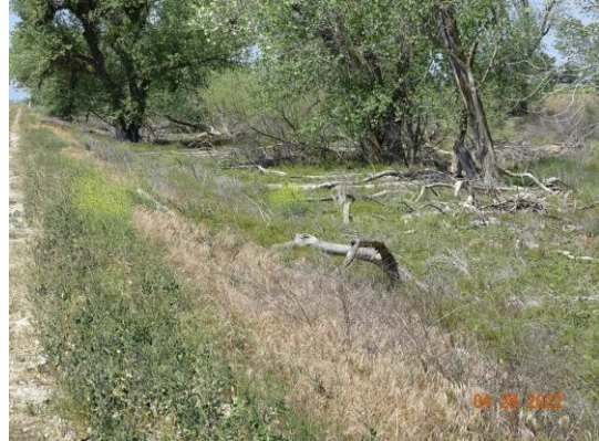
Broken tree limbs and trunks in the channel should be removed. (Spring 2022)