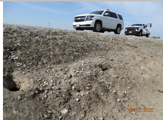
Several rodent holes were noted at this location. (Spring 2022)