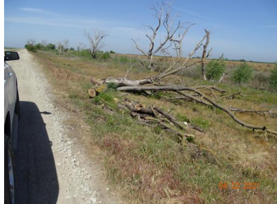
View of tree limbs on the waterside slope. (Spring 2021)