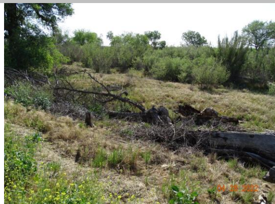
Remove downed tree from waterside slope. (Spring 2022)