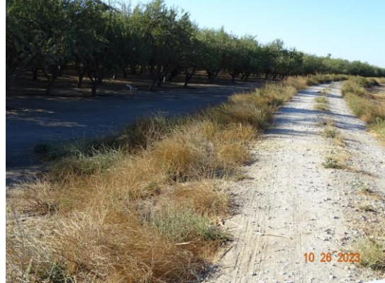
Looking downstream along the landside slope. (Fall 2023)