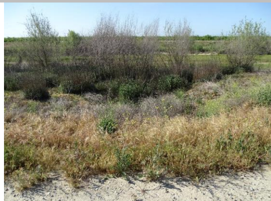
WS view: Looking from crown; dense vegetation on slope and floodway.