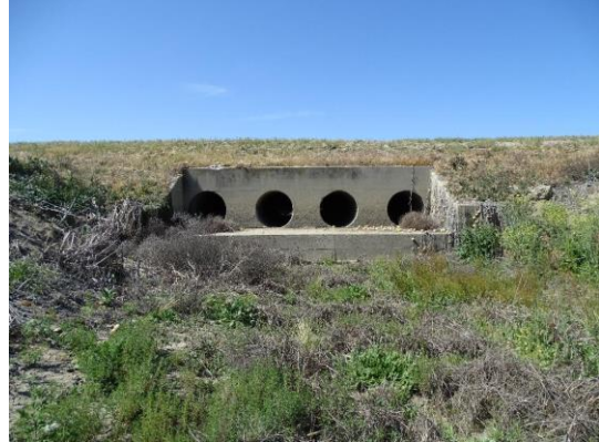
LS view: Looking toward levee; concrete headwall and pipe inlet of drainage structure.