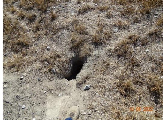
Representative view of rodent holes on the landside slope. (Fall 2022)