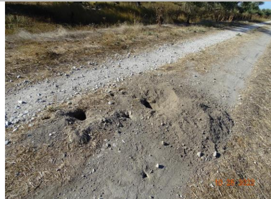
Rodent burrows with large amount of material displaced in the levee crown. (Fall 2023)