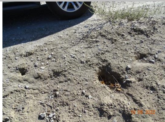
Representative view of burrows on the waterside slope in this section. (Fall 2022)