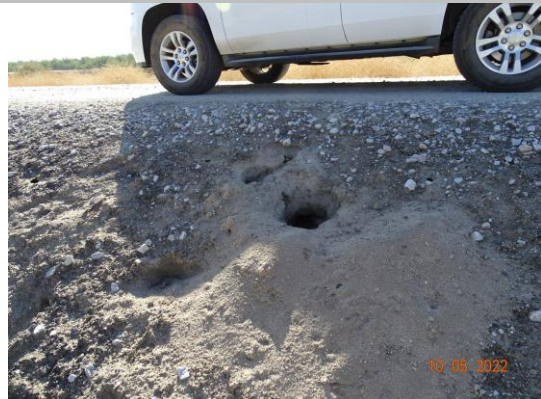
View of rodent holes on the landside slope. (Fall 2022)