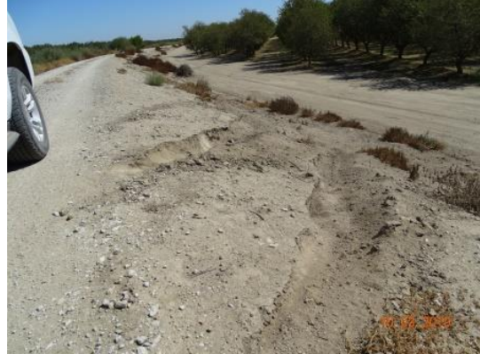
Damage to landside slope from vehicle traffic. (Fall 2019)