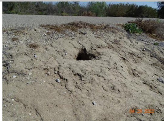
View of animal burrow on the landside slope. (Spring 2022)