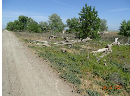
View of fallen trees on the waterside slope and berm. (Spring 2021)