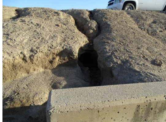
LS view: Surface erosion on slope; deep hole located behind concrete headwall.