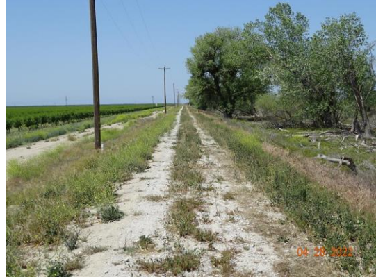
View of vegetation growing along the levee crown. (Spring 2022)