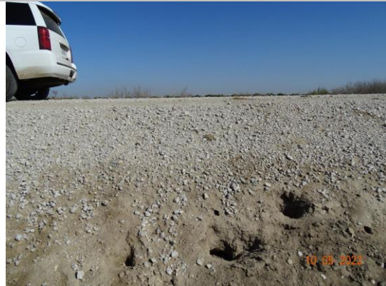
Looking at typical rodent hole on landward slope. (Fall 2022)