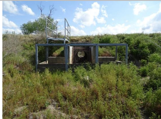
LS view: Looking into pipe through levee; flap gate is open on WS.