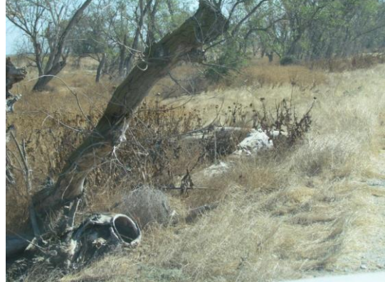
Tree on WS shoulder.