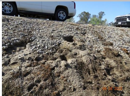
Partially collapsed rodent holes in the landside slope. (Spring 2022)