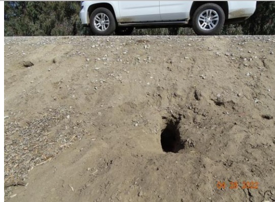
Large rodent burrow observed on the landside toe. (Spring 2022)