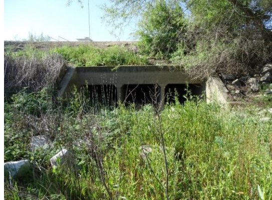
LS view: Looking toward levee; inlet of reinforced concrete box culvert.