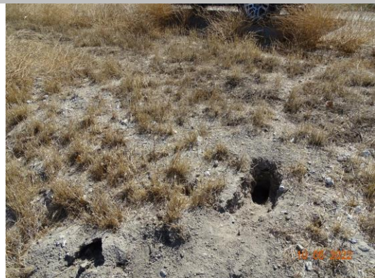
Several rodent burrows observed on the landside slope. (Fall 2022)