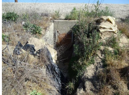
WS view: Sandbags at end of spillway that would impede drainage.