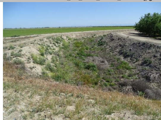
LS view: Looking from levee; drainage channel leading to drainage structure.