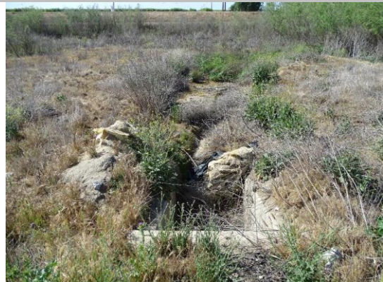
WS view: Concrete headwall on toe; stacked sandbags at end of spillway that would impede drainage.