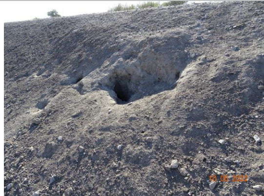
Representative burrow on the landside slope. (Fall 2022)