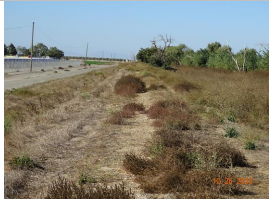
View of vegetation growing along the levee crown. (Fall 2023)