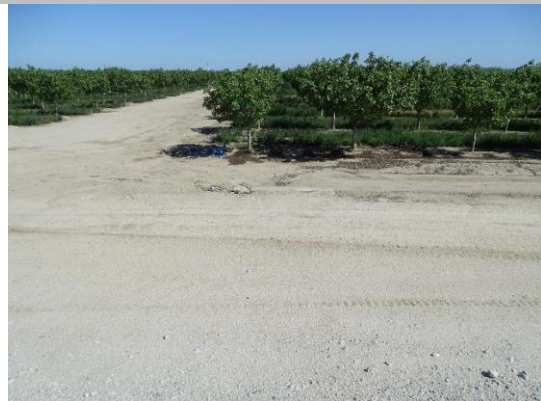
LS view: Looking from crown; concrete headwall on toe.