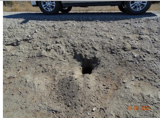
View of animal burrow on the landside slope. (Fall 2022)