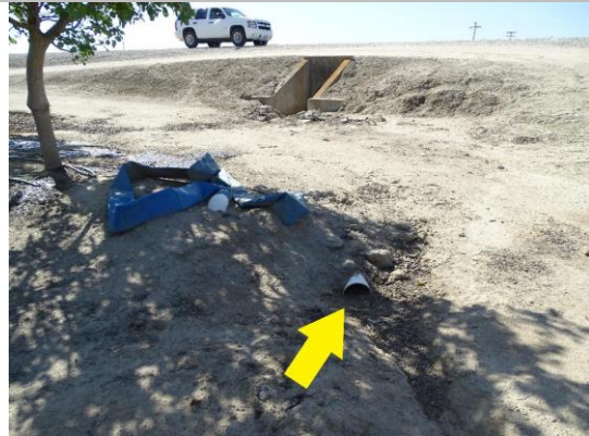
LS view: PVC drainage pipe inlet (yellow arrow) leading to headwall.