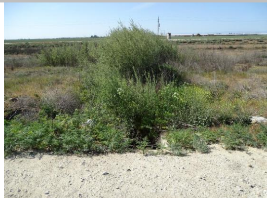
WS view: Looking from crown; concrete headwall at toe. Overgrown vegetation around headwall.