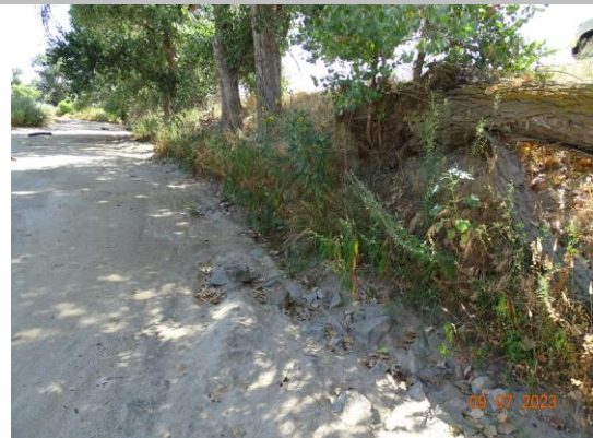
9/14/2023: Another view of the erosion.