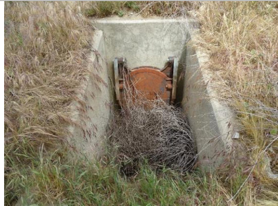
WS view: Concrete headwall, spillway, and flap gate; outlet is at a low point due to sediment buildup at end of spillway.