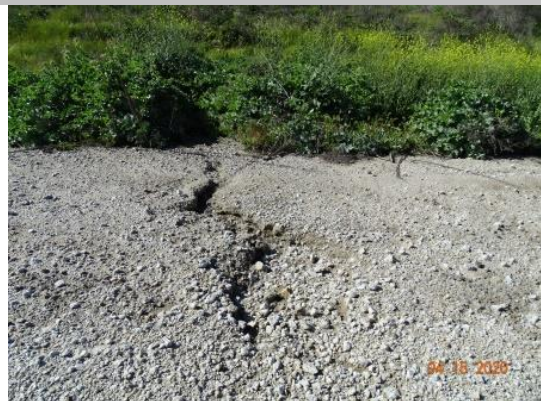
Finger erosion on the waterside slope. (Spring 2020)