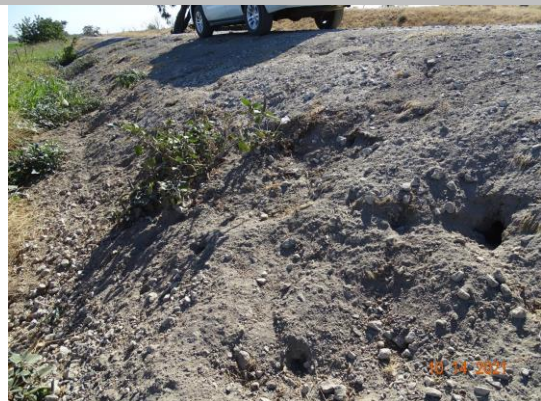
View of rodent burrows in the landside slope. (Fall 2021)