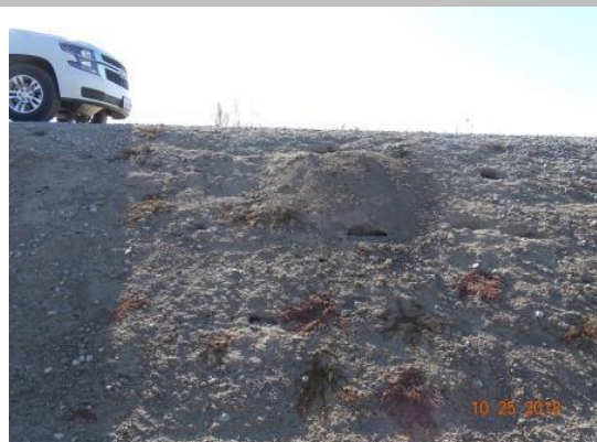
Rodent activity on landside slope. (Fall 2018)