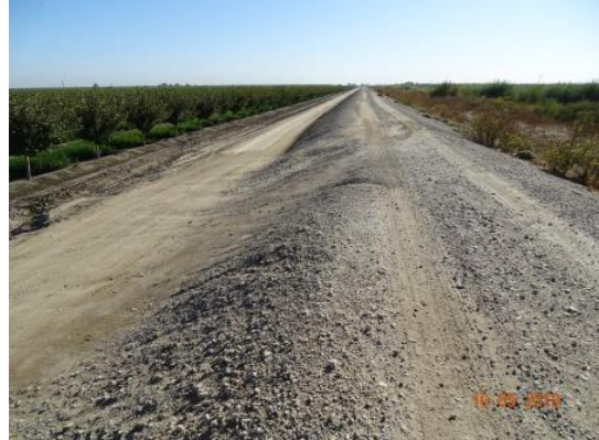
Damage to landside shoulder and slope looking upstream. (Fall 2019)