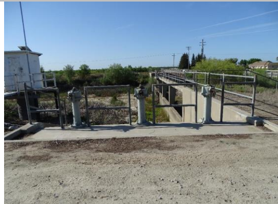
WS view: Looking from crown; slide gate operator on shoulder.