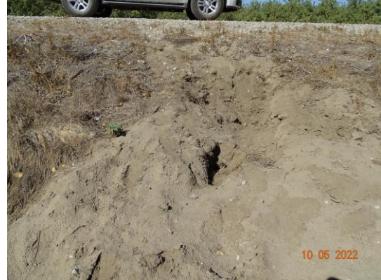
Erosion pocket on the waterside slope. (Fall 2022)