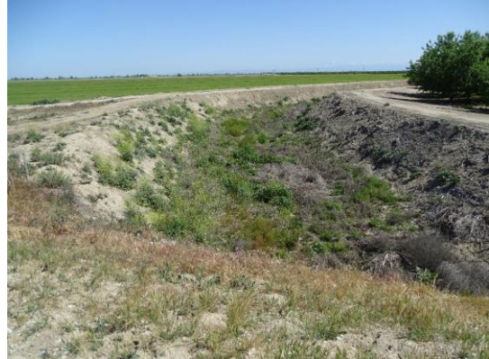
LS view: Looking from levee; drainage channel leading to drainage structure.