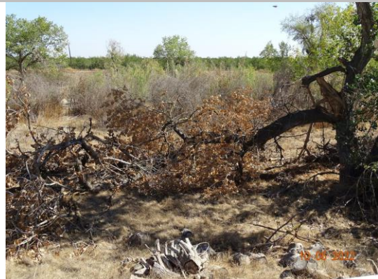
Downed tree limbs on the waterside berm should be removed. (Fall 2022)