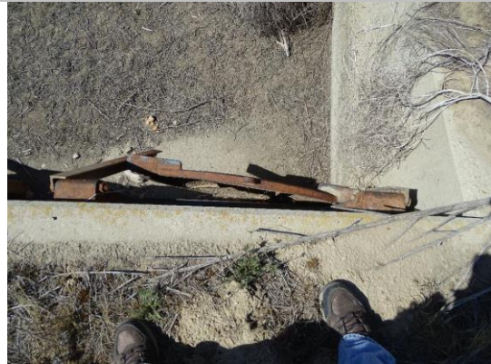
WS view: View from above; flap gate does not close properly and appears not to be propped open with anything.