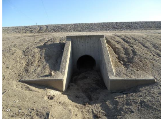
LS view: Concrete headwall and pipe inlet approximately 30 feet off toe.