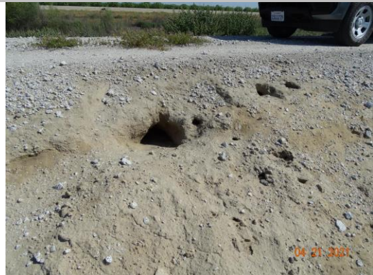
Rodent activity along the landside shoulder should be repaired. (Spring 2021)

Photo 1 of 1 : FA_2023_NA0011_147_25_20230821_00010.jpg