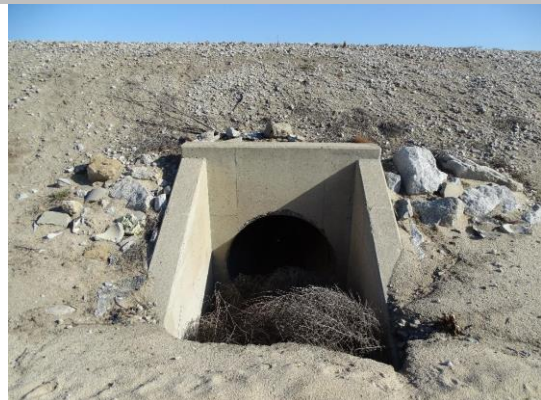
LS view: Concrete headwall and pipe inlet on toe.