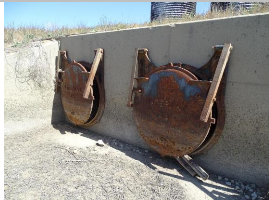
WS view: Flap gate not closed properly and appears not to be propped open. Record associated with flap gate on the left side.