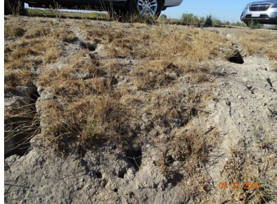
Rodent activity on the landside slope. (Fall 2020)