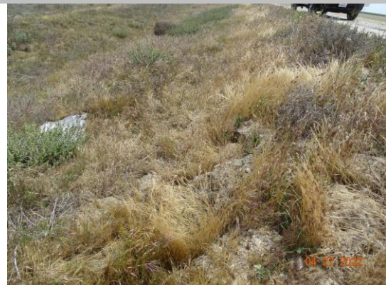
View of slump possibly the result of rodent activity. (Spring 2022)

Photo 1 of 1 : FA_2023_NA0011_147_17_20230821_00006.jpg