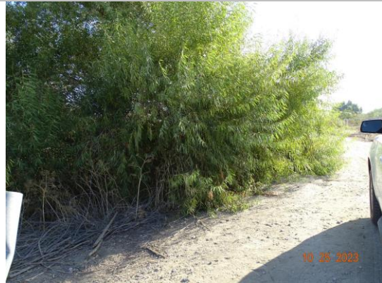
View of tree growing on the landside slope. (Fall 2023)