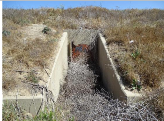
WS view: Concrete headwall and flap gate on toe; tumbleweeds at pipe outlet.