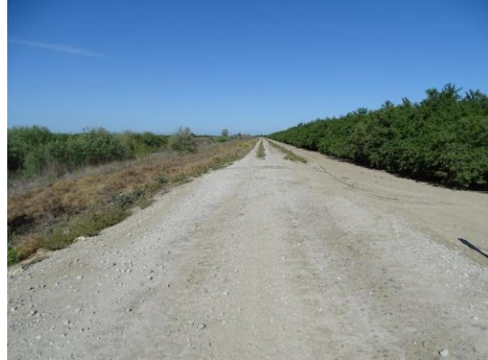
Levee crown looking downstream.