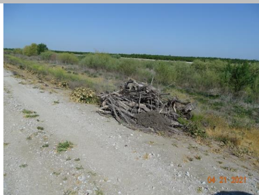
Burn pile left on the waterside shoulder. (Spring 2021)