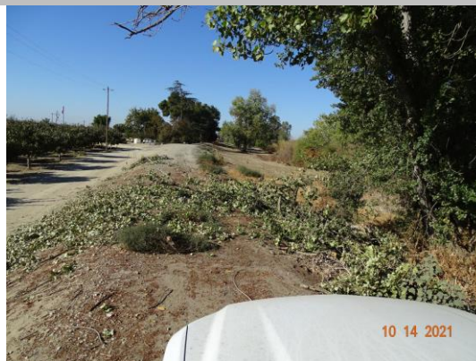
Tree branches blocking access across the levee crown and waterside slope. (Fall 2021)