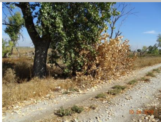
Trim branches on waterside shoulder. (Fall 2018)