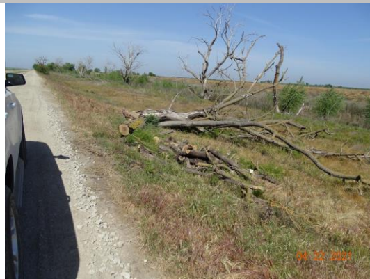
View of tree limbs on the waterside slope. (Spring 2021)

LS : Land Side N/A : Not Applicable WS : Water Side CR : Crown