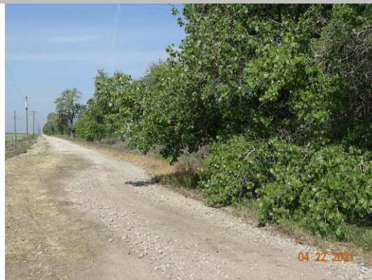
Trim trees to at least 5' above levee slope and 12' above levee crown to allow inspection and access. (Spring 2021)