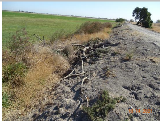
Tree limbs left on the landside slope. (Fall 2021)

* Location LS : Land Side N/A : Not Applicable WS : Water Side CR : Crown