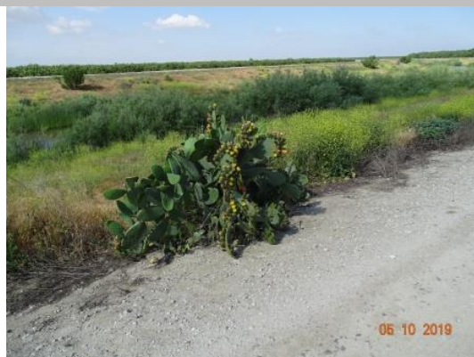
Cactus growing on waterside shoulder. (Spring 2019)