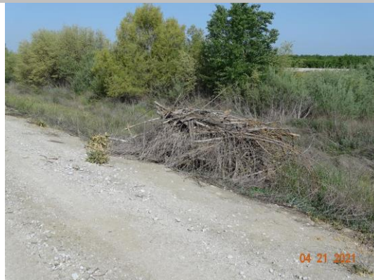
Burn pile left on the waterside shoulder and slope. (Spring 2021)