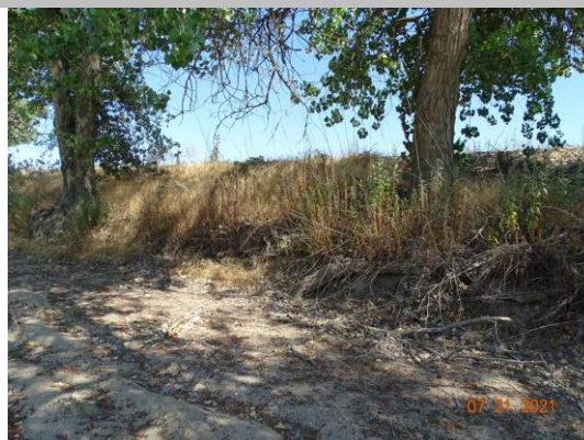
7/21/2021: View of the erosion on the levee toe.