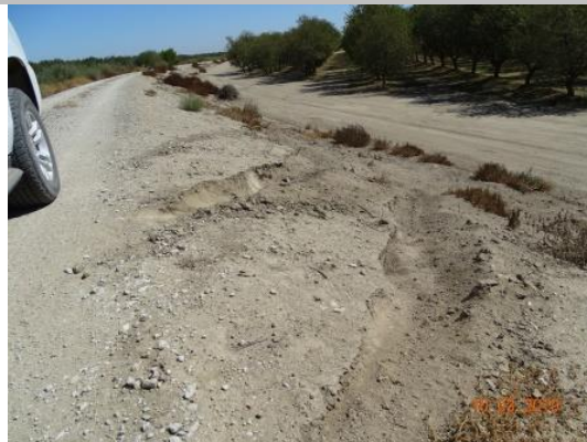
Damage to landside slope from vehicle traffic. (Fall 2019)