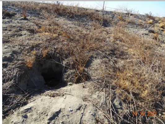
Representative view of rodent burrows on the waterside slope. (Fall 2021)