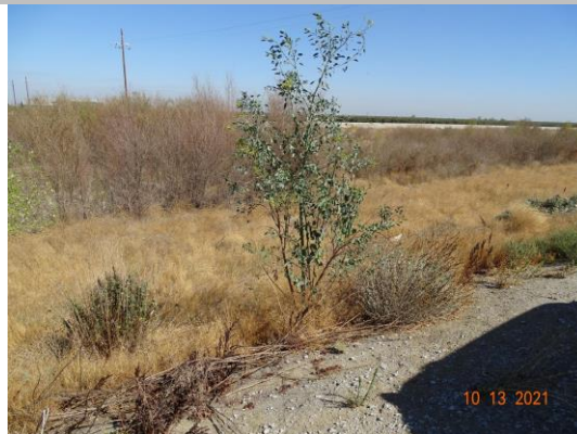
View of sapling growing in the waterside shoulder. (Fall 2021)