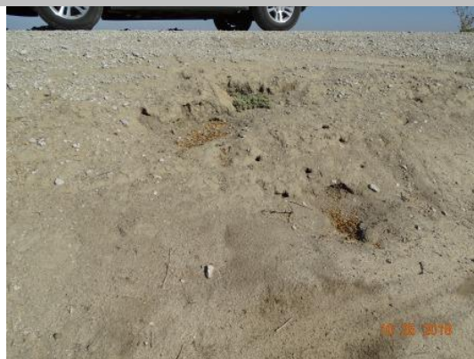
Minor erosion on landside slope. (Fall 2018)