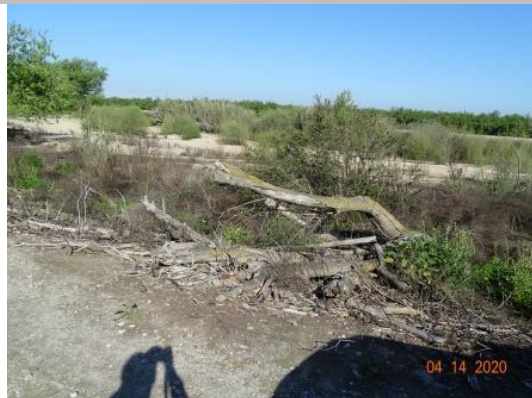
Branches left along the waterside slope from high flow. (Spring 2020)