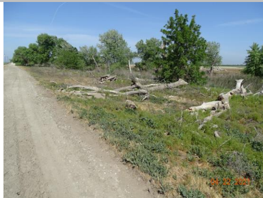
View of fallen trees on the waterside slope and berm. (Spring 2021)