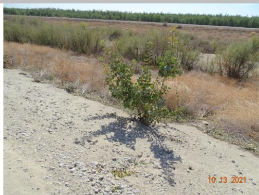
Sapling growing on the waterside shoulder. (Fall 2021)

* Location LS : Land Side N/A : Not Applicable WS : Water Side CR : Crown