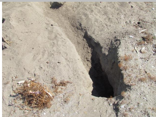
Previously noted burrows in the area waterside slope levee mile 0.32-1.67.