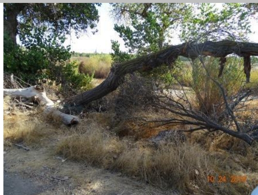
Tree limbs and trunks are on the waterside shoulder and slope. (Fall 2018)