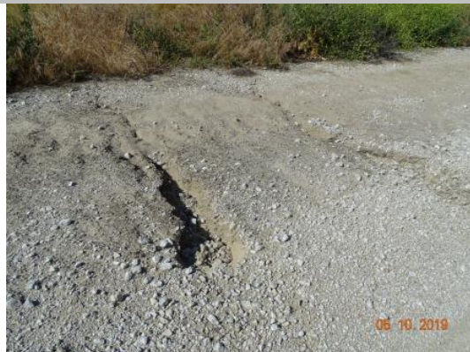
Rills observed on waterside slope. (Spring 2019)