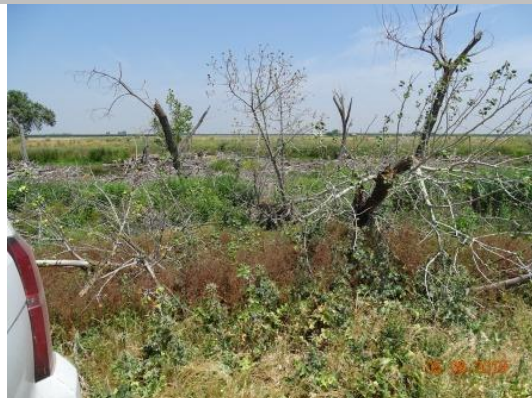
View of fallen tree on waterside slope. (Spring 2019)