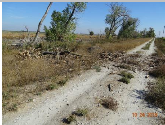
Tree branches strewn across levee crown and both shoulders. (Fall 2018)