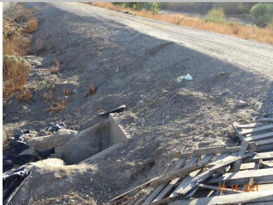
View of repaired slope damage on landside slope. (Fall 2021)