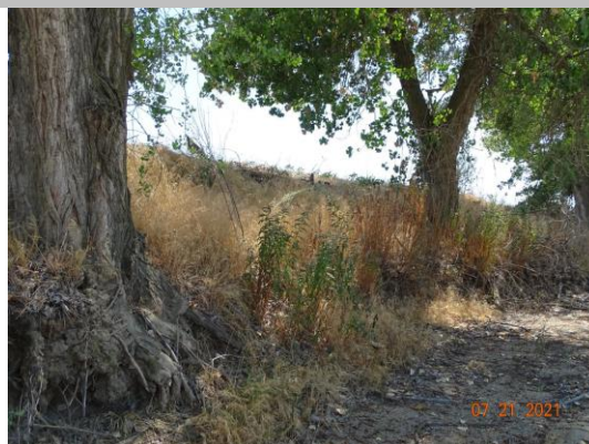
7/21/2021: Another view of the erosion.