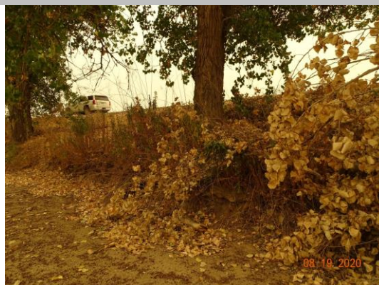
8/19/2020: Close-up view of erosion beneath a tree on the levee slope.