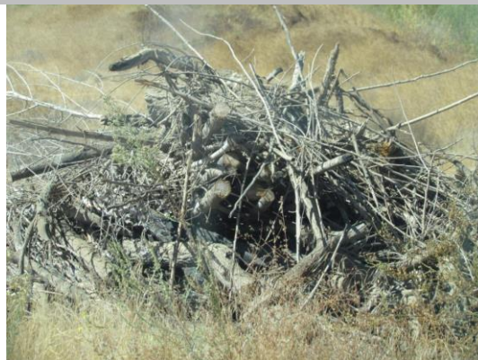
Fresno River levee mile 8.09.

* Location LS : Land Side N/A : Not Applicable WS : Water Side CR : Crown