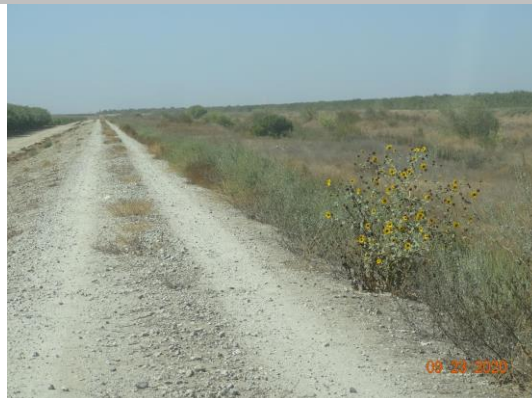
Vegetation on the waterside slope. (Fall 2020)