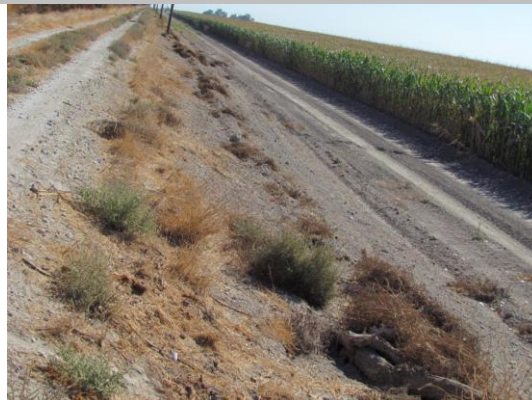
Berenda Slough Unit 4 Looking upstream landside.