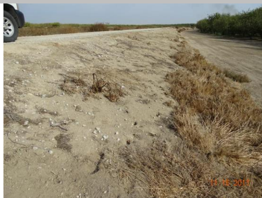
Bait traps should be maintained and rodent holes should be backfilled.