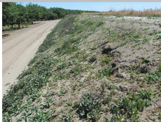
Fresno River landside levee slope levee mile 6.75-6.95.

Photo 1 of 1 : FA_2020_NA0011_146_28_20200901_00012.jpg