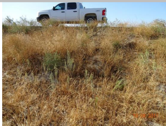
View of slump possibly the result of rodent activity.