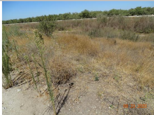
View of vegetation on the waterside slope. (Fall 2020).