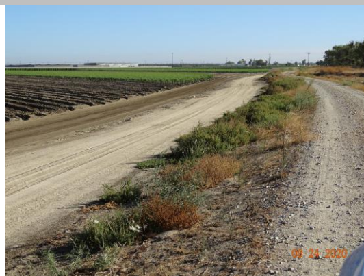
View of the landside slope looking upstream. (Fall 2020)