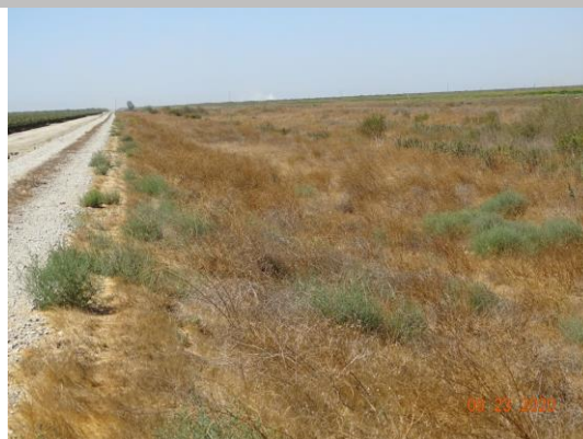
Looking upstream along the waterside slope. (Fall 2020)