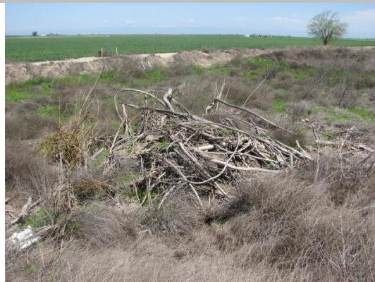
Looking at prunings on landward slope. (Spring 2018)