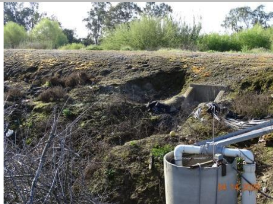
View of slope damage next to pipe headwall structure. (Spring 2020)