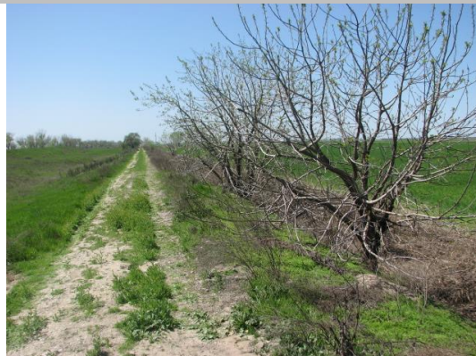
Looking at cluster of walnut trees on landward slope. (Spring 2018)