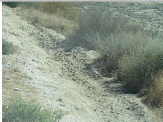
Berenda Slough looking back upstream waterside at the shoulder and slope.

* Location LS : Land Side N/A : Not Applicable WS : Water Side CR : Crown