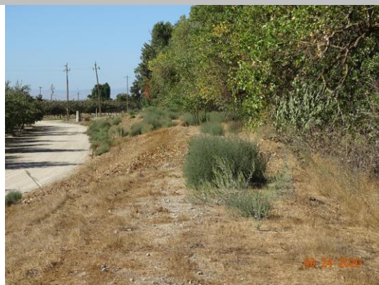
View of levee crown looking downstream. (Fall 2020)

Photo 1 of 1 : FA_2020_NA0011_143_42_20201005_00040.jpg