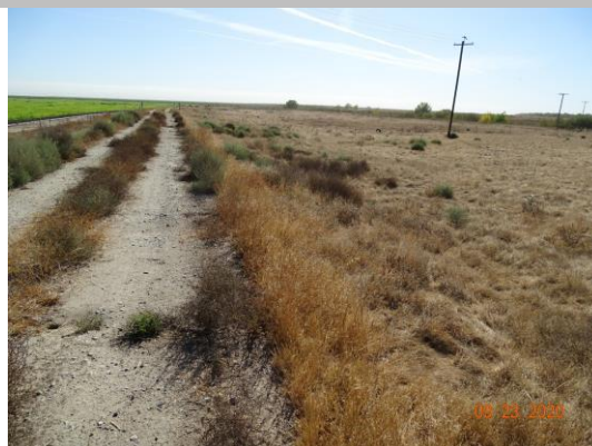
View of the waterside slope looking upstream. (Fall 2020)