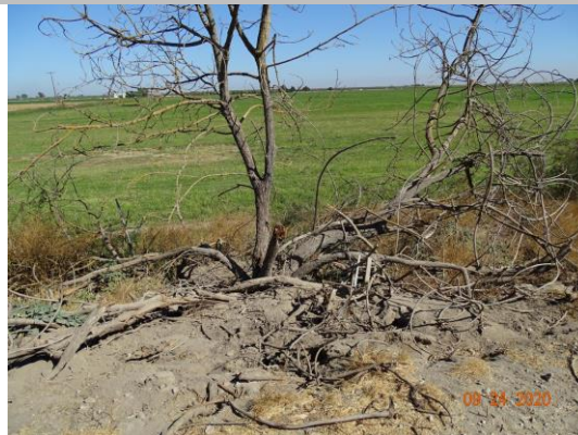
Remove dead walnut tree on the landside slope. (Fall 2020)