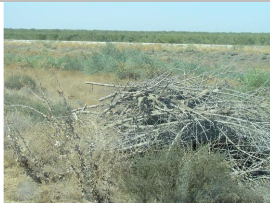
Fresno River levee mile 8.03 waterside slope and shoulder.