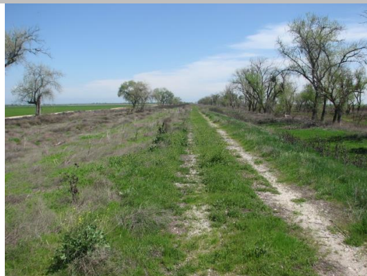
Looking downstream at levee crown. (Spring 2018)