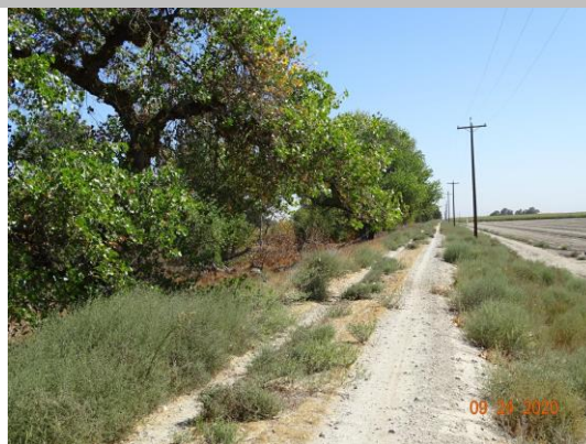
Low hanging tree limb above the levee crown. (Fall 2020)