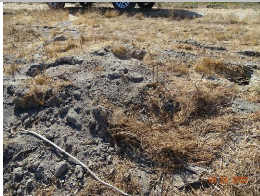
View of rodent burrows in the landside slope. (Fall 2020)