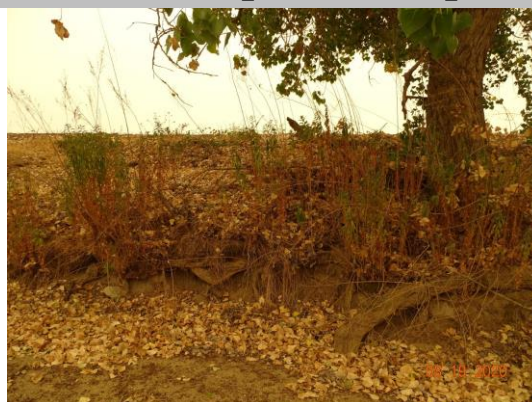
8/19/2020: Eorsion visible on the levee toe.