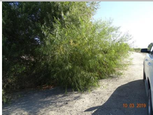
View of tree growing on landside slope looking upstream. (Fall 2019)

* Location LS : Land Side N/A : Not Applicable WS : Water Side CR : Crown