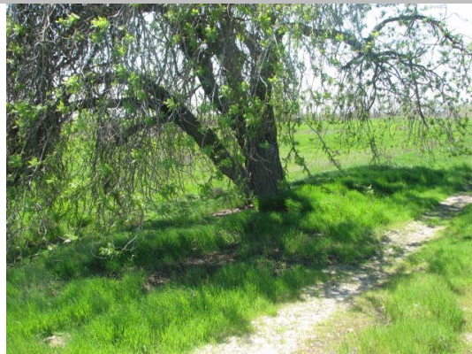
Looking at untrimmed tree on waterward shoulder. (Spring 2018)