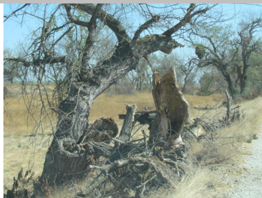
Berenda Slough looking upstream from the levee mile 0.14.