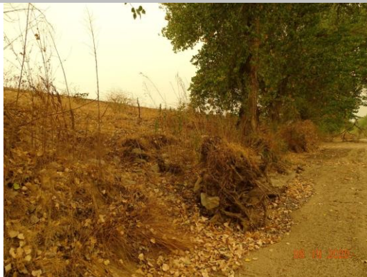
8/19/2020: View of the levee slope looking downstream with erosion around a fallen tree root in the foreground.