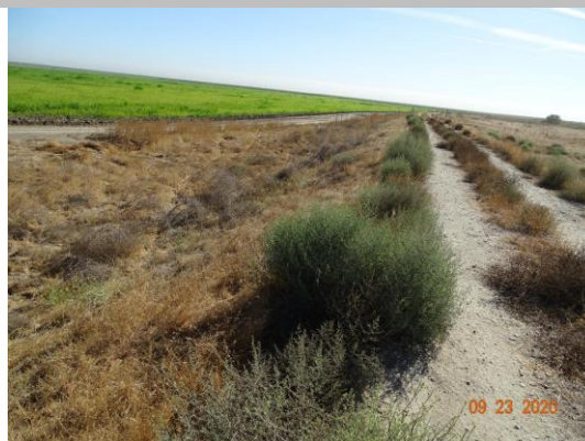
Vegetation on the landside slope and toe. (Fall 2020)