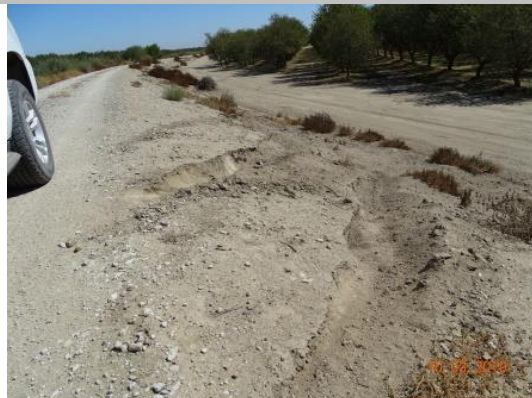
Damage to landside slope from vehicle traffic. (Fall 2019)