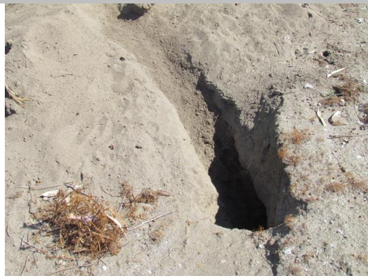
Active rodents spotted in the area waterside slope levee mile 0.00- 1.67.