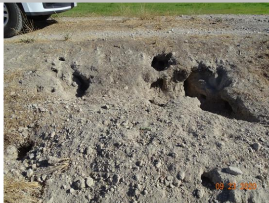
Rodent burrows in the waterside slope. (Fall 2020)

* Location LS : Land Side N/A : Not Applicable WS : Water Side CR : Crown