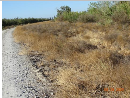
View of waterside slope looking downstream. (Fall 2020)

* Location LS : Land Side N/A : Not Applicable WS : Water Side CR : Crown