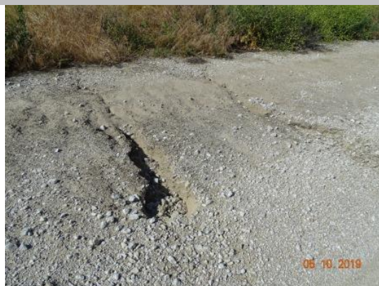
Rills observed on waterside slope. (Spring 2019)