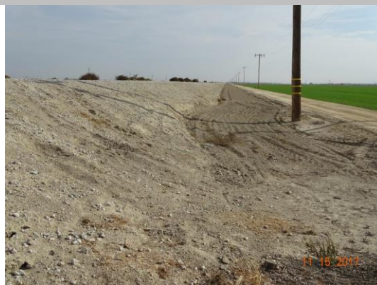
Ag activity has cut into landside toe. Activity should be stopped and levee slope repaired.