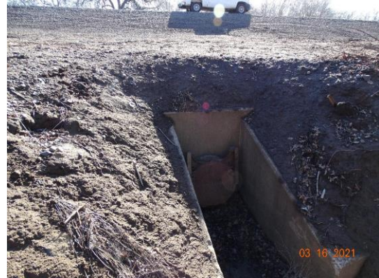
Water-Side: Headwall and flap gate on levee berm