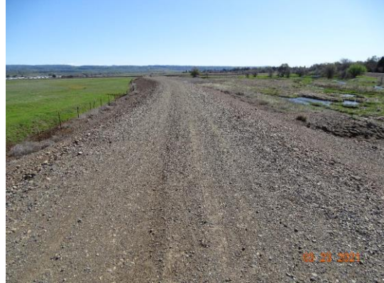
Top of Levee: View of levee crown looking upstream