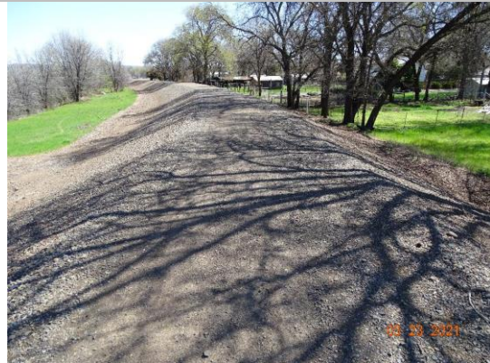
Top of Levee: View of levee crown looking upstream