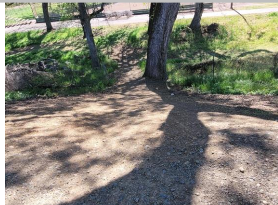
View of the erosion on the landside slope due to foot traffic. Spring 2022.