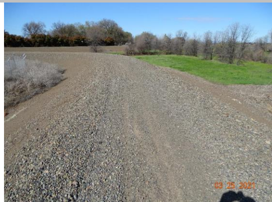
Top of Levee: View of levee crown looking downstream