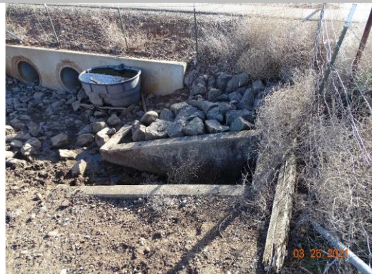
Water-Side: U-shaped Headwall and revetment on levee slope