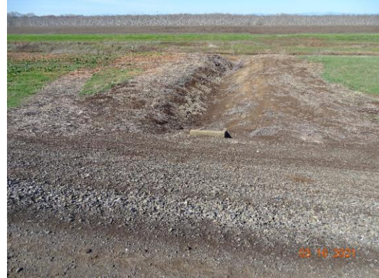
Water-Side: View of levee slope looking from crown