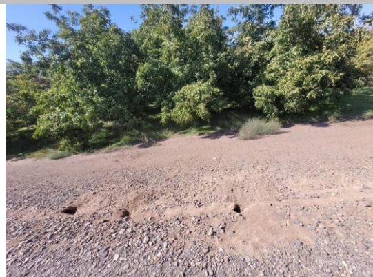
View of animal burrows along the landside slope. Fall 2022.