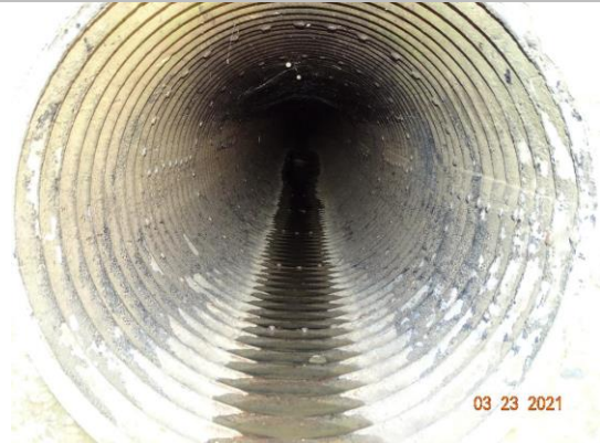
Land-Side: View inside of pipe looking from landside end