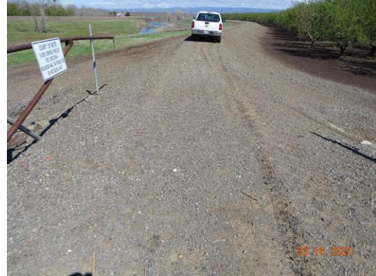
Top of Levee: View of levee crown looking upstream