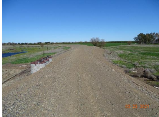
Top of Levee: View of levee crown looking downstream