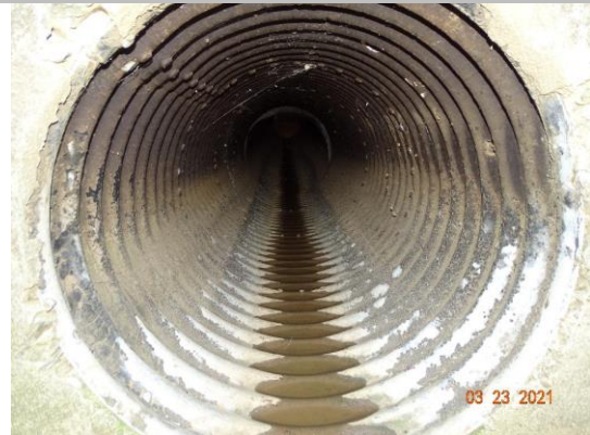
Land-Side: View inside of pipe looking from landside end