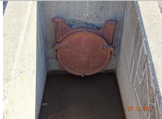
Water-Side: Headwall and flap gate at levee toe