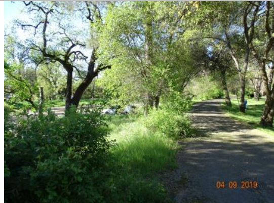
View of the wild growth on the landside slope. Spring 2019.