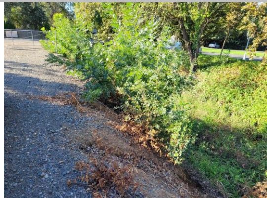
View of wild growth along the waterside slope and toe. Fall 2022.