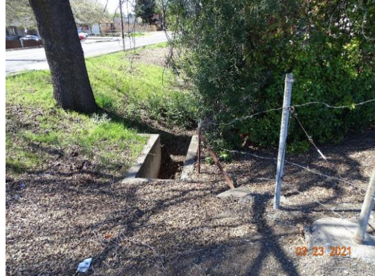
Land-Side: View of levee slope looking from crown