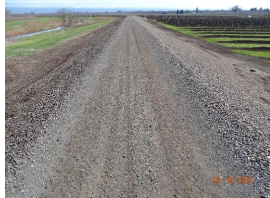
Top of Levee: View of levee crown looking upstream