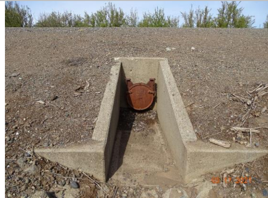
Water-Side: Headwall and flap gate at levee toe