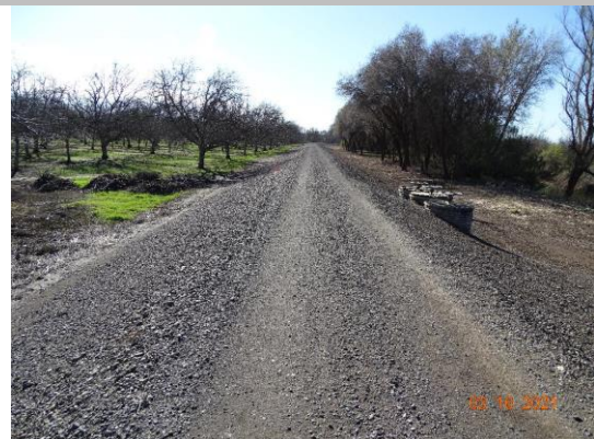
Top of Levee: View of levee crown looking downstream

DS_ID:19253 FS_ID:67359 EP_NO: N/A Repair Type: Non-Urgent EVAL Issue: Crossing Status: Found UCIP Comments: 03/16/2021 Record remains Non-Urgent. No permit has been identified authorizing pipe. Debris has been cleared. DMP internal video inspection has not found pipe integrity issues. LOF of crossing is less or equal to 4. Recommend next video inspection in 5 years. (O.Yakimov - DWR UCIP) 02/25/2014 Slide gates in CMP risers on waterside shoulder. Needs cleaning and clearing of debris. (P. Amatya - DWR UCIP) FIELD_STRUCT_DESC: 1 of 3: 48-inch corrugated metal gravity drainage pipe through the levee, 18 feet below the crown. Flap gate on the waterside (WS) end. Slide gate in a corrugated metal pipe (CMP) riser on the WS shoulder. Concrete U-shaped headwall on each end. Grouted riprap apron on the landside (LS) end. Grouted riprap spillway on the WS end. [Additional Reference(s): DWR Levee Log, 1992 (HLM 7.46). USACE Sacramento O&M Manual, Unit 504, May 1965, Revised 2 February 2011, (HLM 7.46), listed as 48-inch pipe. USACE As-Built Drawing No. 50-04-3684, Sheets 3 and 6, STA 50+00, 15 April 1963]. FS Date: 3/16/2021