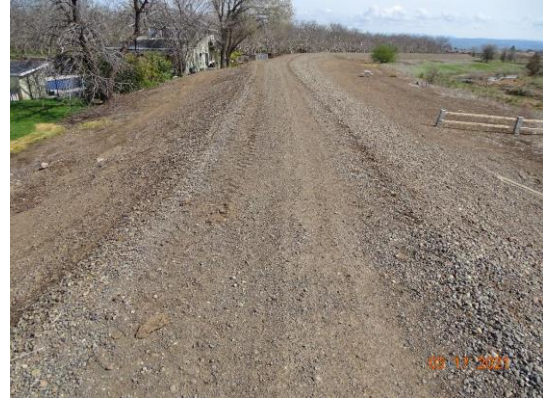
Top of Levee: View of levee crown looking upstream