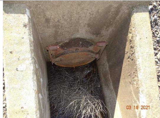
Water-Side: Headwall and flap gate at levee toe