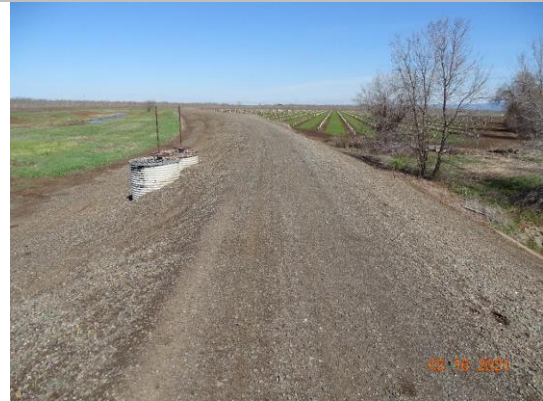
Top of Levee: View of levee crown looking upstream