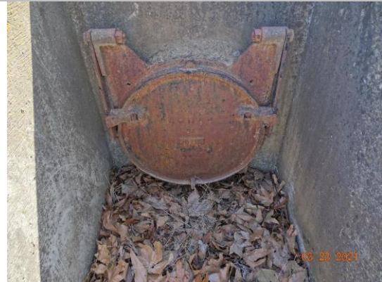
Water-Side: Headwall and flap gate at levee toe