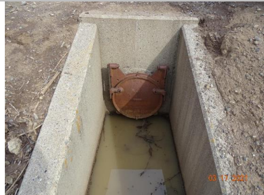
Water-Side: Headwall and flap gate at levee toe