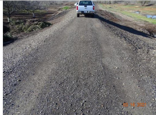
Top of Levee: View of levee crown looking downstream