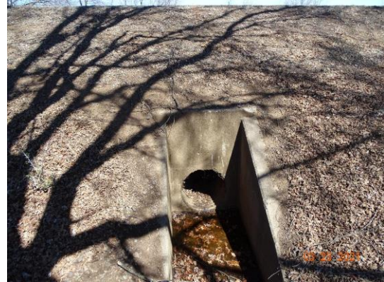
Land-Side: Levee slope, headwall, and pipe inlet