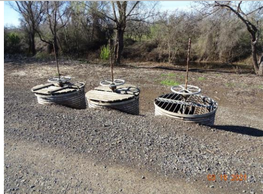
Water-Side: View of levee slope looking from crown. CMP riser with slide gate on levee shoulder