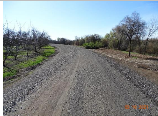
Top of Levee: View of levee crown looking downstream