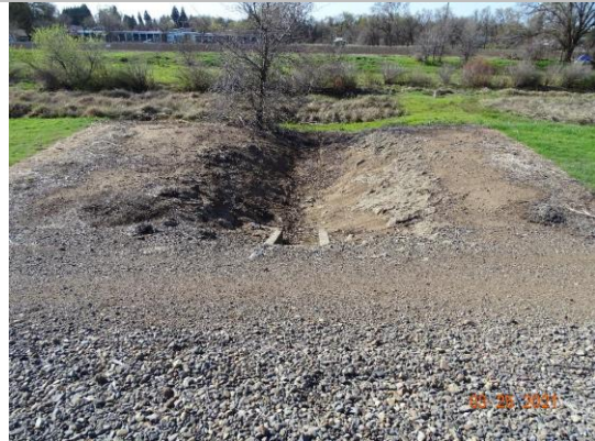
Water-Side: View of levee slope looking from crown