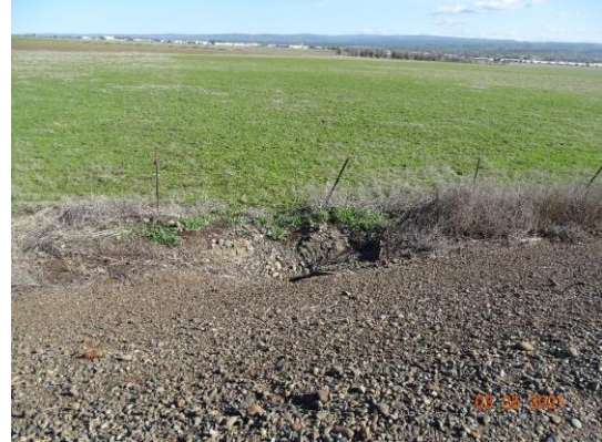
Land-Side: View of levee slope looking from crown