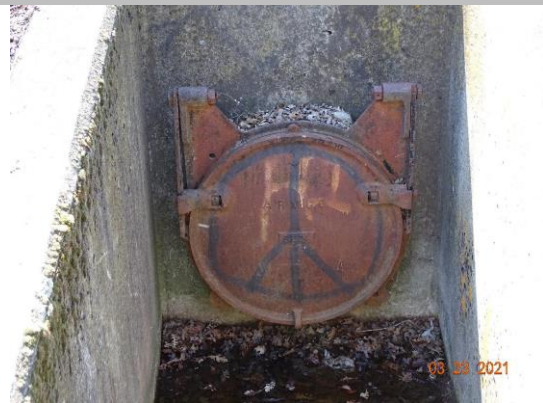
Water-Side: Headwall and flap gate at levee toe