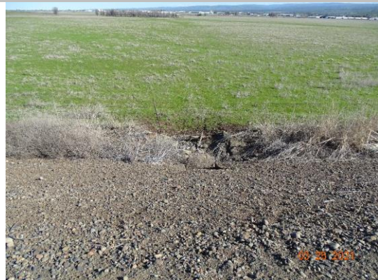
Land-Side: View of levee slope looking from crown