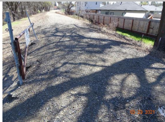
Top of Levee: View of levee crown looking upstream