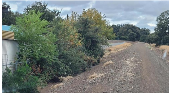
View of wild growth along the landside toe. Fall 2023.