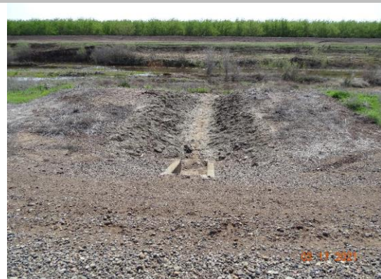
Water-Side: View of levee slope looking from crown