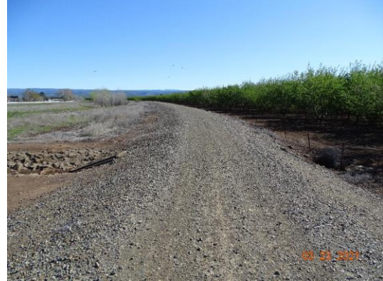
Top of Levee: View of levee crown looking upstream