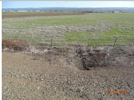
Land-Side: View of levee slope looking from crown