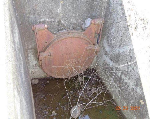
Water-Side: Headwall and flap gate at levee toe