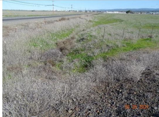
Land-Side: View of levee slope looking from crown