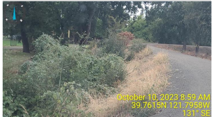
View of the wild growth along the landside slope. Fall 2023.