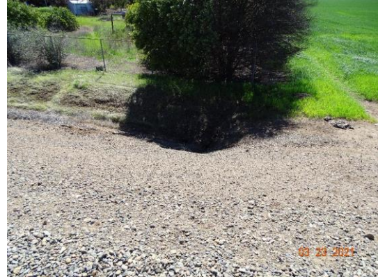
Land-Side: View of levee slope looking from crown