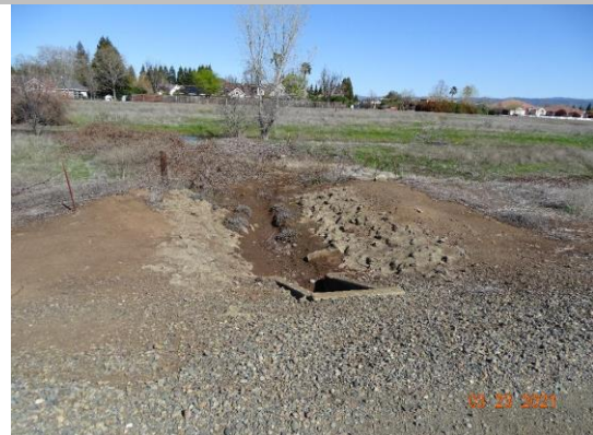
Water-Side: View of levee slope looking from crown