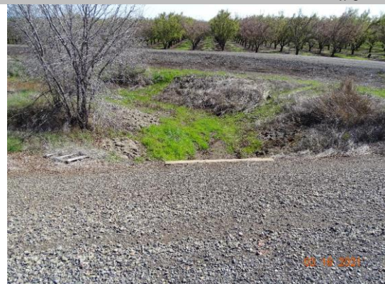
Land-Side: View of levee slope looking from crown