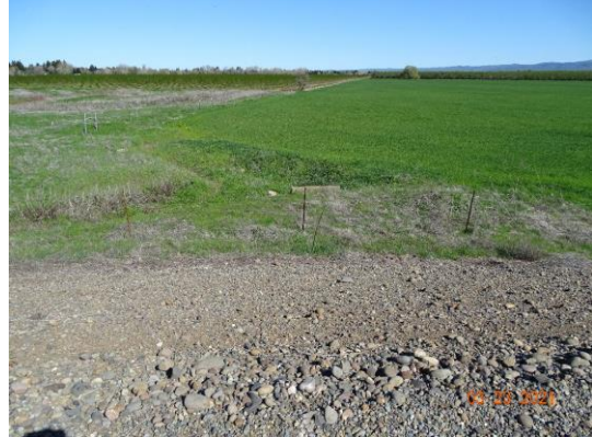
Land-Side: View of levee slope looking from crown