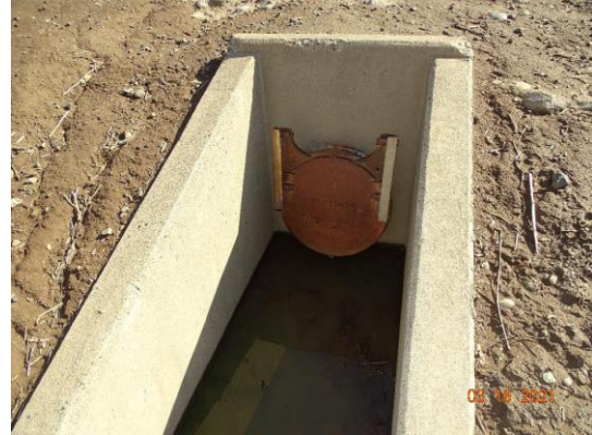
Water-Side: Headwall and flap gate at levee toe