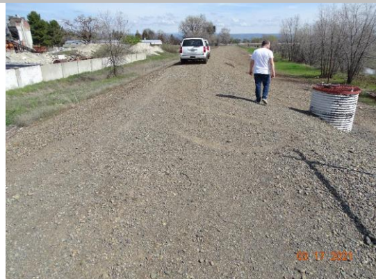
Top of Levee: View of levee crown looking upstream