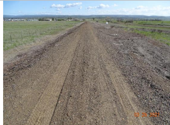
Top of Levee: View of levee crown looking upstream