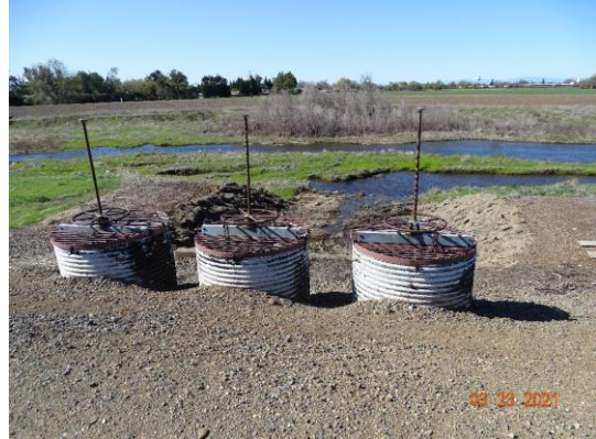
Water-Side: View of levee slope looking from crown. CMP riser with slide gate on levee shoulder