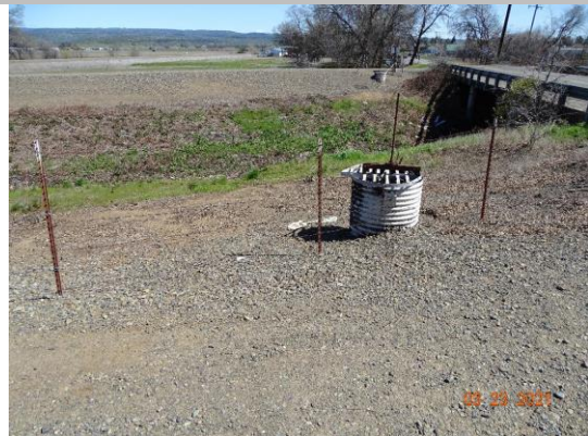
Water-Side: View of levee slope looking from crown. CMP riser with slide gate on levee slope