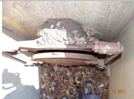
Water-Side: Gap visible between flap gate and pipe. Flap gate is unable to close tightly