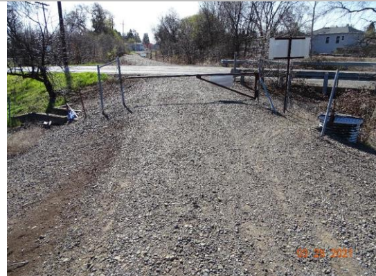
Top of Levee: View of levee crown looking upstream