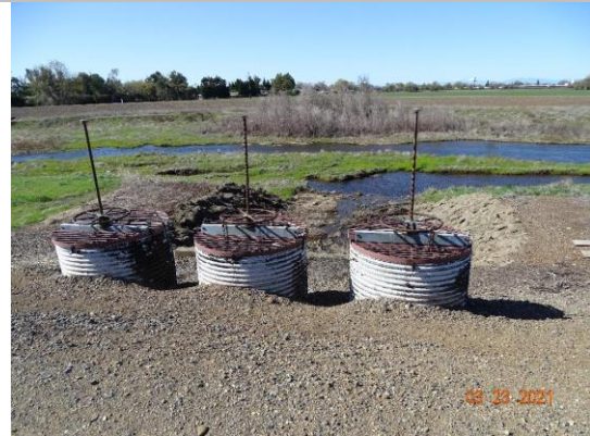
Water-Side: View of levee slope looking from crown. CMP riser with slide gate on levee shoulder