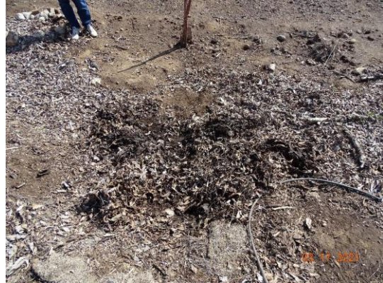
Land-Side: Approximate location on pipe inlet at levee toe, although inlet was not found