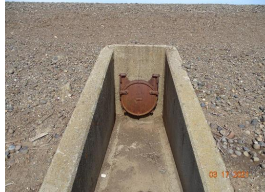
Water-Side: Headwall and flap gate at levee toe