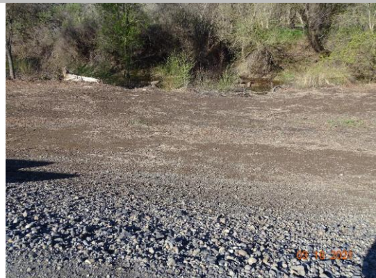
Water-Side: View of levee slope looking from crown