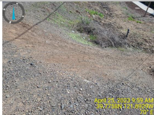
View of the erosion on the landside slope due to vehicle traffic. Spring 2023.