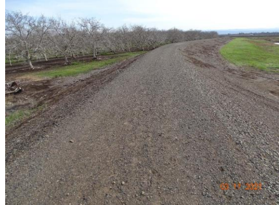
Top of Levee: View of levee crown looking upstream