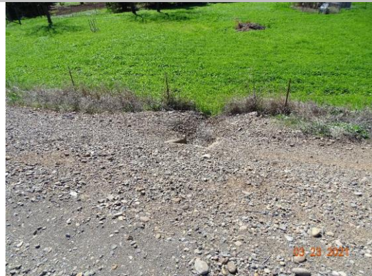
Land-Side: View of levee slope looking from crown