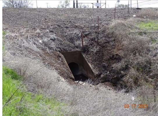
Land-Side: Headwall and pipe inlet in drainage ditch at levee toe