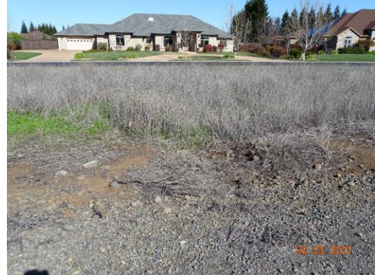
Land-Side: View of levee slope looking from crown