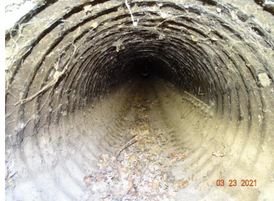
Land-Side: View inside of pipe looking from landside end