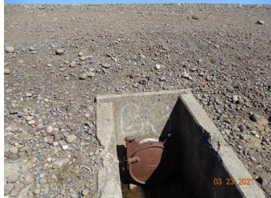
Water-Side: Levee slope, headwall and flap gate at levee toe