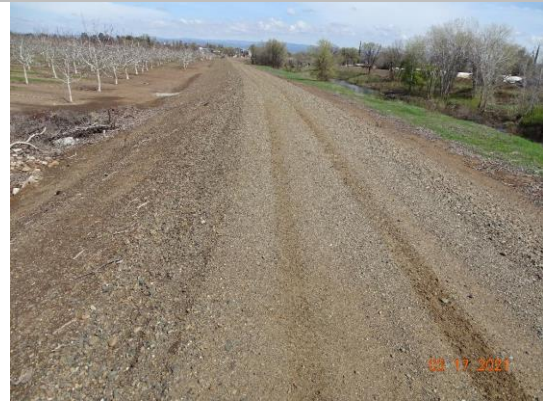
Top of Levee: View of levee crown looking upstream