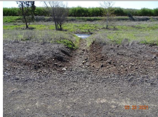
Water-Side: View of levee slope looking from crown. Valley on the slope may indicate pipe location