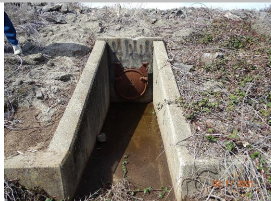
Water-Side: Headwall and flap gate on levee slope