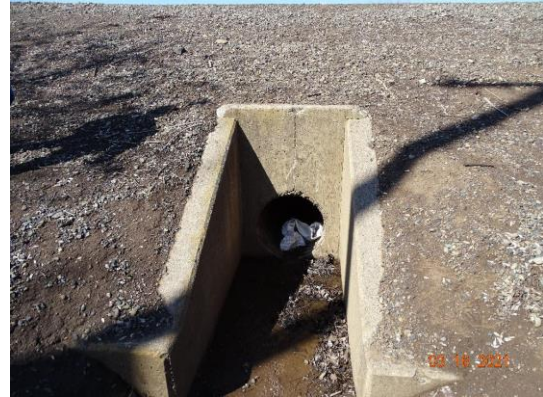
Land-Side: U-shaped headwall and pipe at levee toe