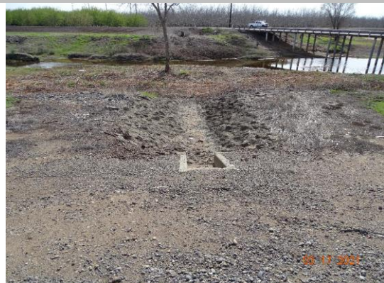
Water-Side: View of levee slope looking from crown