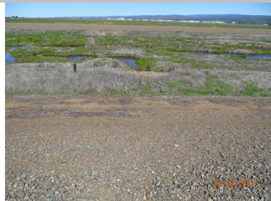
Water-Side: View of levee slope looking from crown