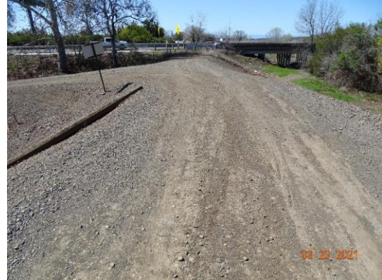
Top of Levee: View of levee crown looking downstream