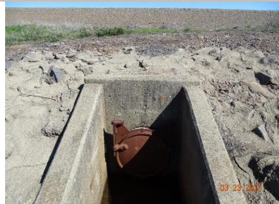
Water-Side: Headwall and flap gate at levee toe