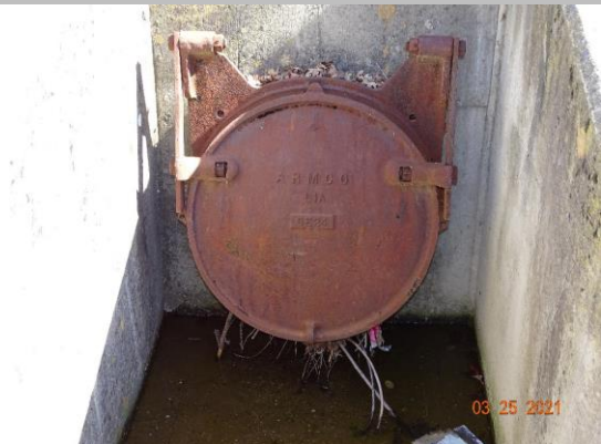
Water-Side: Headwall and flap gate at levee toe