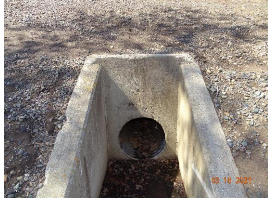
Land-Side: U-shaped headwall and pipe at levee toe