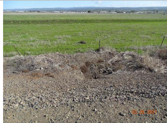
Land-Side: View of levee slope looking from crown