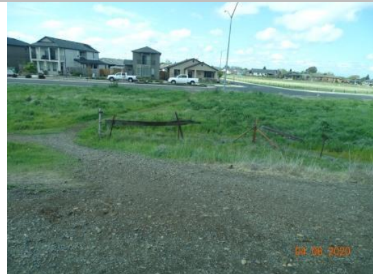
View of the landside slope erosion caused by foot traffic. Spring 2020.