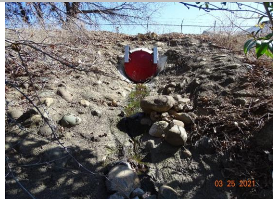
Water-Side: View of levee slope looking from toe. Flap gate installed on pipe end