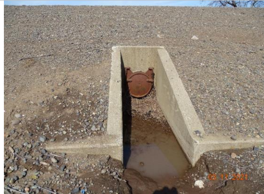
Water-Side: Headwall and flap gate at levee toe