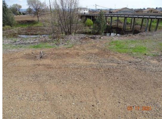
Water-Side: View of levee slope looking from crown