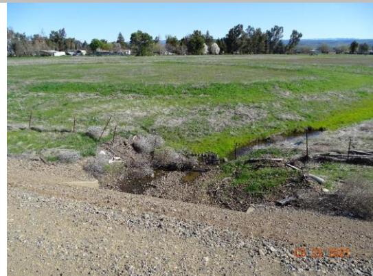
Land-Side: View of levee slope looking from crown