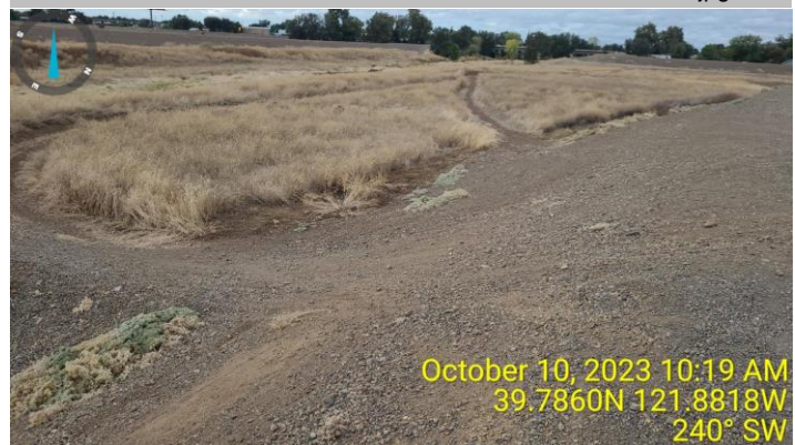
View of erosion on the waterside slope due to vehicle traffic. Fall 2023.