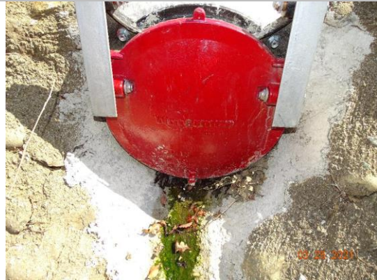
Water-Side: Close up view of flap gate on levee slope