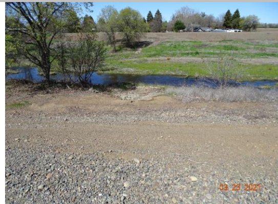
Water-Side: View of levee slope looking from crown