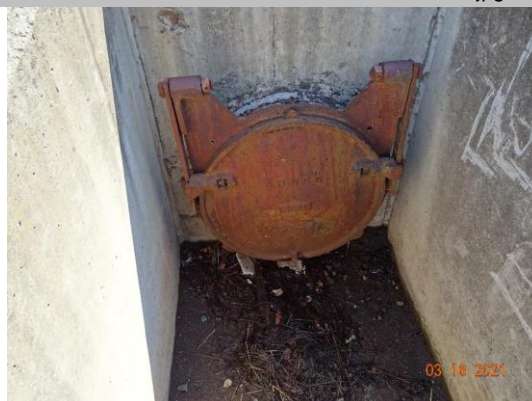
Water-Side: Headwall and flap gate at levee toe