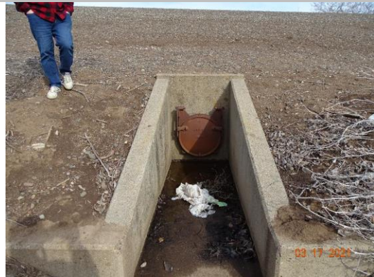
Water-Side: Headwall and flap gate at levee toe