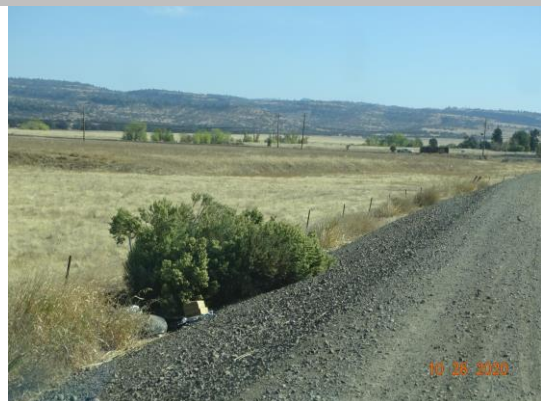
View of a bush along the landside slope. Fall 2020.