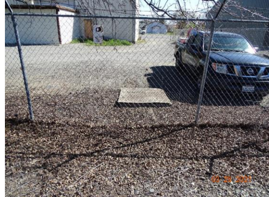
Land-Side: Fence on levee berm. Storm drain manhole covered with plywood sheet on levee berm