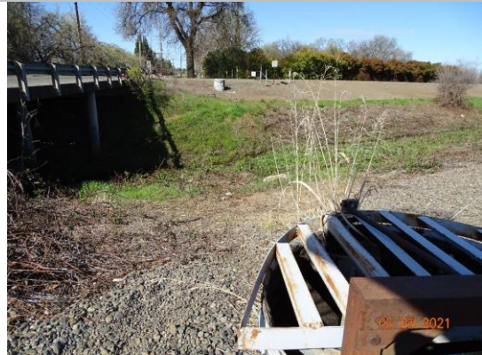
Water-Side: Detailed view of levee slope. Pipe outfall not visible on waterside. Crossing DSID 19288 on opposite side of levee