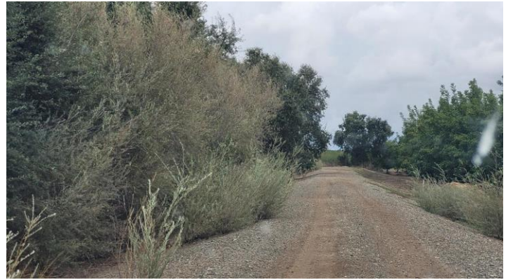
View of wild growth along the waterside slope. Fall 2023.