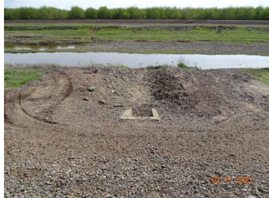
Water-Side: View of levee slope looking from crown