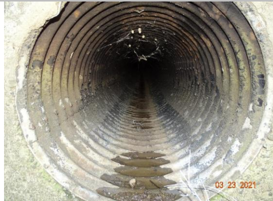
Land-Side: View inside of pipe looking from landside end