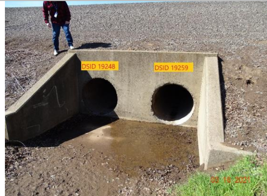
Land-Side: U-shaped headwall and pipe at levee toe