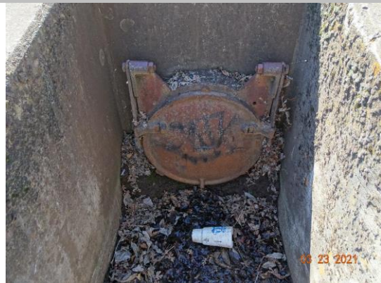
Water-Side: U-shaped headwall and flap gate at levee toe