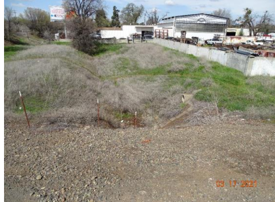
Land-Side: View of levee slope looking from crown. Drainage ditch on landside