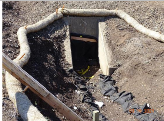
Land-Side: U-shaped headwall and covered pipe inlet at levee toe