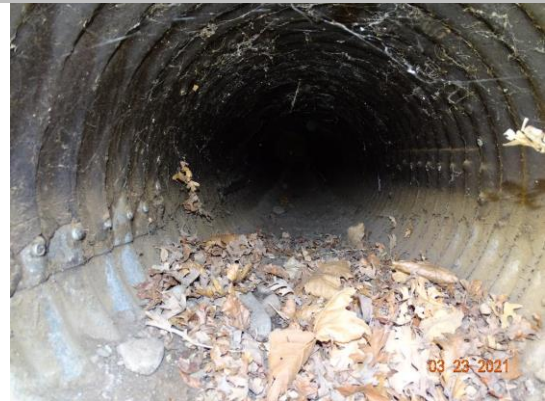
Water-Side: View inside of pipe looking from landside end