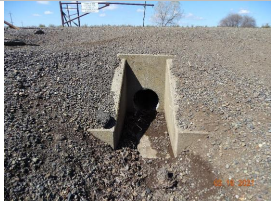
Land-Side: U-shaped headwall and pipe at levee toe