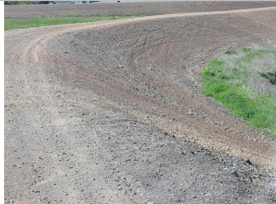
View of the damaged landside slope due to vehicle traffic. Spring 2022.