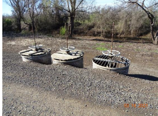
Water-Side: View of levee slope looking from crown. CMP riser with slide gate on levee shoulder