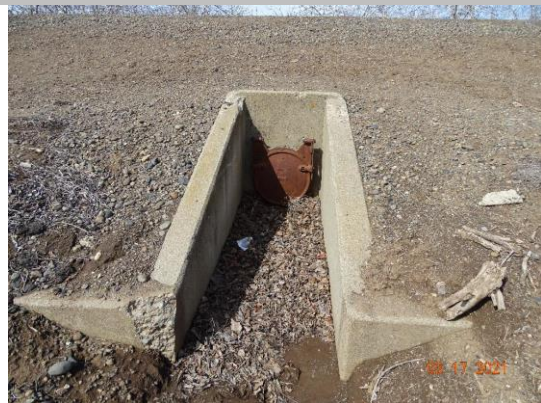
Water-Side: Headwall and flap gate at levee toe