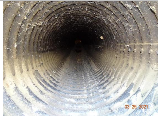
Land-Side: View inside of pipe looking from landside end