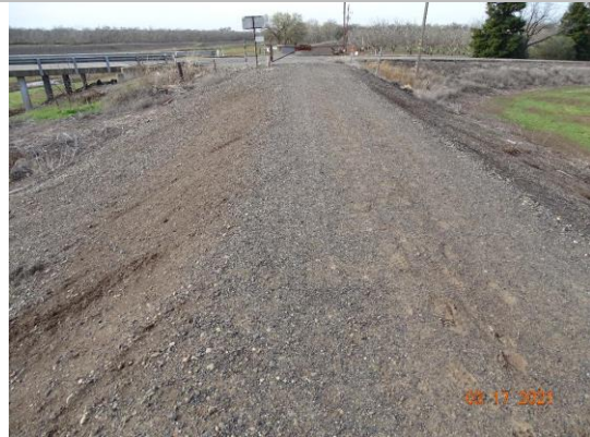
Top of Levee: View of levee crown looking downstream