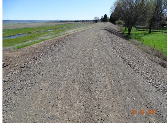
Top of Levee: View of levee crown looking upstream