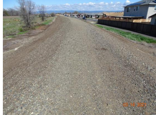
Top of Levee: View of levee crown looking upstream