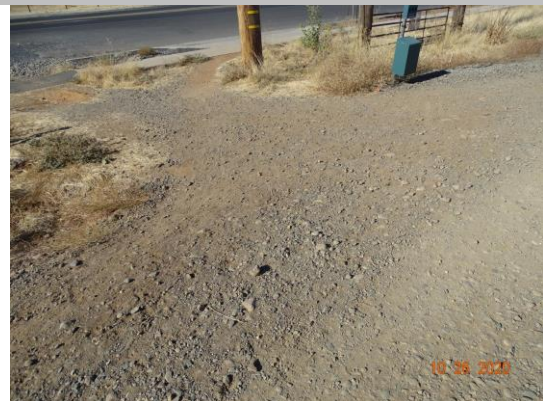
View of the damaged landside slope due to foot traffic. Fall 2020.