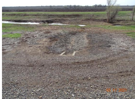
Water-Side: View of levee slope looking from crown