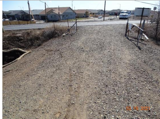
Top of Levee: View of levee crown looking downstream