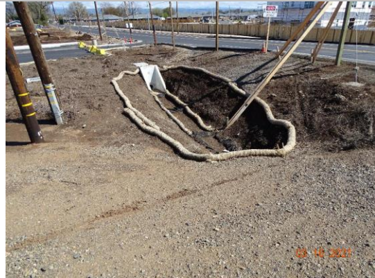
Land-Side: View of levee slope looking from crown. Newly constructed drainage on the berm