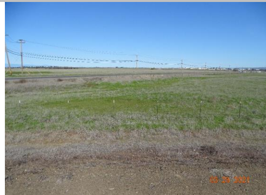
Land-Side: View of levee slope looking from crown