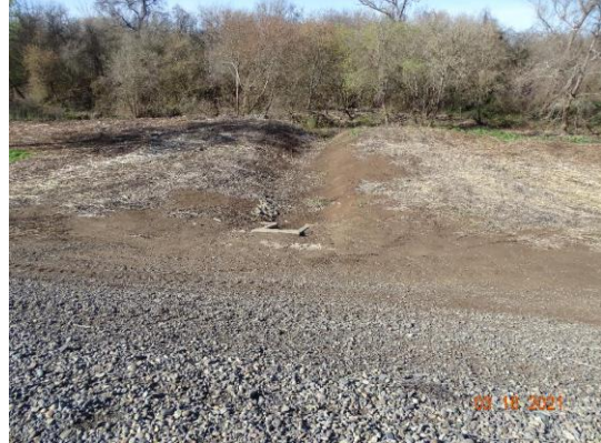
Water-Side: View of levee slope looking from crown