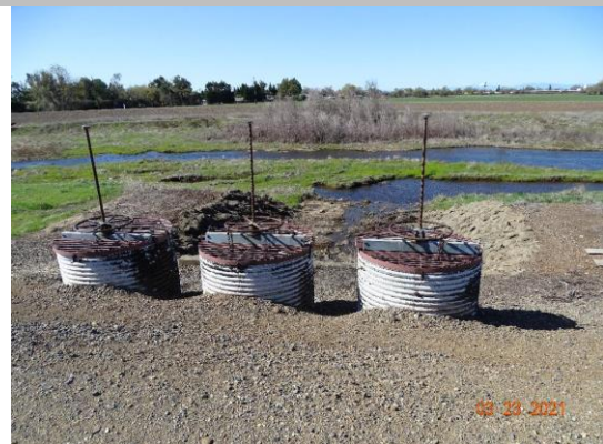
Water-Side: View of levee slope looking from crown. CMP riser with slide gate on levee shoulder