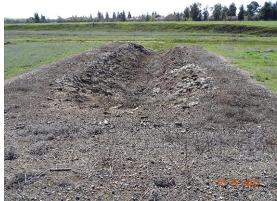
Water-Side: View of levee slope looking from crown