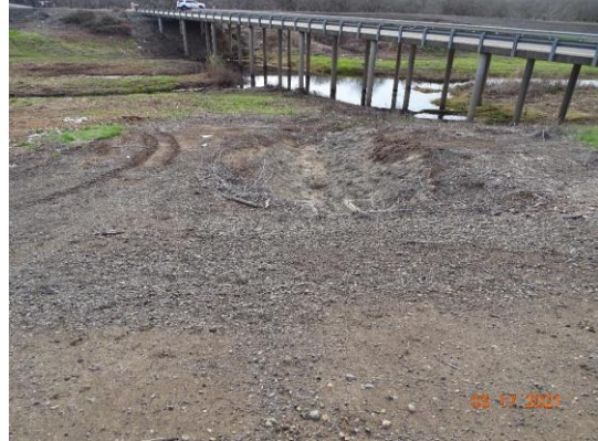
Water-Side: View of levee slope looking from crown