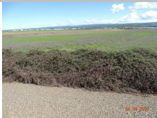
View of the wild growth at the landside toe. Spring 2019.