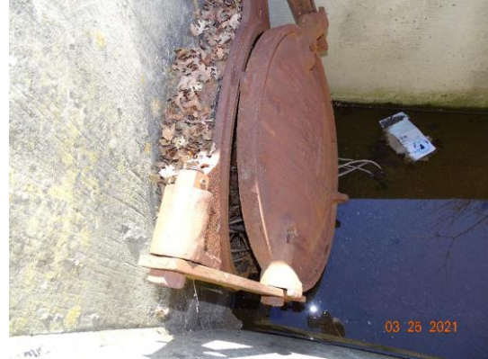
Water-Side: Debris inside of pipe blocks flap gate from complete closing