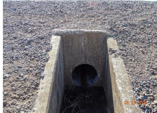
Land-Side: Levee slope, U-shaped headwall and pipe at levee toe