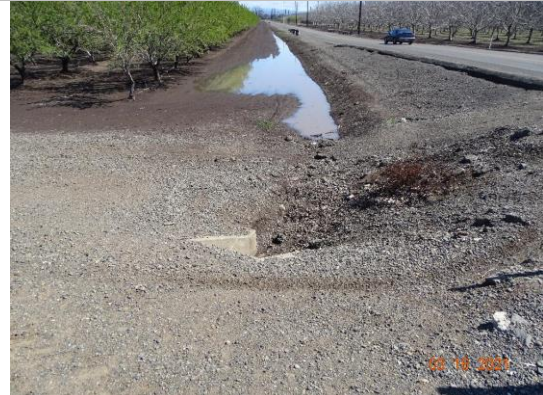
Land-Side: View of levee slope looking from crown