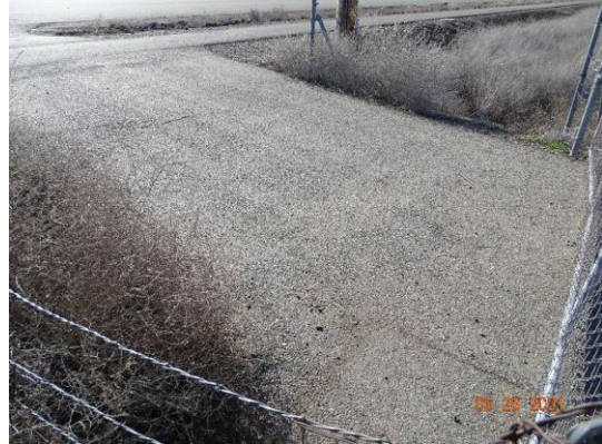
Top of Levee: View of levee crown looking upstream