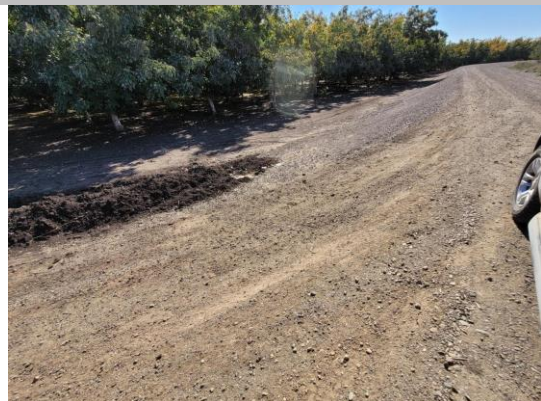
View of the damaged landside slope due to vehicle traffic. Fall 2022.