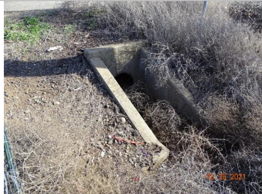
Land-Side: U-shaped headwall and pipe at levee toe