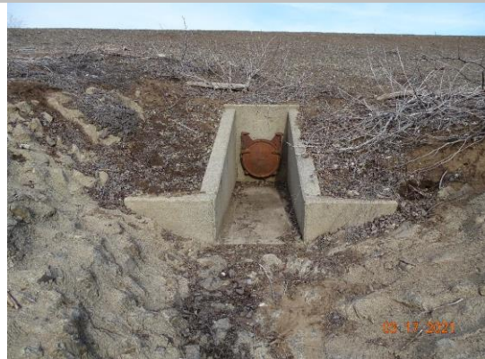
Water-Side: Headwall and flap gate at levee toe