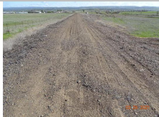
Top of Levee: View of levee crown looking upstream