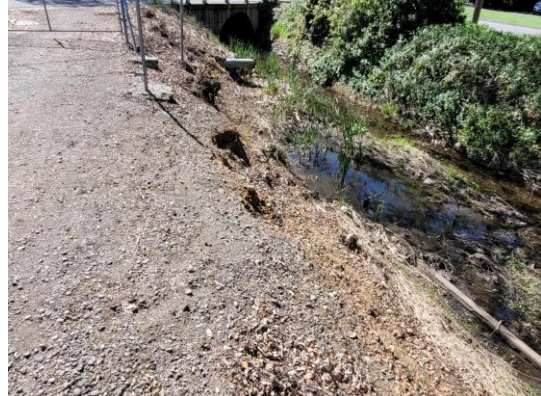
View of the erosion along the waterside slope. Spring 2022.