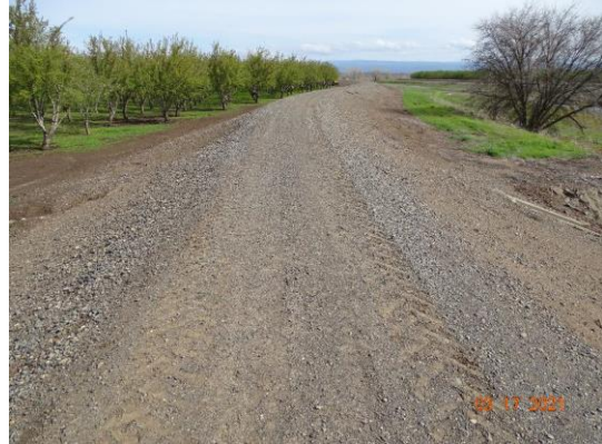
Top of Levee: View of levee crown looking upstream