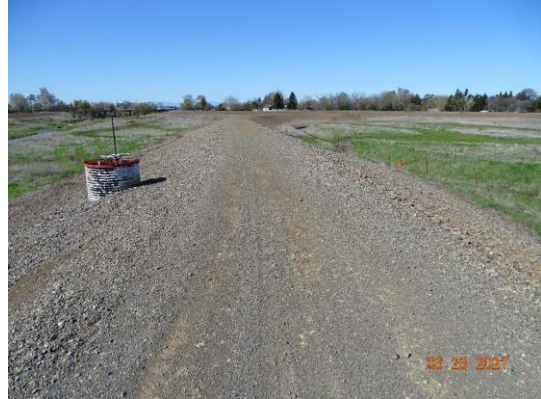
Top of Levee: View of levee crown looking downstream