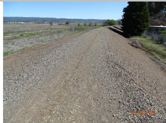
Top of Levee: View of levee crown looking upstream