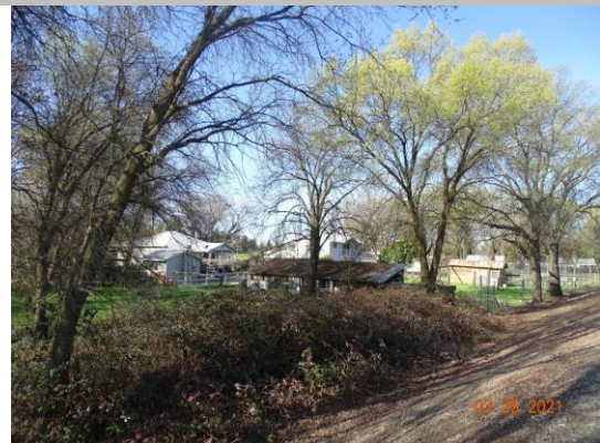
View of the blackberry bushes along the landside toe. Spring 2021.