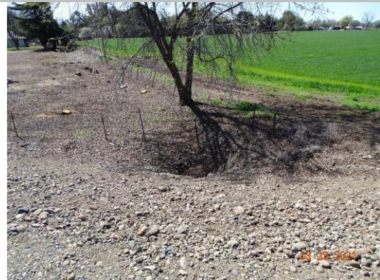
Land-Side: View of levee slope looking from crown