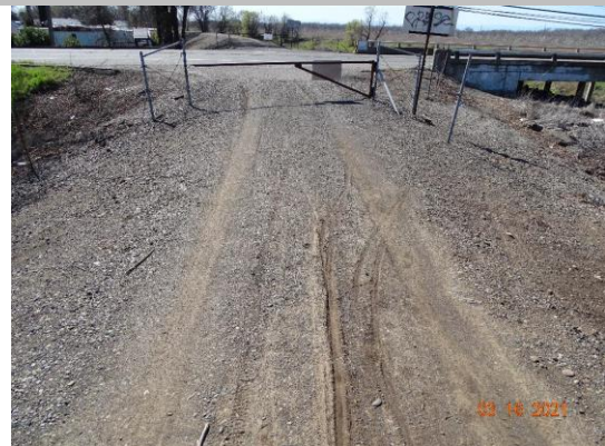
Top of Levee: View of levee crown looking downstream