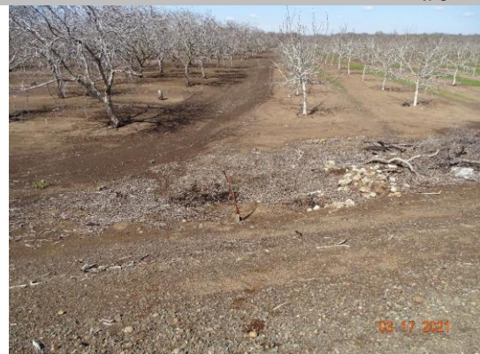
Land-Side: View of levee slope looking from crown