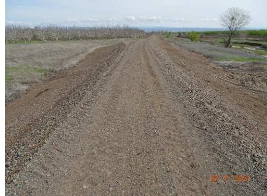
Top of Levee: View of levee crown looking upstream