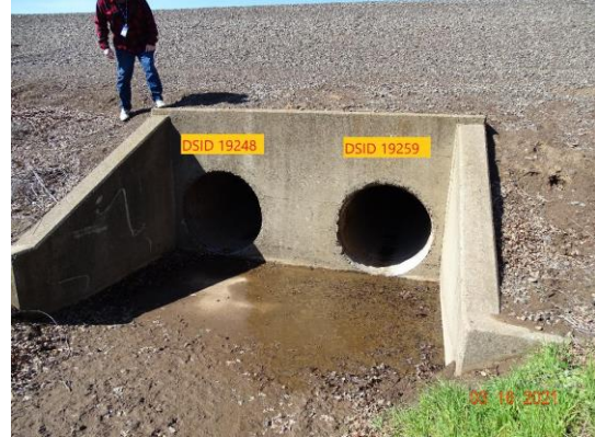
Land-Side: U-shaped headwall and pipe at levee toe