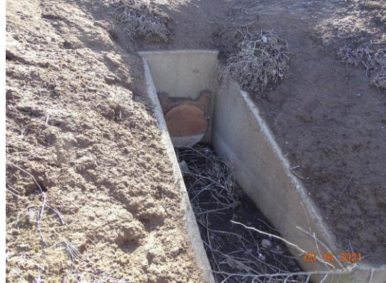
Water-Side: Headwall and flap gate at levee toe