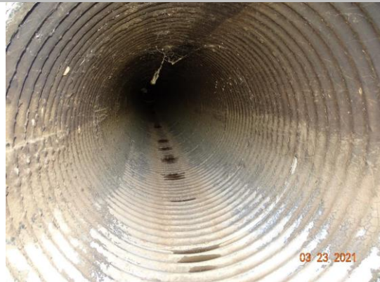
Land-Side: View inside of pipe looking from landside end