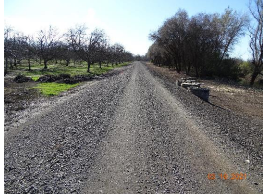
Top of Levee: View of levee crown looking downstream