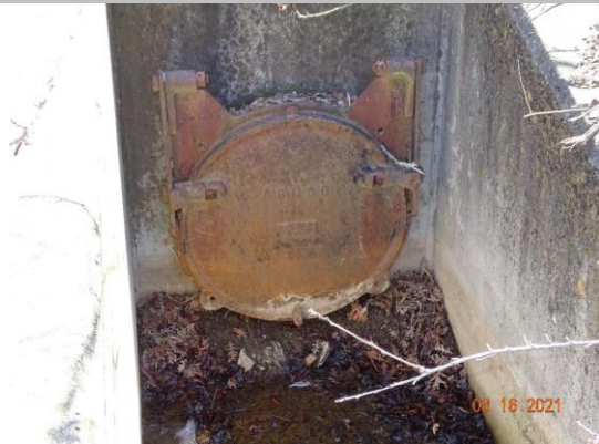
Water-Side: Headwall and flap gate at levee toe