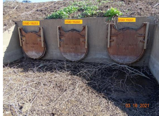
Water-Side: Headwall and flap gate at levee toe