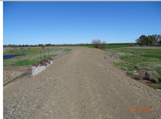
Top of Levee: View of levee crown looking downstream