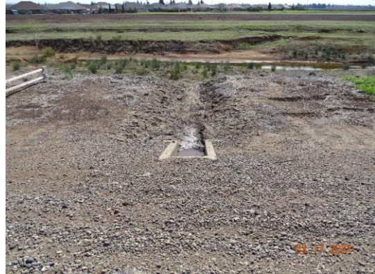
Water-Side: View of levee slope looking from crown