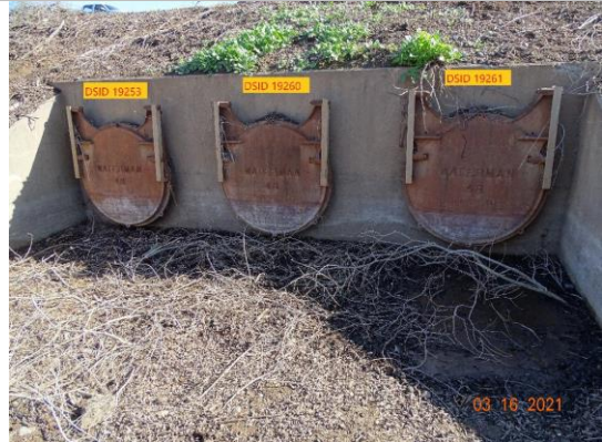
Water-Side: Headwall and flap gate at levee toe