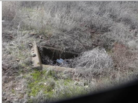
LS view: U type concrete headwall and pipe on levee slope. Soil/mud on inlet box. Vegetation debris blocking inlet box.