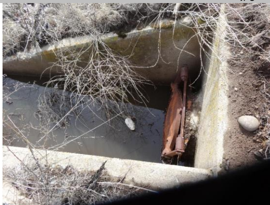
WS view: U type concrete headwall, pipe, and flapgate on levee slope. Soil/mud on outlet box. Vegetation debris blocking outlet box.