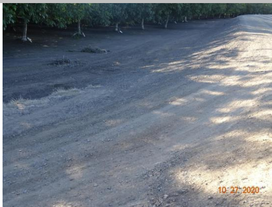
View of the damaged landside slope due to vehicle traffic. Fall 2020.