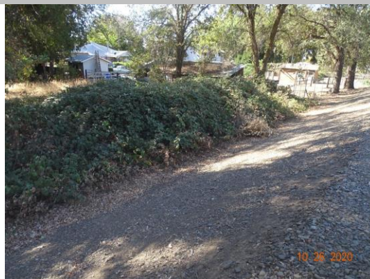
View of the blackberry bushes along the landside toe. Fall 2020.