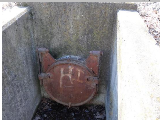
WS view: U type concrete headwall and CMP on levee slope. Soil/mud on outlet box. Needs cleaning and clearing.