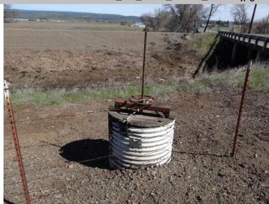
WS view: slide gate in CMP riser on waterside. No access to CMP riser.