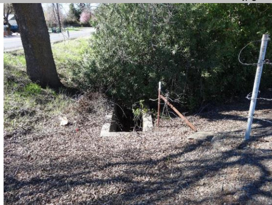
LS view: U type concrete headwall of CMP culvert on levee slope. Vegetation debris and mud on inlet box.