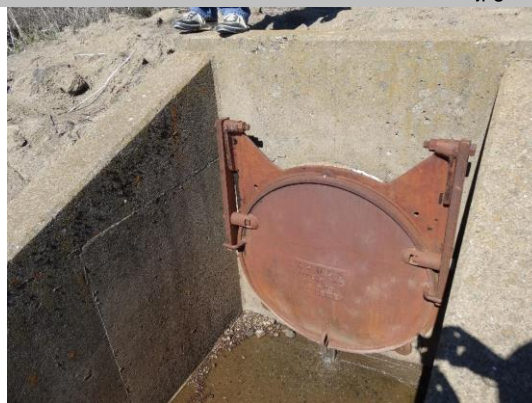
WS view: U type concrete headwall, pipe, and flapgate on levee slope.