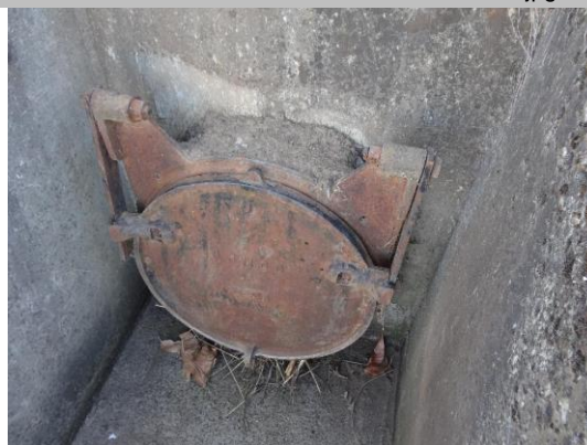
WS view: U type concrete headwall, pipe, and flapgate on levee slope.