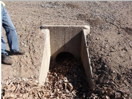
LS view: U type concrete headwall and CMP on levee slope. Vegetation debris blocking the inlet.