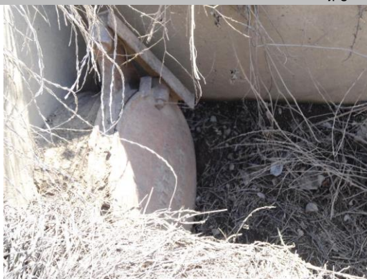
WS view: U type concrete headwall, pipe, and flapgate on levee slope. Soil/mud on outlet box. Vegetation debris blocking outlet box