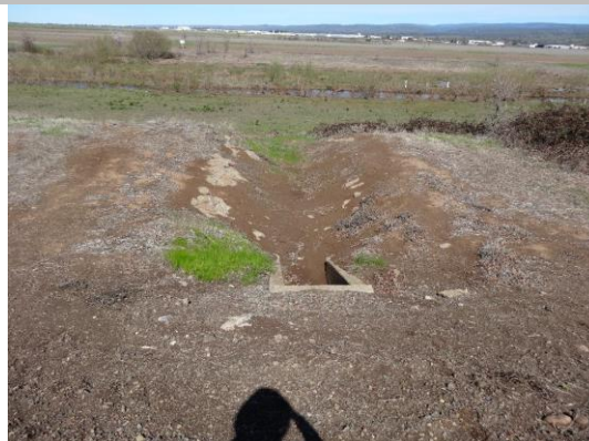
WS view: concrete headwall and grouted riprap spillway on levee slope.