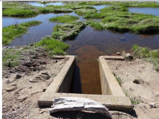
WS view: U type concrete headwall and grouted riprap on levee slope.