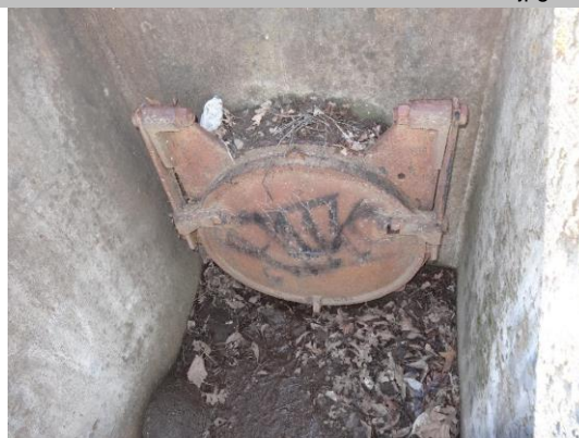
WS view: U type concrete headwall and CMP on levee slope. Vegetation debris and mud on outlet box. Needs cleaning and clearing.