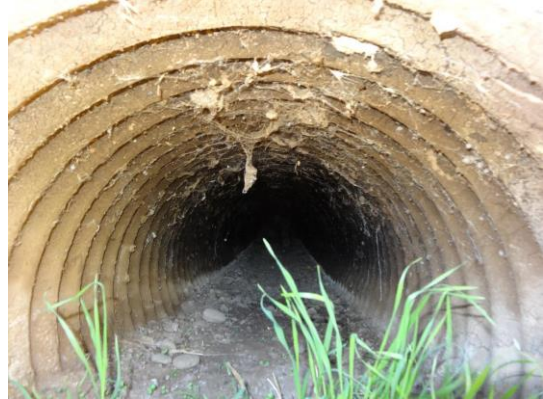
LS view: inside view of CMP on levee slope. Needs cleaning and clearing.