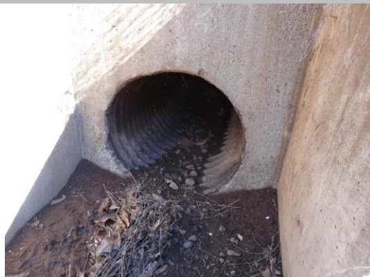
LS view: U type concrete headwall and CMP on levee slope. Needs cleaning and clearing of debris.