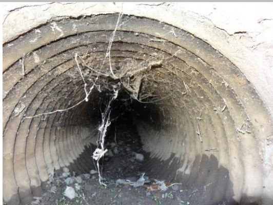
LS view: inside view of CMP on levee slope. Needs cleaning and clearing.