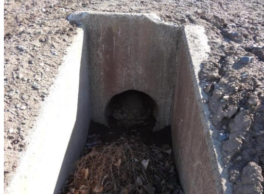
LS view: U type concrete headwall and CMP on levee slope.