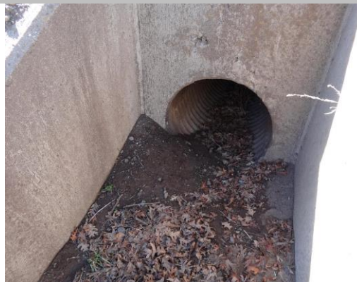
LS view: U type concrete headwall and CMP on levee slope. Debris and soil in inlet box.