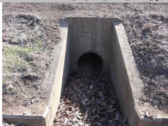
LS view: U typed concrete headwall and CMP on levee slope.