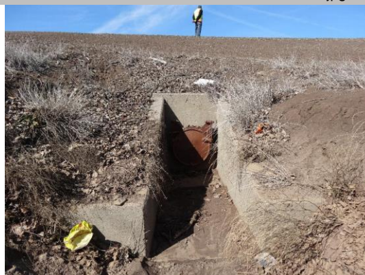
WS view: U typed concrete headwall, flapgate on levee slope.