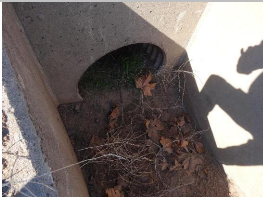
LS view: U type concrete headwall and CMP on levee slope.