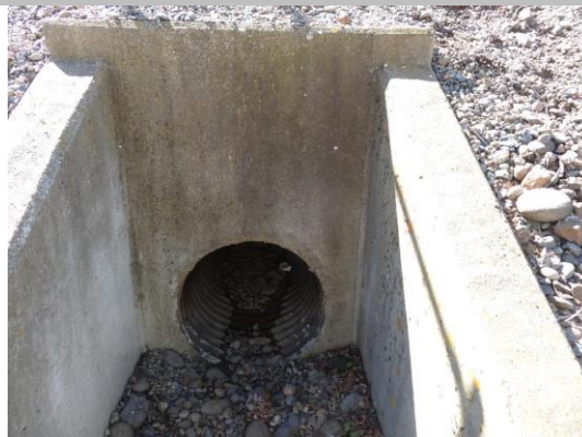
LS view: U type concrete headwall and CMP on levee slope. Pebbles and mud on inlet box.