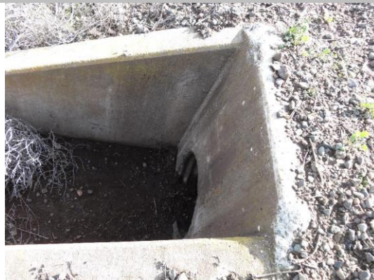
LS view: U type concrete headwall and CMP on levee slope. Soil/mud on inlet box.