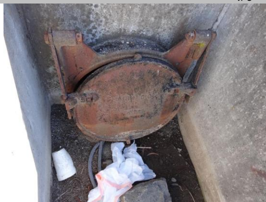
WS view: U type concrete headwall, pipe, and flapgate on levee slope. Debris in outlet box.