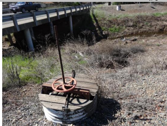
WS view: slide gate in CMP riser on waterside shoulder.