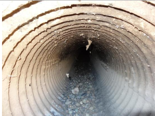
LS view: inside view of CMP on levee slope. Needs cleaning and clearing.