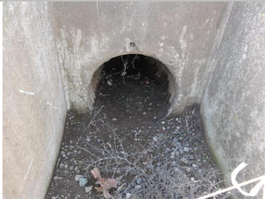
LS view: U type concrete headwall and CMP on levee slope. Soil/mud on inlet box.