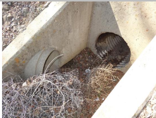
LS view: U type concrete headwall and CMP on levee slope. Vegetation debris and soil in inlet area.