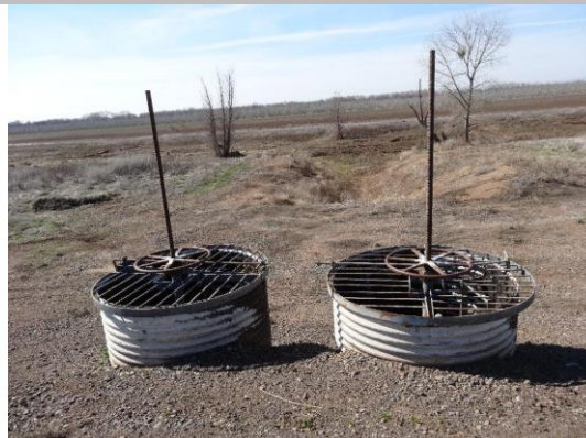
WS view: slide gates in CMP risers on levee slope.