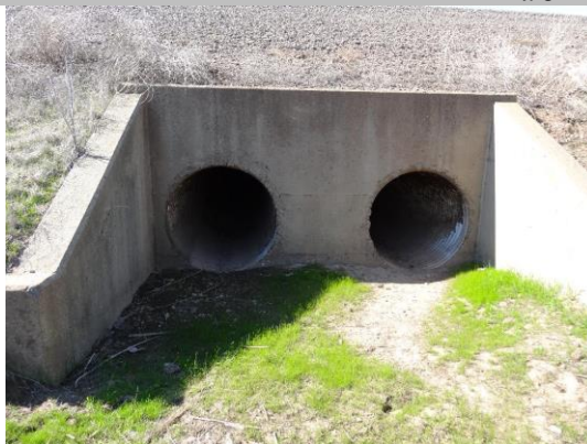
LS view: U type concrete headwall and CMPs on levee slope. Soil/mud on inlet box.