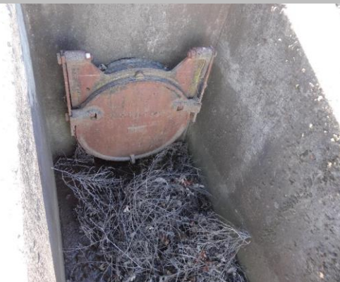
WS view: U type concrete headwall and CMP on levee slope. Mud and vegetation debris on outlet box.