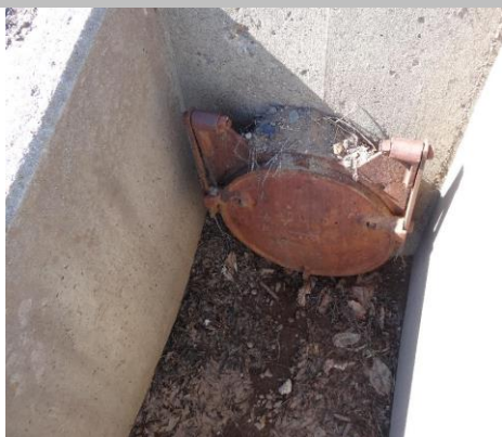
WS view: U type concrete headwall, flapgate on levee slope.