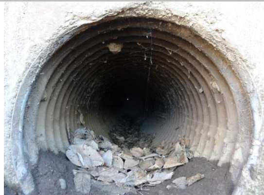
LS view: inside view of CMP on levee slope. Needs cleaning and clearing.