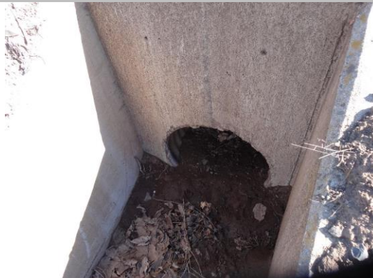
LS view: U type concrete headwall and CMP on levee slope.