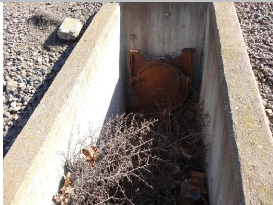
WS view: U type concrete headwall, pipe, and flapgate on levee slope. Vegetation debris blocking outlet.