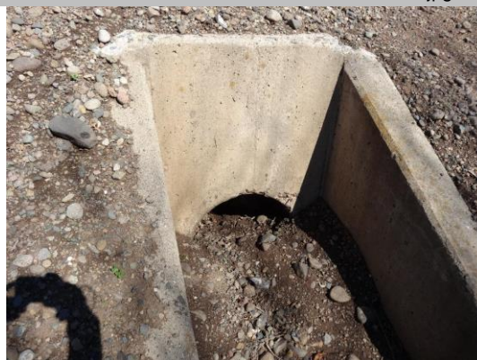
LS view: U type concrete headwall and CMP on levee slope. Vegetation debris and mud in pipe and inlet box.