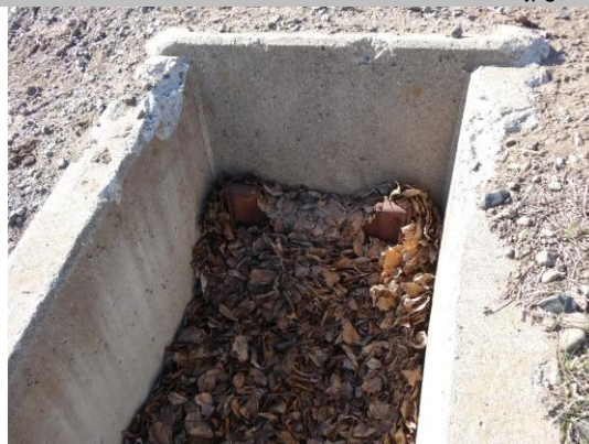
WS view: U type concrete headwall, flapgate on levee slope. Vegetation debris blocking the outlet.