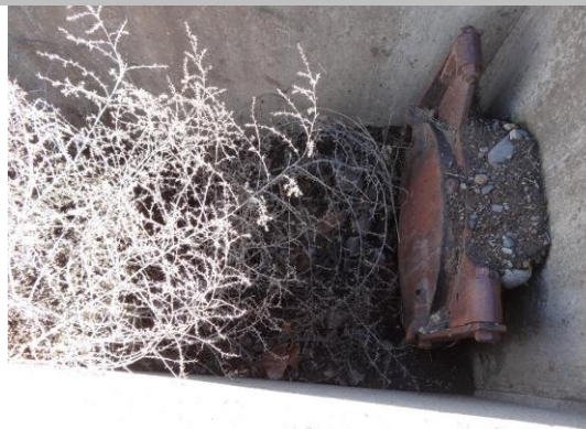
WS view: U type concrete headwall and CMP on levee slope. Vegetation debris and mud on outlet box. Needs cleaning and clearing.