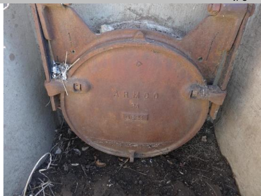
WS view: U type concrete headwall, pipe, and flapgate on levee slope. Soil/mud on outlet box.