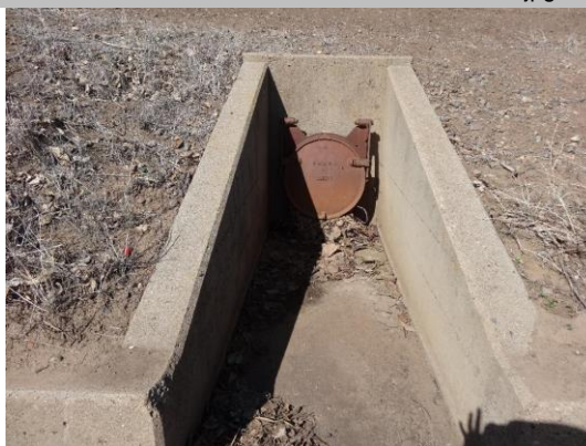
WS view: U typed concrete headwall, pipe, and flapgate on levee slope.