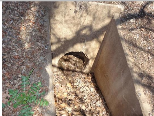
LS view: U type concrete headwall and CMP on levee slope. Vegetation debris and mud on inlet box.