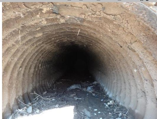
LS view: inside view of CMP on levee slope. Needs cleaning and clearing.