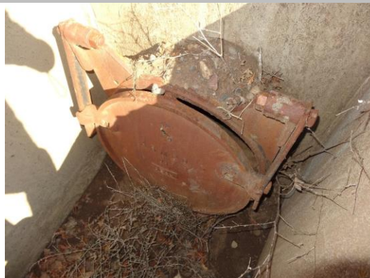
WS view: U type concrete headwall, pipe, and flapgate on levee slope. Gate not fully closed. Debris and soil in outlet box.