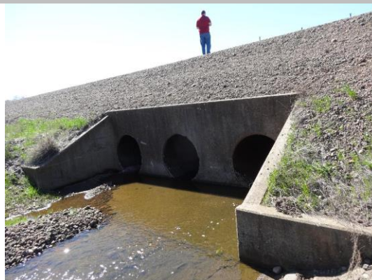
LS view: U type concrete headwall and three CMPs on levee slope. Soil/mud on inlet box.