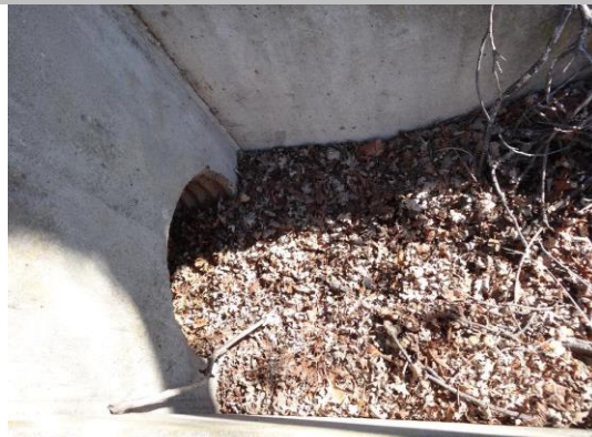
LS view: U type concrete headwall and CMP on levee slope. Vegetation and mud on inlet box.