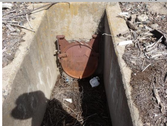
WS view: U type concrete headwall, pipe, and flapgate on levee slope. Soil/mud on outlet box. Vegetation debris blocking outlet box.