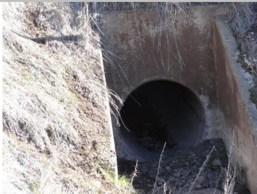
LS view: U type concrete headwall and CMP on levee slope.