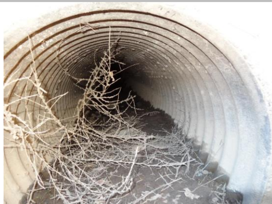
LS view: inside view of CMP on levee slope. Needs cleaning and clearing.