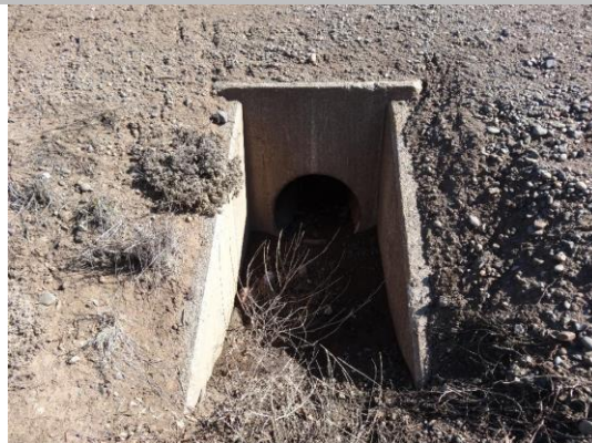
LS view: U type concrete headwall and CMP on levee slope. Debris blocking the inlet pipe.