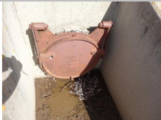
WS view: U type concrete headwall and CMP on levee slope.