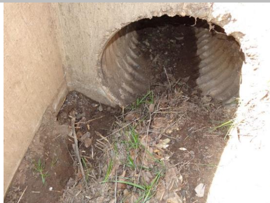
LS view: U type concrete headwall and CMP on levee slope.