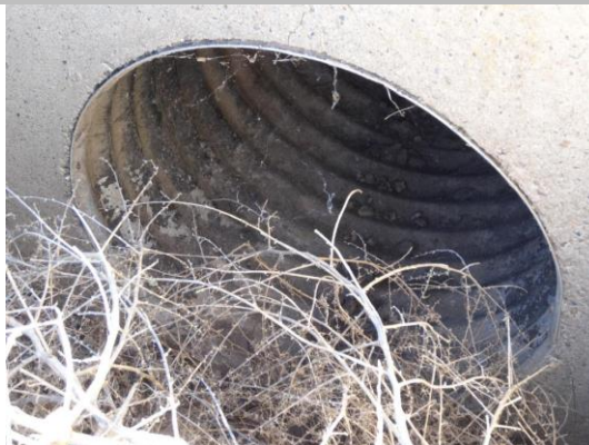
LS view: inside view of CMP on levee slope. Needs cleaning and clearing.