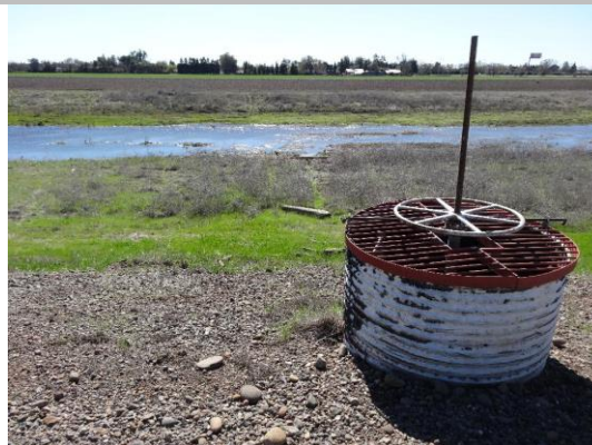
WS view: slide gate in CMP riser on waterside shoulder.