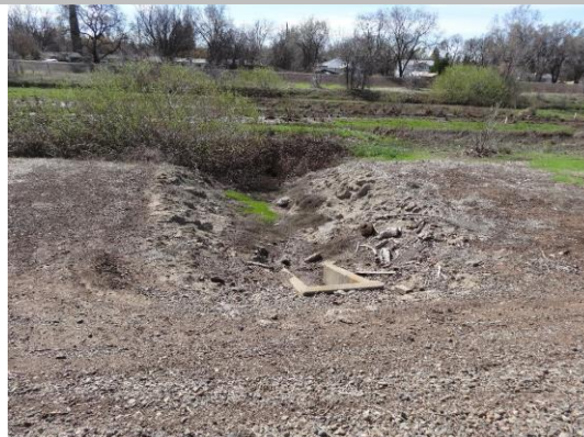
WS view: U type concrete headwall and grouted riprap spillway on levee slope.