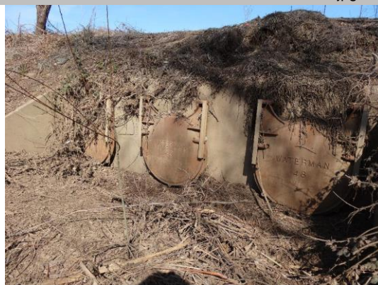
WS view: U type concrete headwall, pipes, and flapgates on levee slope. Soil/mud on outlet box. Vegetation debris blocking outlet box