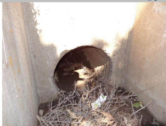
LS view: U type concrete headwall and CMP on levee slope. Vegetation debris and mud in inlet box.