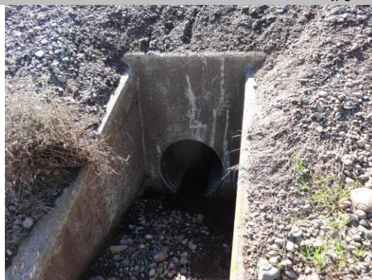
LS view: U type concrete headwall and CMP on levee slope.