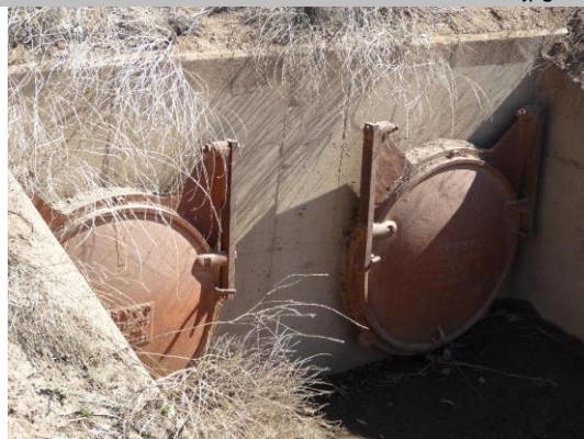
WS view: U type concrete headwall, pipes, and flapgates on levee slope. Vegetation debris on outlet box.