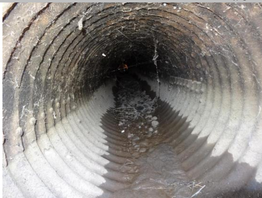
LS view: inside view of CMP on levee slope. Needs cleaning and clearing.