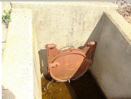
WS view: U type concrete headwall, flapgate, and CMP on levee slope.