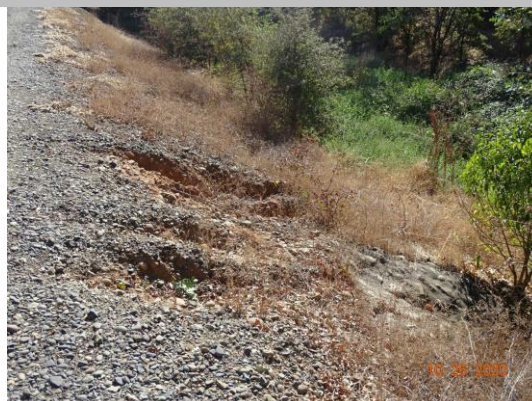
View of the erosion on the waterside slope. Fall 2020.