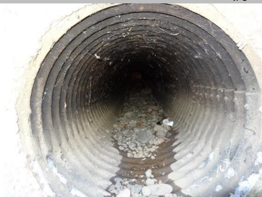
LS view: inside view of the CM pipe. Needs cleaning and clearing the pipe.