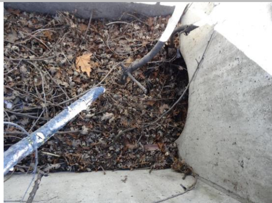
LS view: close view of vegetation debris and mud on inlet box.