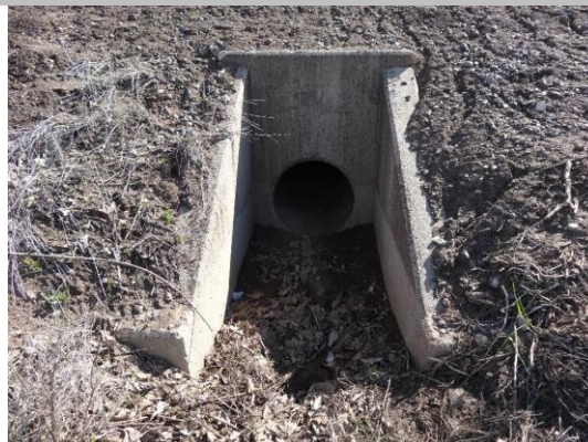
LS view: U typed concrete headwall, CMP on levee slope.