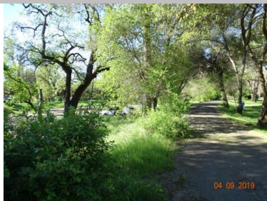
View of the wild growth on the landside slope. Spring 2019.