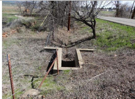
LS view: U type concrete headwall and CMP on levee slope. Vegetation debris and mud on inlet box.