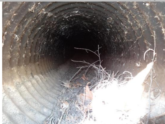
LS view: inside view of CMP on levee slope. Needs cleaning and clearing.