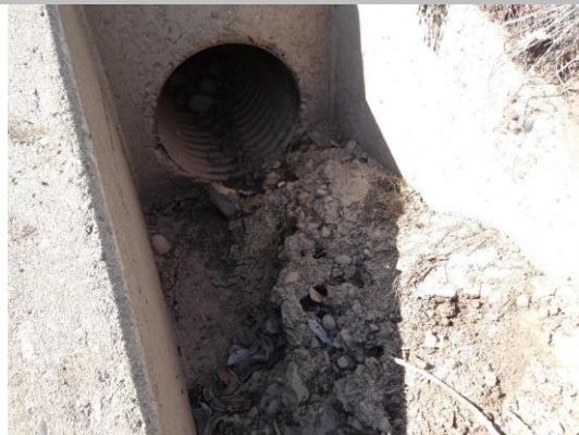
LS view: U type concrete headwall and CMP on levee slope. Soil/mud on inlet box.