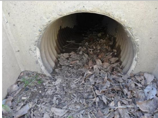
LS view: U type concrete headwall and CMP on levee slope. Soil/mud and vegetation on inlet box.