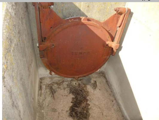
WS view: U type concrete headwall, pipe, and flapgate on levee slope.