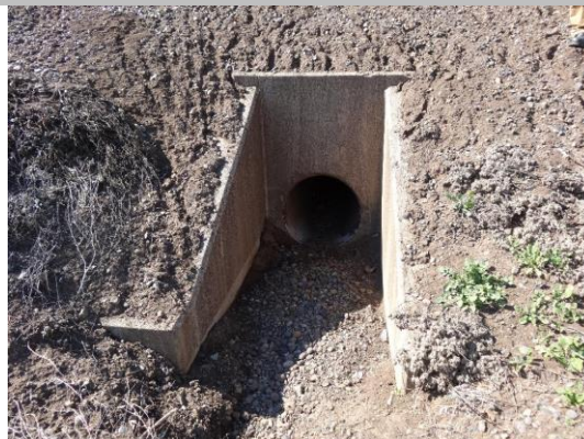
LS view: U type concrete headwall and CMP on levee slope.