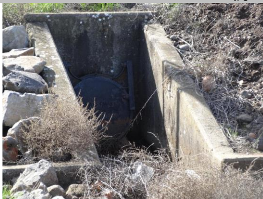
WS view: concrete headwall, pipe, and flapgate on levee slope. Vegetation and mud on outlet box.