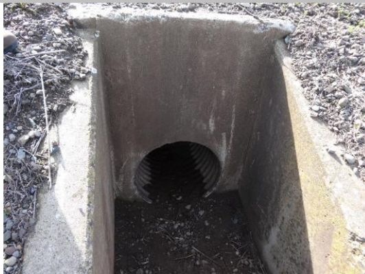
LS view: U type concrete headwall and CMP on levee slope. Soil/mud on inlet box.