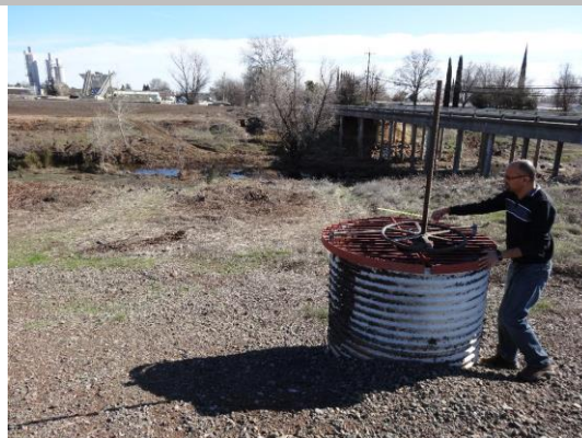
WS view: CM standpipe with slide gate on levee slope.