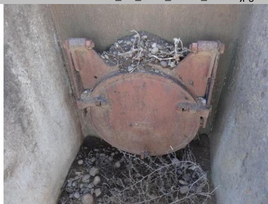
WS view: U type concrete headwall and CMP on levee slope. Vegetation debris and mud in outlet box. Needs cleaning and clearing.