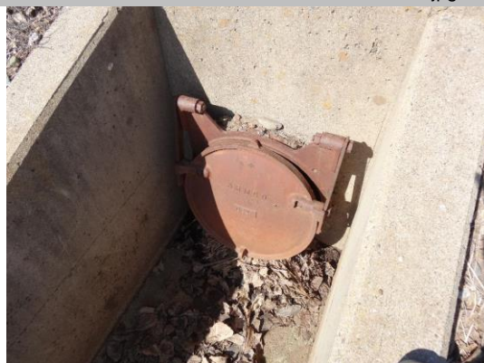
WS view: vegetation debris blocking outlet.