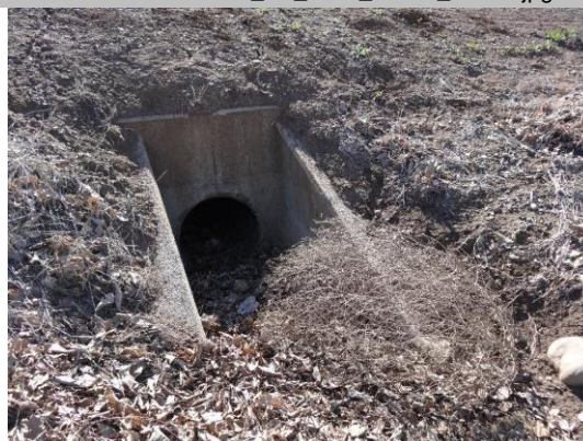
LS view: U type concrete headwall and CMP on levee slope. Vegetation debris blocking inlet.