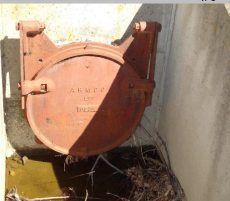
WS view: U type concrete headwall and CMP on levee slope. Vegetation debris and mud on outlet box. Needs cleaning and clearing.