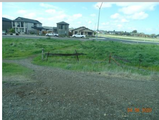
View of the landside slope erosion caused by foot traffic. Spring 2020.