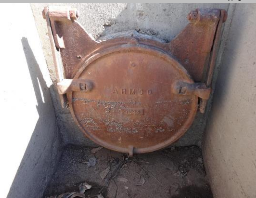
WS view: U type concrete headwall, pipe, and flapgate on levee slope.