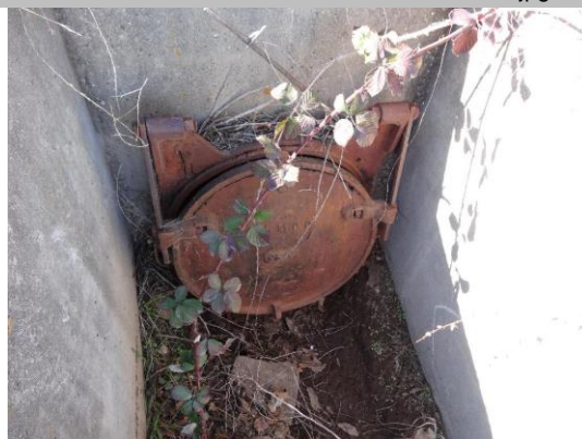
WS view: U type concrete headwall, pipe, and flapgate on levee slope. Vegetation debris blocking outlet.