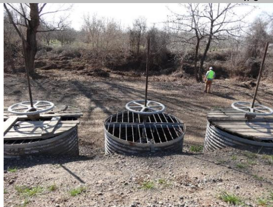
WS view: slide gates in CMP risers on waterside shoulder.