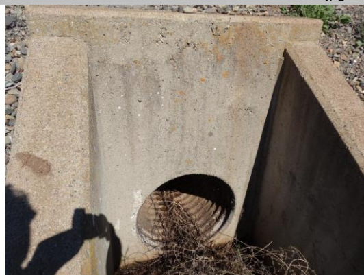
LS view: U type concrete headwall and CMP on levee slope. Vegetation debris on inlet box.