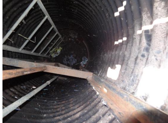
WS view: inside view of slide gate in CMP riser on waterside shoulder. Debris trapped in the riser.