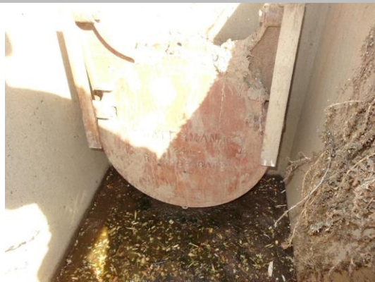
WS view: U type concrete headwall, pipe, and flapgate on levee slope. Soil/mud on outlet box.