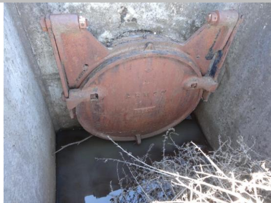
WS view: U type concrete headwall, pipe, and flapgate on levee slope. Vegetation debris on outlet box.