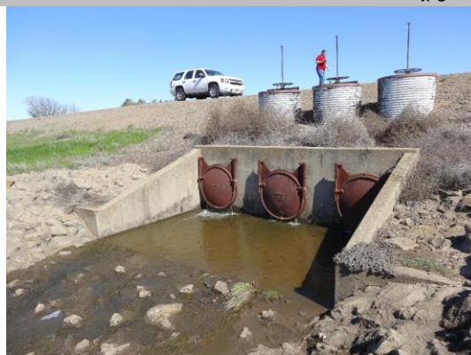
WS view: U type concrete headwall and three CMPs with slide gates on levee slope. Grouted riprap spillway.