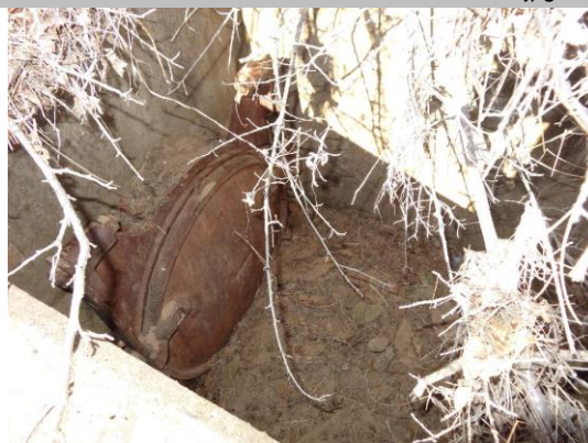
WS view: U type concrete headwall, pipe, and flapgate on levee slope. Vegetation/soil debris blocking outlet.