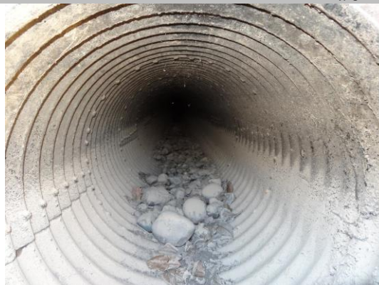
LS view: inside view of CMP on levee slope. Needs cleaning and clearing.