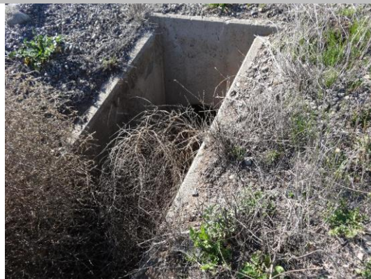
LS view: U type concrete headwall and CMP on levee slope. Vegetation debris and soil blocking inlet.