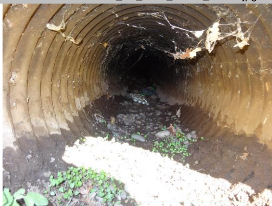
LS view: inside view of CMP on levee slope. Needs cleaning and clearing.