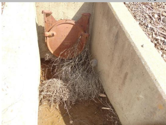
WS view: U type concrete headwall, flapgate, and CMP on levee slope. Needs cleaning and clearing.