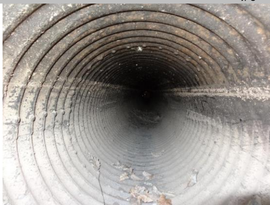
LS view: inside view of CMP on levee slope. Looks clean and clear.