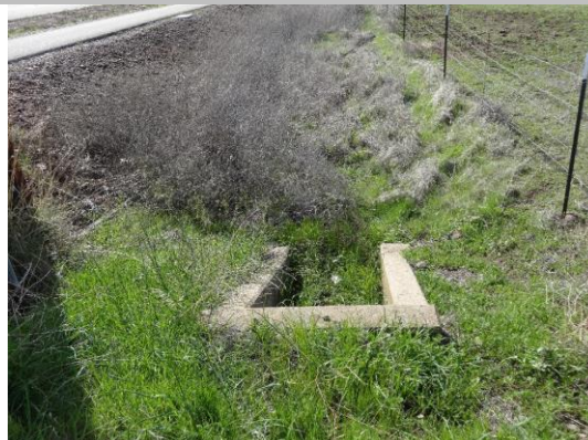
LS view: U type concrete headwall of CMP culvert on levee slope. Vegetation on inlet box.