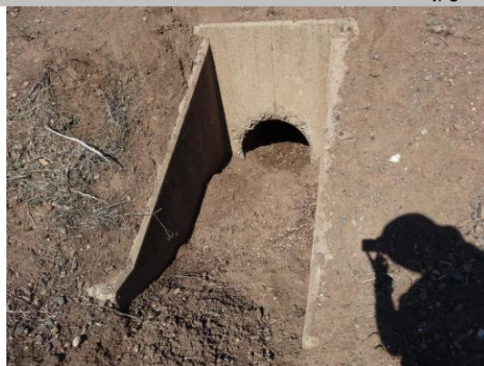
LS view: U type concrete headwall and CMP on levee slope. Soil/mud on inlet box.