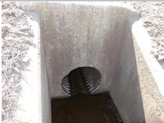
LS view: U type concrete headwall and CMP on levee slope. Looks clean and clear.