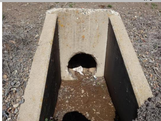
LS view: U type concrete headwall and CMP on levee slope. Mud and pebbles on inlet box.