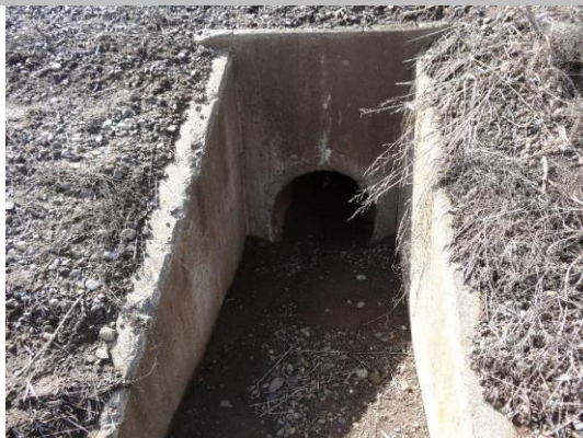
LS view: U type concrete headwall and CMP on levee slope. Soil/mud on inlet box.