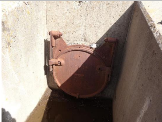
WS view: U type concrete headwall, pipe, and flapgate on levee slope. Soil/mud on outlet box.