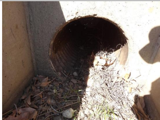
LS view: U type concrete headwall and CMP on levee slope. Vegetation debris in inlet pipe.