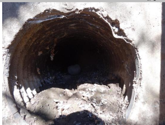
LS view: inside view of CMP on levee slope. Needs cleaning and clearing.