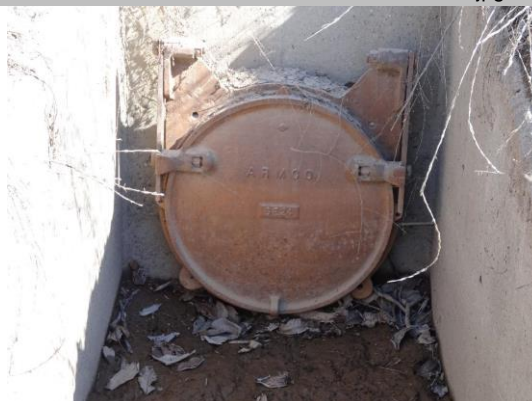
WS view: U type concrete headwall, pipe, and flapgate on levee slope. Soil/mud on outlet box.