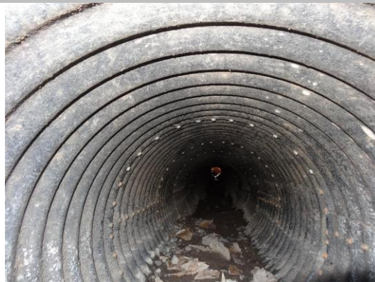
LS view: inside view of CMP on levee slope. Needs cleaning and clearing.