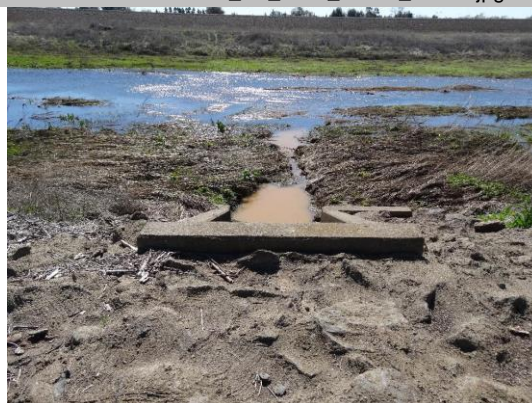
WS view: U type concrete headwall of CMP culvert on levee slope. Grouted riprap levee slope and spillway.