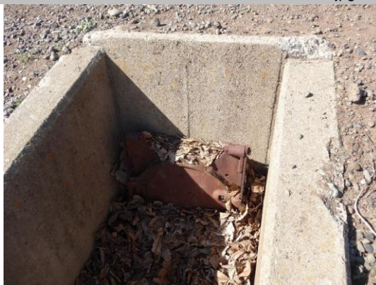
WS view: U type concrete headwall, pipe, and flapgate on levee slope. Vegetation debris blocking outlet.