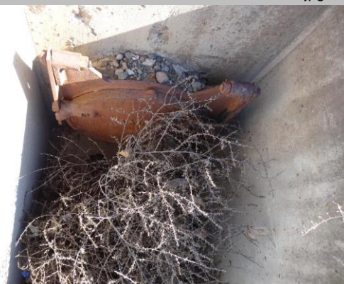
WS view: U type concrete headwall, pipe, and flapgate on levee slope. Vegetation debris and soil blocking outlet.