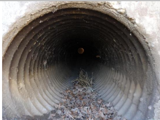
LS view: inside view of CMP on levee slope. Needs cleaning and clearing.