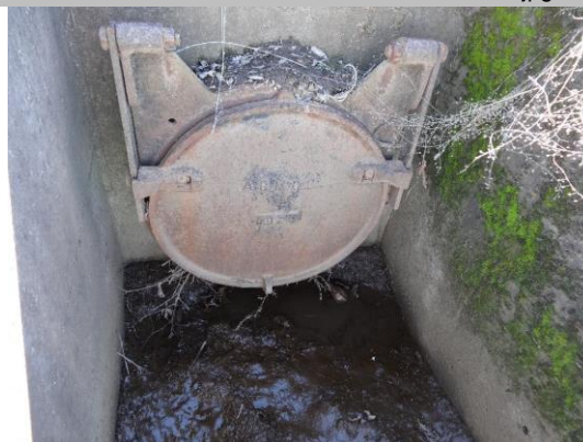
WS view: U type concrete headwall and CMP on levee slope. Vegetation debris and mud in outlet box. Needs cleaning and clearing.