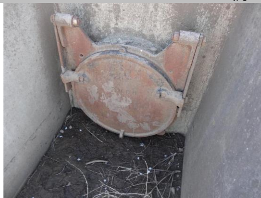
WS view: U type concrete headwall, pipe, and flapgate on levee slope. Soil/mud on outlet box.