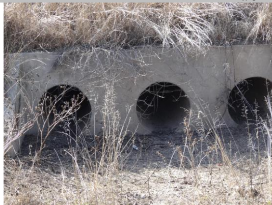
LS view: U type concrete headwall and CMPs on levee slope. Soil/mud on inlet box.