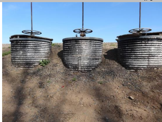
WS view: slide gates in CMP risers on waterside shoulder.