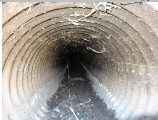
LS view: inside view of CMP on levee slope. Needs cleaning and clearing.