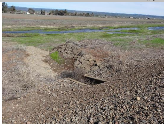
WS view: U type concrete headwall and grouted riprap spillway on levee slope.