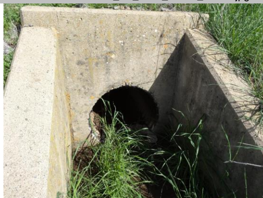
LS view: inside view of CMP on levee slope. Needs cleaning and clearing.