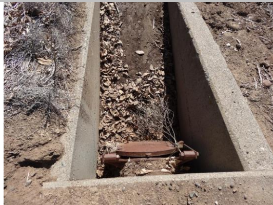
WS view: U type concrete headwall, flapgate on levee slope. Gate was not fully closed.