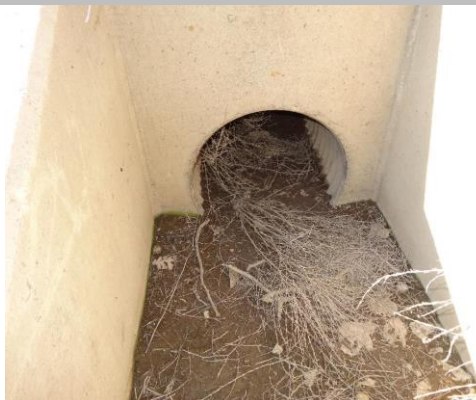
LS view: U type concrete headwall and CMP on levee slope. Soil/mud on inlet box.