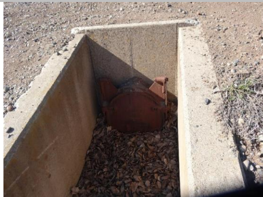
WS view: U type concrete headwall, pipe, and flapgate on levee slope. Vegetation debris blocking outlet.