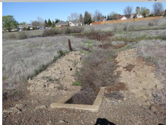
WS view: CMP culvert with U type concrete headwall. Vegetation debris blocking outlet box.