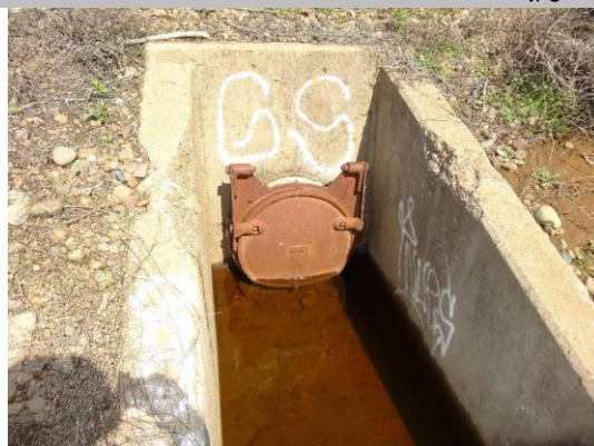
WS view: U type concrete headwall, flapgate, and CMP on levee slope. Looks clean and clear.