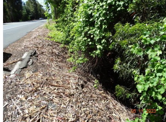
View of the scour at LM 8.37 (Spring 2023).