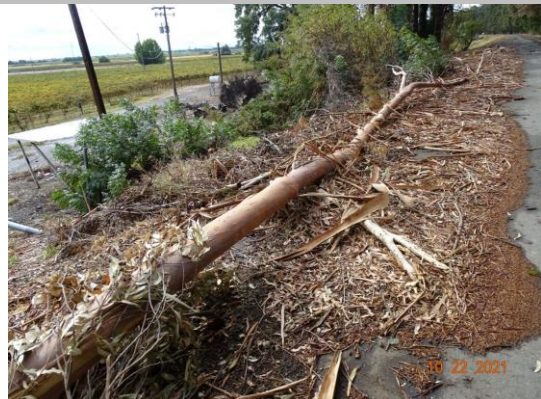
View of large downed tree limb on the landside hinge (Fall 2021).