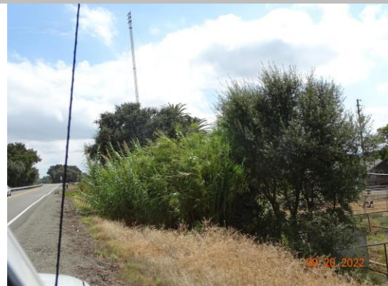
View of the arundo on the LS slope (Fall 2022).