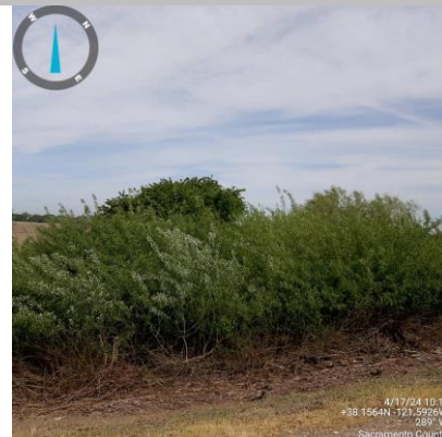
View of excessive growth on LS shoulder. (Spring 2024)