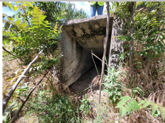
Land-Side: View of the landward end of tunnel