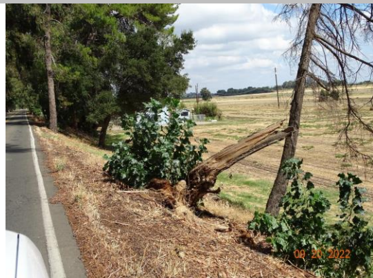
View of the tree on the LS slope (Fall 2022).