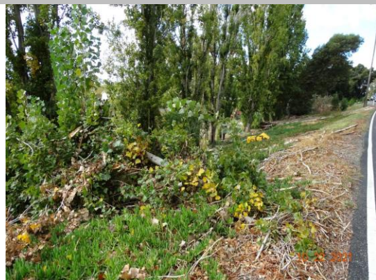
View looking downstream at two downed trees on the landside slope (Fall 2021).