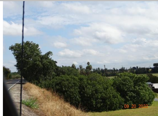
View of the fig tree on the LS slope (Fall 2022).