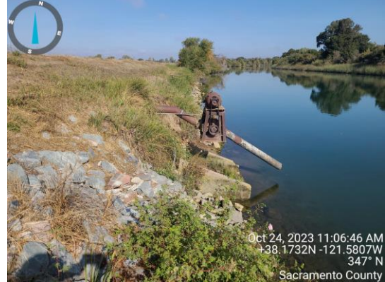
View of erosion on the waterside slope. Fall 2023.