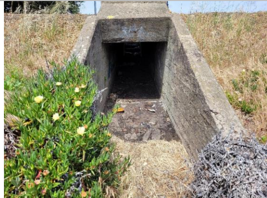
Land-Side: View of the landward end of tunnel