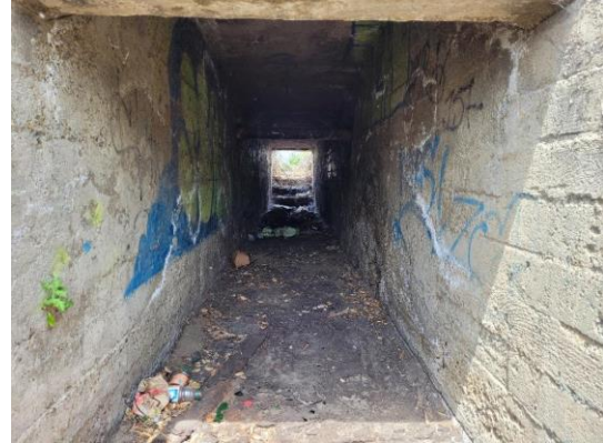
Overview of Levee: Photo taken inside of the tunnel