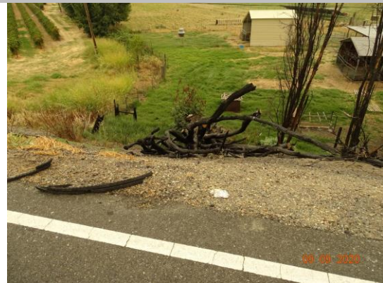
View looking downslope at burned tree on the landside slope (Fall 2020).