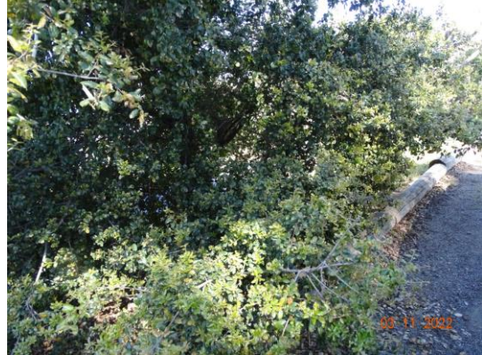
View of thick tree on the landside shoulder (Spring 2022).