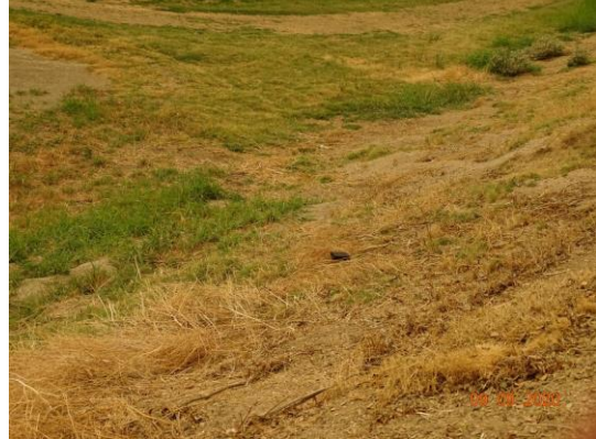
View looking downstream at animal holes in the landside slope (Fall 2020).