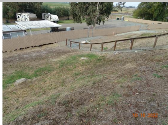
View of the tree stumps on the LS slope (Fall 2022).