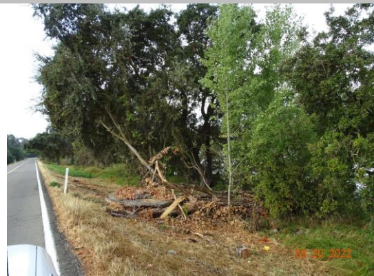
View of the tree on the WS slope (Fall 2022).

Photo 1 of 1 : SP_2024_NA0002_63_166_20240301_00066.jpg