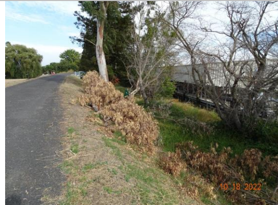
View of the tree limbs on the WS slope (Fall 2022).