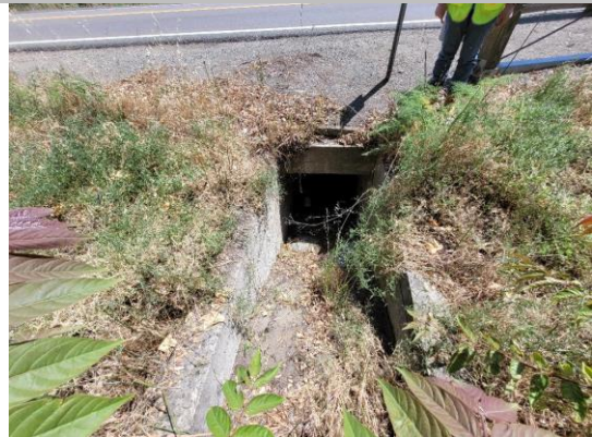
Water-Side: View of the waterward end of tunnel