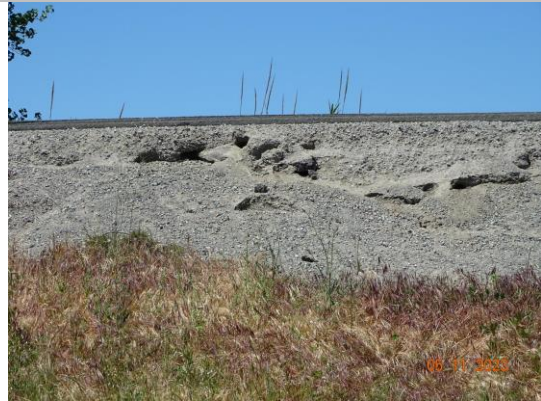
View of rodent holes on the upper LS slope (Spring 2023).