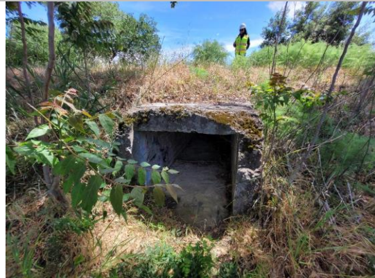
Water-Side: View of the waterward end of tunnel