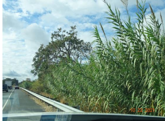
View looking downstream at arundo on the waterside slope (Fall 2021).