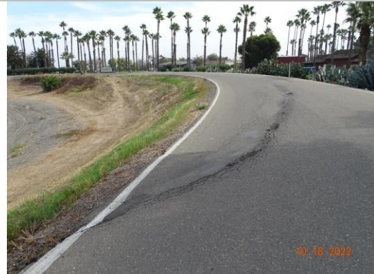
View of the depression on the levee crown (Fall 2022).