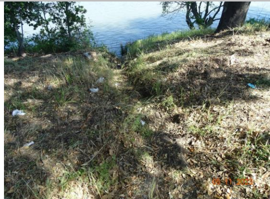
View of the footpath down the WS slope (Spring 2023).