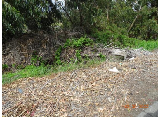
View of downed trees needing removal on the waterside slope (Spring 2022).