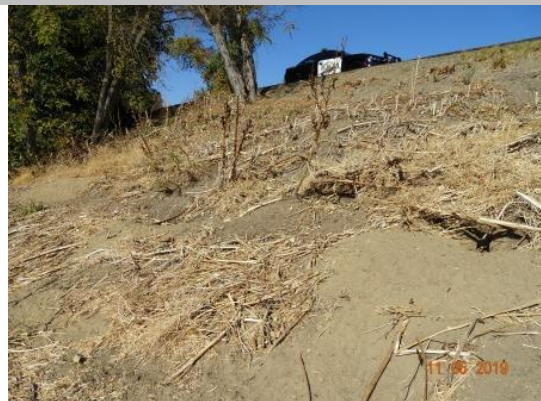
View of multiple large squirrel holes in landside slope (Fall 2019).