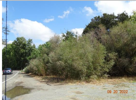
View of the vegetation on the LS slope (Fall 2022).