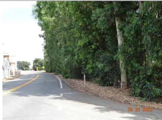
View of the trees along the LS shoulder (Fall 2022).