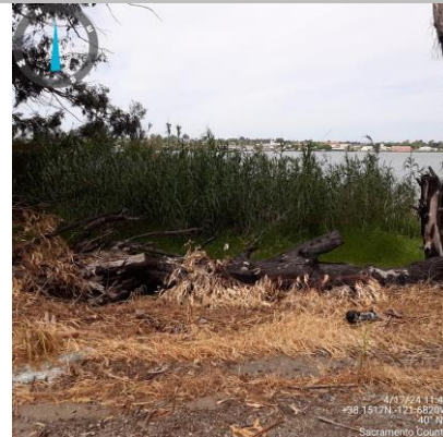
View of fallen tree to be removed. (Spring 2024)