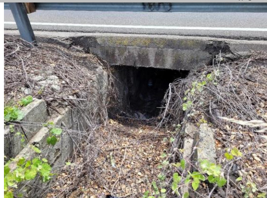
Water-Side: View of the waterward end of tunnel