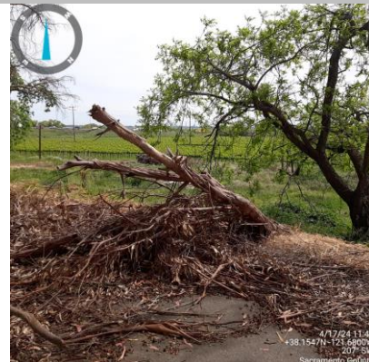
View of fallen tree limbs on the crown LS shoulder. (Spring 2024)