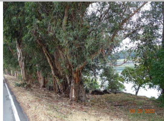
View of the stump and logs on the WS slope (Fall 2022).

Photo 1 of 1 : SP_2024_NA0002_63_78_20240301_00036.jpg