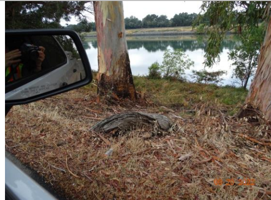
View of the tree limb on the WS slope (Fall 2022).