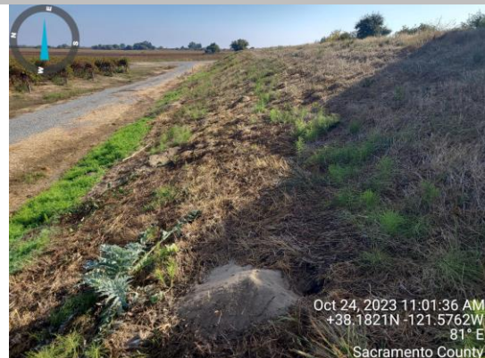
View of rodent holes on the landside slope. Fall 2023.