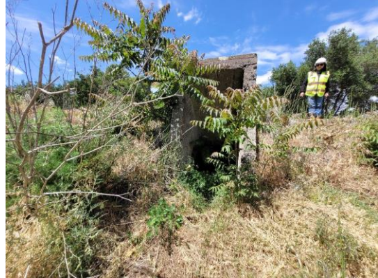
Land-Side: View of the landward end of tunnel