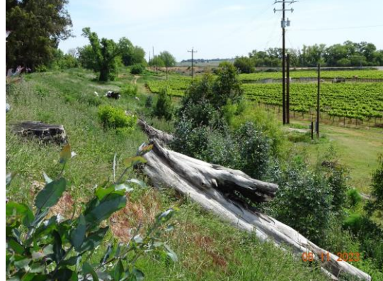
View of the tree limbs on the LS slope (Spring 2023).