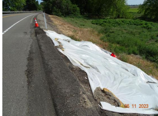
View of the repaired shoulder and plastic cover on the LS slope (Spring 2023).