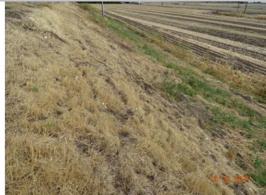
View of animal holes in the landside slope (Fall 2021).