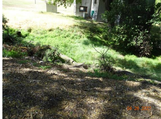
View of downed tree limb on the landside slope (Spring 2021).