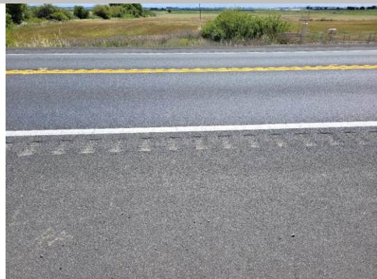
Top of Levee: View of levee crown looking from waterside