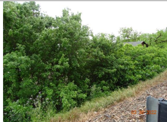
View of thick trees on the landside slope (Spring 2022).