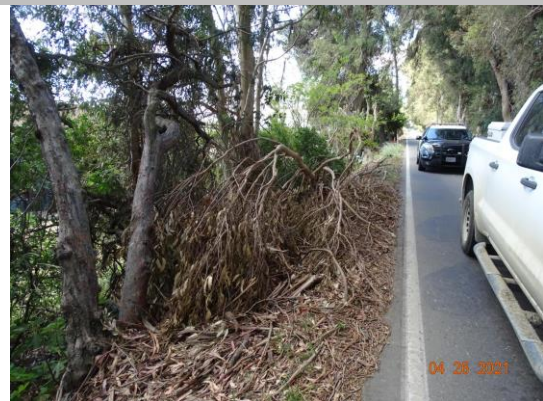
Downed tree limb on the landside hinge (Spring 2021).