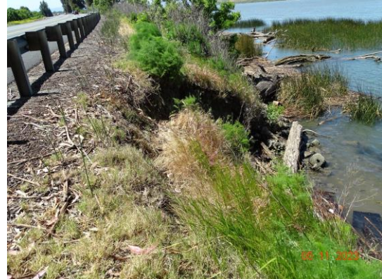
View of the sloughing at LM 8.97 (Spring 2023).