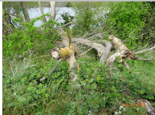
View of downed tree on the waterside slope (Spring 2022).

Photo 1 of 1 : SP_2024_NA0002_63_47_20240301_00014.jpg