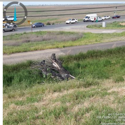
View of fallen tree to be removed from LS slope. (Spring 2024)

Photo 1 of 1 : SP_2024_NA0002_62_34_20240422_00085.jpg