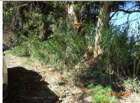
View of arundo on the waterside slope (Spring 2021).