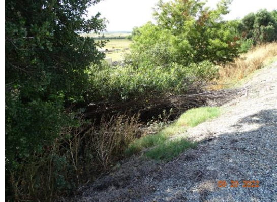
View of the fallen tree on the LS slope (Fall 2022).