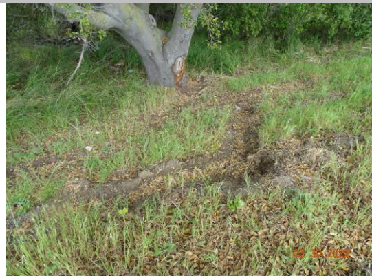
View of damage due to vehicle going off the road on the waterside slope (Spring 2022).

Photo 1 of 1 : SP_2024_NA0002_63_66_20240301_00023.jpg