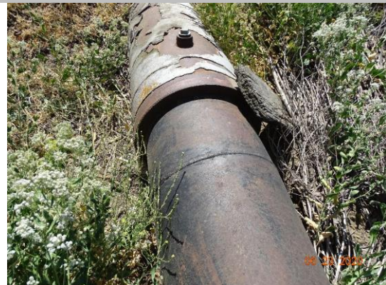
Land-Side: Pipe sleeving point on levee slope