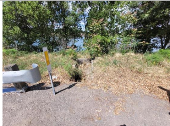
Water-Side: View of levee slope looking from crown. Concrete box on levee shoulder