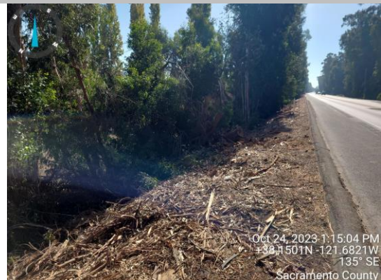
View of downed trees on the landside slope. Fall 2023.