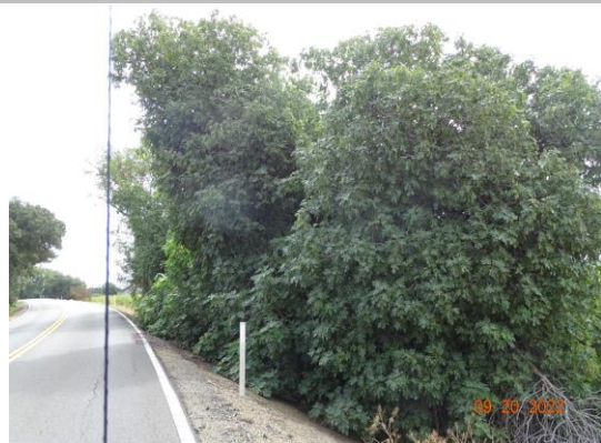
View of the fig tree on the LS slope (Fall 2022).