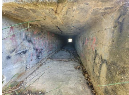
Overview of Levee: Photo taken inside of tunnel