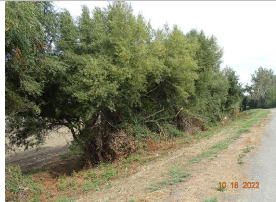
View of the vegetation on the LS toe (Fall 2022).