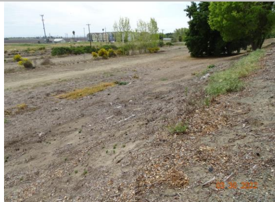
View of animal holes on the landside slope (Spring 2022).