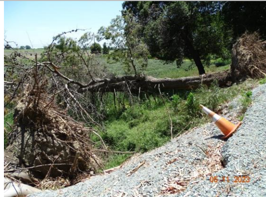
View of the fallen trees with root balls on the LS slope (Spring 2023).