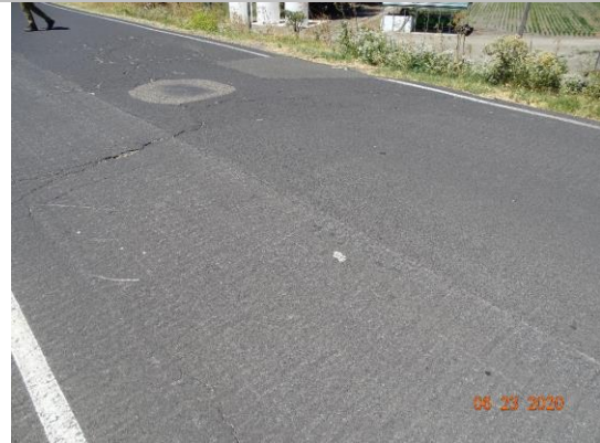
Top of Levee: View of levee crown looking downstream