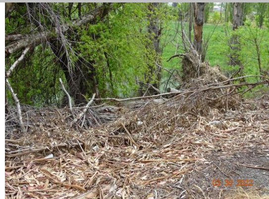
View of downed tree on the landside slope (Spring 2022).

Photo 1 of 1 : SP_2024_NA0002_63_157_20240301_00063.jpg