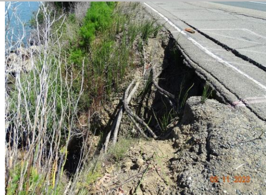
Erosion at LM 9.10 by turnout (Spring 2023).