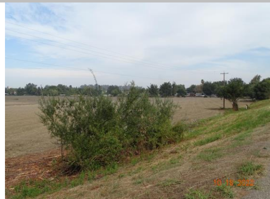
View of the tree on the LS slope (Fall 2022).