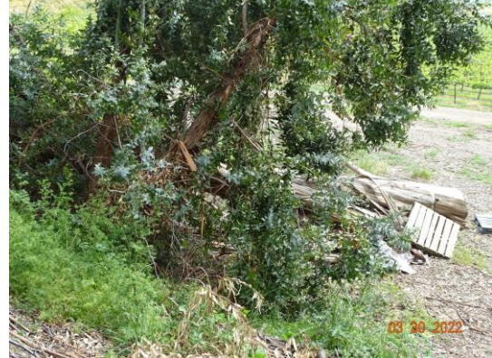
View of large downed tree on the landside slope (Spring 2022).