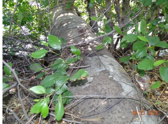
Water-Side: View of pipe at riverbank. Siphon breaker installed on the pipe at this place