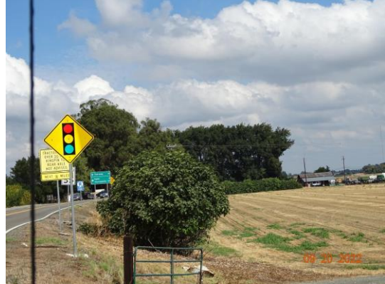
View of the fig tree on the LS slope (Fall 2022).