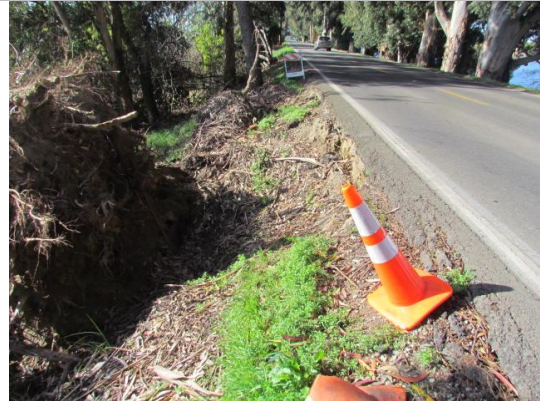
Looking south at hole at landward shoulder. (Spring 2015)