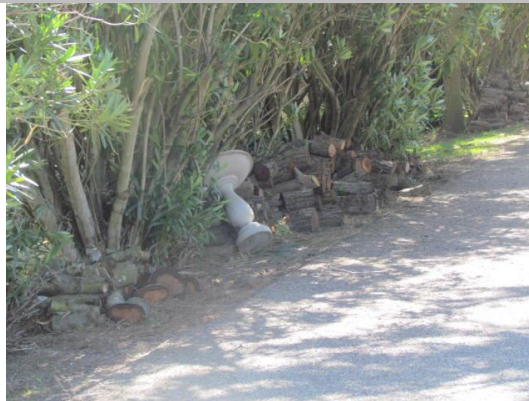
Looking southeast at firewood on waterside shoulder.