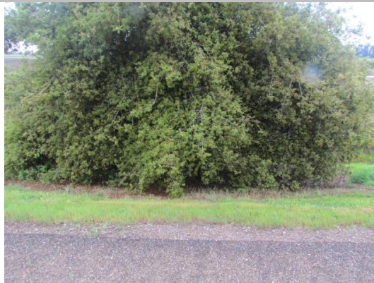
Looking west at untrimmed tree at landward toe. (Spring 2015)