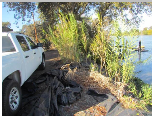
Looking southwest at bamboo on waterward slope.