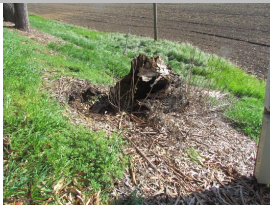
Looking northeast at fallen tree and hole on landward shoulder. (Spring 2015)