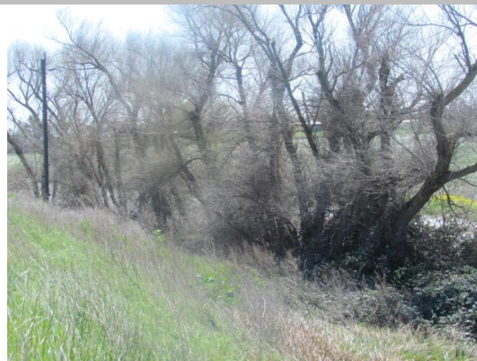
Looking south at trees, berry vines, and wild rose on landside toe.