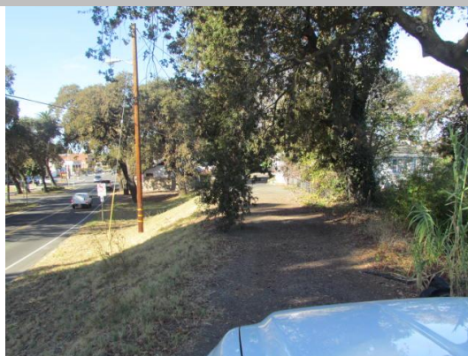
Looking south at overhanging tree on waterward shoulder. (Fall 2014)