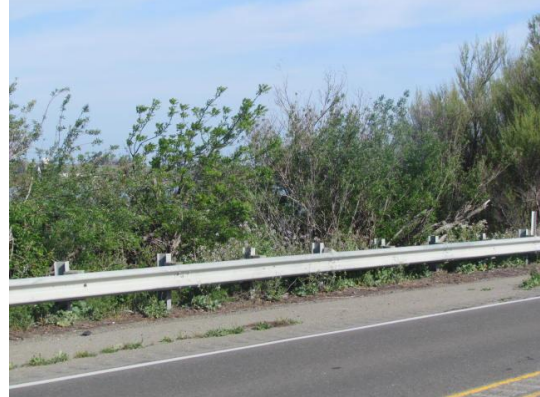
Looking west at dense vegetation on waterward shoulder and slope.