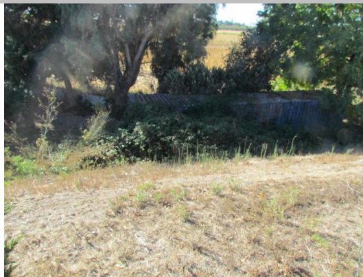
Looking east at berryvines at landward toe.