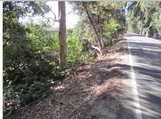
Looking southeast at dense vegetation on landward slope.