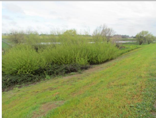
Looking north at dense vegetation withing fifteen feet of landward toe.