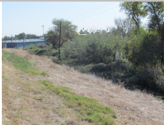
Looking east at dense vegetation on landward toe.