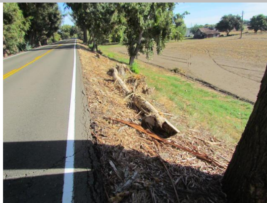
Looking northeast at tree limb on landward slope.