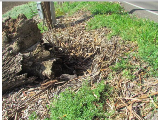
Looking southeast at fallen tree and hole on landward shoulder and slope. (Spring 2015).