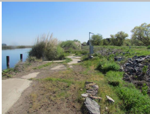
Looking south at south end of a concrete slab on waterward berm.