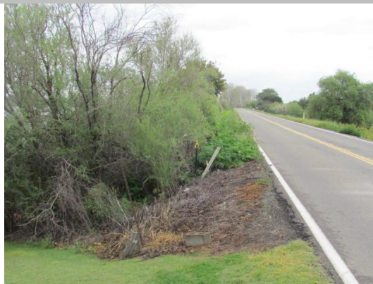
Looking north at dense vegetation on waterward slope.