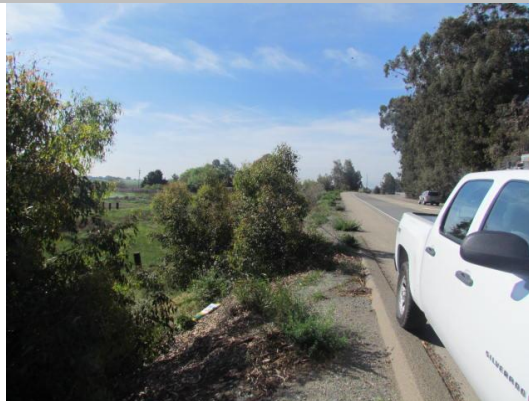
Looking south at trees on landward slope.