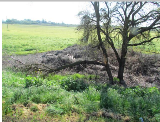
Looking east at broken tree limb at landward toe.