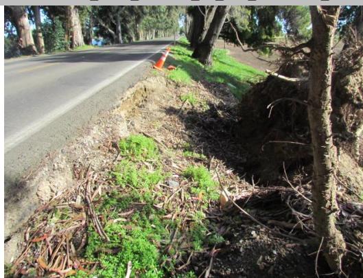
Looking north at hole and tree stump on landward shoulder. (Spring 2015)