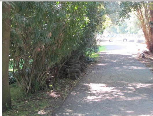
Looking south at firewood on waterside shoulder.