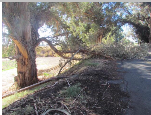
Looking southeast at broken tree limb on landward shoulder.