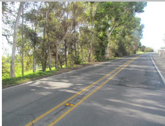
Looking southeast at trees at landward shoulder. (Spring 2015)