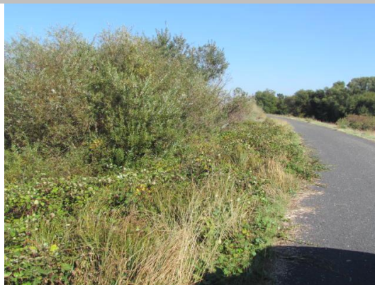
Looking south at dense vegetation on waterside slope.