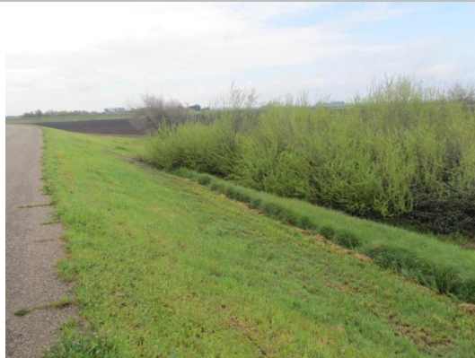
Looking southwest at dense vegetation at landward toe. (Spring 2015)