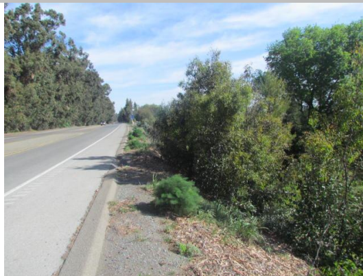
Looking north at dense trees on landward slope and toe.