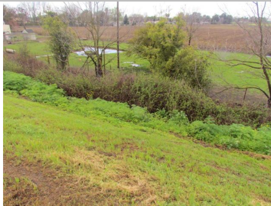
Looking southwest at dense vegetation at landward toe.