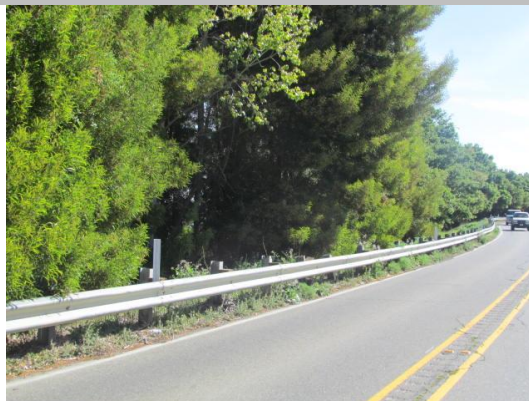
Looking northwest at dense trees on waterward shoulder and slope.