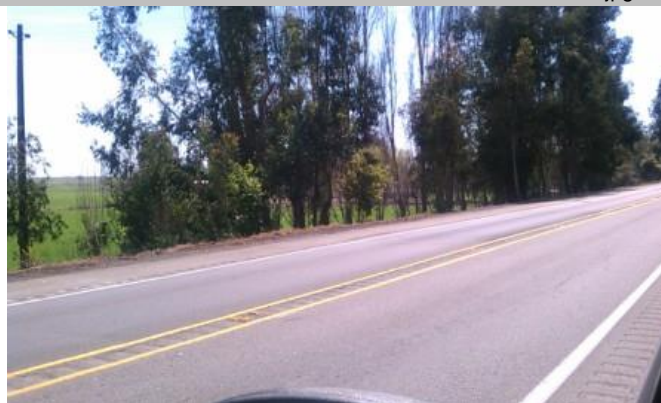
Looking southeast at trees on landside shoulder and slope.