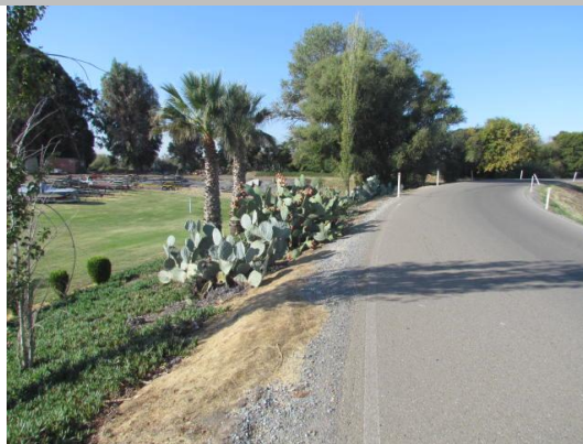
Looking south at cacti on waterward slope near Oxbow Harbor.