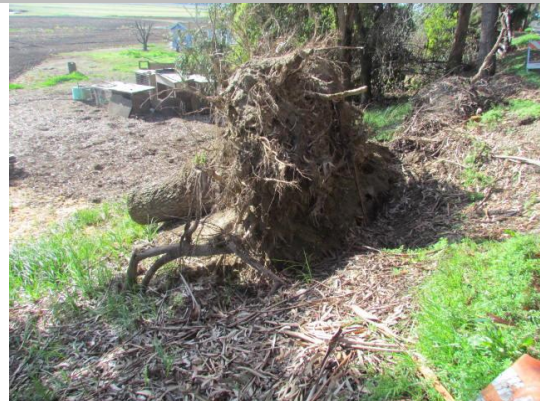
Looking southeast at tree stump on landward slope. (Spring 2015).