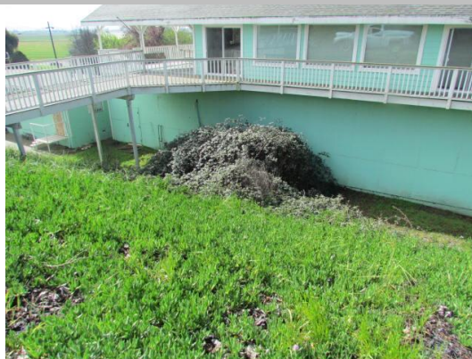
Looking west at dense vegetation at landward toe. (Spring 2015)