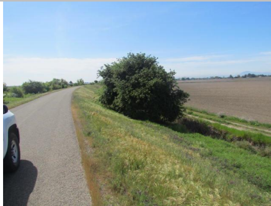
Looking southwest at an untrimmed tree on landward slope and toe. (Spring 2014)