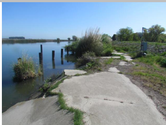
Looking south at a collapsed concrete slab on waterward berm.