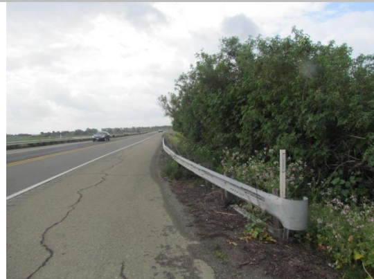
Looking south at dense vegetation on waterward shoulder and slope.