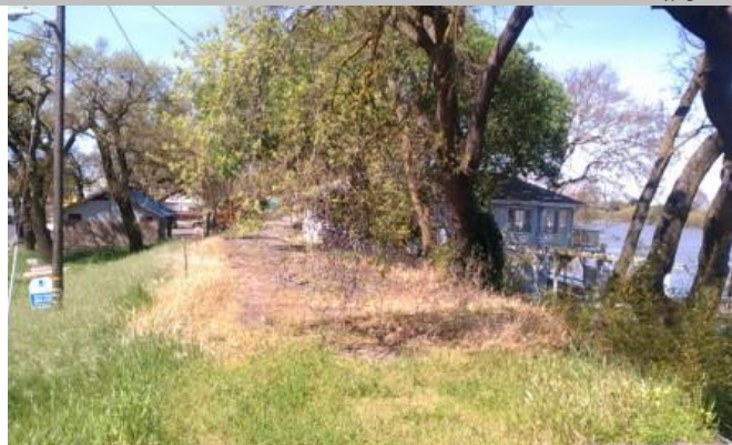
Looking south at overhanging tree on waterside shoulder.