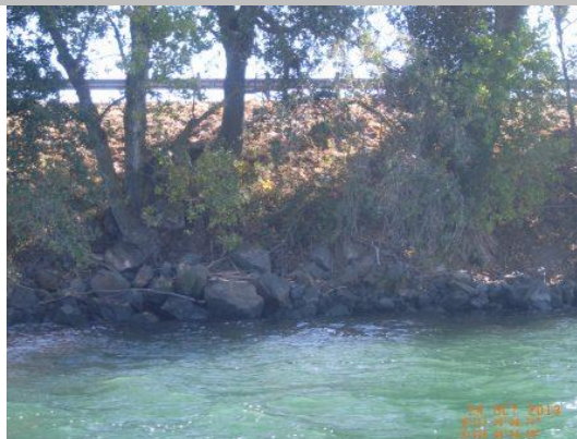
USACE 2013 Photo #2