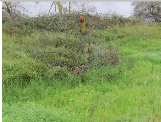
Looking east at downed tree on waterward toe.