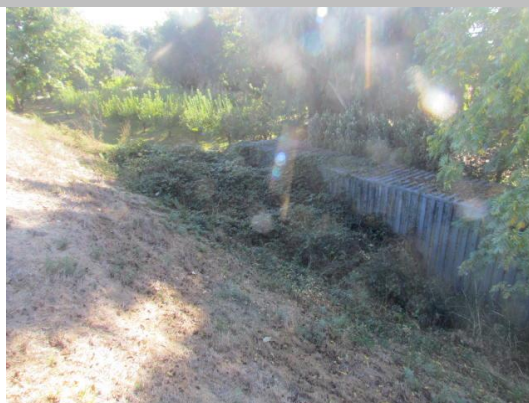
Looking northeast at berryvines at landward toe.