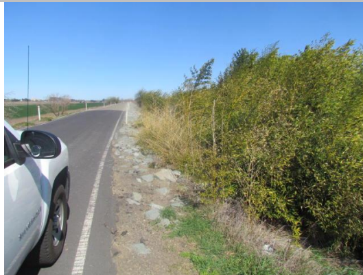
Looking west at dense vegetation on waterside slope spring 2012.