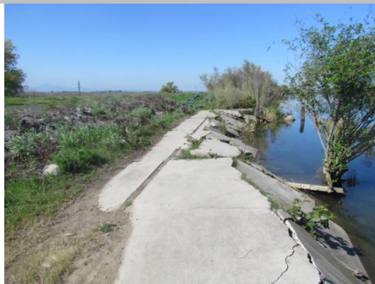
Looking north at a collapsed concrete slab on waterward berm.