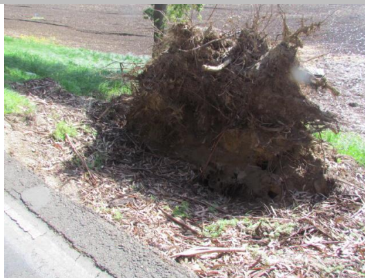
Looking east at tree stump on landward slope. (Spring 2015).