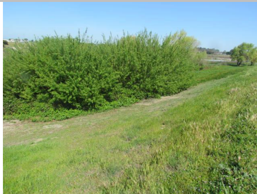
Looking north at dense vegetation within fifteen feet of landward toe.

* Location LS : Land Side N/A : Not Applicable WS : Water Side CR : Crown