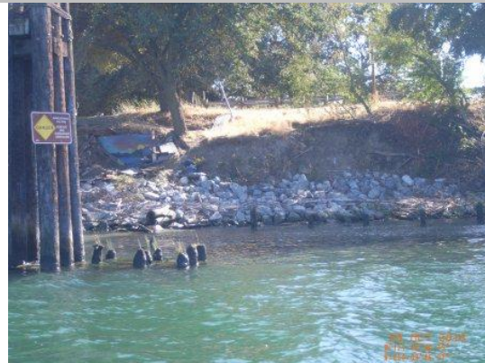
USACE 2013 Photo #2