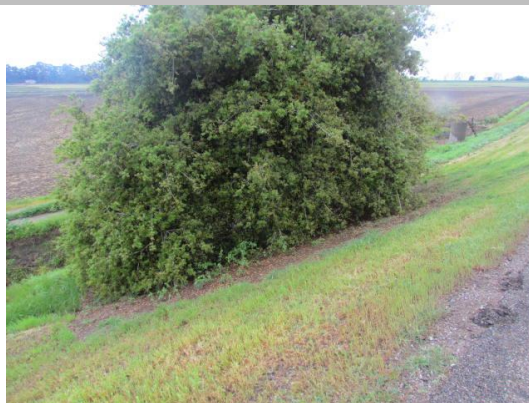
Looking northwest at untrimmed tree at landward toe. (Spring 2015)