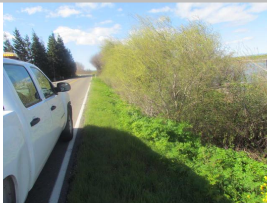
Looking south at dense vegetation on waterside slope.