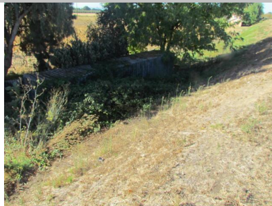
Looking southeast at berryvines at landward toe.