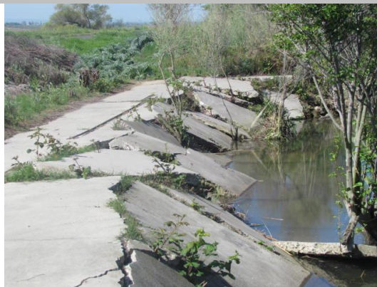
Looking north at a collapsed concrete slab on waterward berm.