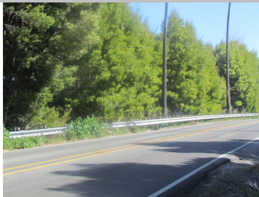
Looking southeast at dense trees on landside slope and toe.