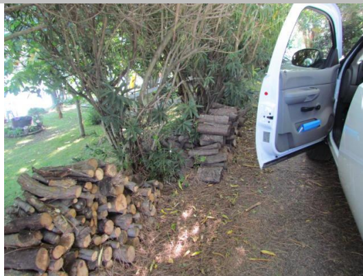
Looking east at firewood on waterside shoulder.