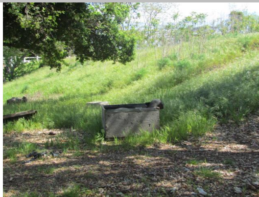
Looking northeast at garbage at landward toe.