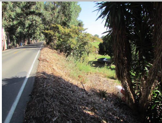
Looking north at dense vegetation on landward slope and toe.