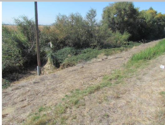
Looking south at dense berry vines and trees on the landward slope and toe.