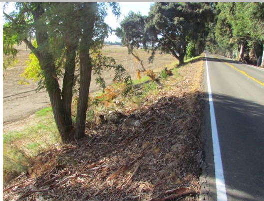
Looking southeast at tree limb on landward slope.