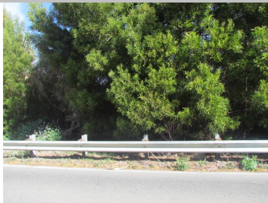
Looking west at dense trees on waterward should and slope.