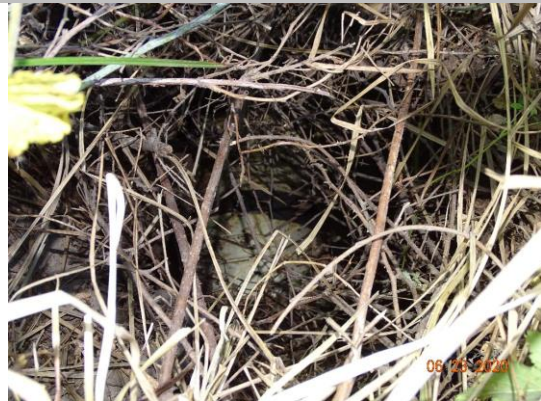
Water-Side: Pipe visible under shrubs near levee toe. Erosion around pipe is present