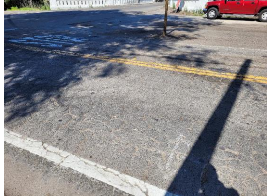
Top of Levee: View of levee crown looking from landside