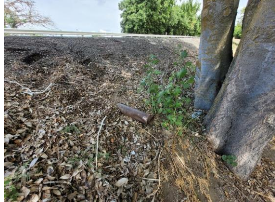
Land-Side: Open pipe end next to the tree