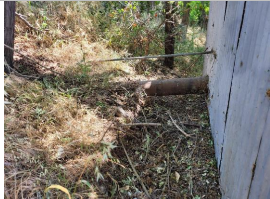
Land-Side: Pipe and electrical conduit at levee toe