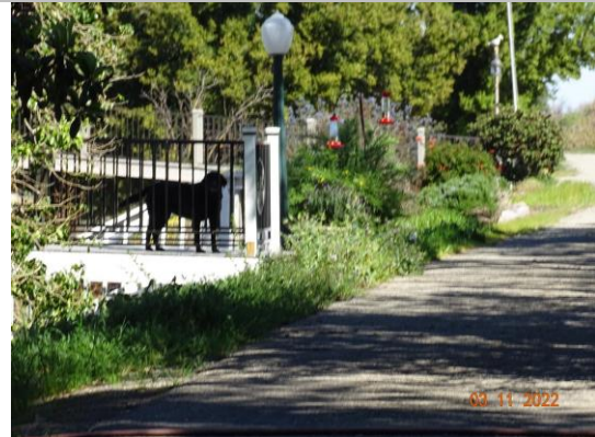
View looking upstream at landscaping on the landside slope (Spring 2022).