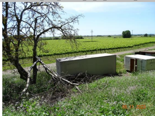
View of the container on the LS toe (Spring 2023).