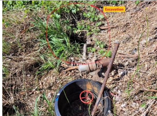
Land-Side: Corrugated Plastic Pipe (CPP) riser with air release valve and butterfly valve inside