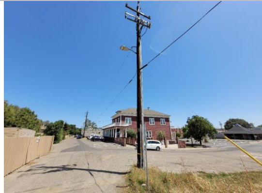
Top of Levee: View of levee crown looking upstream. Service pole on landside shoulder