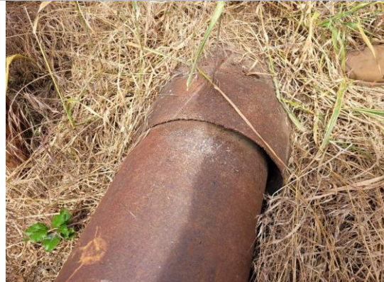
Land-Side: View of open annular space between pipes at levee shoulder