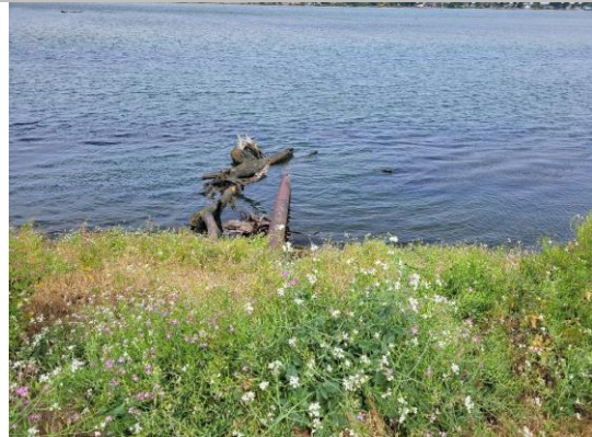
Water-Side: View of levee slope looking from crown. Erosion noted in last inspection not found