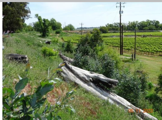
View of the tree limbs on the LS slope (Spring 2023).