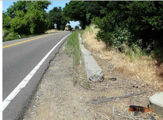
View of the concrete blocks along the WS shoulder (Spring 2023).