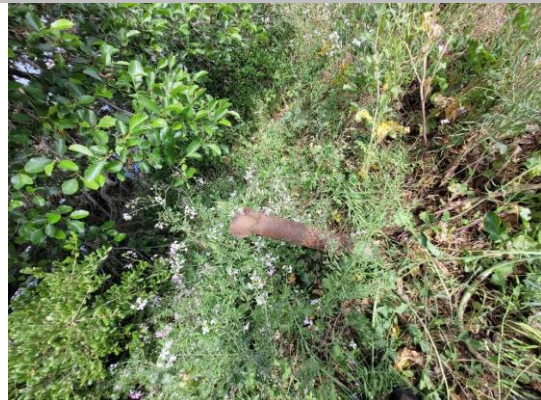
Water-Side: Pipe found on levee slope with its end open