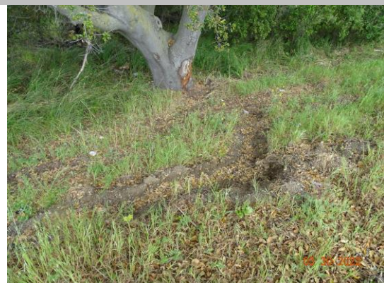
View of damage due to vehicle going off the road on the waterside slope (Spring 2022).