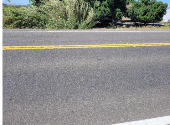
Top of Levee: View of levee crown looking from waterside