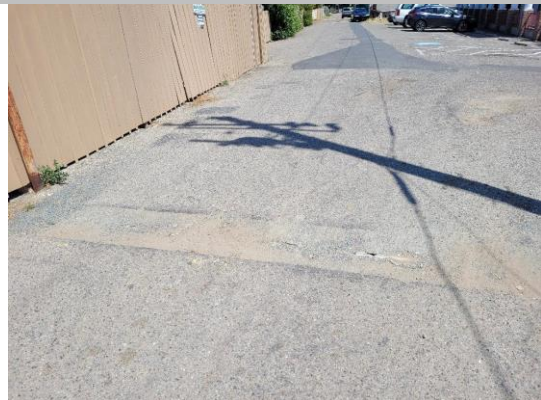
Top of Levee: Paved cut in levee crown pavement