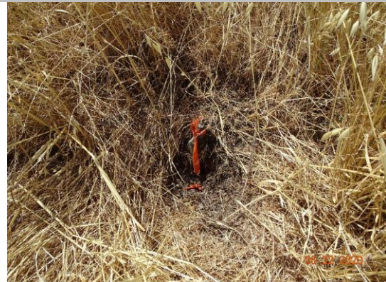
Land-Side: Damaged siphon breaker pipe on levee shoulder