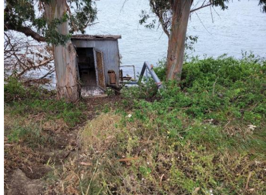
Water-Side: View of levee slope looking from crown. Pump house at riverbank