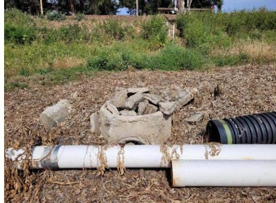
Land-Side: Concrete debris at levee toe