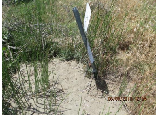
Siphon breaker next to paddle marker on LS shoulder.