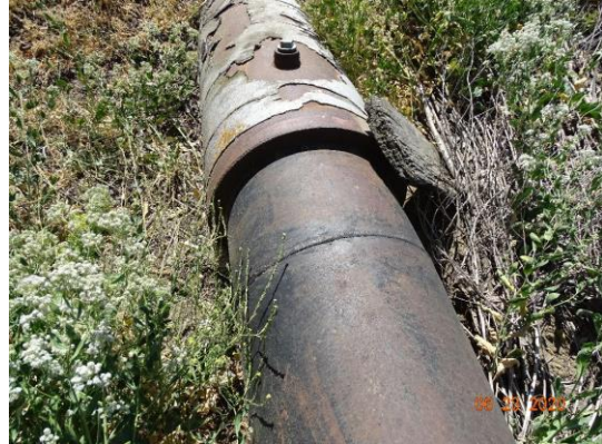
Land-Side: Pipe sleeving point on levee slope