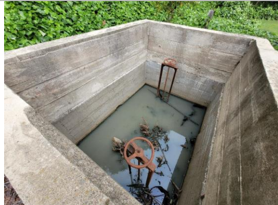
Land-Side: View inside of concrete distribution box at levee toe