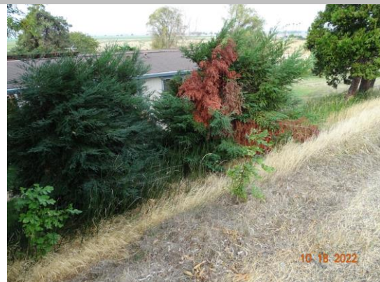
View of the landscaping on the LS toe (Fall 2022).