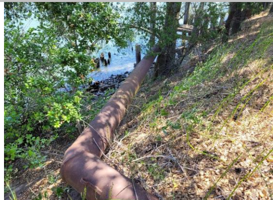
Water-Side: Pipe at riverbank goes approximately 30 feet along the levee to connect pump with the pipe through levee