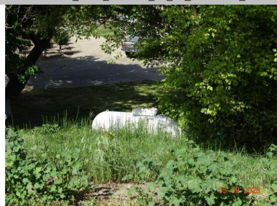
View of the tank on the LS toe (Spring 2023).