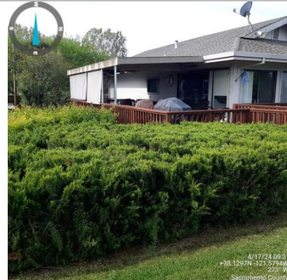
View of thick landscape vegetation on the LS slope. (Spring 2024)