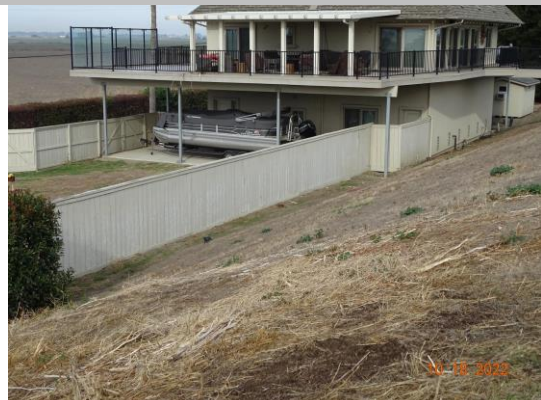
View of the fence on the LS toe (Fall 2022).