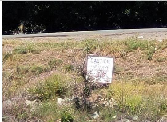
Water-Side: Caution sign on opposite side of river still in place