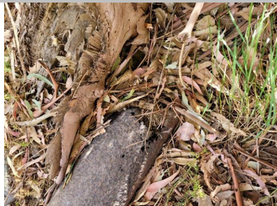
Water-Side: Through holes in pipe on levee slope