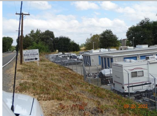
View of the fence along the LS toe (Fall 2022).