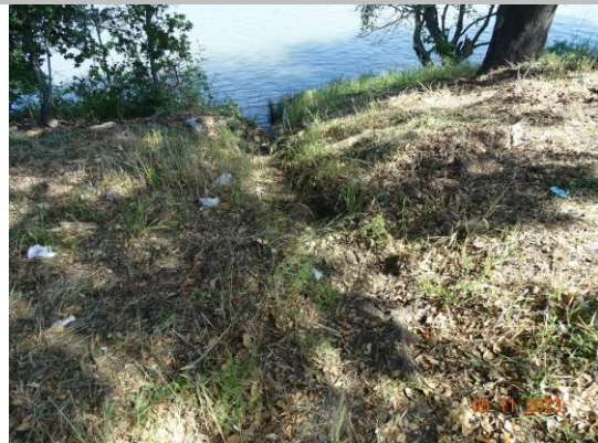
View of the footpath down the WS slope (Spring 2023).