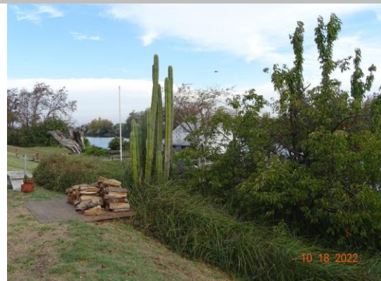
View of the landscaping on the WS slope (Fall 2022).