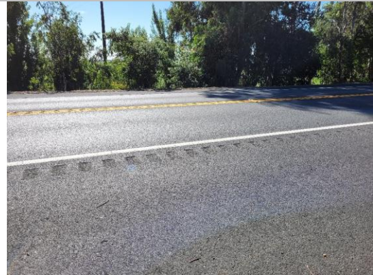
Top of Levee: View of levee crown looking towards landside