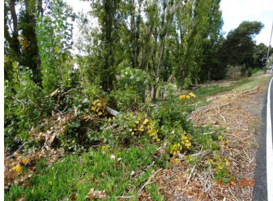
View looking downstream at two downed trees on the landside slope (Fall 2021).