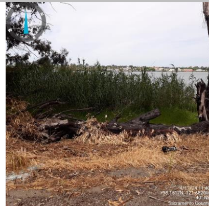
View of fallen tree to be removed. (Spring 2024)