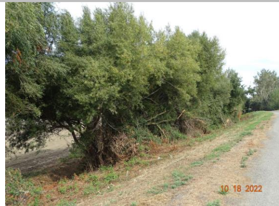
View of the vegetation on the LS toe (Fall 2022).