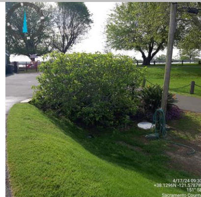
View of landscape bush to be removed from LS slope. (Spring 2024)