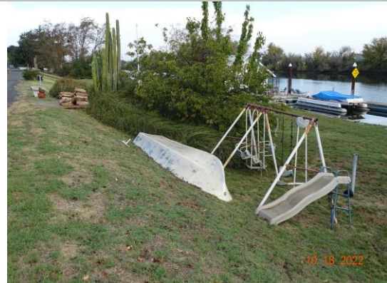
View of the swing and other material on the WS slope and toe (Fall 2022).