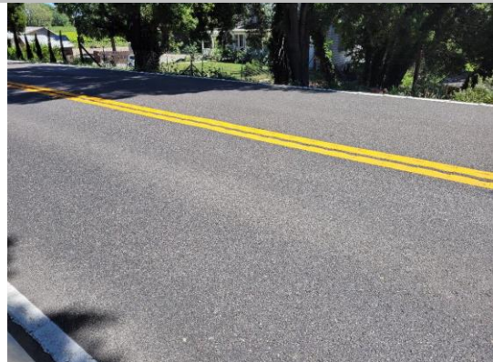
Top of Levee: View of levee crown looking towards landside