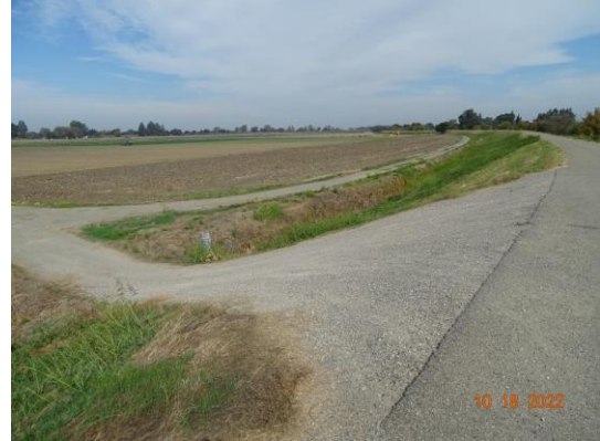
View of the ramp going down the LS slope (Fall 2022).