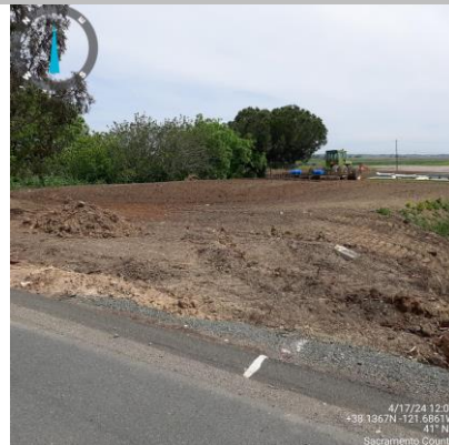
View of the fill material on the LS slope and toe. (Spring 2024)