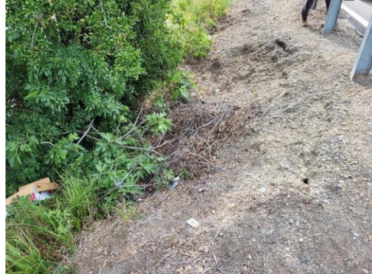
Water-Side: Another view of depression on levee slope