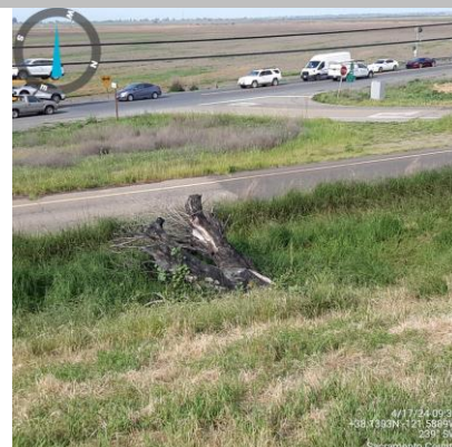
View of fallen tree to be removed from LS slope. (Spring 2024)