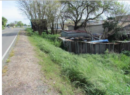
Looking north at several encroachments along landward slope and toe.