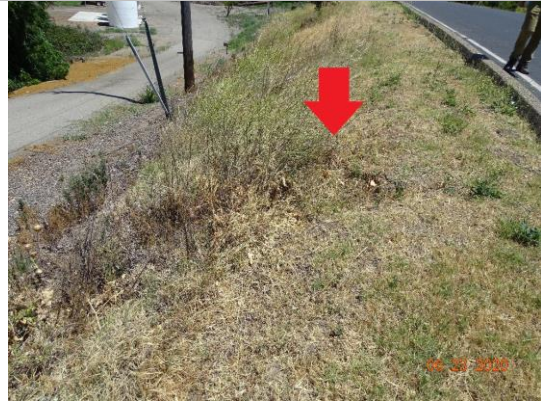
Land-Side: Subsidence on levee slope