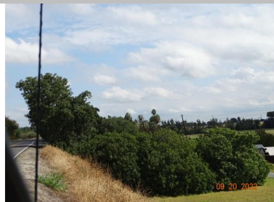
View of the fig tree on the LS slope (Fall 2022).