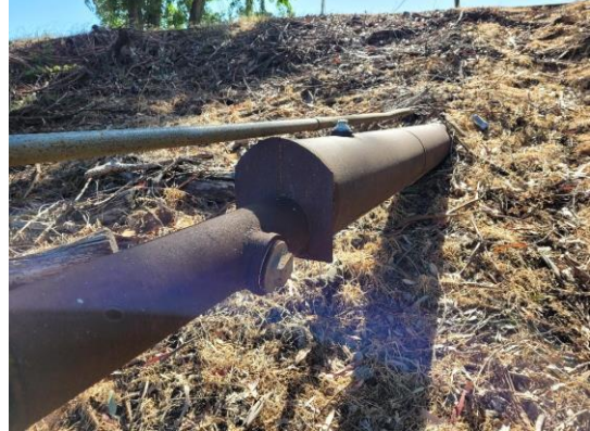
Water-Side: Sleeving point on levee slope. Annual space covered with steel plate