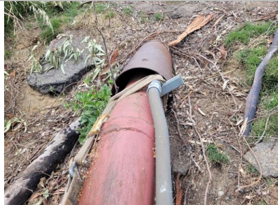
Land-Side: 10-inch through 12-inch pipes sleeving visible on levee shoulder