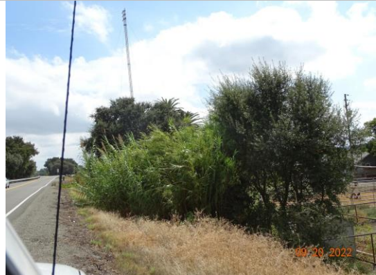
View of the arundo on the LS slope (Fall 2022).