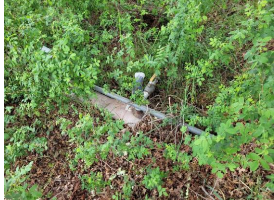
Land-Side: Air release valve and hose connection on levee shoulder