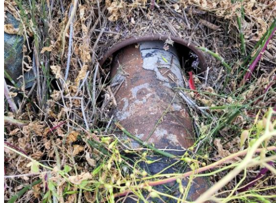
Water-Side: Not grouted annular space between pipes on levee shoulder