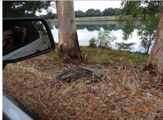
View of the tree limb on the WS slope (Fall 2022).