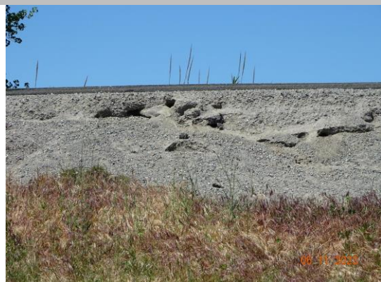
View of rodent holes on the upper LS slope (Spring 2023).