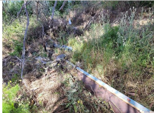
Water-Side: Pipe, electrical conduit, and pump on levee slope