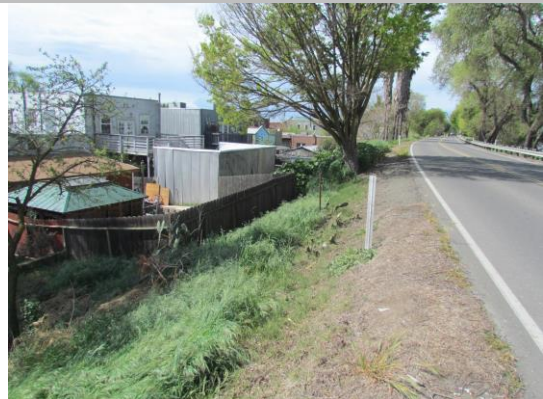
Looking south at several encroachments along landward slope and toe.