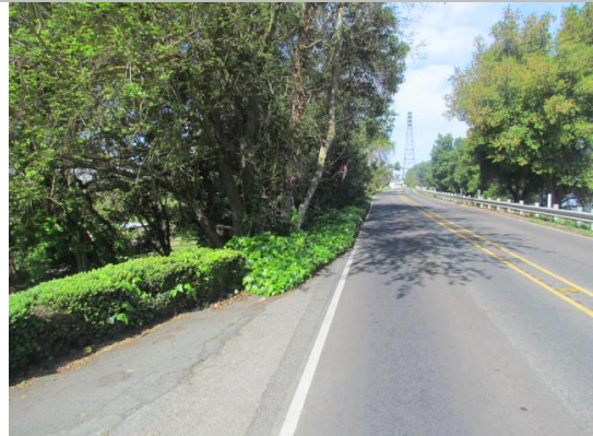
Looking west at dense landscaping on landward slope.