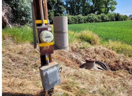
Land-Side: Service pole with electrical panel and concrete standpipe at levee toe