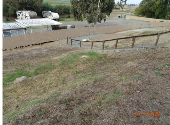
View of the tree stumps on the LS slope (Fall 2022).