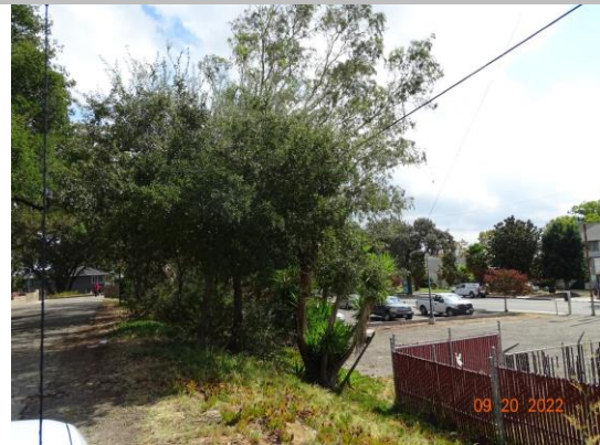
View of the landscaping on the LS slope (Fall 2022).