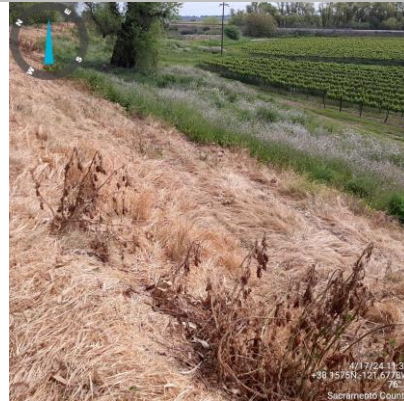
View of vehicle tracks through the vegetation on LS slope. (Spring 2024)