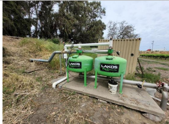
Land-Side: Sand filters installed at levee toe