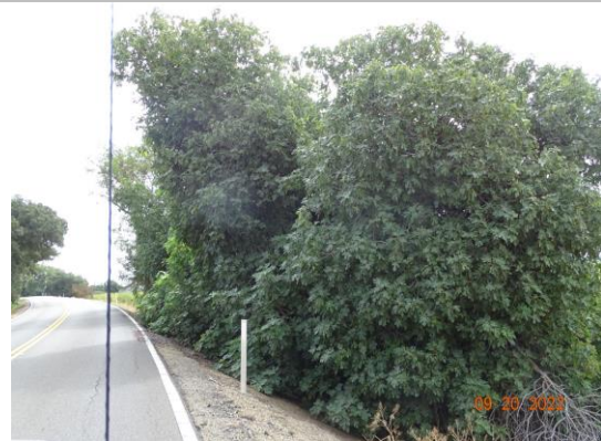
View of the fig tree on the LS slope (Fall 2022).