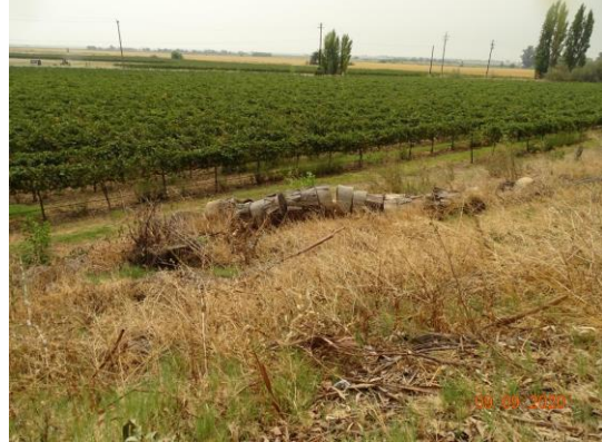
View of chopped up tree trunk on the landside slope (Fall 2020).