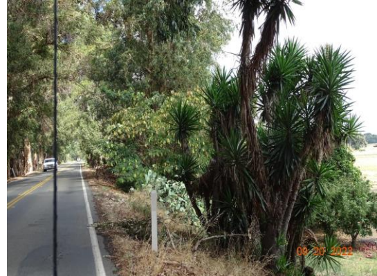
View of the cactus and other landscaping on the LS slope (Fall 2022).