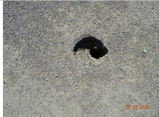
Top of Levee: View of sinkhole in the center of crown