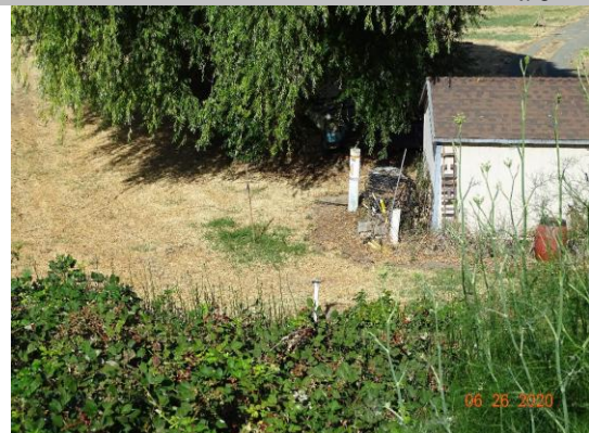
Land-Side: Levee slope. Shut-off valve at levee toe