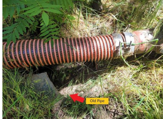
Water-Side: Pipe was cut on levee berm to install 6-inch flexible corrugated hose