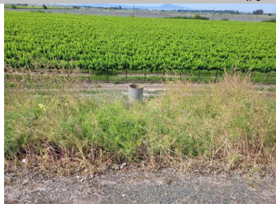
Land-Side: View of levee slope looking from crown. Concrete standpipe and abandoned pump at levee toe