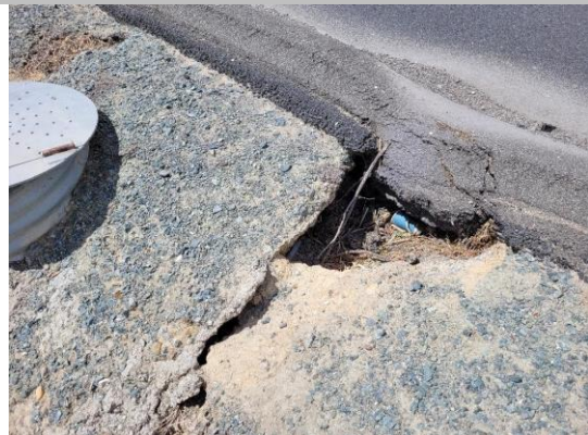
Land-Side: Erosion on levee shoulder around CMP riser