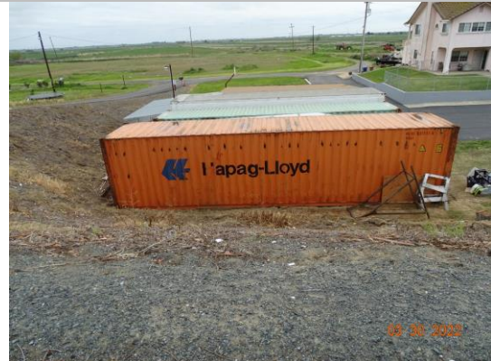
View of shipping container placed at landside toe (Spring 2022).