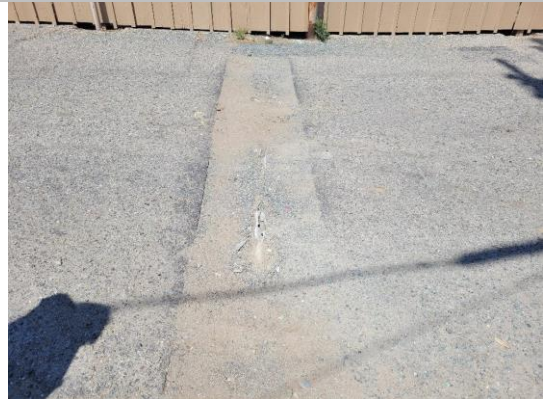
Top of Levee: Cut in pavement. Paving material is starting to come out due to the traffic