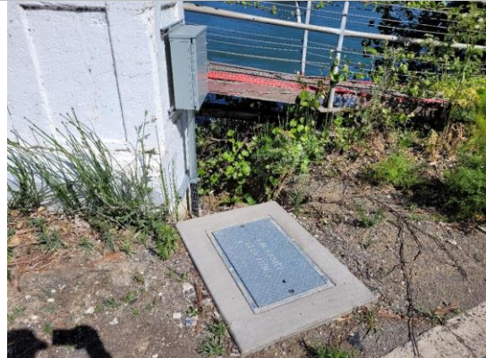
Water-Side: Electrical boxes on upstream side of bridge