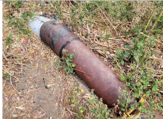
Land-Side: View of pipe on levee slope. Air vent on the top of pipe