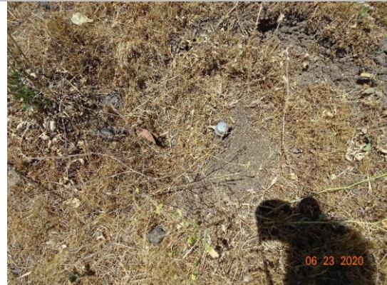
Land-Side: Air vent/primer line on levee shoulder