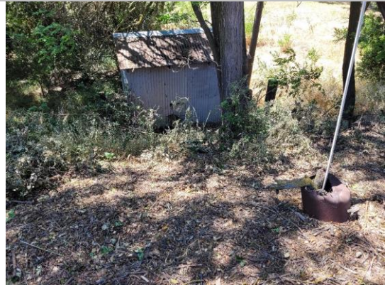
Land-Side: View of levee slope looking from crown. Pumphouse at the toe, damaged steel riser on the slope