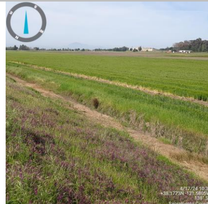
View of overgrown ditch at the LS toe. (Spring 2024)