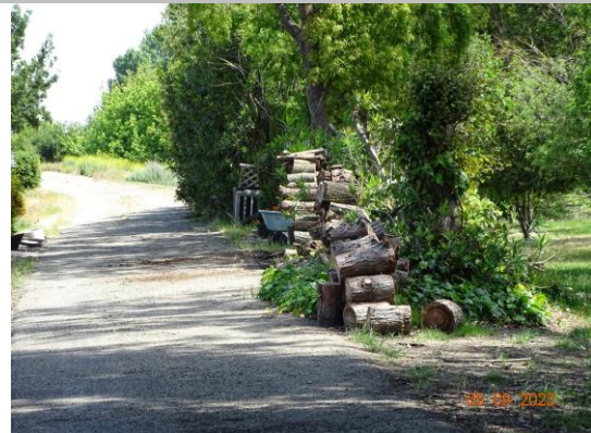
View of the firewood on the WS shoulder (Spring 2023).