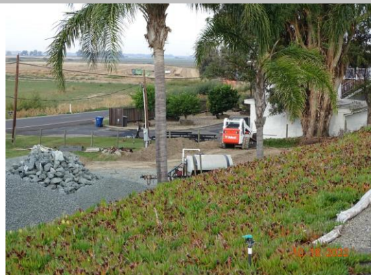
View of the iceplants on the LS slope (Fall 2022).