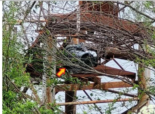
Water-Side: New pump located on pile structure in the stream