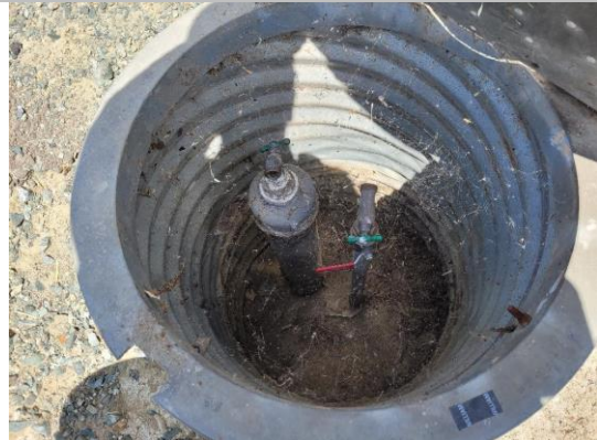
Land-Side: Filler valve and air release valve inside CMP riser