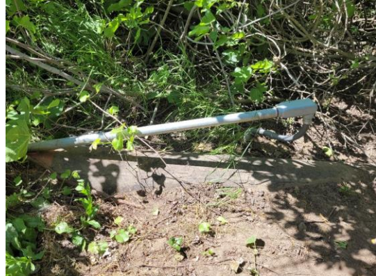
Water-Side: Electrical conduit comes out on levee slope