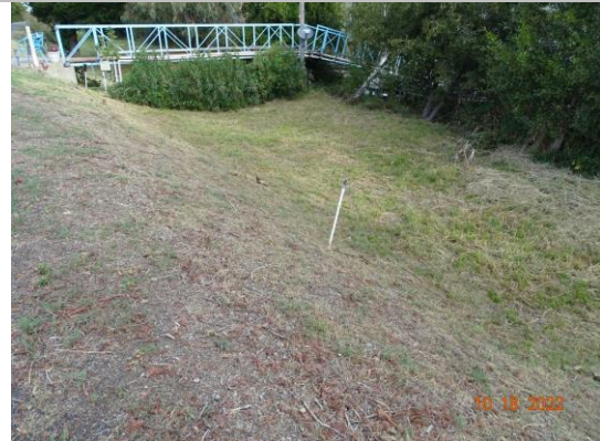
View of the sprinkler system on the WS slope (Fall 2022).