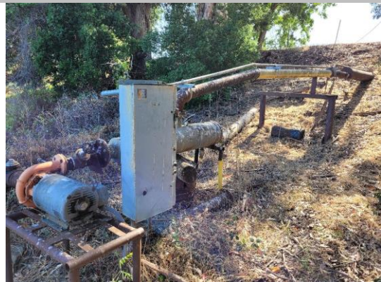
Water-Side: Pump and electrical panel on the berm