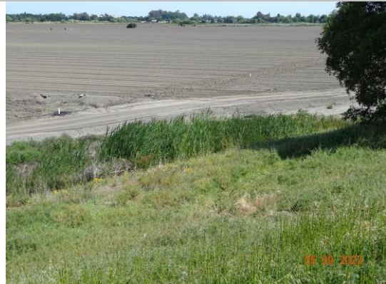
View of the seepage site on the LS toe (Spring 2023).