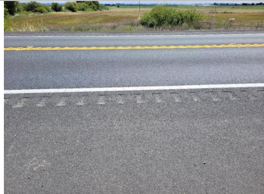
Top of Levee: View of levee crown looking from waterside