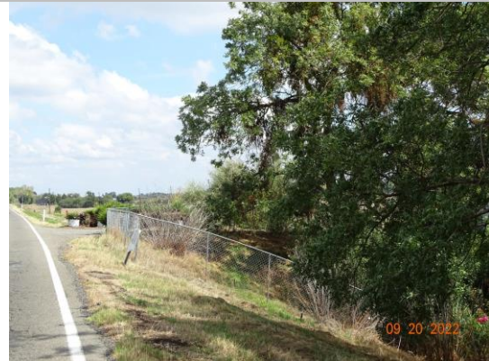
View of the fence on the LS shoulder and slope (Fall 2022).