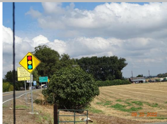
View of the fig tree on the LS slope (Fall 2022).