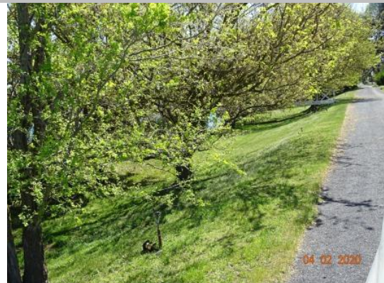
View looking downstream at sprinklers on the waterside slope (Spring 2020).