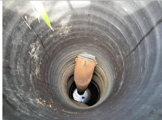
Land-Side: View of pipe inside CPP standpipe