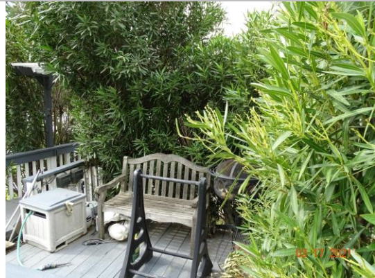
View of oleanders on the landside slope (Spring 2021).