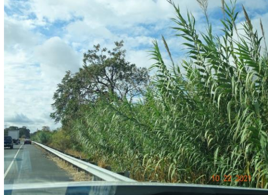
View looking downstream at arundo on the waterside slope (Fall 2021).