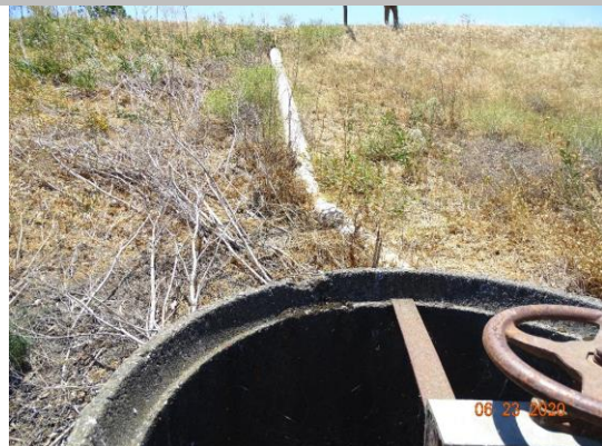
Land-Side: Abandoned concrete standpipe and levee slope on background