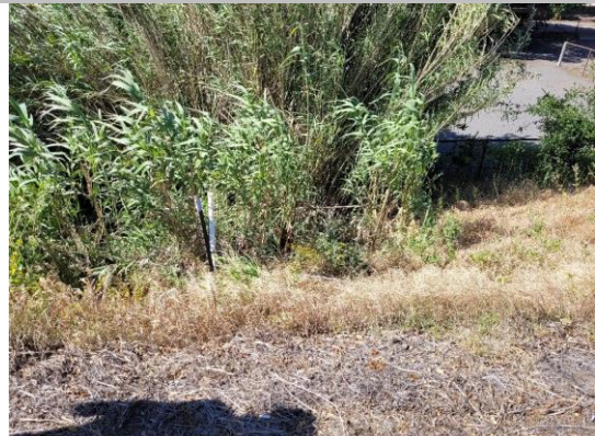
Land-Side: View of levee slope looking from crown. Pumphouse at levee toe