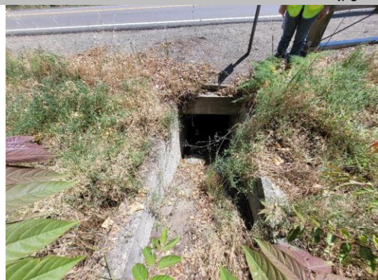
Water-Side: View of the waterward end of tunnel