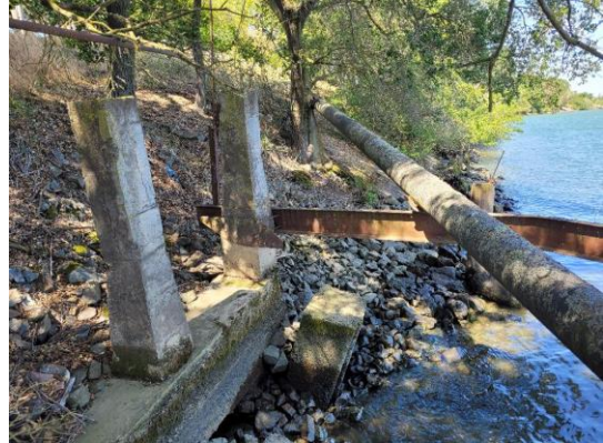
Water-Side: Pipe at riverbank goes along the levee to connect pump with the pipe through levee