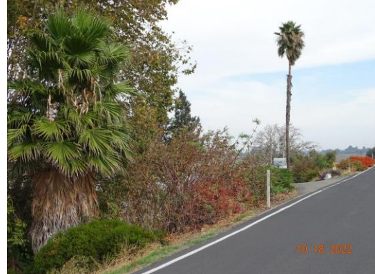
View of the landscaping on the LS slope (Fall 2022).