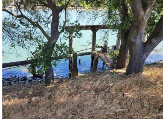
Water-Side: View of levee slope looking from crown. Pump on pier