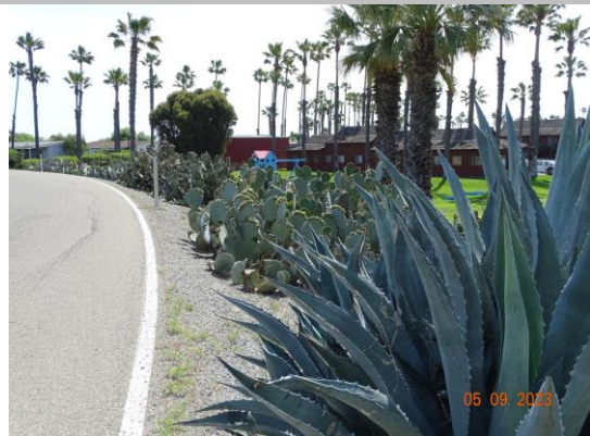
View of the cactus on the WS slope (Spring 2023).