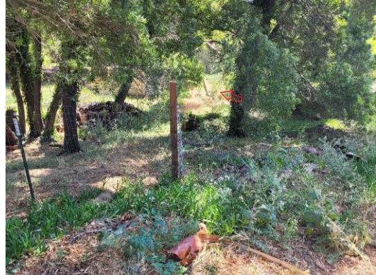
Land-Side: View of levee slope looking from crown. Pipe is visible on landside entering a shed