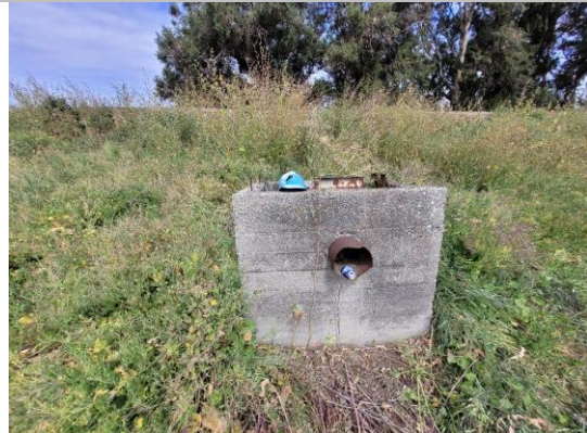
Land-Side: Abandoned concrete distribution box at levee toe