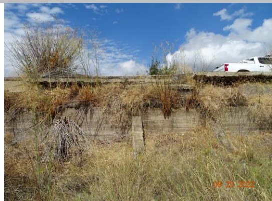
Looking up the LS slope with the retaining wall in the foreground (Fall 2022).