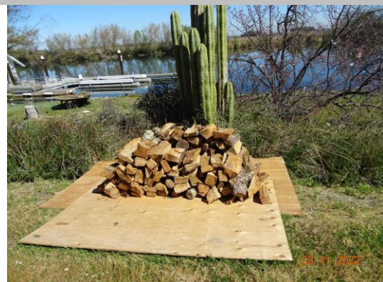
View of firewood on the waterside hinge (Spring 2022).