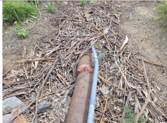
Water-Side: 8-inch welded to 10-inch pipe on levee shoulder