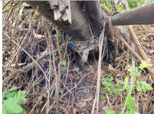
Water-Side: Annular space between pipes plugged with tarp at levee shoulder