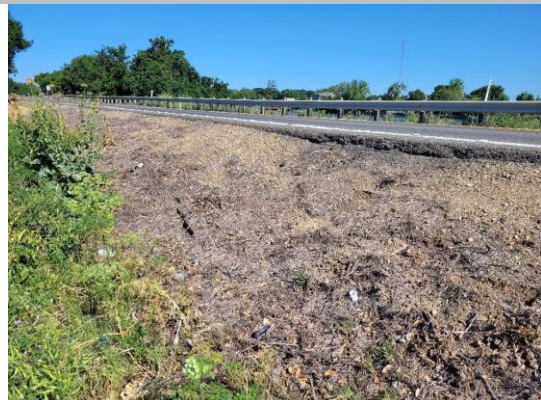
Land-Side: Another view of depression on landside slope along pipe alignment