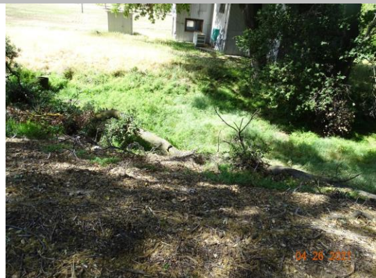
View of downed tree limb on the landside slope (Spring 2021).