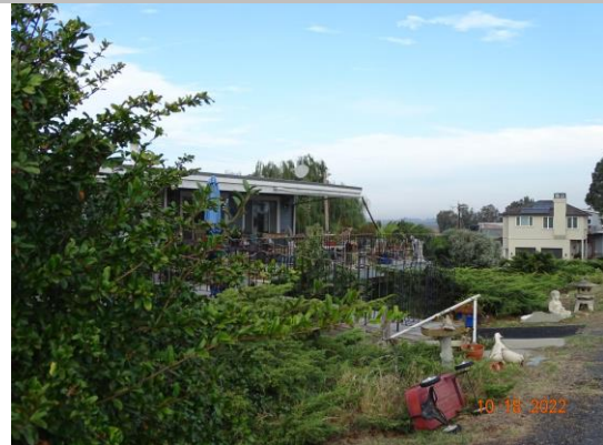
View of the landscaping on the LS slope (Fall 2022).