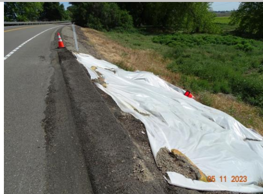
View of the repaired shoulder and plastic cover on the LS slope (Spring 2023).