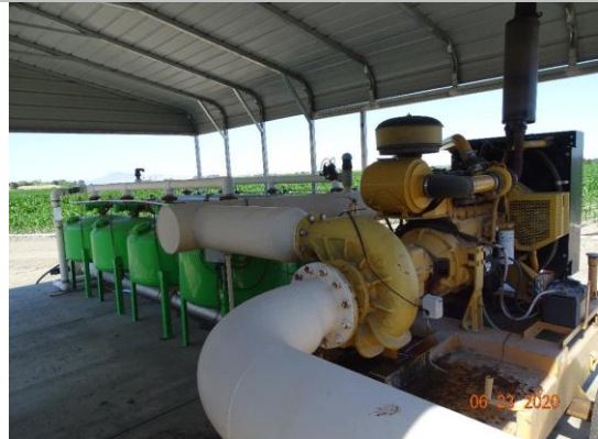
Land-Side: Diesel pump and media filtering facility off levee toe