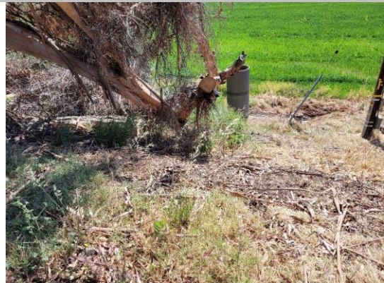
Land-Side: View of levee slope looking from crown. CMP riser buried in debris on levee slope