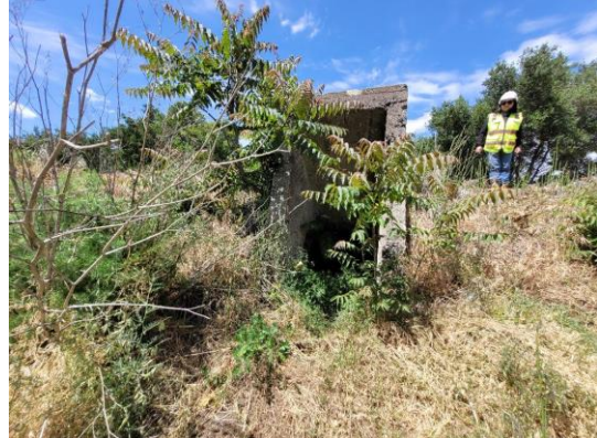
Land-Side: View of the landward end of tunnel