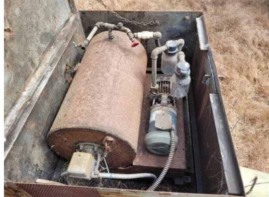
Land-Side: Filler pump and its equipment in service box on the top of pipe at levee shoulder