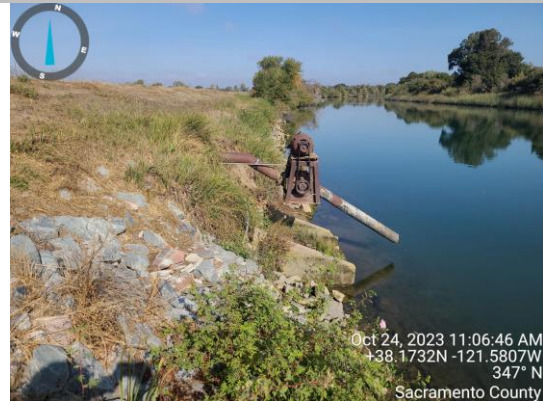
View of erosion on the waterside slope. Fall 2023.