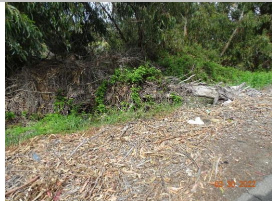
View of downed trees needing removal on the waterside slope (Spring 2022).