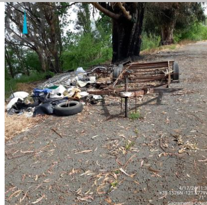
View of burnt trailer and other garbage on levee crown. (Spring 2024)