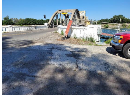
Water-Side: View of levee berm looking from crown