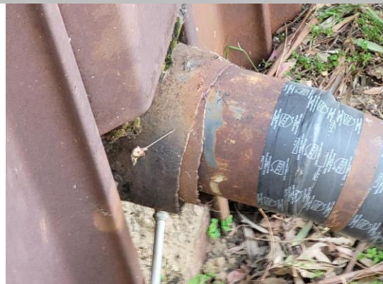
Water-Side: View of double sleeving at the retaining wall