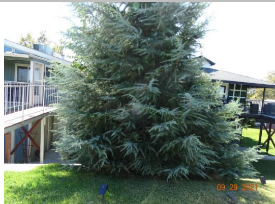
View of landscaping tree on the landside slope (Fall 2021).