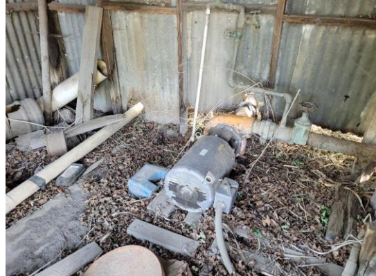
Land-Side: Pump inside the pumphouse