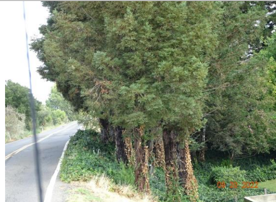
View of the landscaping on the LS shoulder and slope (Fall 2022).