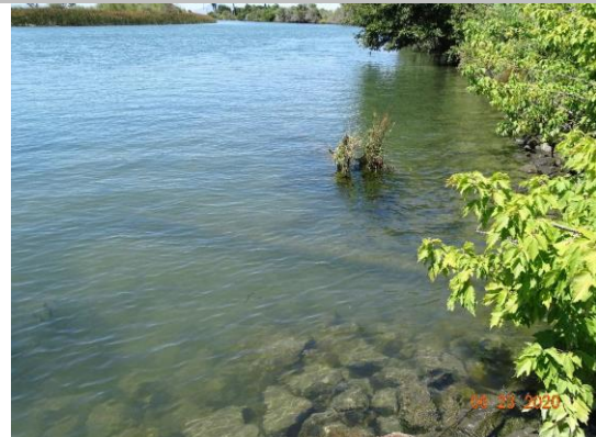
Water-Side: Pipe under water in the stream