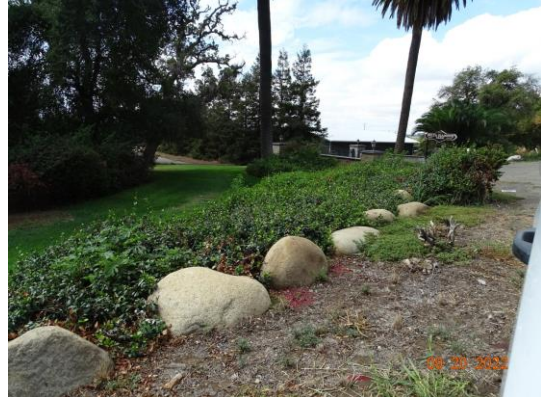
View of the landscaping on the LS slope (Fall 2022).