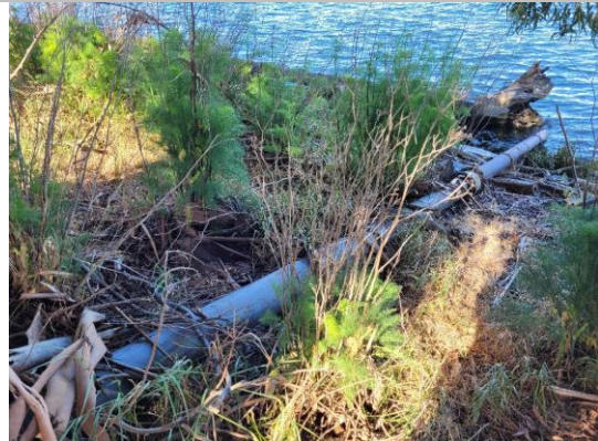
Water-Side: View of pipe at riverbank