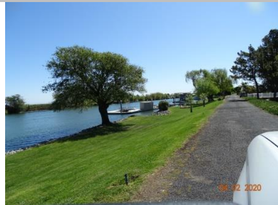
View looking downstream at sprinklers on the waterside slope (Spring 2020).