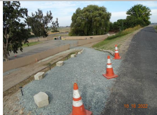
View of the ramp going down the LS slope (Fall 2022).