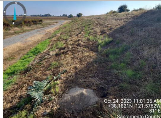
View of rodent holes on the landside slope. Fall 2023.