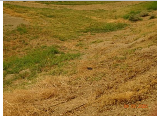
View looking downstream at animal holes in the landside slope (Fall 2020).