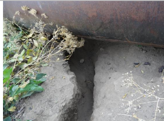
Evidence of internal erosion visible on LS.