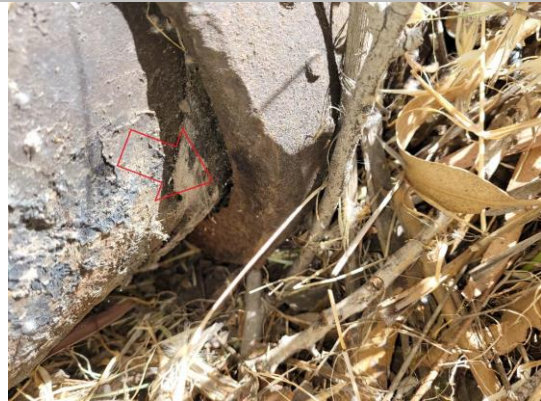
Water-Side: Sealed annular space between pipes visible on levee slope