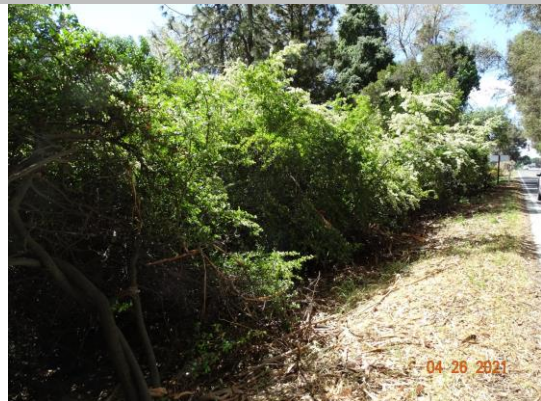
View looking downstream at landscaping on the landside slope (Spring 2021).