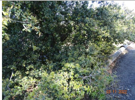
View of thick tree on the landside shoulder (Spring 2022).