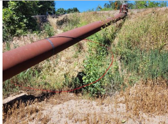
Land-Side: Excavation under pipe on levee slope. Approximate size is outlined in red