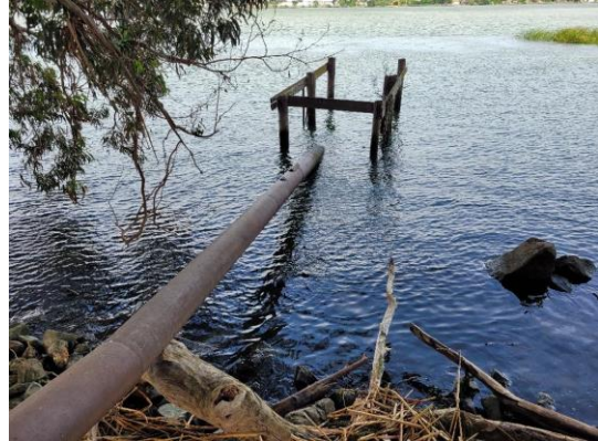
Water-Side: View of pipe at riverbank