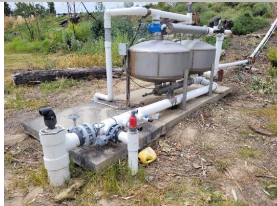
Land-Side: Sand filters off levee toe