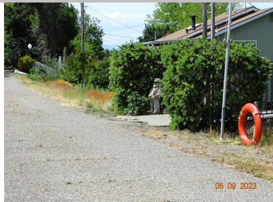
View of the landscaping on the LS slope (Spring 2023).