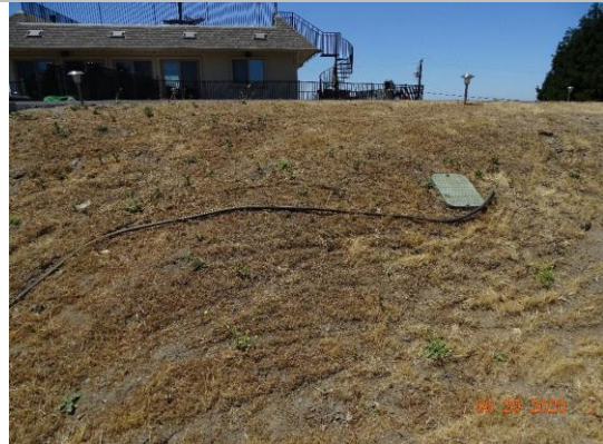
Water-Side: View of levee slope looking towards crown. Cable is exiting ground on the slope