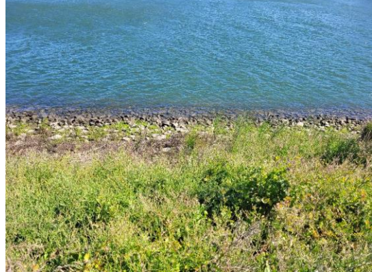
Water-Side: View of levee slope looking from crown. Pipe not found