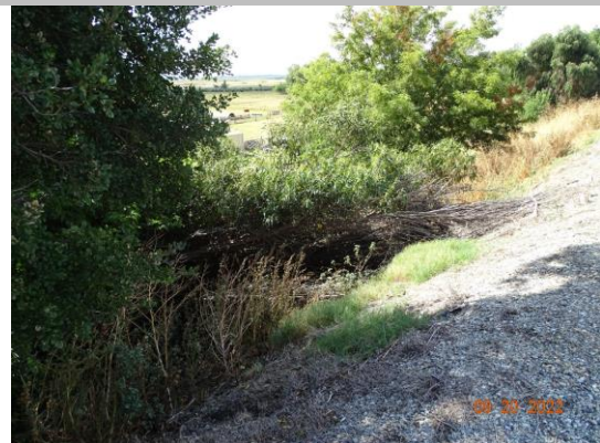
View of the fallen tree on the LS slope (Fall 2022).