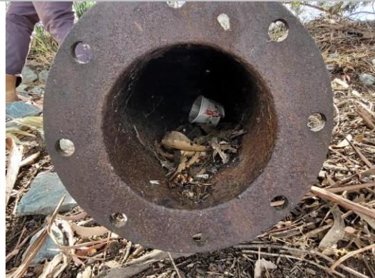
Water-Side: Open pipe end