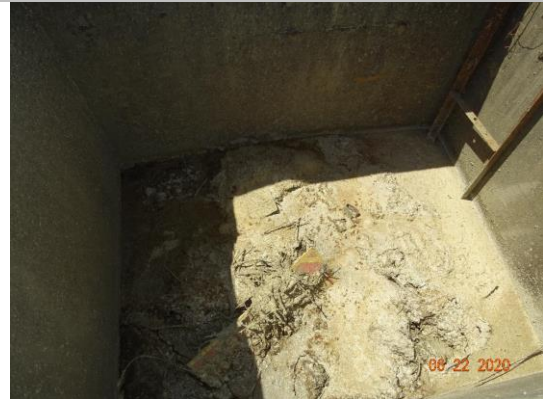
Land-Side: Silt in the bottom of CB is present inside of concrete box. Silt in the bottom of CB is present