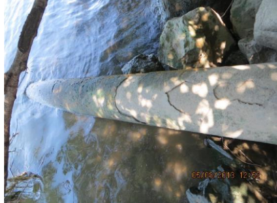
10-inch pipe at WS toe.