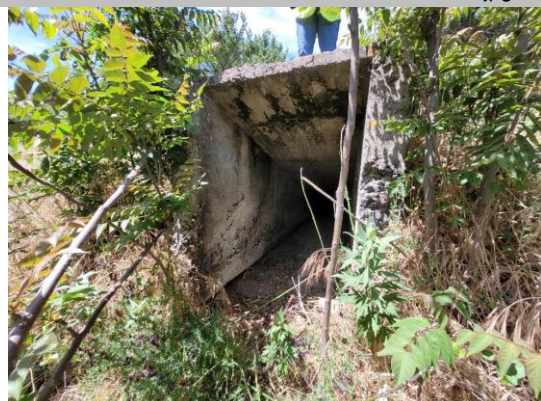
Land-Side: View of the landward end of tunnel