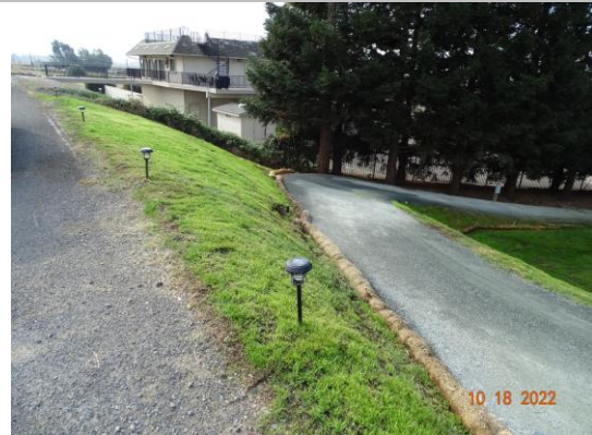
View of the ramp going down the LS slope (Fall 2022).