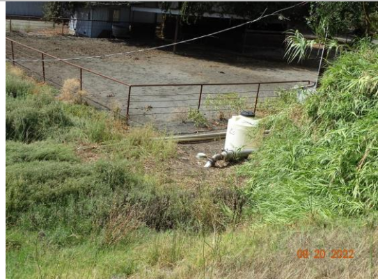
View of the irrigation pipe obscured by vegetation along the LS toe (Fall 2022).