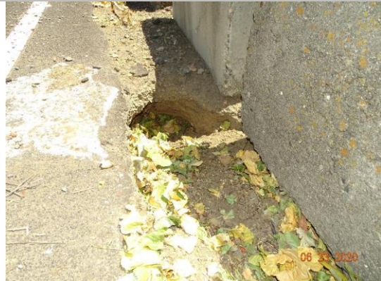
Water-Side: Sinkhole on levee shoulder at the edge of road pavement