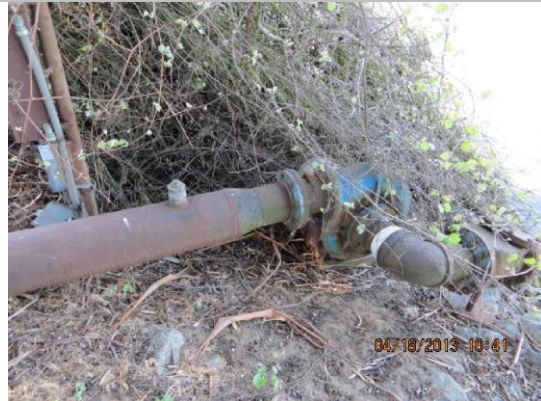
Pump on WS berm.