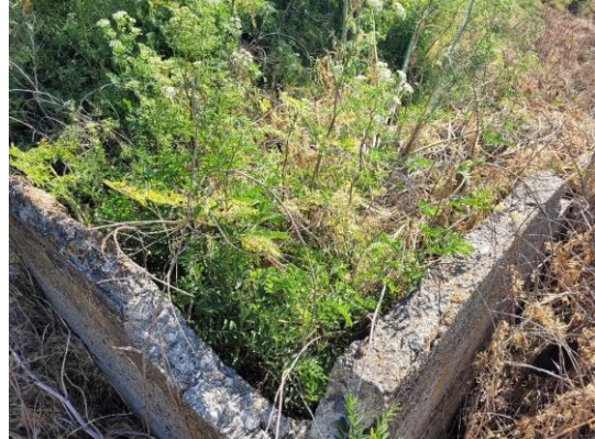
Land-Side: Concrete distribution box at levee toe missing parts of walls, filled with dirt