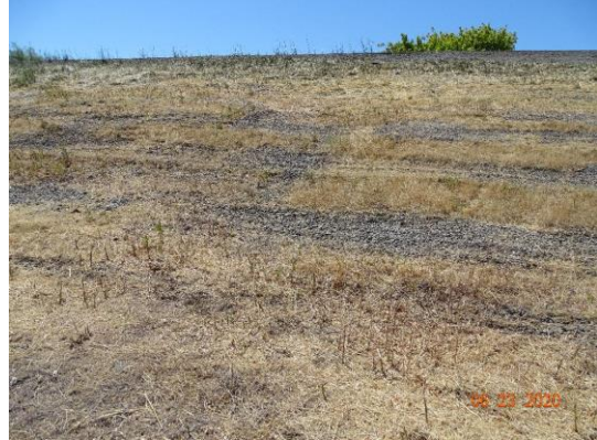
Land-Side: View of levee slope looking from toe