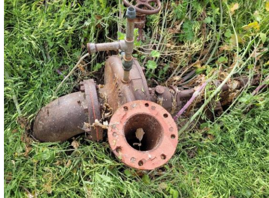
Land-Side: Abandoned pump at levee toe. Discharge pipe removed