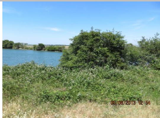
Pipe visible at WS toe to left of tree in photo.