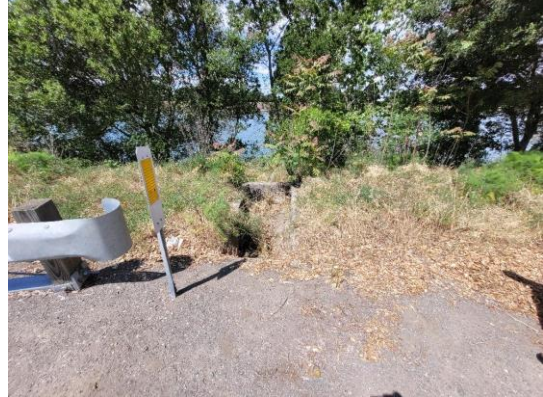
Water-Side: View of levee slope looking from crown. Concrete box on levee shoulder