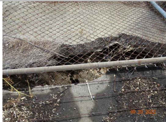
View of the erosion below the crack in the concrete (Fall 2022).