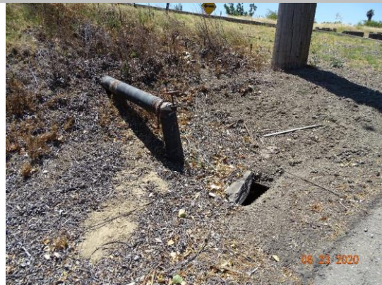
Land-Side: Open concrete spill box, pipe and levee slope