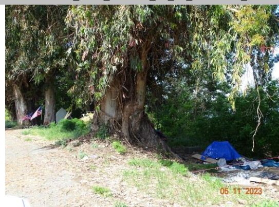
View of the tents on the WS slope (Spring 2023).

Photo 1 of 1 : SP_2024_NA0002_63_34_20240301_00009.jpg