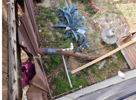
Water-Side: Pipe at the retaining wall on the property