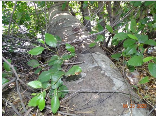
Water-Side: View of pipe at riverbank. Siphon breaker installed on the pipe at this place