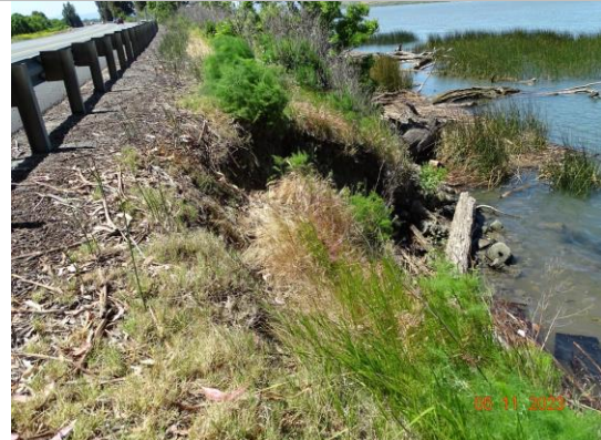
View of the sloughing at LM 8.97 (Spring 2023).