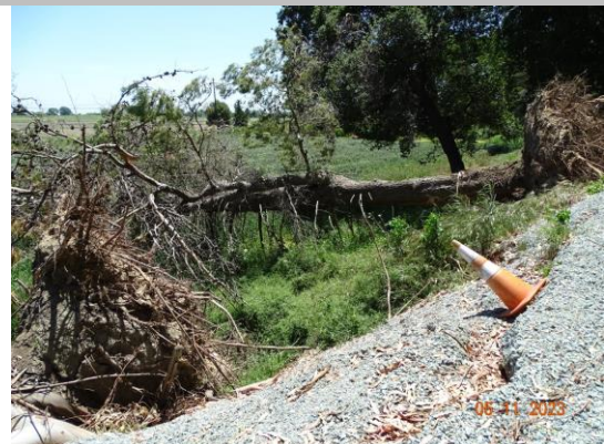
View of the fallen trees with root balls on the LS slope (Spring 2023).