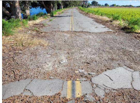
Top of Levee: View of levee crown looking upstream. Removed pavement from the top of crown in pipe alignment