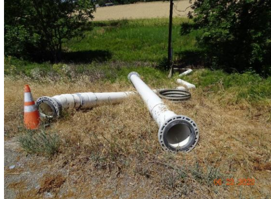
Land-Side: View of levee slope looking from crown. Dismantled PVC pipe on slope