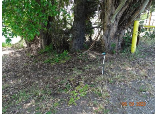
View of the sprinkler emitter on the WS slope (Spring 2023).