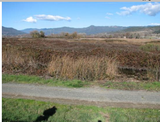
Approximate location of inlet on LS toe (not visible).