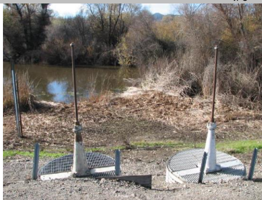
Slide gates in CMP risers on WS shoulder.