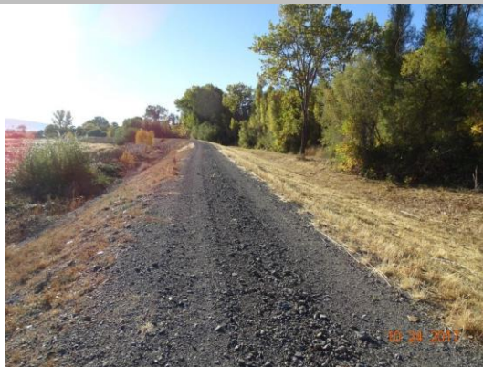
View of no vegetation on both slopes.