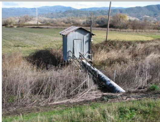
Pumphouse on piles at LS toe.