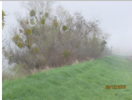
View of the trees along the waterside slope and toe.