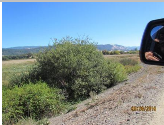
View of the large bushes limiting visibility and access.