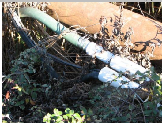
12-inch pipe and appurtances on WS shoulder.