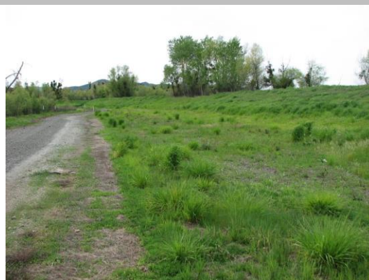
Photo taken at LM 6.41 looking west showing overgrown LS slope of levee at right and toe road at left. Note trees obstructing visibility and access at levee crown. Crown is +/- 5 feet wide, and impassable to vehicles due to vegetation, and in some places, to pedestrians.