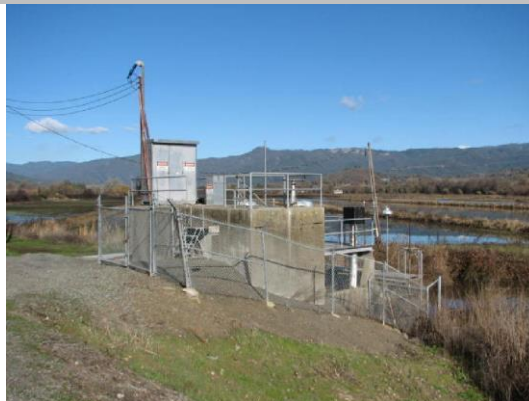
Pumping plant on LS shoulder.