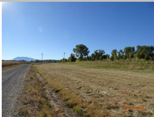
View of no vegetation on the landside slope.