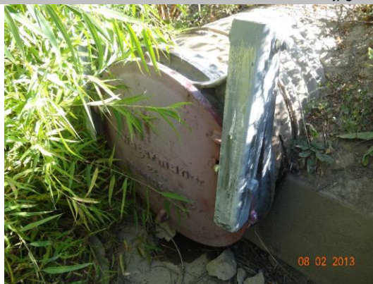
New flap gate on WS