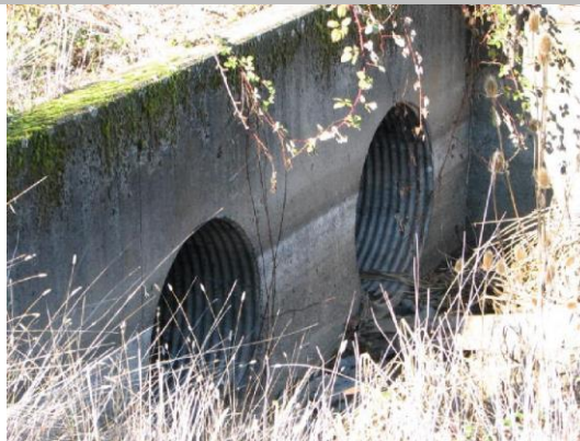
Concrete headwall at inlet on LS toe.