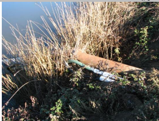
12-inch pipe and appurtances on WS shoulder.