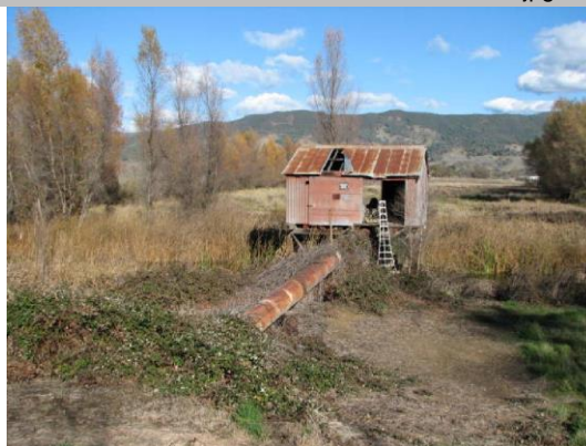
24-inch steel pipe and pump house on LS.