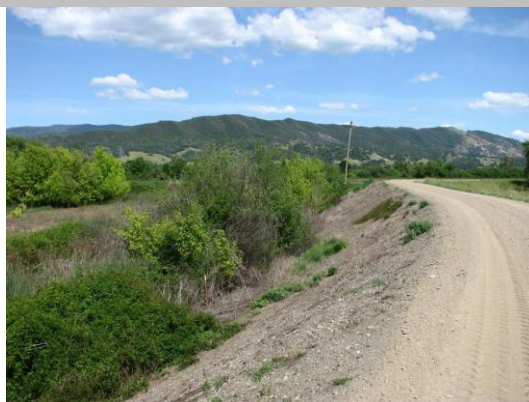
5/2/2016: Remove or trim dense vegetation growing on fence to allow visibility and access to L/S toe.