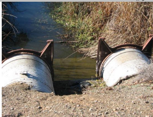
pipe and flap gate on WS toe.