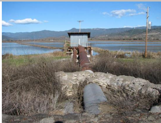
Pumping plant, pipes, and ring levees on LS toe.