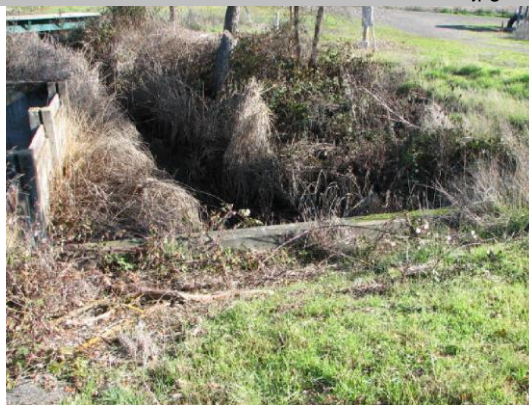
Concrete dam/weir and channel on LS toe.