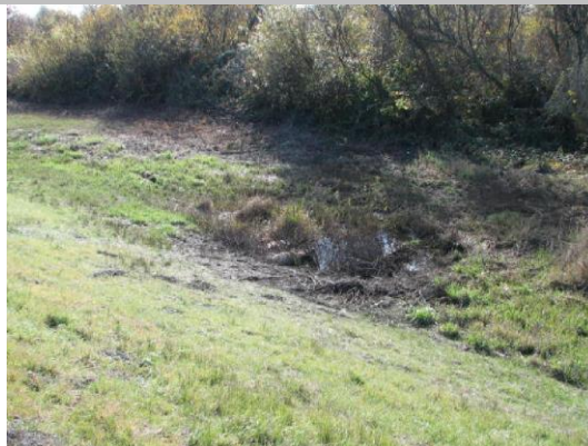
24-inch CMP at outlet on WS toe.