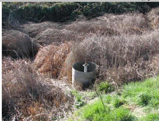
36-inch CMP riser and slide gate on WS slope.