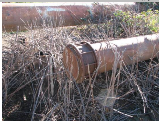
Steel plate welded over end of pipe at LS toe.