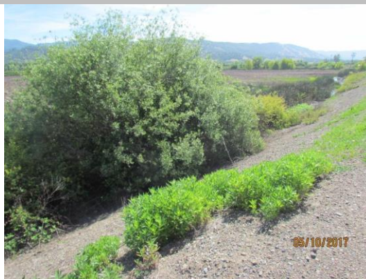
View of the trees along the landside toe.