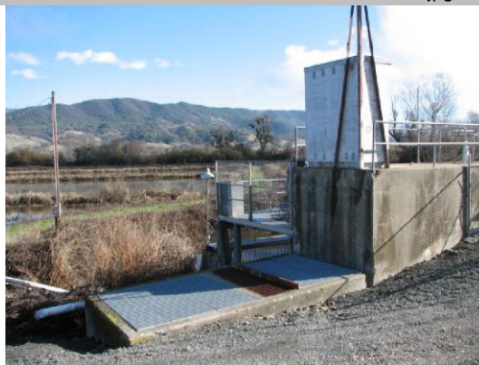
Pumping plant on LS shoulder.