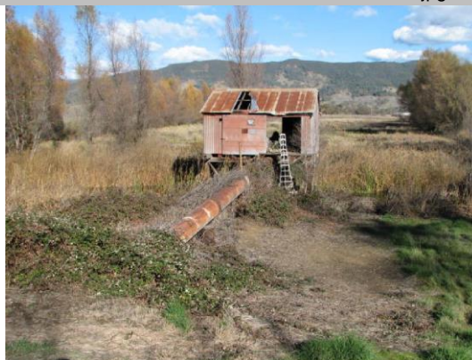
Pumping plant in shed on LS at drainage ditch.