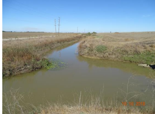
Upstream view of Colusa Basin from the diversion structure. Fall 2018.