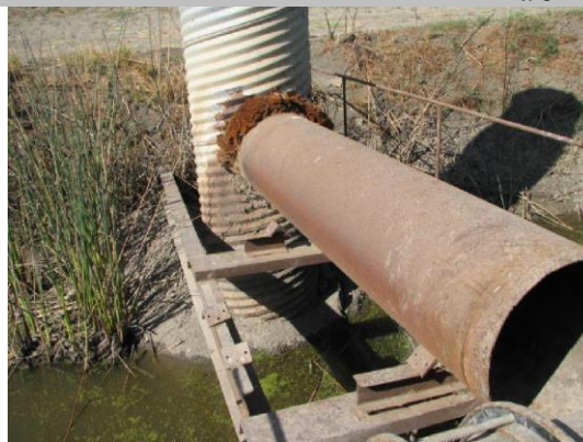
36-inch CM standpipe with steel pipe extension for weir on LS toe.