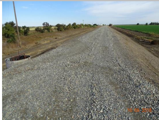
View of levee crown at crossing.