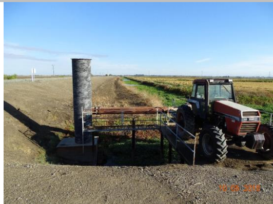
Pumping plant at LS toe.