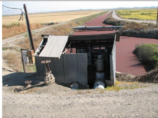
Pump house on LS slope.