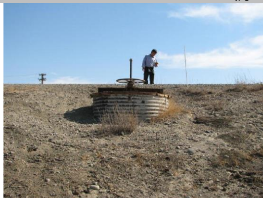
60-inch CMP riser with slide gate on WS slope.