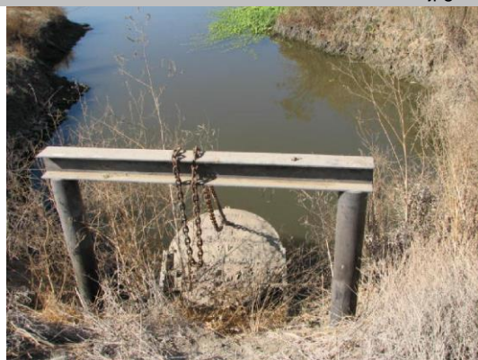
48-inch flap gate on WS toe.