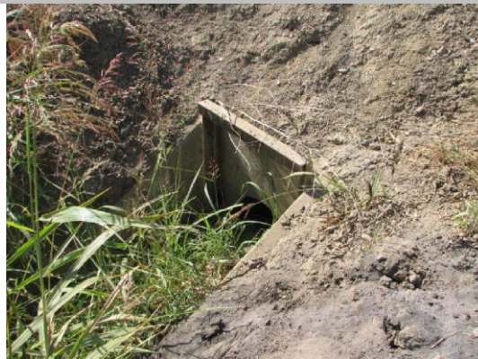
Concrete U shaped headwall at LS inlet.