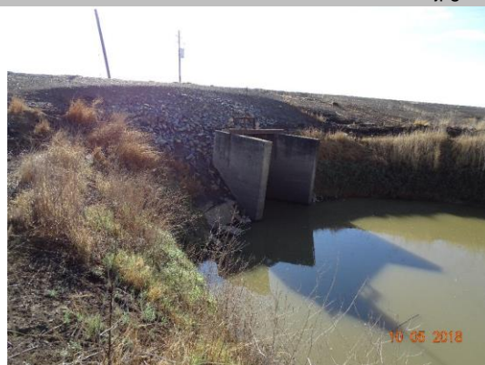
Overview of headwall at WS toe.