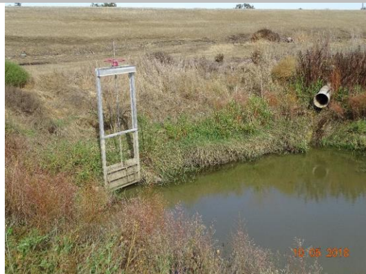
Headwall with slide gate at LS toe.