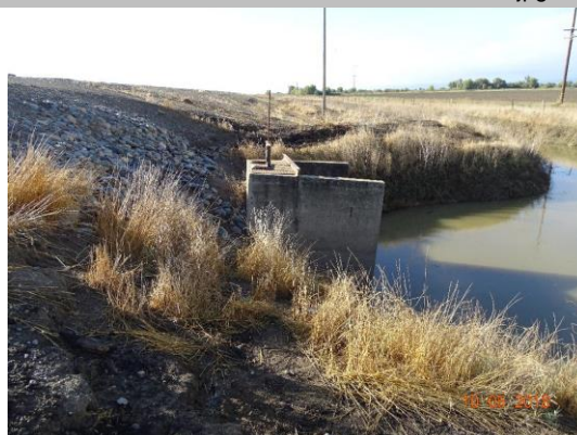
Headwall at WS toe.