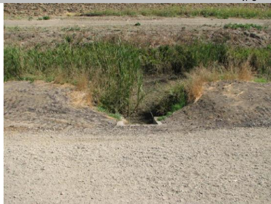
Concrete U shaped headwall on LS toe.