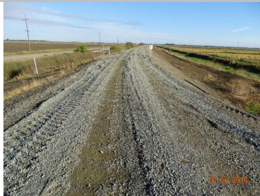
View of levee crown at crossing.