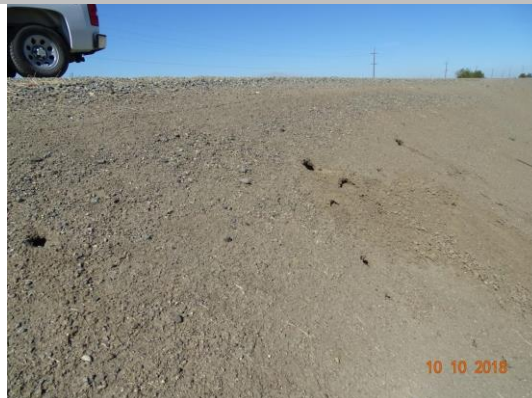
View of rodent holes on the landside slope. Fall 2018.