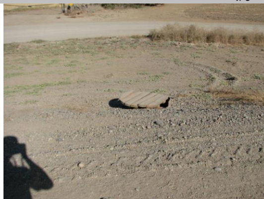
cover on 36-inch CMP standpipe on WS slope.