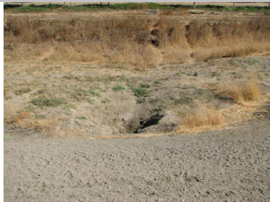
Intake at LS toe.