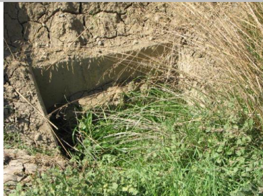
Concrete U shaped headwall at LS toe.