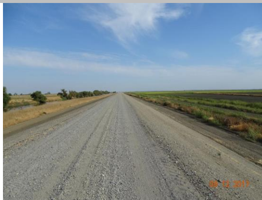
View of no vegetation on both slopes.