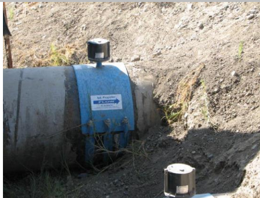
24-inch pipe on LS slope.