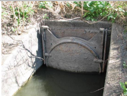
Flap gate in concrete U-shaped headwall at WS toe.