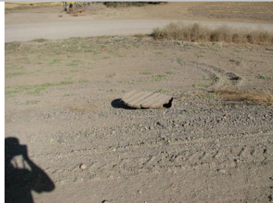
cover on 36-inch CMP standpipe on WS slope.