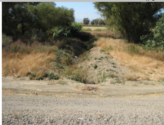
Outlet at WS toe.