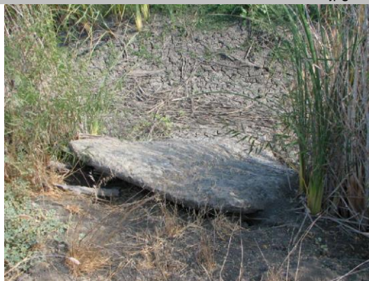
Apparent inlet clogged with concrete or grout on LS toe in drainage swale.