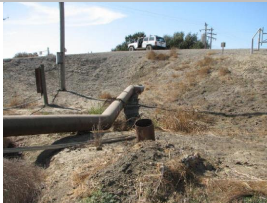
Pipe through levee at LS slope.