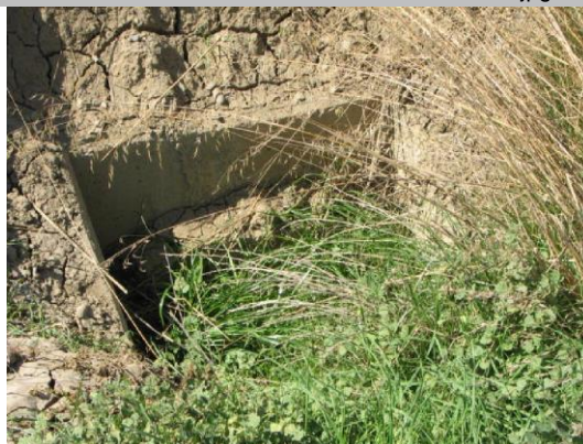
Concrete U shaped headwall at LS toe.