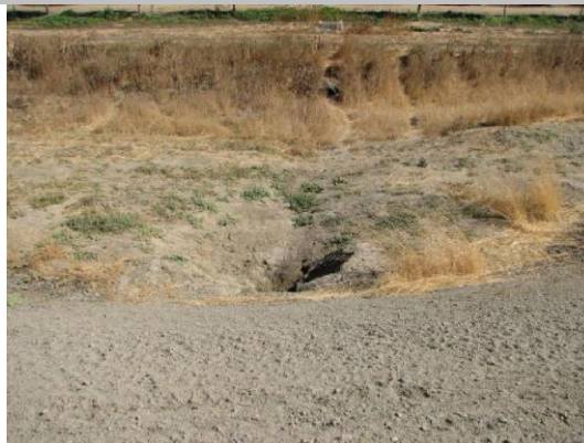
Intake at LS toe.