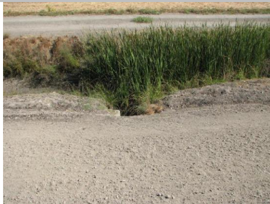
Concrete headwall at LS toe.