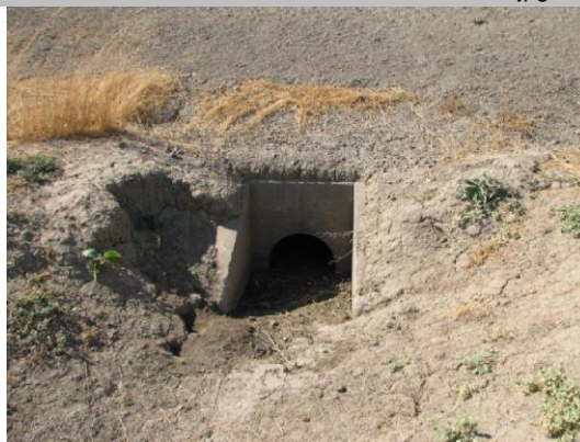
Inlet and concrete headwall on LS toe.