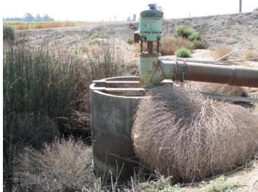
Pump on Concrete riser at LS toe.