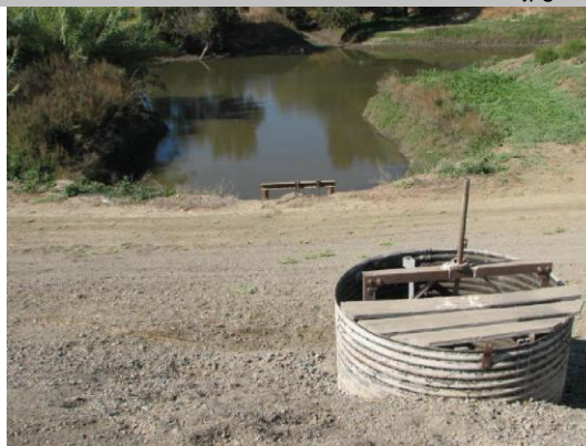
Slide gate in corrugated metal riser on WS slope.