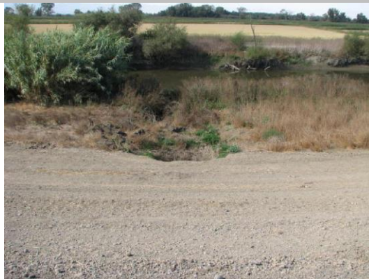
Outlet on WS toe.