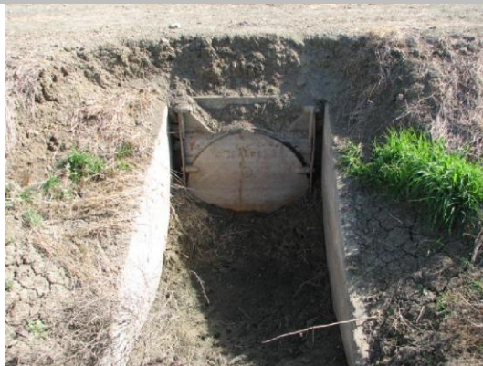
Concrete U shaped headwall and flap gate on WS toe.