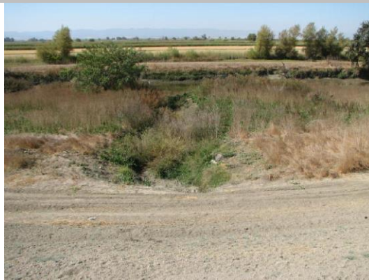
Drainage Swale on WS toe.