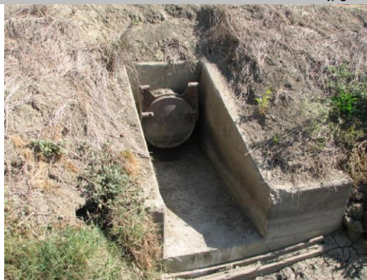
Concrete headwall and flap gate at WS toe.