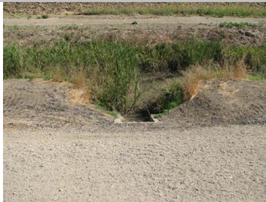
Concrete U shaped headwall on LS toe.