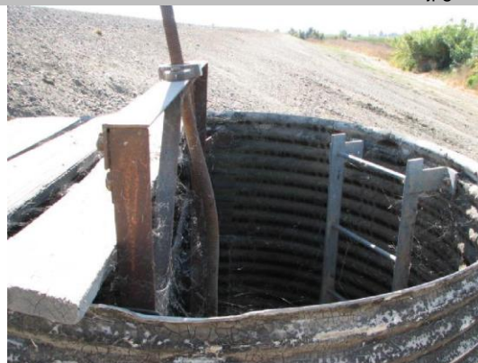
Bent screw for slide gate at WS shoulder.