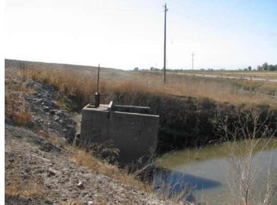
Tilting headwall on WS toe.