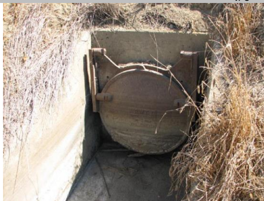
Concrete U shaped headwall and flap gate on WS toe.