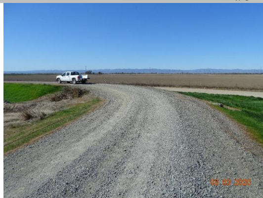
View of levee crown at crossing looking downstream

LS : Land Side N/A : Not Applicable WS : Water Side CR : Crown