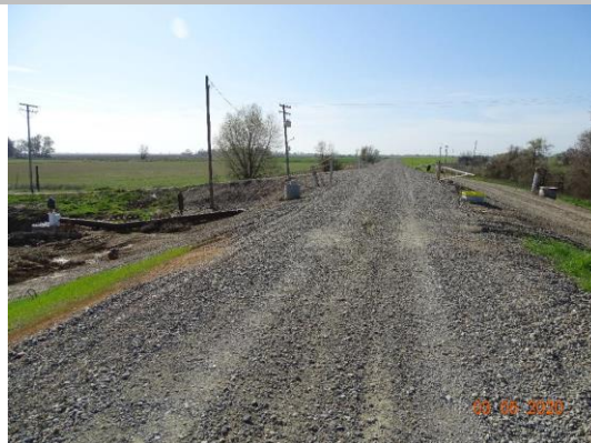
View of levee crown at the crossing looking downstream