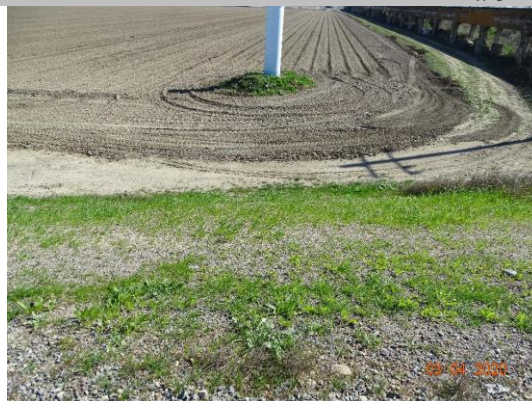
View of LS slope looking from levee crown. PVC pipe in the field doesn't belong to this crossing