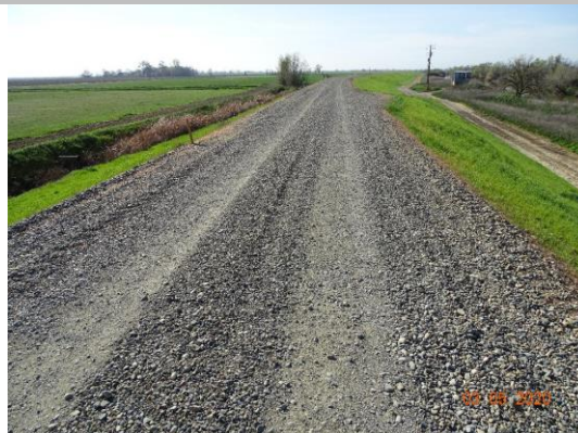
View of levee crown at the crossing looking downstream