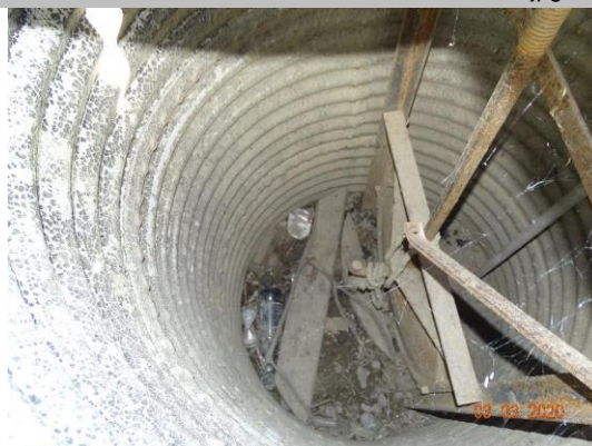
View inside of CMP riser on WS shoulder