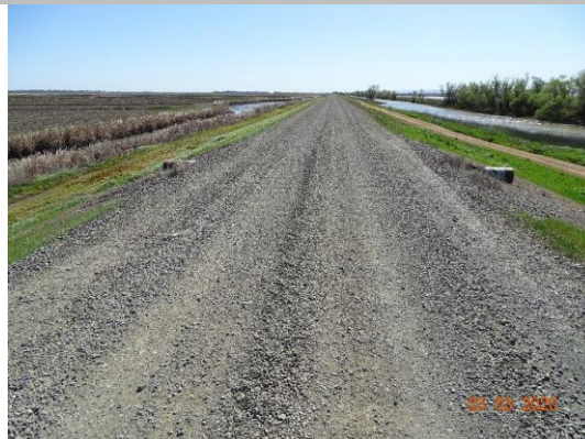
View of levee crown at crossing looking downstream