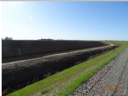
View of irrigation ditch at the landside toe. Spring 2021.