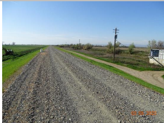
View of levee crown at the crossing looking downstream