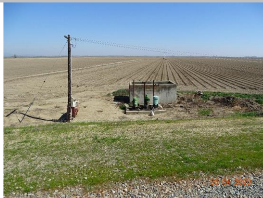
3 pumps, concrete distributionbox, power pole with electrical panel on LS