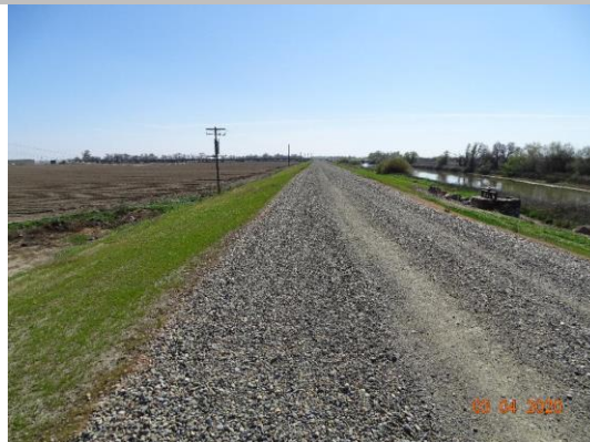
View of levee crown at the crossing