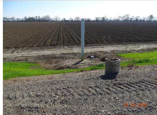
View of LS looking from crown