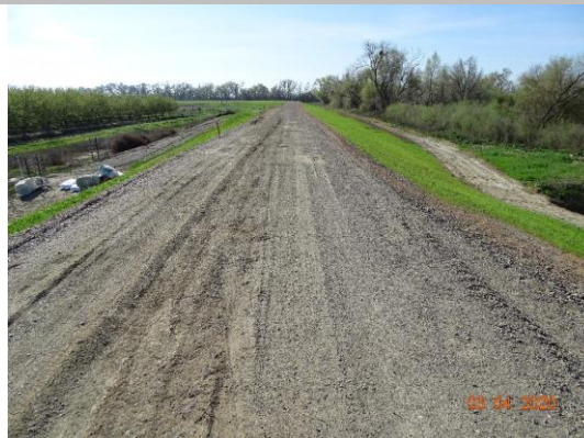
Levee crown at the crossing