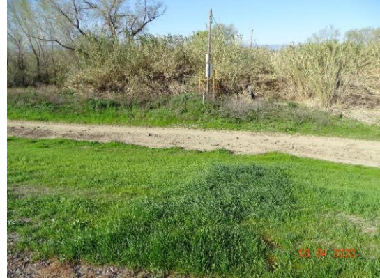
View of WS looking from crown