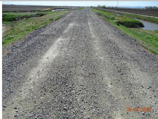
View of levee crown at potential crossing looking downstream