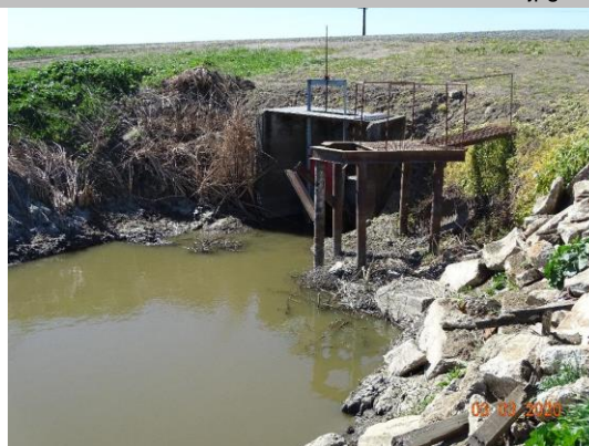
Abandoned pumping platform in irrigation canal on LS