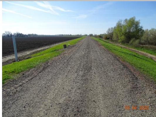
View of levee crown at the crossing looking downstream