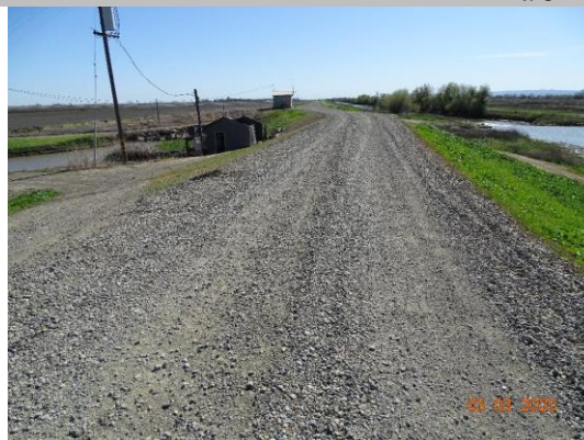
View of levee crown at the crossing looking downstream