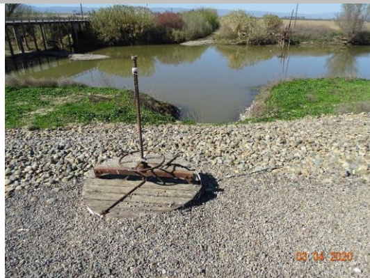
60-inch standpipe with slide gate on WS slope with outlet in background.