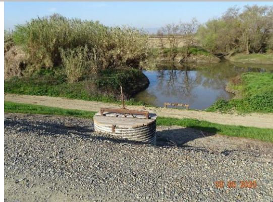
View of WS looking from levee crown. CMP riser with slide gate on WS shoulder