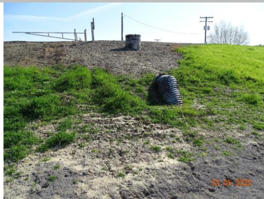
CMP pipe daylights on WS slope