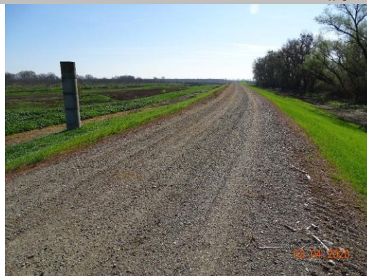
Levee crown at the crossing looking downstream

LS : Land Side N/A : Not Applicable WS : Water Side CR : Crown