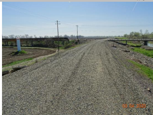
View of levee crown at crossing looking downstream