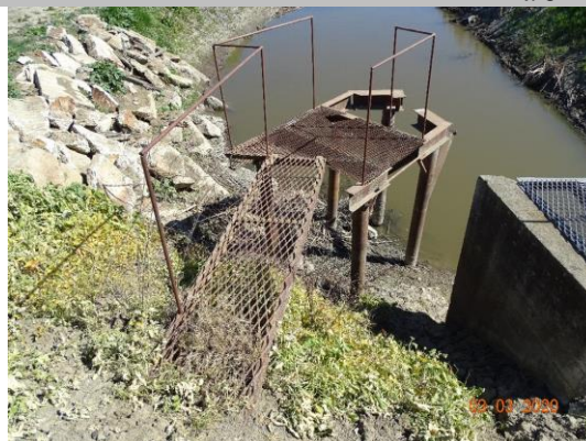
Steel walkway to former pumping platform in irrigation canal on LS