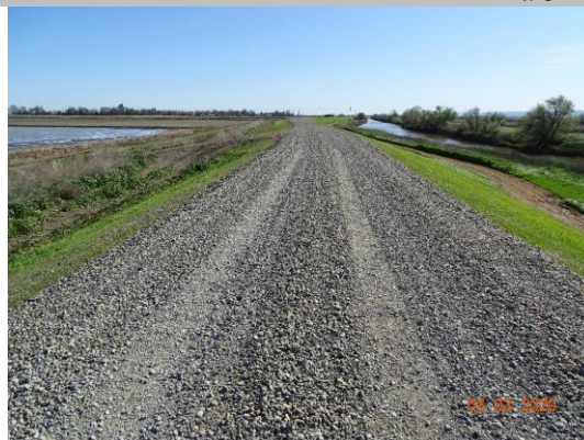
View of levee crown at the crossing looking downstream

LS : Land Side N/A : Not Applicable WS : Water Side CR : Crown