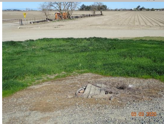
Water-Side looking from the crown