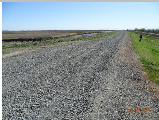
View of levee crown at the crossing looking downstream