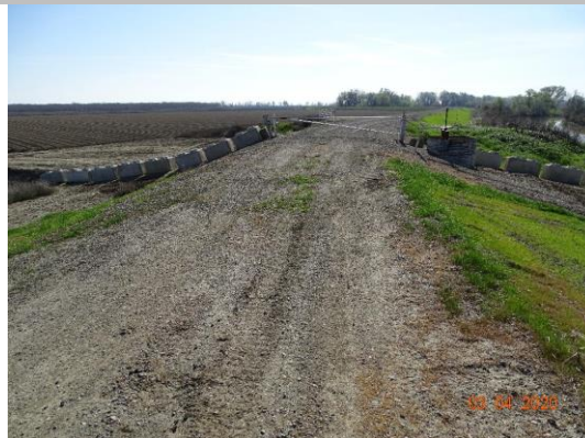
View of levee crown at the crossing looking downstream