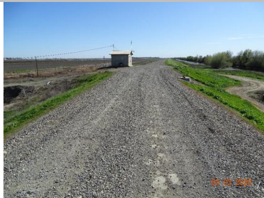
View of levee crown at the crossing looking downstream