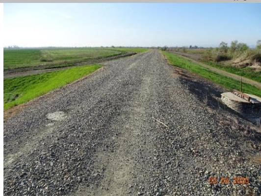
View of levee crown at the crossing looking downstream