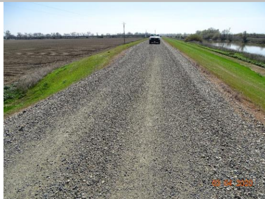
View of levee crown at the crossing looking downstream