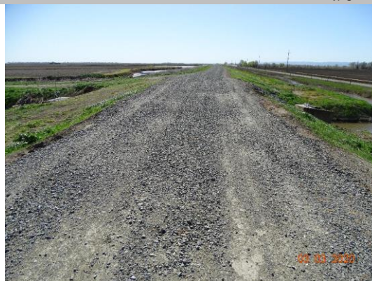
View of levee crown at the crossing looking downstream