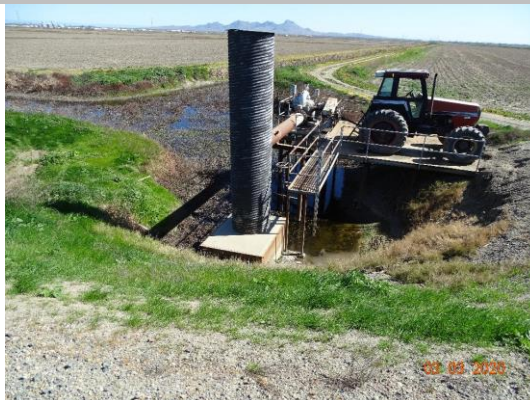
Stanspipe, pump in drainage ditch, and tractor used as a pump motor on LS