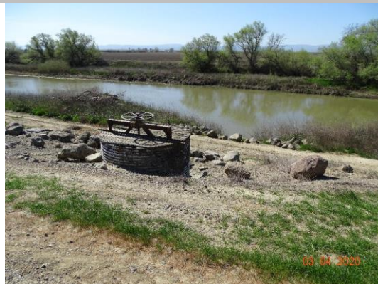
84-inch CMP riser with slide gate on WS shoulder