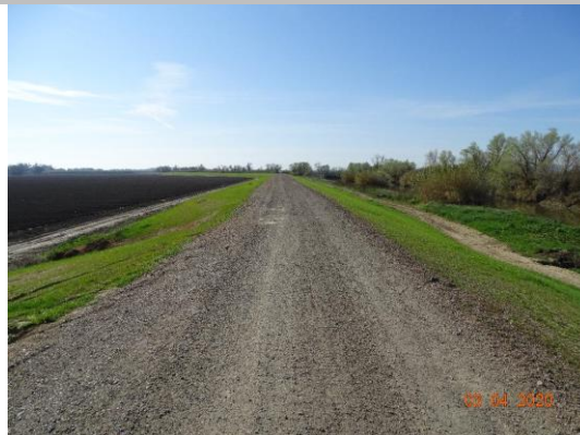
Levee crown at the crossing