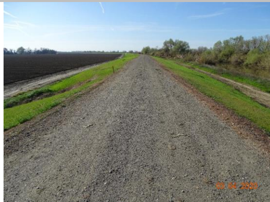
View of levee crown at the crossing looking downstream