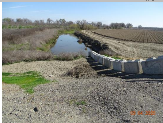
Drainage ditch on LS toe. Looking from levee crown