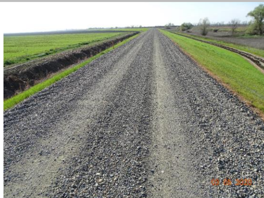
View of levee crown at the crossing