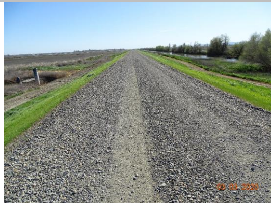
View of levee crown at the crossing looking downstreams