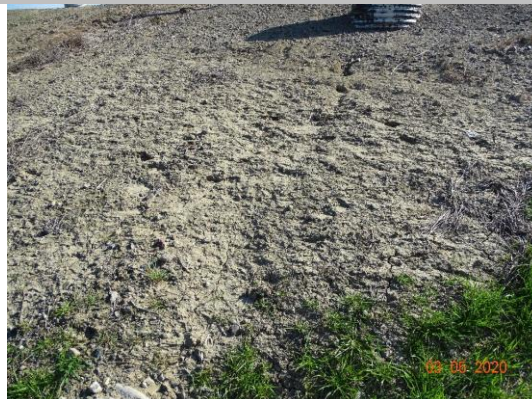
View of WS slope looking from levee toe