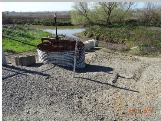
84-inch CMP riser with slide gate on WS shoulder