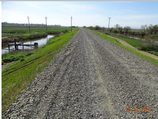
View of levee crown at the crossing looking downstream