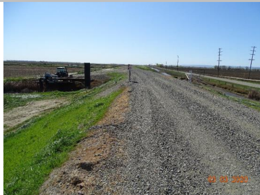
View of levee crown at the crossing looking downstream