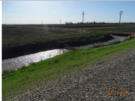
View of ditch at the landside toe. Spring 2021.

LS : Land Side N/A : Not Applicable WS : Water Side CR : Crown