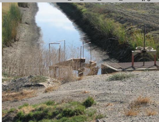
Pump platform at center left of photo.