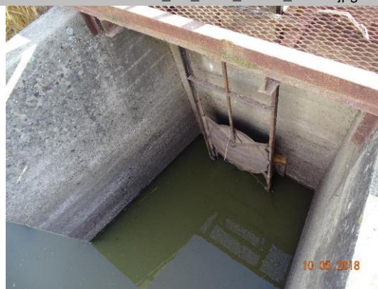
Inside view of concrete headwall and slidegate at WS toe.