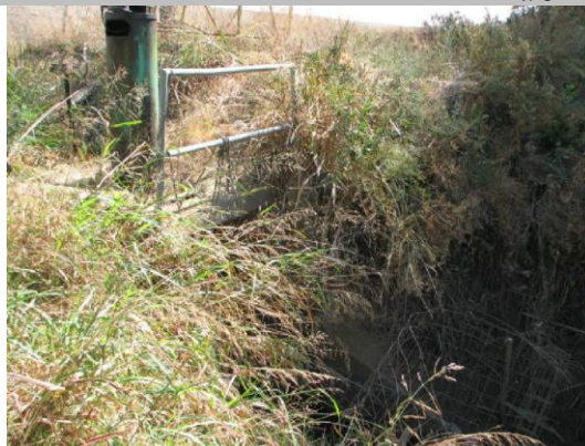
Pump and concrete headwall at WS toe.