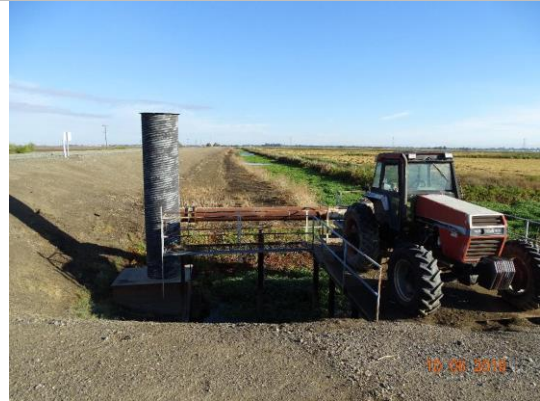
Pumping plant at LS toe.