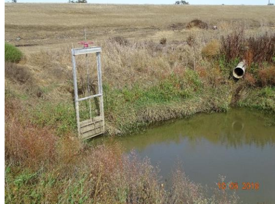
Headwall with slide gate at LS toe.