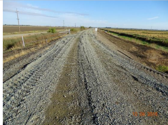
View of levee crown at crossing.