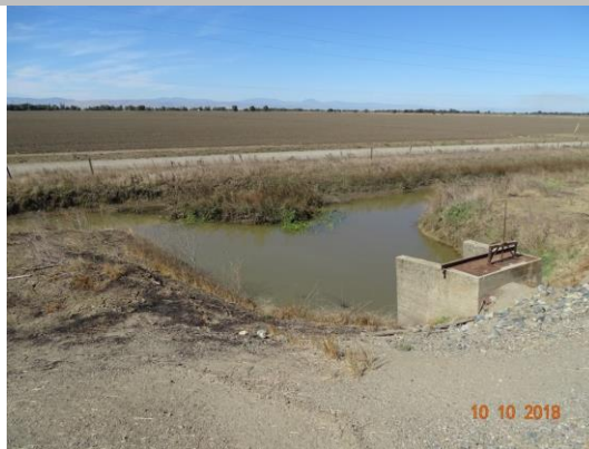
View of diversion structure. Fall 2018.