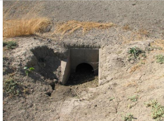
Inlet and concrete headwall on LS toe.