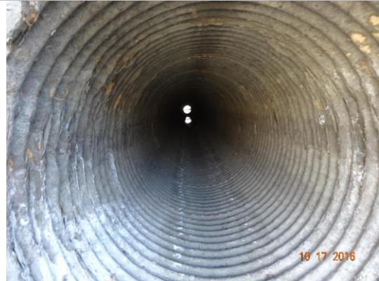
View inside of pipe from the WS