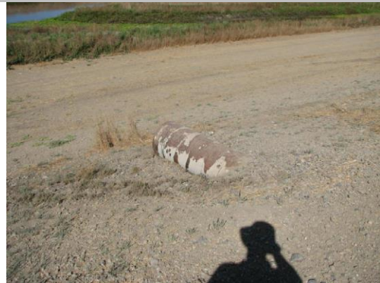
Pipe on WS.