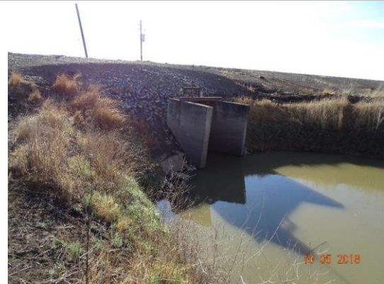
Overview of headwall at WS toe.