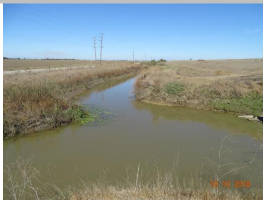
Upstream view of Colusa Basin from the diversion structure. Fall 2018.