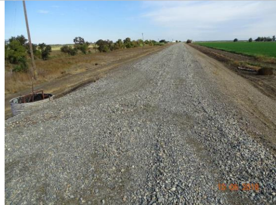
View of levee crown at crossing.