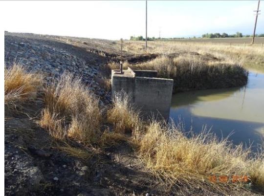
Headwall at WS toe.