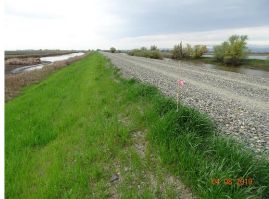
View of the sloughing on the landside slope. Spring 2019.