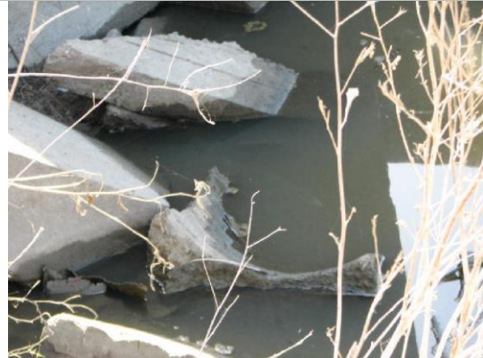
headwall debris on LS toe showing evidence of 18-inch cmp.