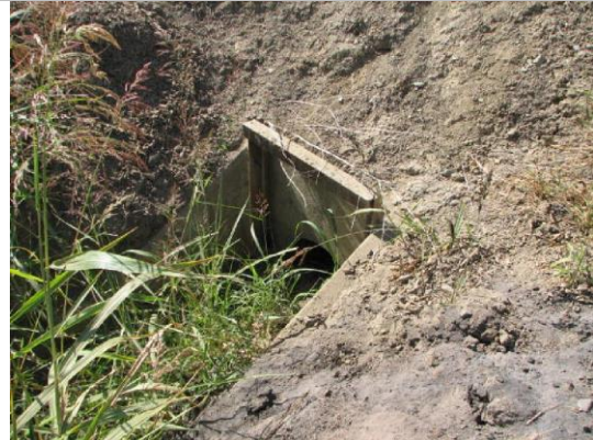
Concrete U shaped headwall at LS inlet.