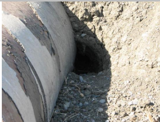
Animal burrows along side of pipe LS.