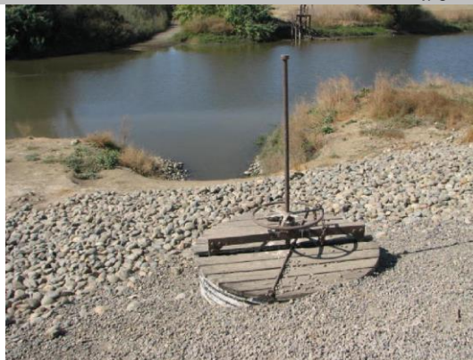
60-inch standpipe with slide gate on WS slope with outlet in background.