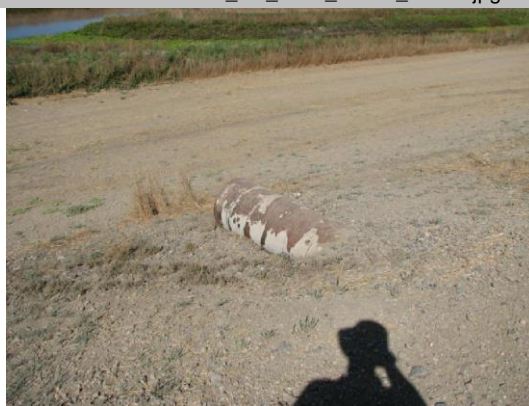
Pipe on WS.