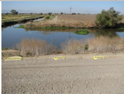
Siphon Breakers in risers on WS slope.