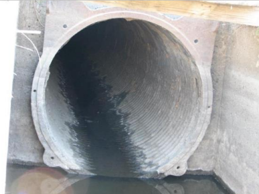
Corrugated metal pipe at outlet.