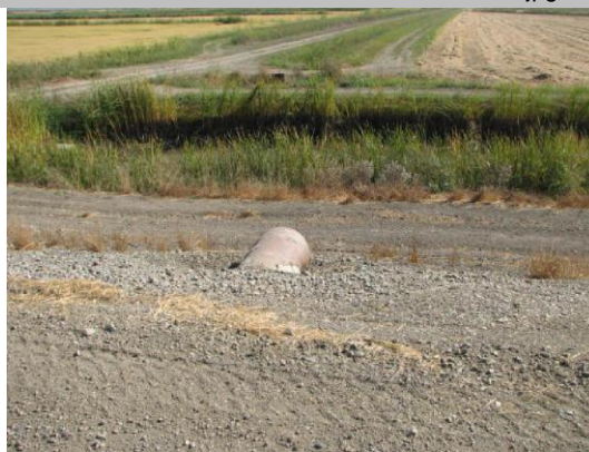
Pipe on LS.