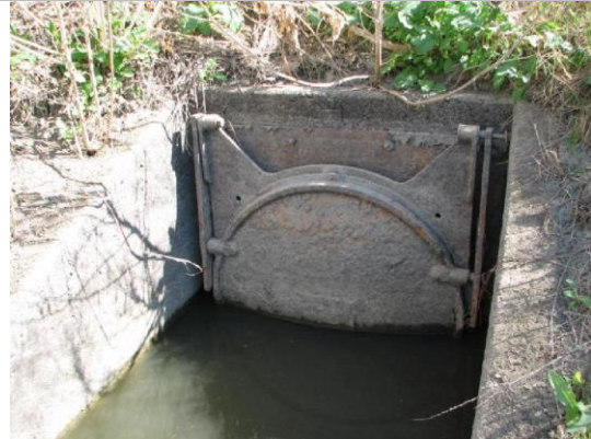
Flap gate in concrete U-shaped headwall at WS toe.