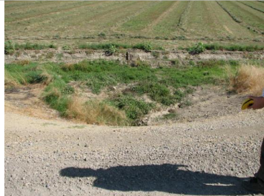
LS view of inlet.