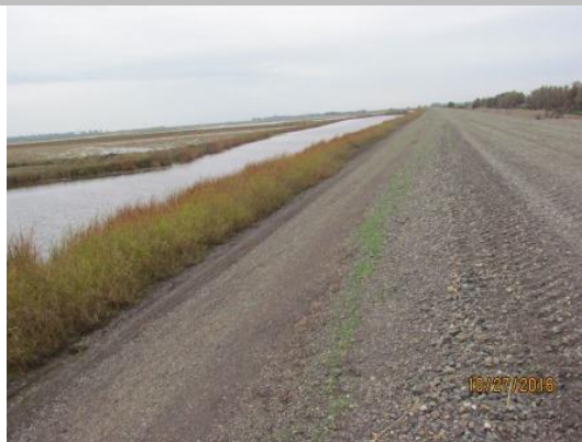
View of a ditch along the landside toe.