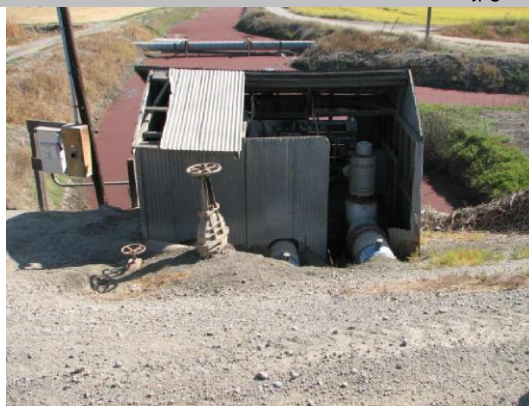
Pumphouse on LS slope.