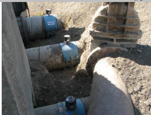
20-inch pipe at center of photo.