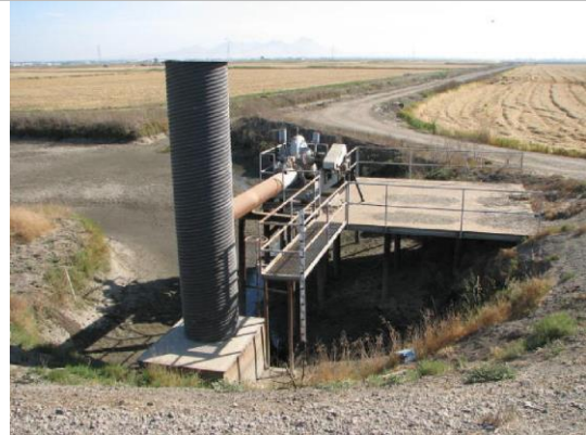
Pumping plant on LS toe.