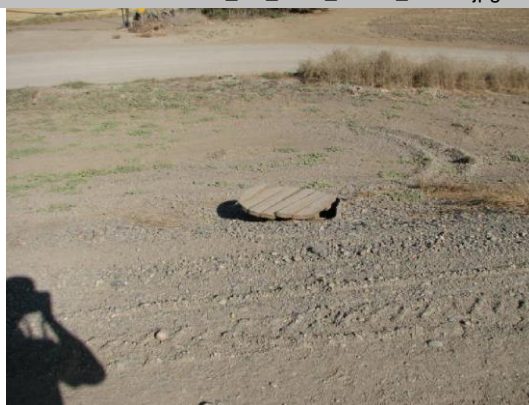
cover on 36-inch CMP standpipe on WS slope.