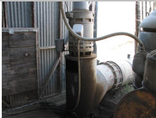
Pump with oil leakage shown on side of pipe.