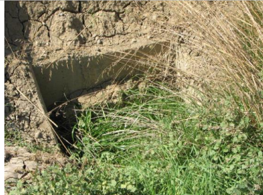
Concrete U shaped headwall at LS toe.