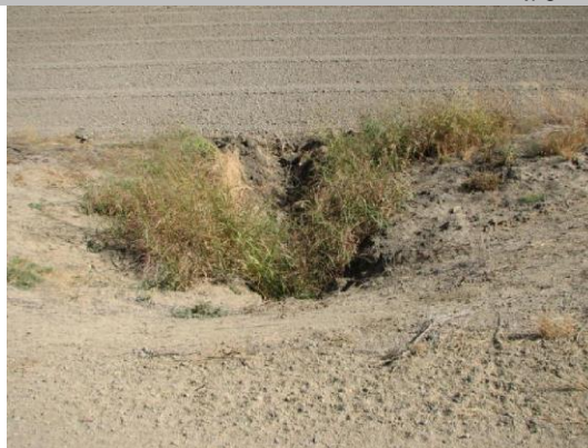
Intake on LS toe.