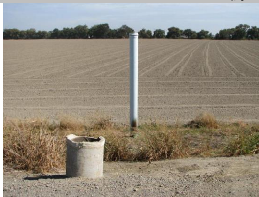
Concrete and PVC risers on LS.