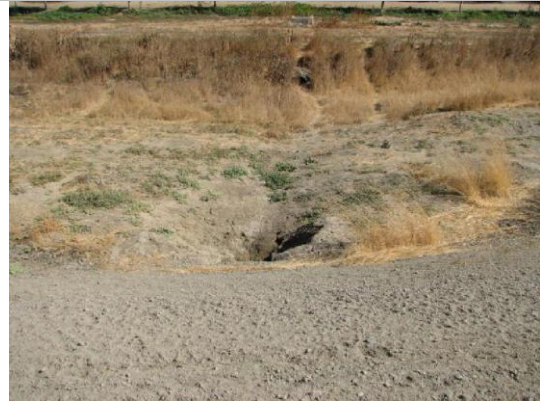
Intake at LS toe.