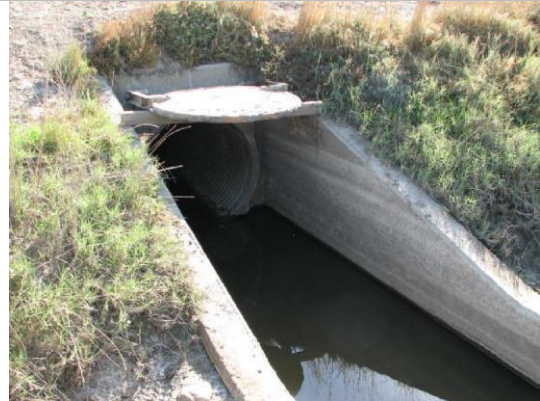
Flap gate and headwall on WS toe.