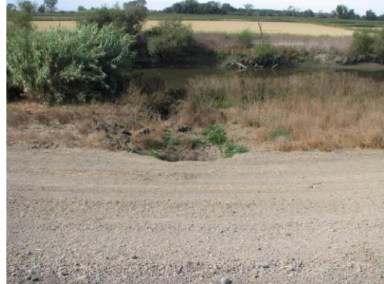
Outlet on WS toe.