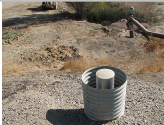
Possible siphon breaker for pipe on LS shoulder.