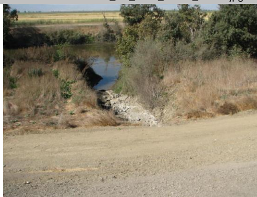
Outlet at WS toe.