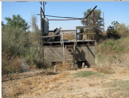
Pumping plant on WS toe.