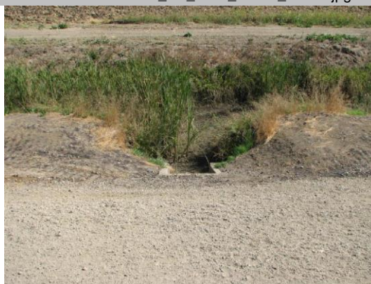
Concrete U shaped headwall on LS toe.