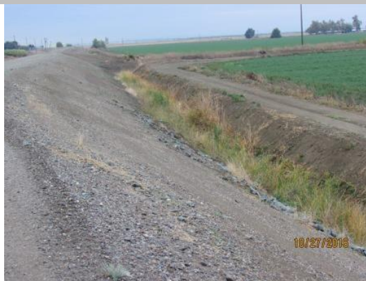
View of a ditch along the landside toe.