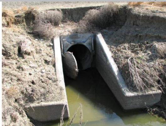
Flap gate in concrete U-shaped headwall on WS toe.

* Location LS : Land Side N/A : Not Applicable WS : Water Side CR : Crown