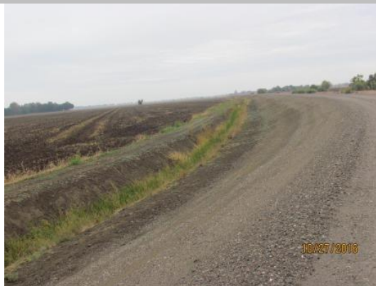
View of a ditch along the landside toe.