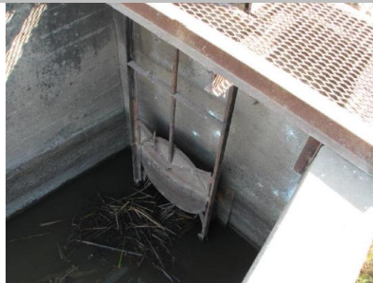
Slidegate on WS toe.