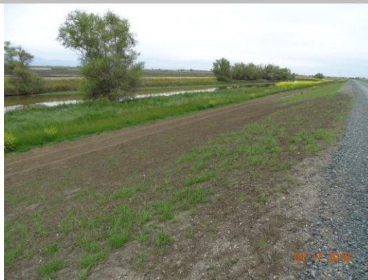
View of the repaired erosion along the waterside slope. The erosion was repaired by Sutter Maintenance Yard.