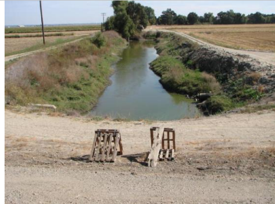
Drainage ditch on LS toe.