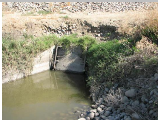
Flap gate and concrete headwall at WS toe.