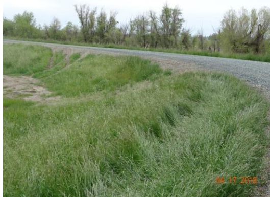
View of the vehicle erosion along the landside slope.