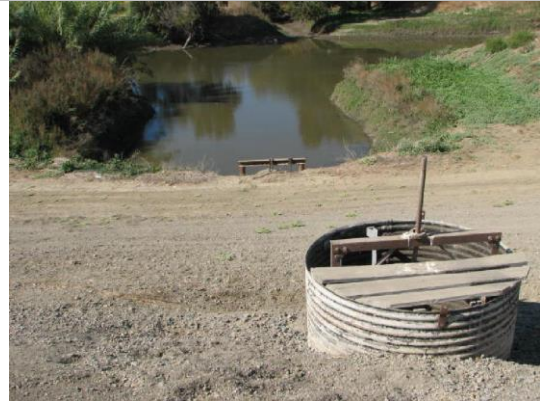
Slide gate in corrugated metal riser on WS slope.