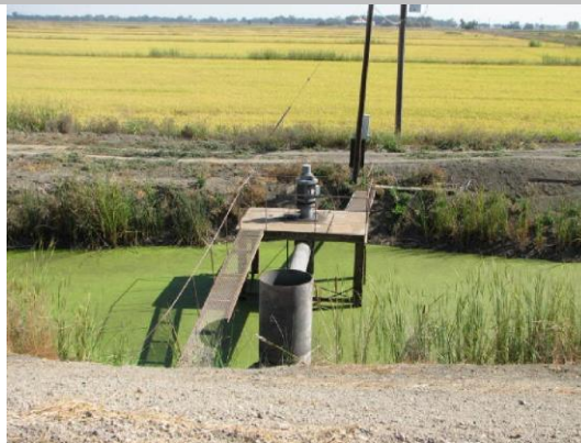
Pump, walkway, and standpipe on LS toe.