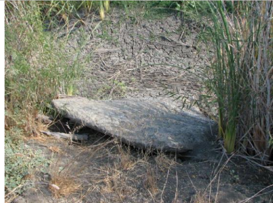
Apparent inlet clogged with concrete or grout on LS toe in drainage swale.