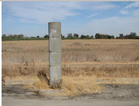
36-inch concrete riser on LS toe.