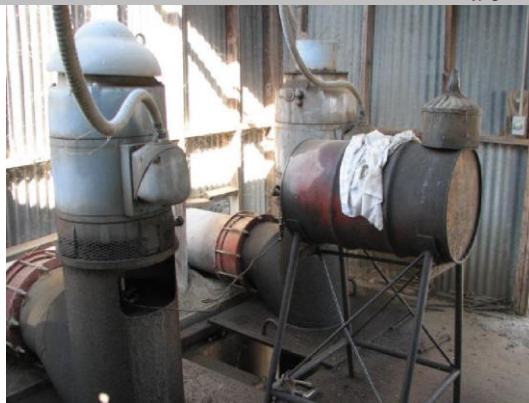
Pump for 20-inch pipe at left. See oil bouser and leakage around pumps.