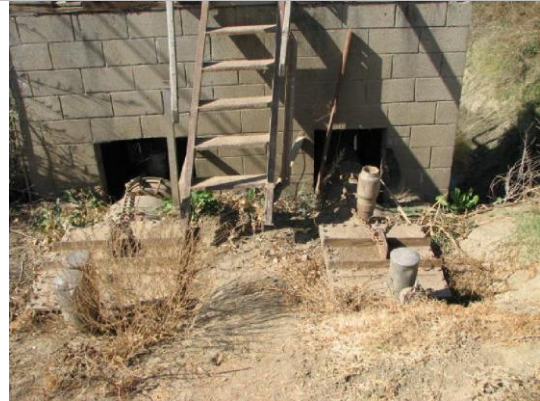
Pipe on seft side of photo.