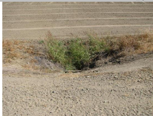
Inlet on LS toe.