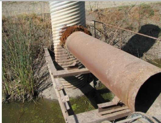
36-inch CM standpipe with steel pipe extension for weir on LS toe.