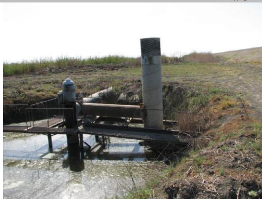
36-inch CM standpipe with steel pipe extension for weir on LS toe. pump not associated with storm drain crossing.