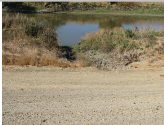
Outlet channel on WS toe.