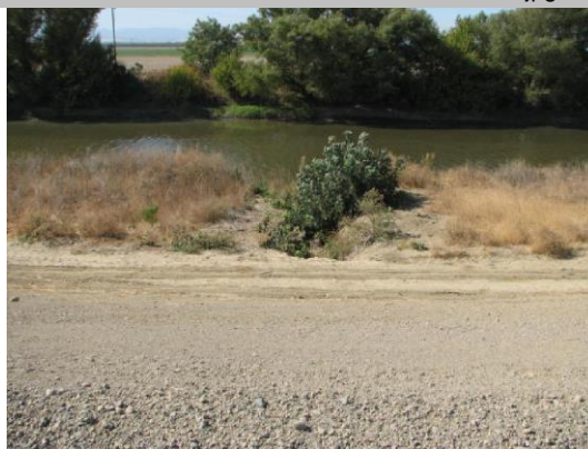
Outlet at WS toe.