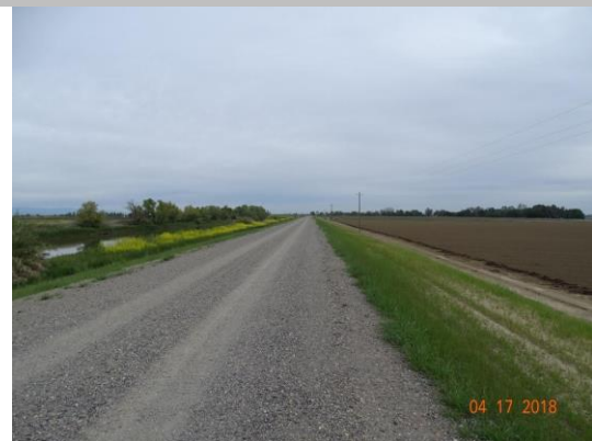
View of native grasses on both slopes.