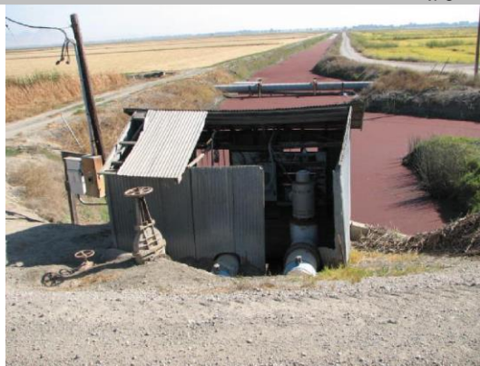
Pump house on LS slope.