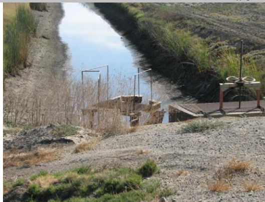
Pump platform at center left of photo.