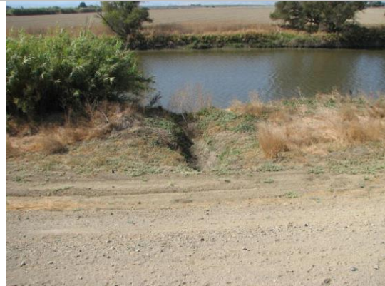
WS view of outlet.