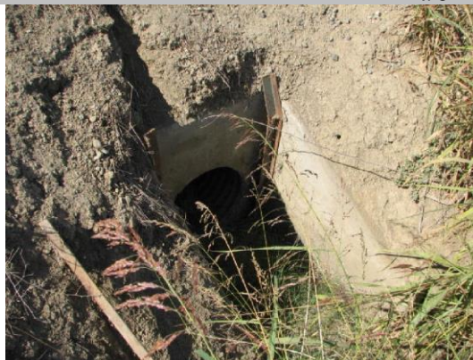
Concrete U shaped headwall on LS toe.