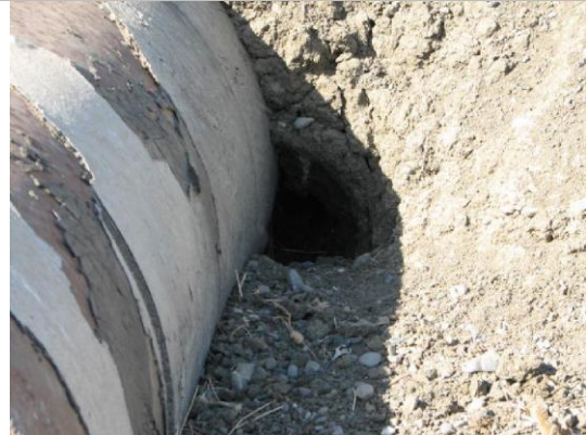
Animal burrows along side of pipe LS.