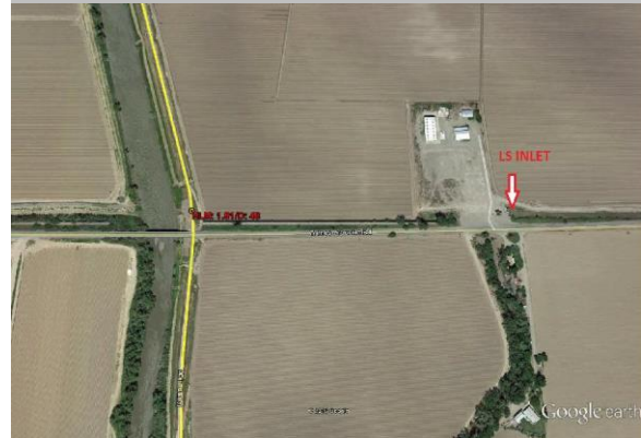
Arrow showing location of LS inlet