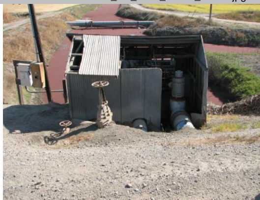
Pump house on LS slope