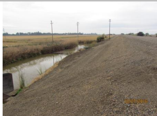
View of a ditch along the landside toe.