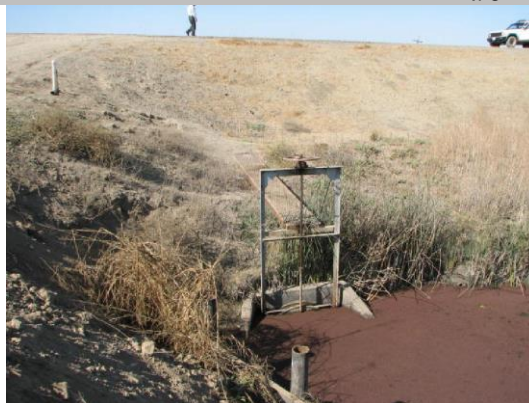
Concrete headwall with slide gate at LS toe.