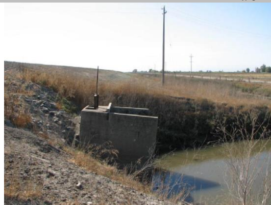
Tilting headwall on WS toe.