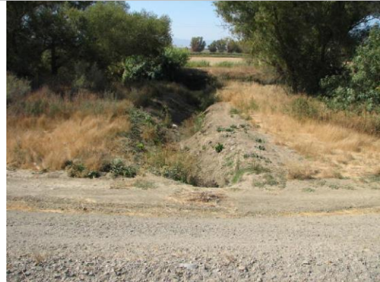
Outlet at WS toe.