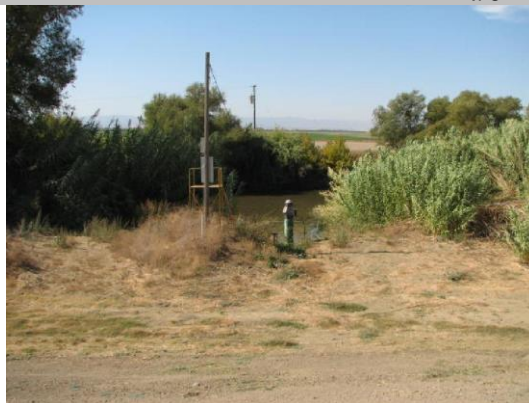
Pump, pole, and meter on WS toe.