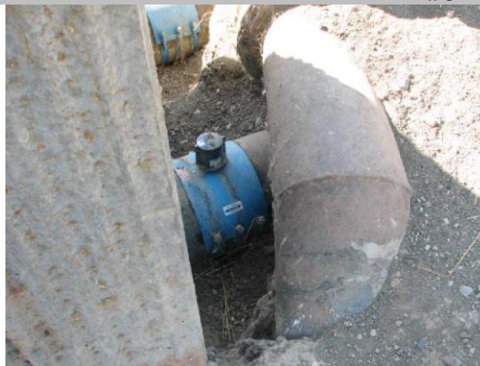
Pipe at exit from pumphouse.