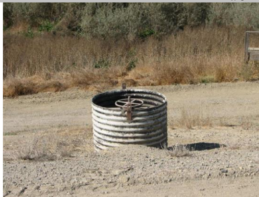
36-inch CMP riser with Slide gate on WS shoulder.