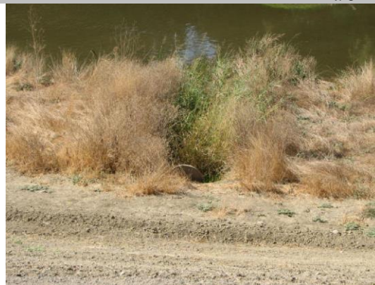
Outlet on WS toe.