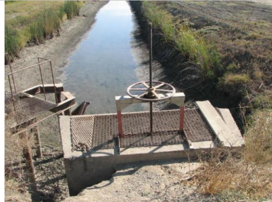
slide gate and headwall on LS toe.