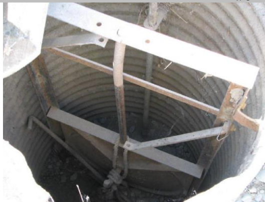
Bent and broken actuator on slide gate in 36-inch CMP. Pipe appears to be filled with soil.