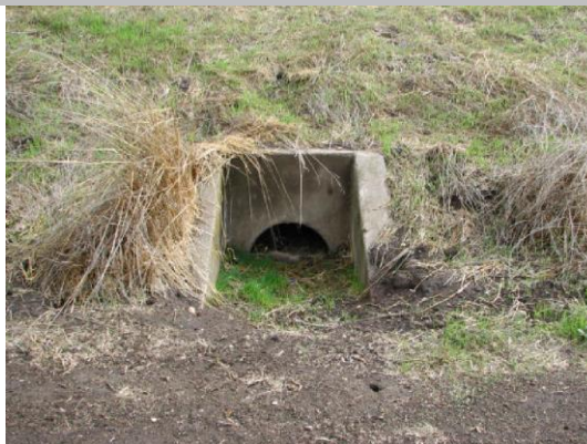
Concrete U-shaped headwall on LS toe.