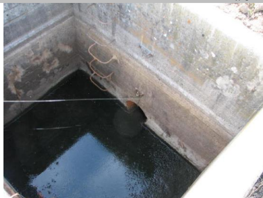
Pipe at bottom of concrete distribution box.