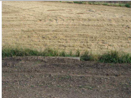
Concrete headwall at LS toe.