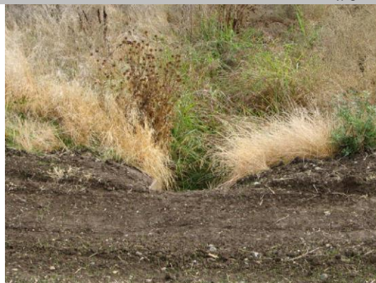
Concrete U shaped headwall and flap gate on WS toe.