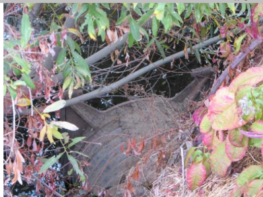
Flap gate on WS slope.