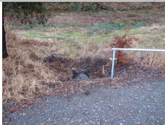
Flap gate on WS toe.