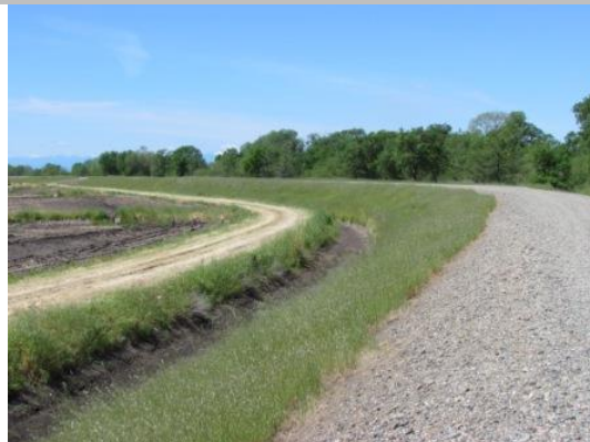
View of the agricultural ditch along the landside toe.

* Location LS : Land Side N/A : Not Applicable WS : Water Side CR : Crown