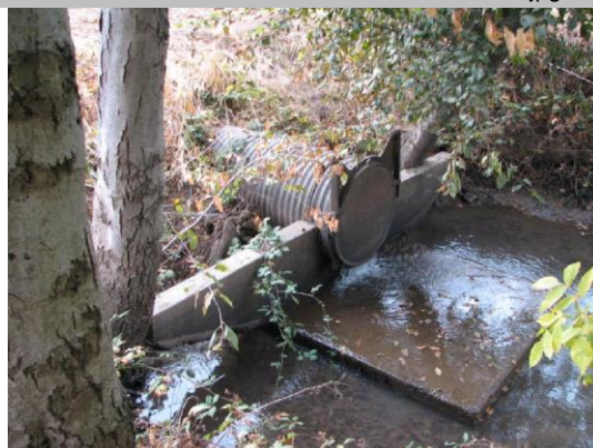
Wingwalls of headwall not supported by soil.

* Location LS : Land Side N/A : Not Applicable WS : Water Side CR : Crown