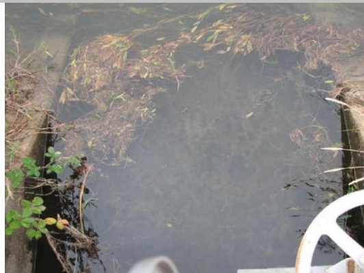
Concrete U shaped headwall at inlet in canal on LS.