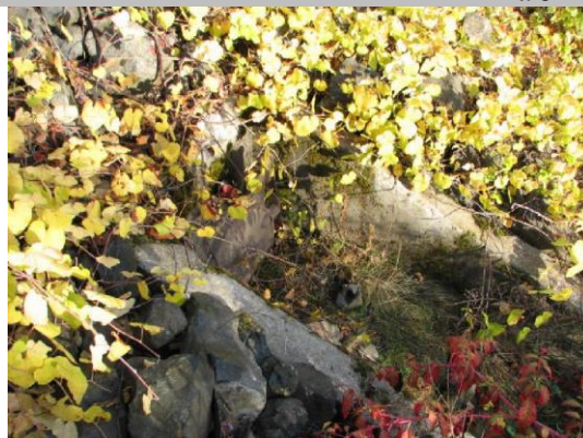
Concrete U-shaped headwall and flap gate at WS slope.