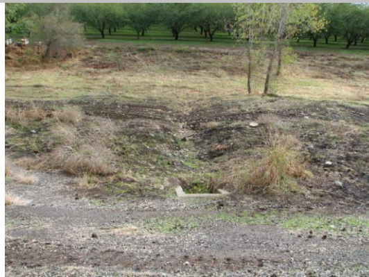
WS outlet and concrete U shaped headwall.