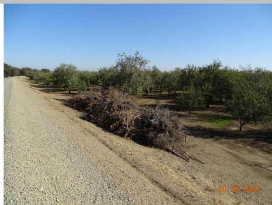
View of the prunings along the landside toe. Fall 2020.