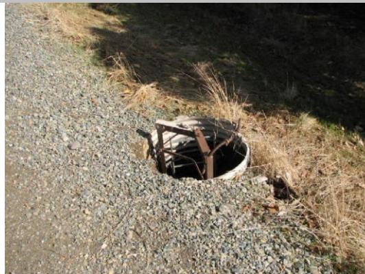
Broken slide gate in CM riser on WS slope.