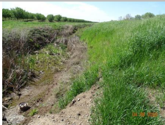
View of the erosion at the landside toe. Spring 2020.