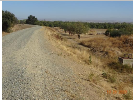
View of the damaged landside slope due to vehicle traffic. Fall 2020.