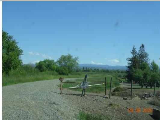
View of the unpermitted gate. Spring 2020.