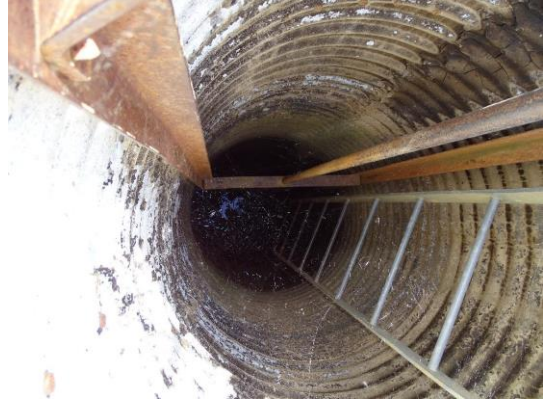
Inside view of CMP riser on WS shoulder