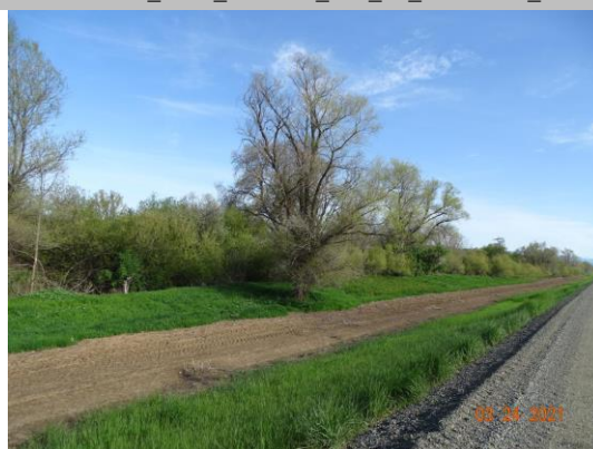
View of the vegetation along the waterside slope. Spring 2021.

* Location LS : Land Side N/A : Not Applicable WS : Water Side CR : Crown