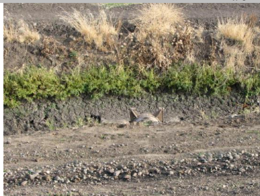
Flap gate and headwall at LS toe in irrigation or drainage ditch.