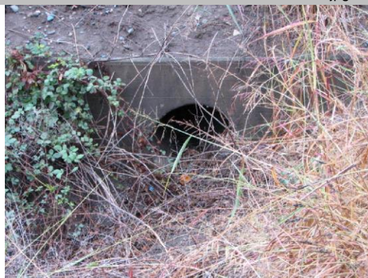
Headwall on LS toe.