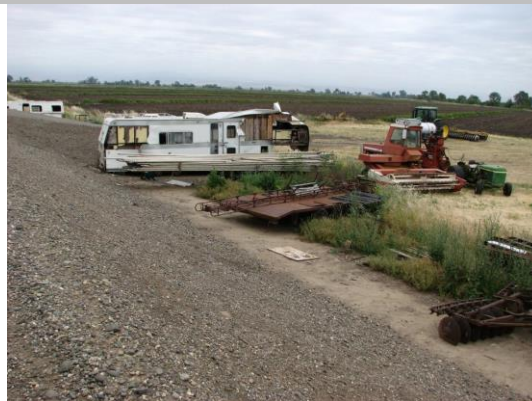
5/5/2016: Remove abandoned motorhome and equipment from LS toe.

* Location LS : Land Side N/A : Not Applicable WS : Water Side CR : Crown