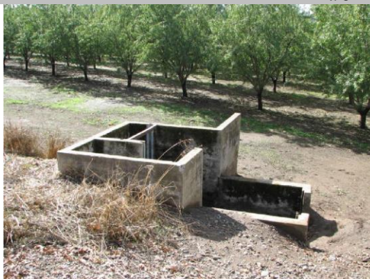
Distribution box on LS toe. Missing slide gate at pipe entrance.