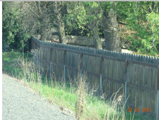
View of the wood plank fence at the landside toe. Spring 2021.