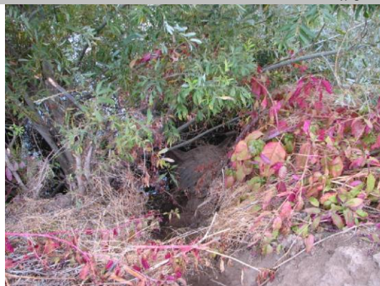
Flap gate on WS slope.