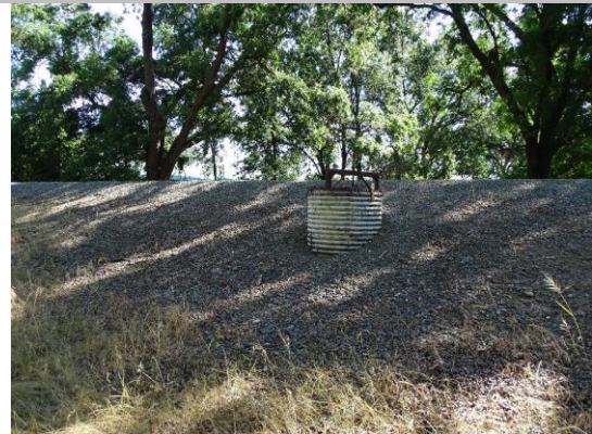
CMP riser WS shoulder