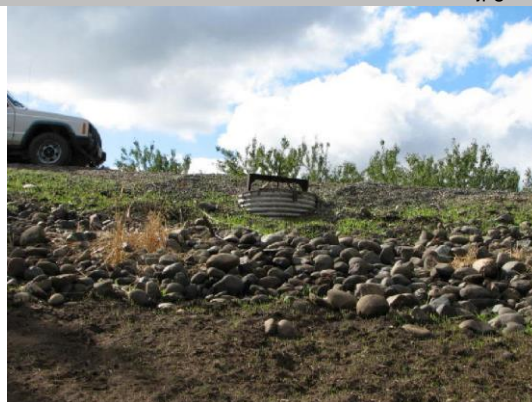
CM riser with slide gate on WS shoulder.