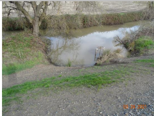
View of the erosion at the landside toe. Spring 2021.