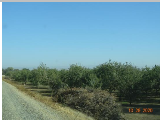
View of the prunings along the landside toe. Fall 2020.