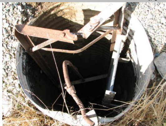
Broken slide gate in CM riser on WS slope.