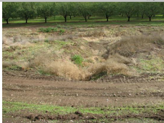
View of outlet looking toward WS toe.