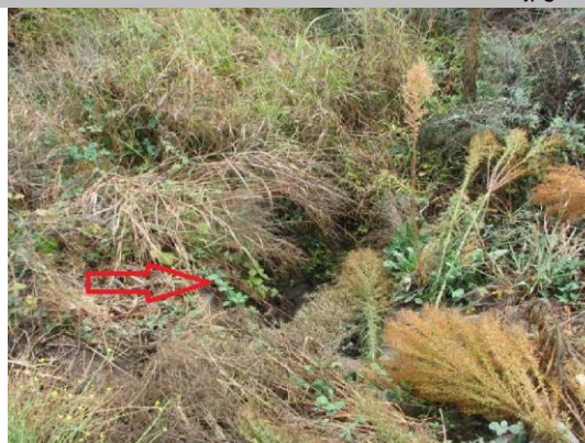
Concrete U shaped outlet and flap gate at WS of Berm.