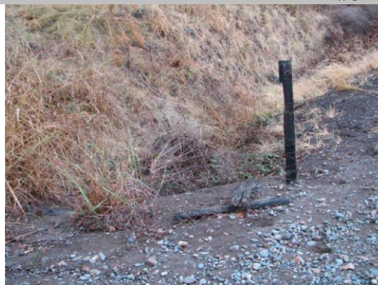
Headwall on LS toe.