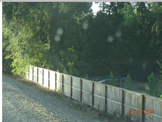
View of a wooden fence along the landside toe. Fall 2020.