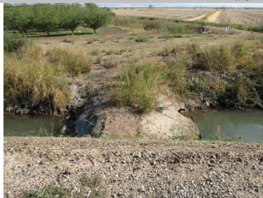
Concrete fill on LS toe a good indicator for location of pipe.