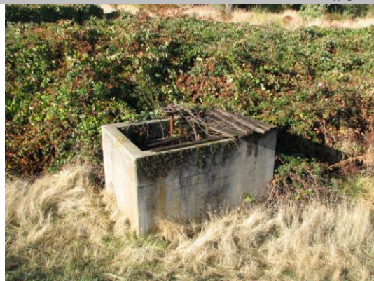
Concrete distribution box with slide gate on LS toe.