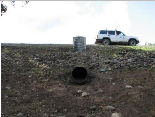
View of pipe from WS looking toward LS.