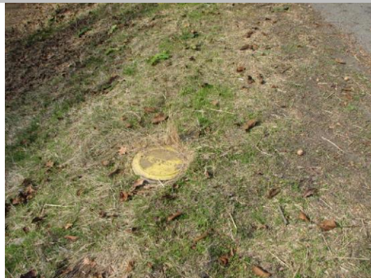
PG&E access lid on south edge of roadway.