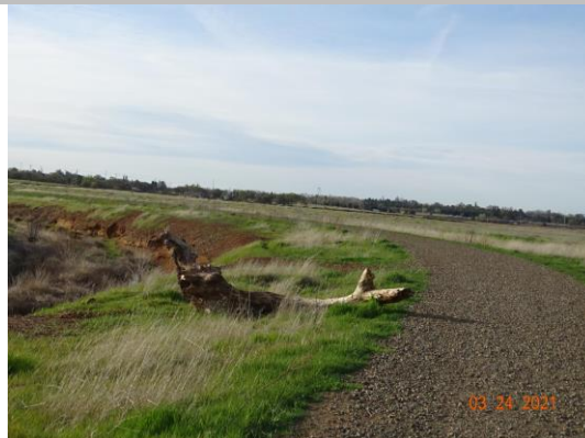
View of the tree limb on the waterside slope. Spring 2021.