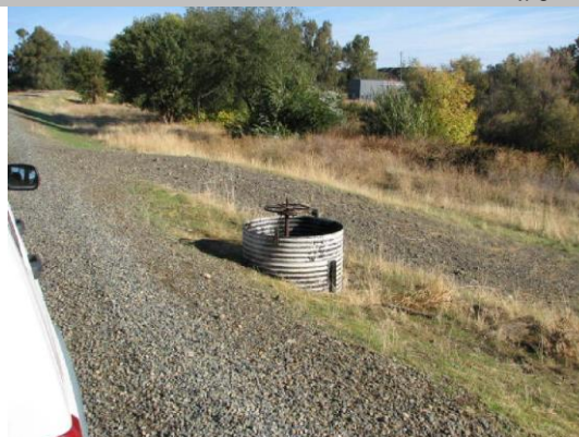
CMP riser on WS shoulder with slide gate.