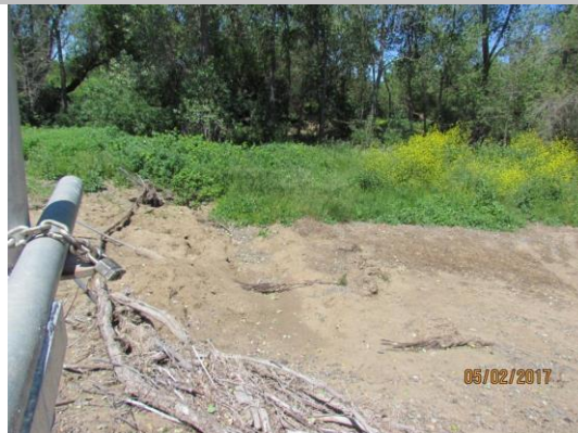
View of erosion along the waterside slope.