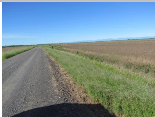
View of the agricultural ditch along the landside toe.