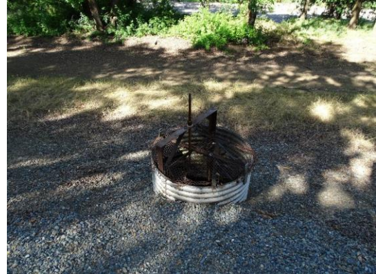
CMP riser with slide gate on WS shoulder