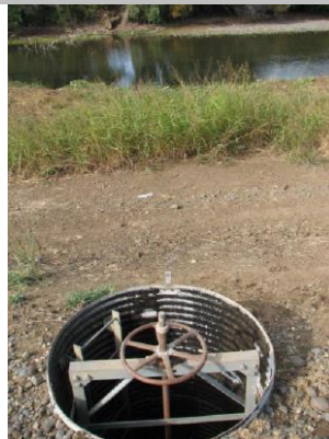
54-inch CMP riser and slide gate on WS shoulder.