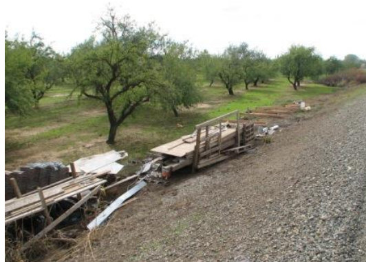
View of the construction supply on pallets.