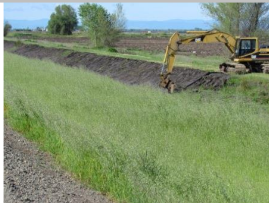
View of the agricultural ditch along the landside toe.

LS : Land Side N/A : Not Applicable WS : Water Side CR : Crown