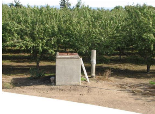
Concrete distribution box on LS, 40-feet from LS toe