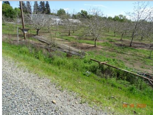
View of the sprinkler pipe and equipment along the landside toe. Spring 2020.