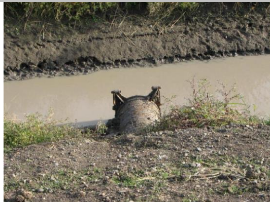
Pipe and flap gate on LS toe.