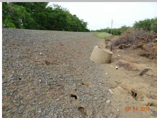
View of the animal burrows on the landside slope. Spring 2019.