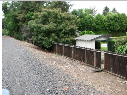
View of the wood plank fence at the landside toe.