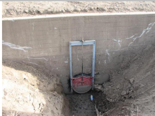
Headwall and slide gate on WS toe.