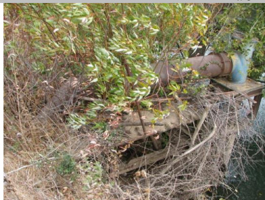
Pump on metal pier at WS toe.