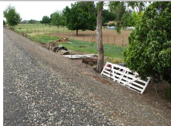
View of equipment and materials from the landside toe.

* Location LS : Land Side N/A : Not Applicable WS : Water Side CR : Crown