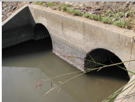
Headwall at LS toe.