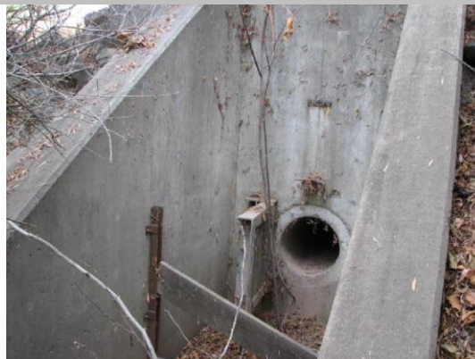
Concrete U shaped outlet on WS slope.