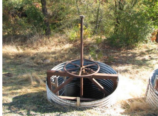
66-inch CMP riser on WS shoulder.