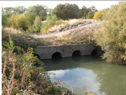
LS of pipe crossing.