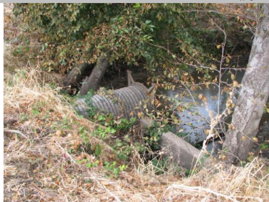
CMP pipe, flap gate, and headwall on WS toe.