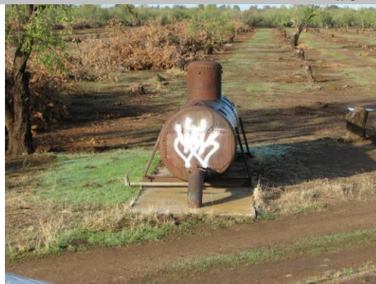
Pipe attached at boiler on LS toe.