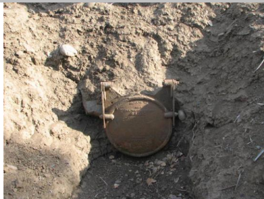
Flap gate at WS toe.