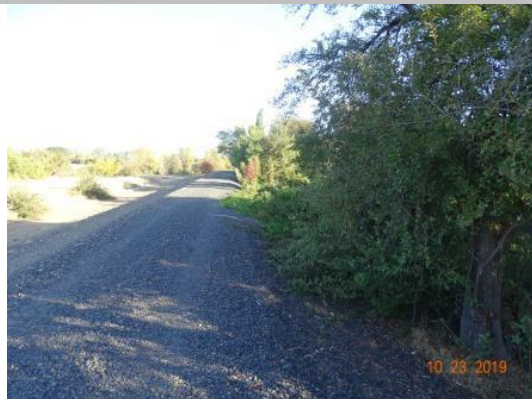
View of trees that require trimming along the landside slope. Fall 2019.