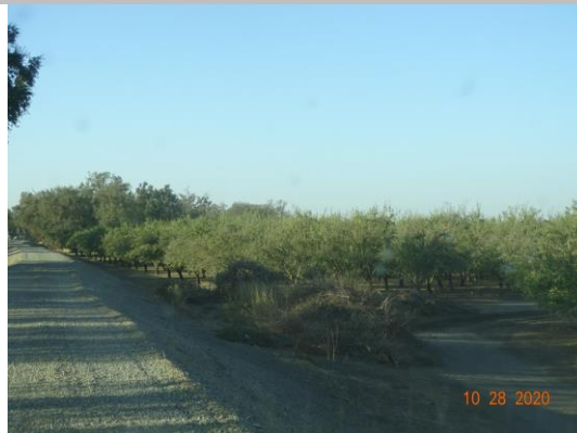
View of the prunings along the landside toe. Fall 2020.