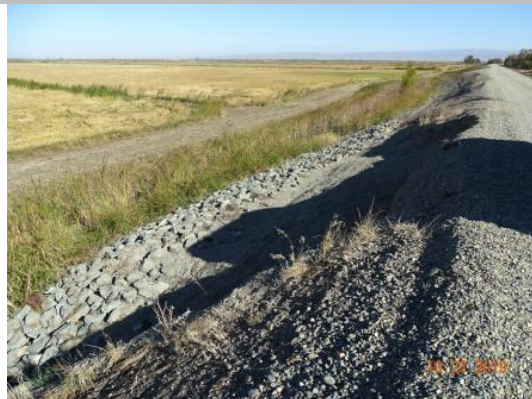
View of sloughing on the landside slope. Fall 2019.