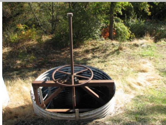
66-inch CMP riser on WS shoulder with slide gate.