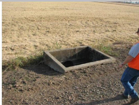
Concrete distribution box at LS toe.