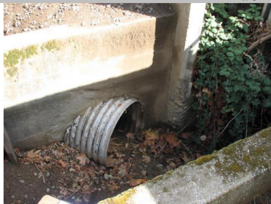
Pipe at concrete distribution box on LS toe.