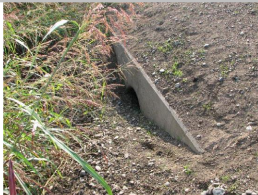
Headwall at LS toe.