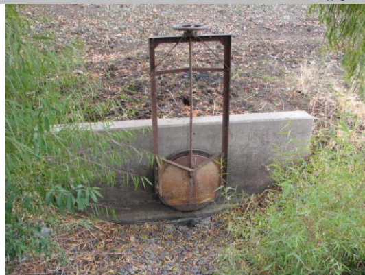
Concrete headwall and slide gate at LS toe.