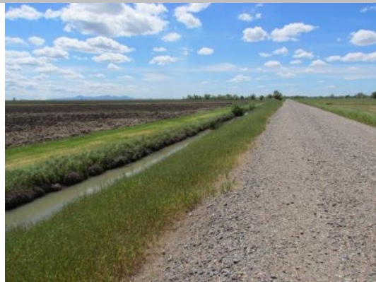
View of the agricultural ditch along the landside toe.