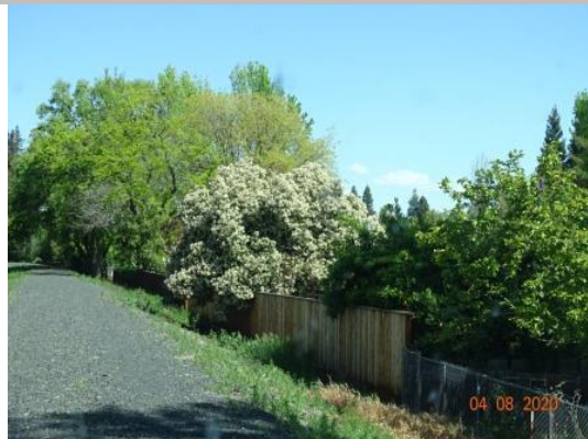
View of the fence along the landside toe. Spring 2020.