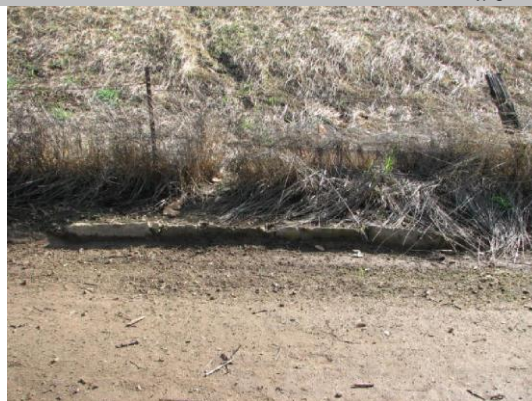
Abandoned headwall on LS toe.