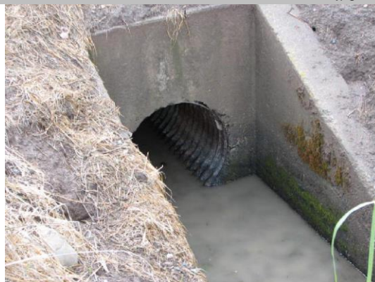
Concrete U-shaped headwall on LS toe.