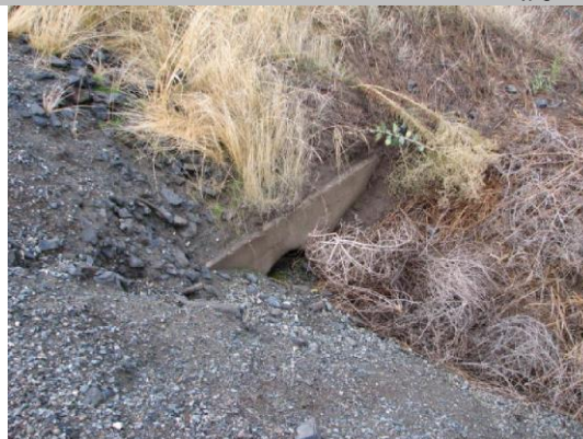
Concrete headwall on LS toe.