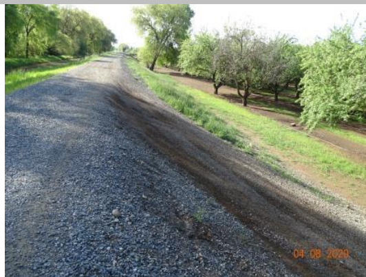
View of the vehicle erosion along the landside slope. Spring 2020.