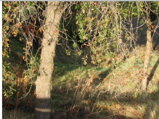
Inlet relocated after bridge replacement away from LS toe.