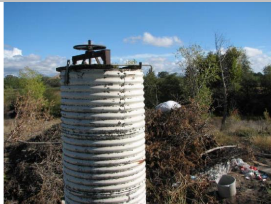
Slide gate in CM riser on WS toe.