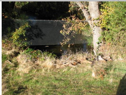
Irrigation ditch at LS toe.