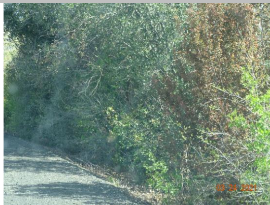
View of the trees along the landside toe blocking visibility. Spring 2021.