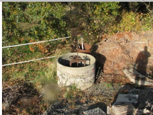
Concrete standpipe and slide gate on LS toe.