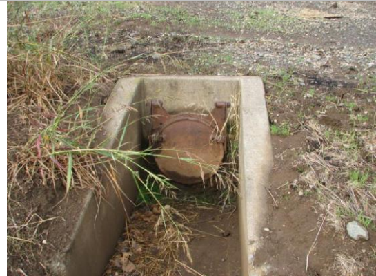
Concrete U shaped headwall and flap gate at WS toe.