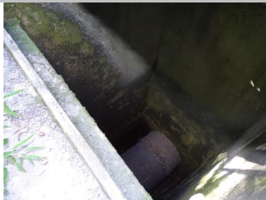
Steel welded pipe inside of concrete distribution box on LS goes toward the levee