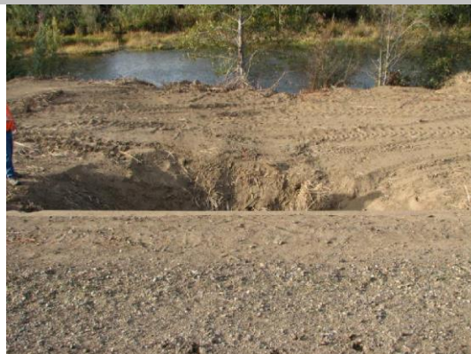
headwall at WS toe.