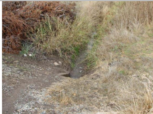
Concrete U-shaped headwall on LS toe.