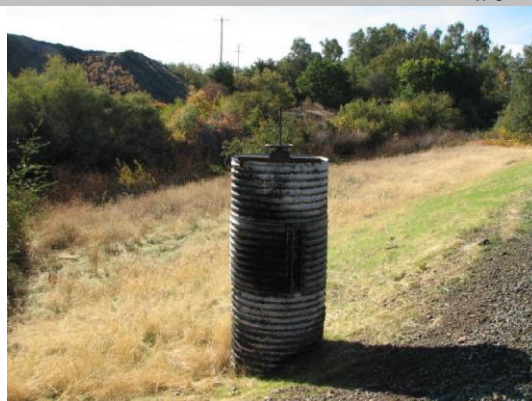
CMP riser on WS slope with slide gate.