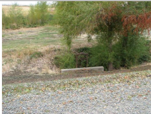
Concrete headwall and slide gate at LS toe.