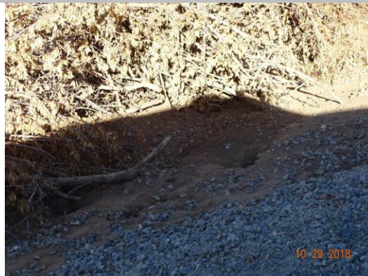
View of the rodent holes along the landside slope.