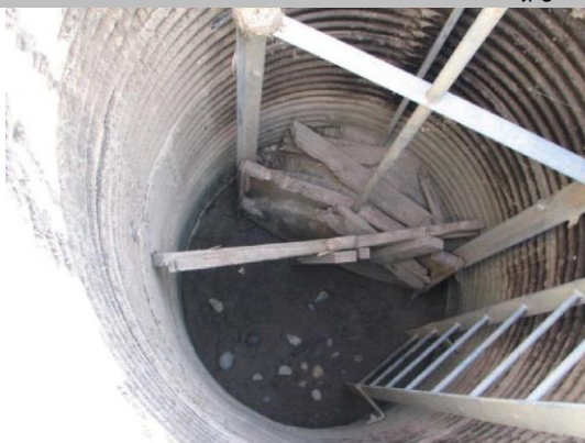
Slide gate at bottom of cmp riser.