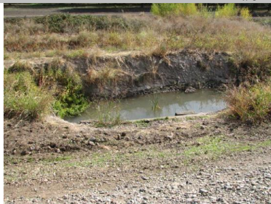
Headwall at LS toe.