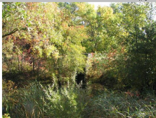
Related structure out in floodway.