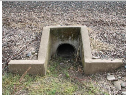
Concrete U shaped headwall on LS toe.