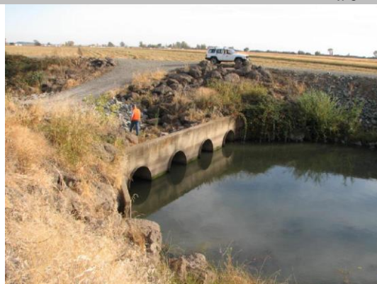
WS of pipe crossing