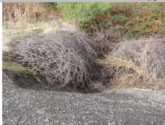
Brambles and soil over pipe at inlet.