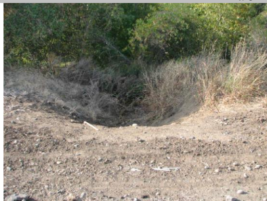
Outlet at WS toe.