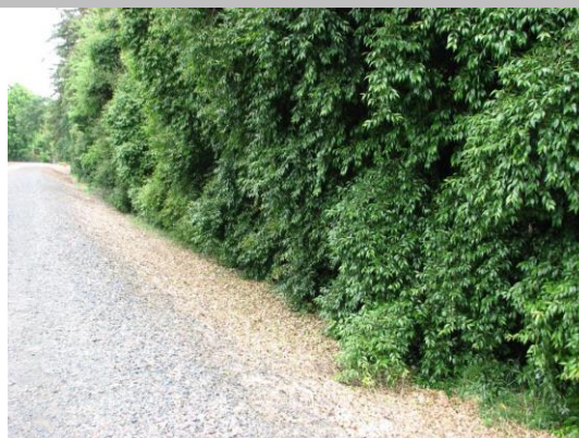
View of the overgrown vegetation at the landside toe.

Photo 1 of 1 : SP_2021_MA0005_196_43_20210224_00014.jpg