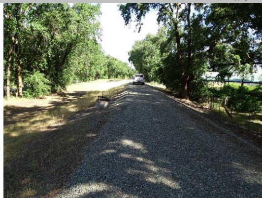
View of levee crown at crossing