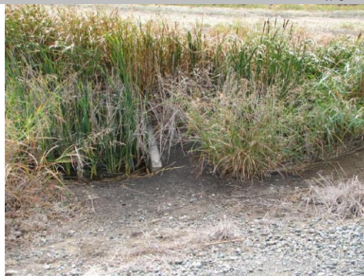
Buried pipe at concrete box, LS toe.