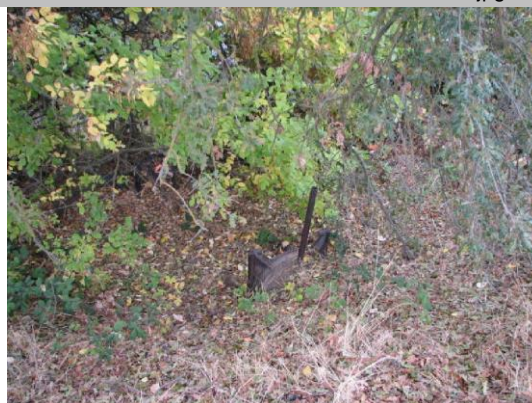
Flap gate at outlet on WS berm.