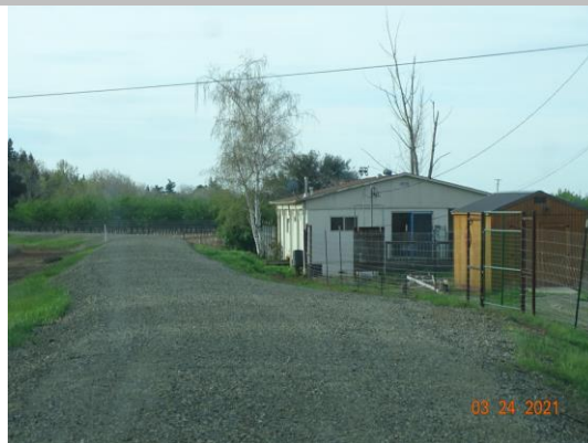
View of the buildings at the landside toe. Spring 2021.

* Location LS : Land Side N/A : Not Applicable WS : Water Side CR : Crown