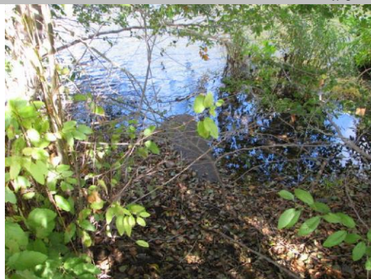
Concrete pipe at edge of creek on WS.