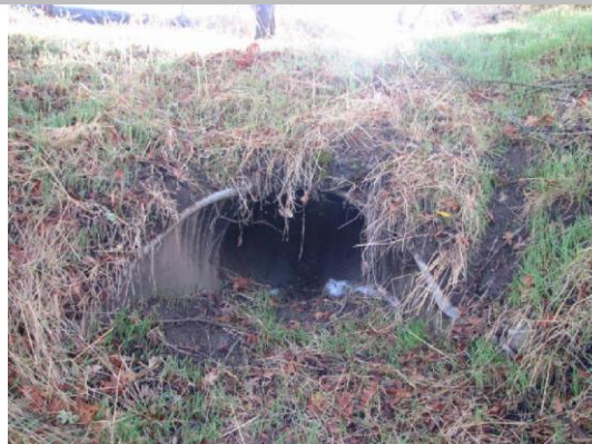
Inlet 50-feet NW of levee crown.