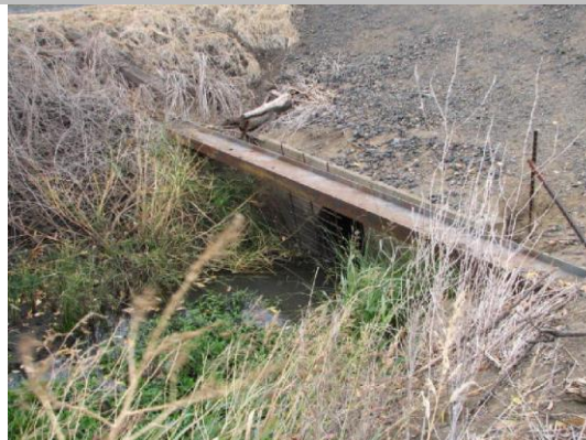
Headwall at inlet on LS toe.