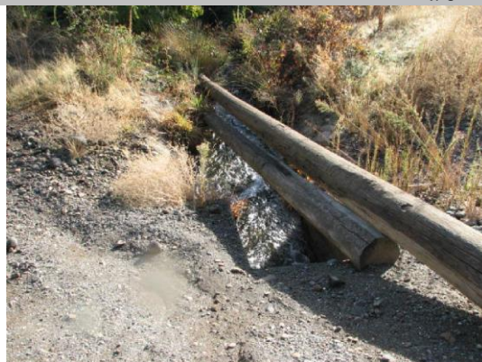
Outlet at U-shaped headwall on WS toe.