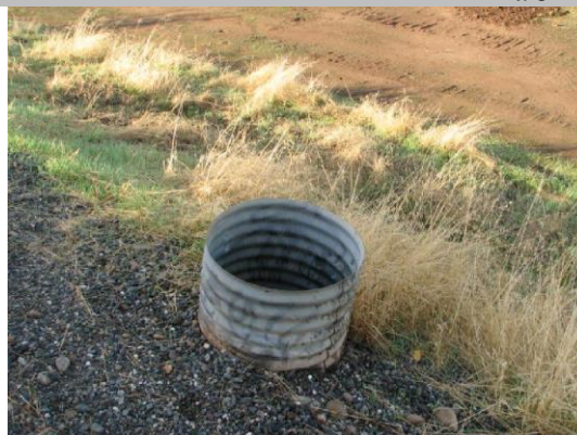
CM riser with siphon breaker on LS shoulder.