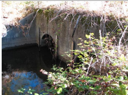
Concrete headwall at LS toe.