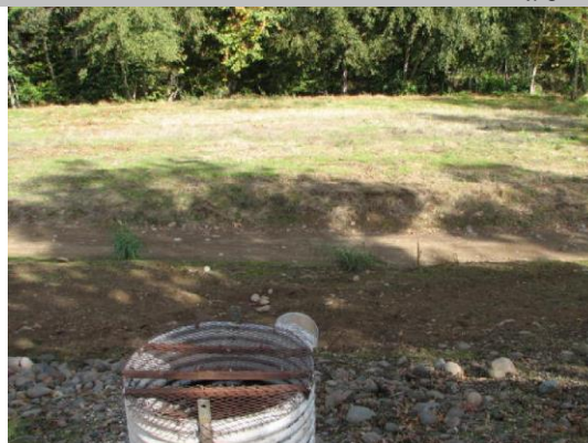
CM riser on WS shoulder-missing slide gate.