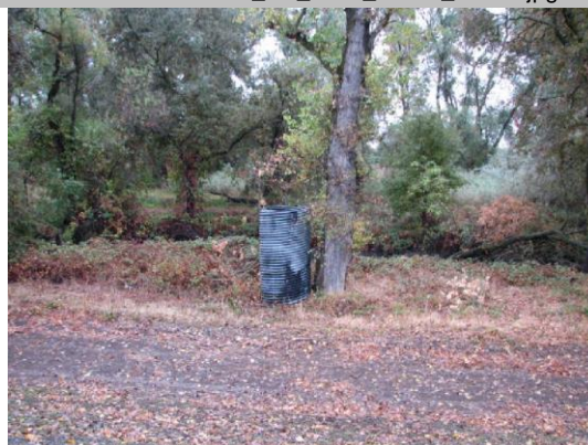
56-inch CMP riser on WS berm.