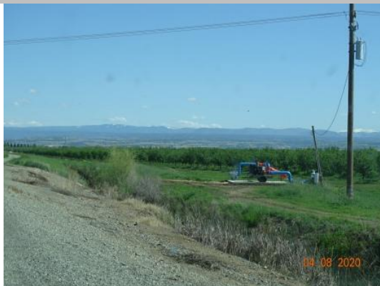
View of the irrigation ditch along the landside toe. Spring 2020.