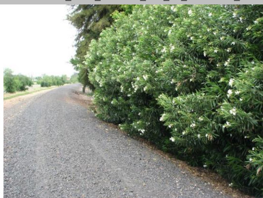
View of oleanders along the landside toe.

* Location LS : Land Side N/A : Not Applicable WS : Water Side CR : Crown