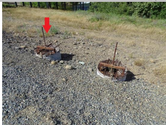
CMP riser and slide gate on WS shoulder