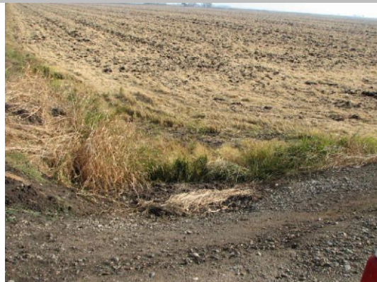
Buried inlet at LS toe.