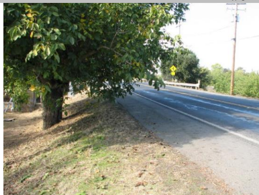
Location of PG&E access lid 250-feet east of levee crown on south side of roadway.