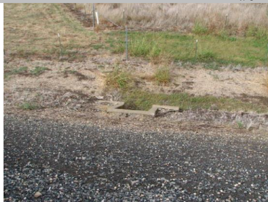
Concrete U shaped headwall on LS toe.