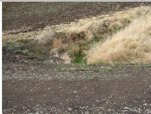
Concrete inlet on LS toe.