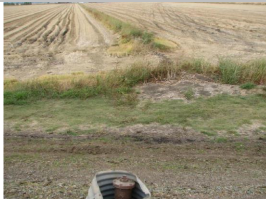
Air vent in 24-inch CMP riser on LS shoulder.