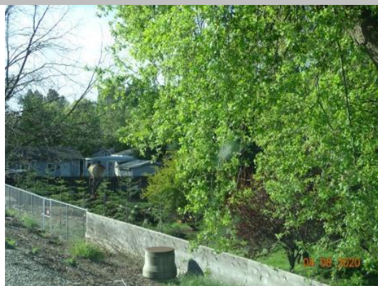
View of the fence along the landside toe. Spring 2020.

* Location LS : Land Side N/A : Not Applicable WS : Water Side CR : Crown