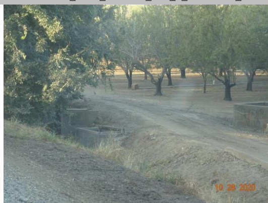
View of the ditch along the landside toe. Fall 2020.

* Location LS : Land Side N/A : Not Applicable WS : Water Side CR : Crown