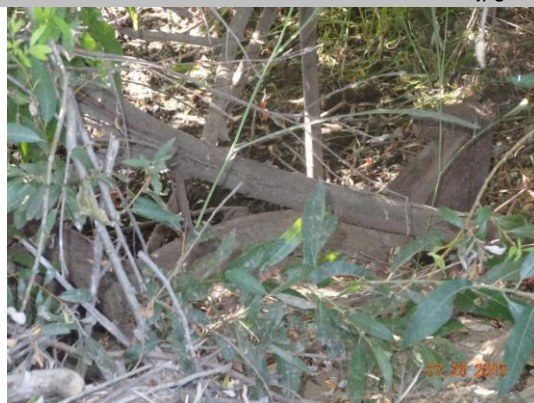
WS flap gate overgrown with vegetation.