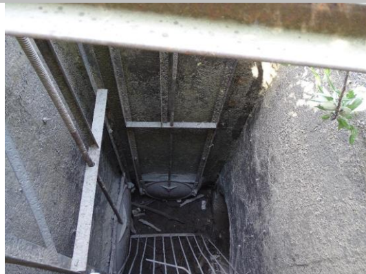
View inside of concrete distribution box on LS