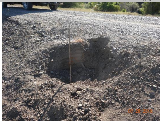
Spot where CMP riser was on the LS shoulder.