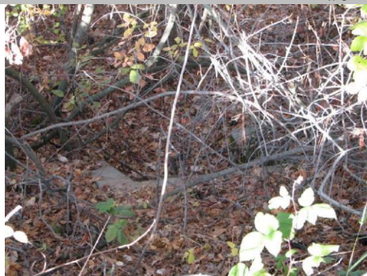
Inlet at LS toe.