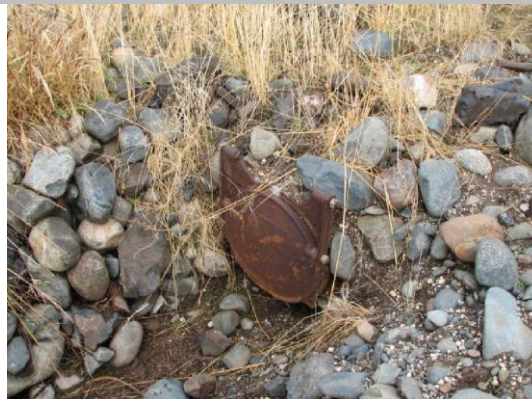
Flap gate at WS toe.