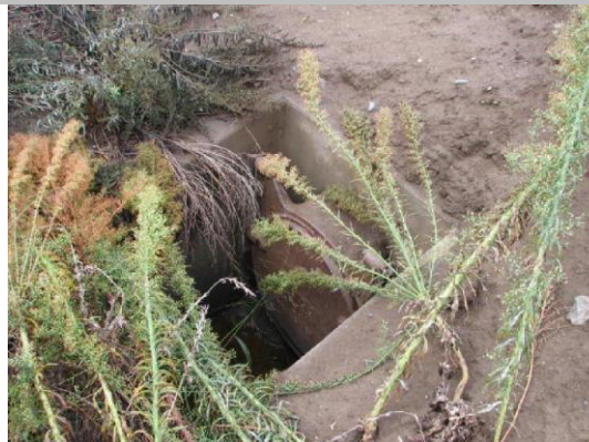
Concrete outlet and flap gate on WS toe.