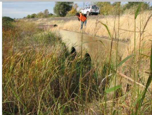
Headwall at LS toe.