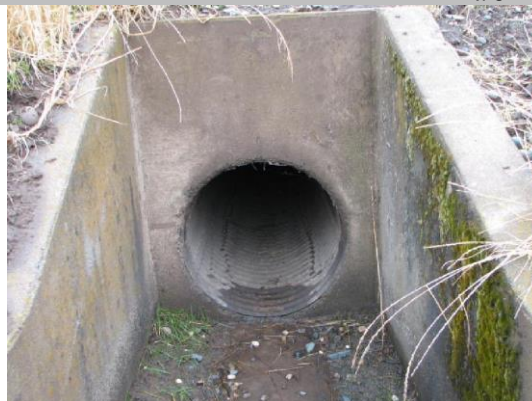
Concrete inlet on LS toe.