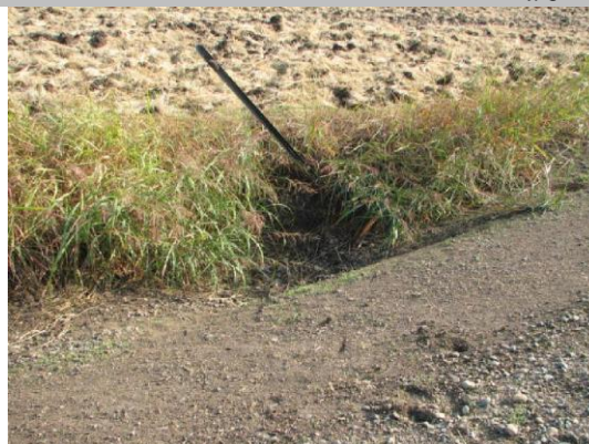
Headwall at LS toe.