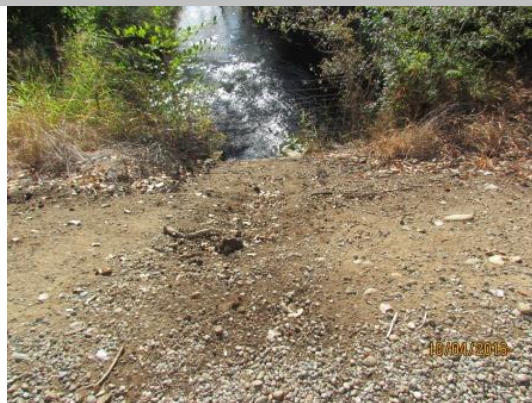
View of the damaged slope by foot traffic.