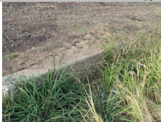
Concrete headwall at LS toe.