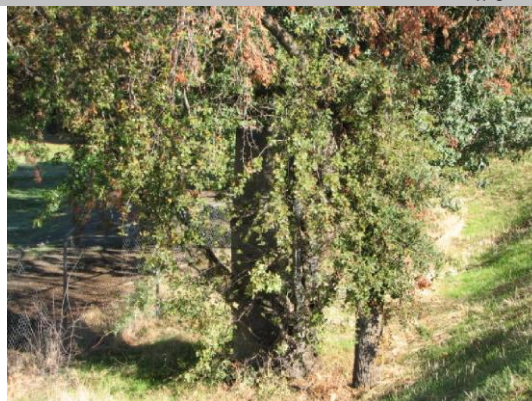
Concrete riser on LS toe.