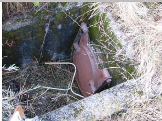
Outlet at WS toe with flap gate and concrete U-shaped headwall.