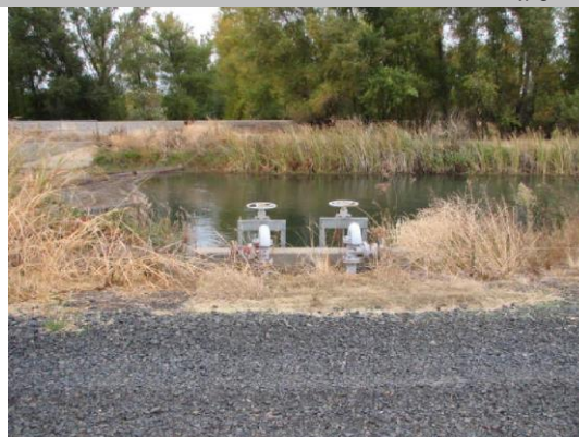
Air vents, slide gates, and concrete headwall at south side of canal on LS.