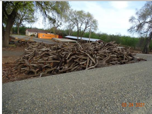
View of the pile of firewood at the landside toe. Spring 2021.