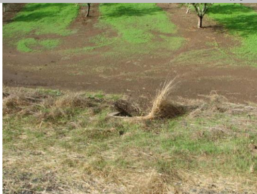
View of inlet on LS toe.