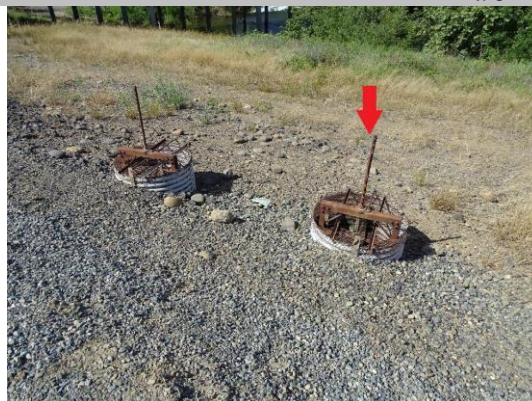
CMP riser and slide gate on WS shoulder