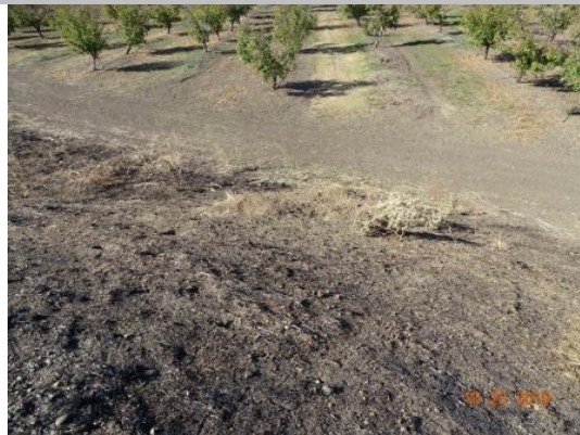
View of two large rodent burrows on the landside slope and toe. Fall 2019.

* Location LS : Land Side N/A : Not Applicable WS : Water Side CR : Crown