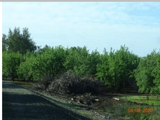
View of the prunings at landside toe. Spring 2020.