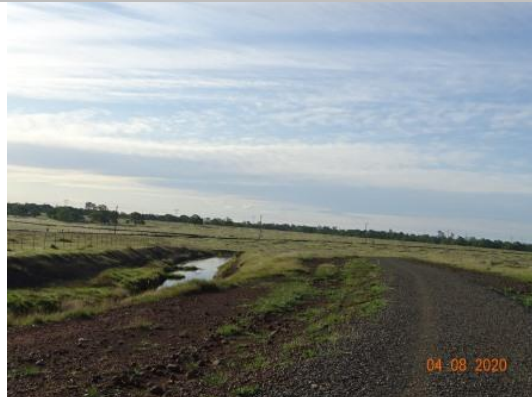
View of the vegetation along the waterside slope. Spring 2020.