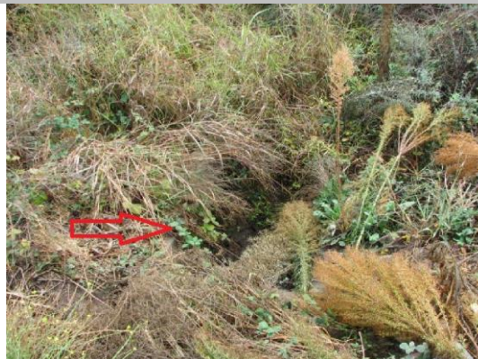
Concrete U shaped outlet and flap gate at WS of Berm.