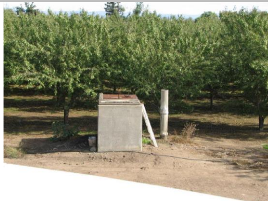
Concrete distribution box on LS, 40-feet from LS toe