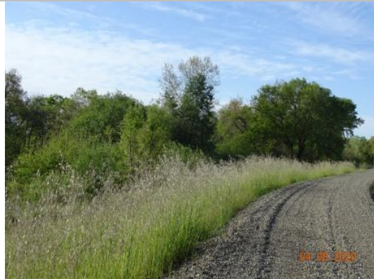
View of the vegetation along the waterside slope. Spring 2020.