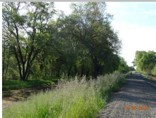
View of the vegetation along the waterside slope. Spring 2020.