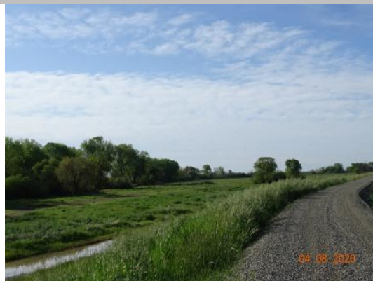
View of the vegetation along the waterside slope. Spring 2020.