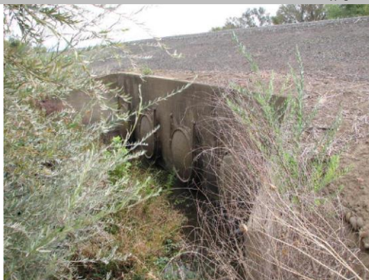
WS headwall and flap gates at WS toe.