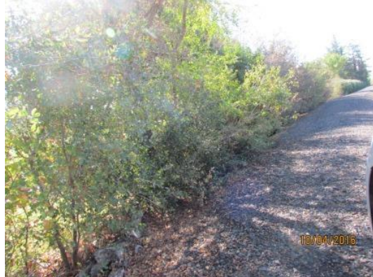
View of the trees along the landside toe blocking visibility.

Photo 1 of 1 : SP_2020_MA0005_196_32_20200226_00011.jpg