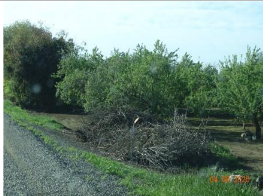
View of the prunings along the landside toe. Spring 2020.