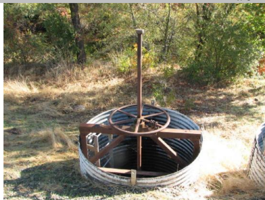
66-inch CMP riser on WS shoulder.