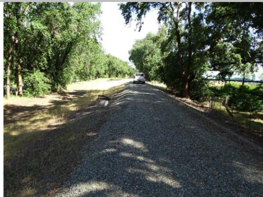
View of levee crown at crossing