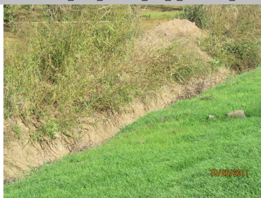
View of the ditch along the landside toe.

* Location LS : Land Side N/A : Not Applicable WS : Water Side CR : Crown