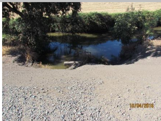
View of the landside toe erosion.

* Location LS : Land Side N/A : Not Applicable WS : Water Side CR : Crown