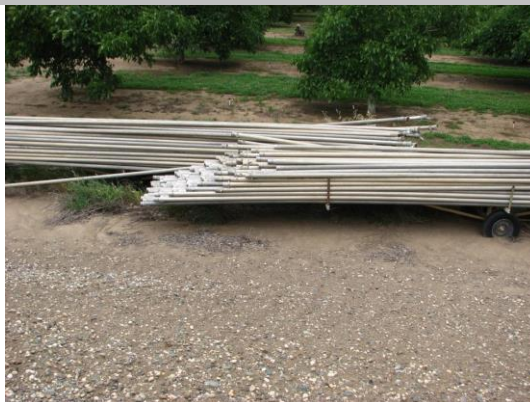
5/5/2016: Remove equipment from LS toe.