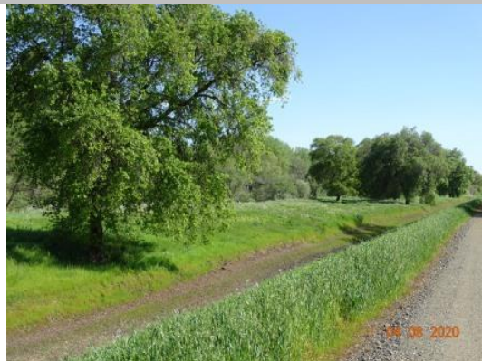
View of the vegetation along the waterside slope. Spring 2020.