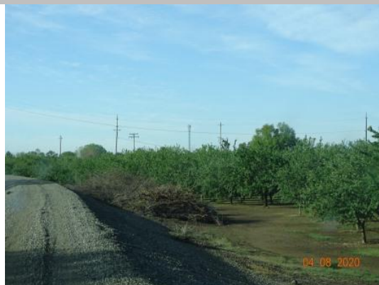
View of the prunings at the landside toe. Spring 2020.