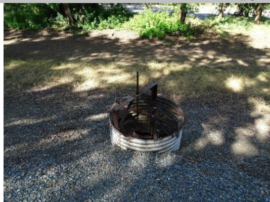
CMP riser with slide gate on WS shoulder