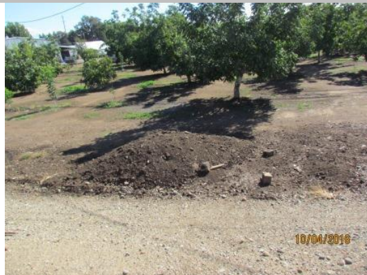
View of the soil and rock pile on the landside toe.