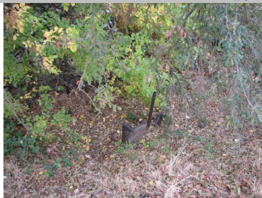
Flap gate at outlet on WS berm.