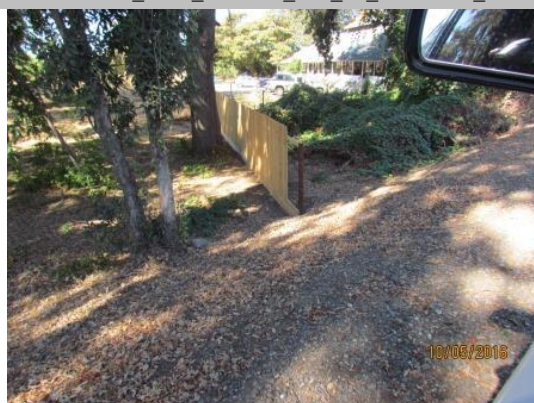
Fence now extends along LS toe, parallel to the levee.

LS : Land Side N/A : Not Applicable WS : Water Side CR : Crown