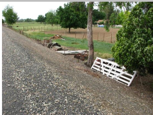
View of equipment and materials from the landside toe.

* Location LS : Land Side N/A : Not Applicable WS : Water Side CR : Crown