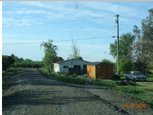
View of the buildings at the landside toe. Spring 2020.