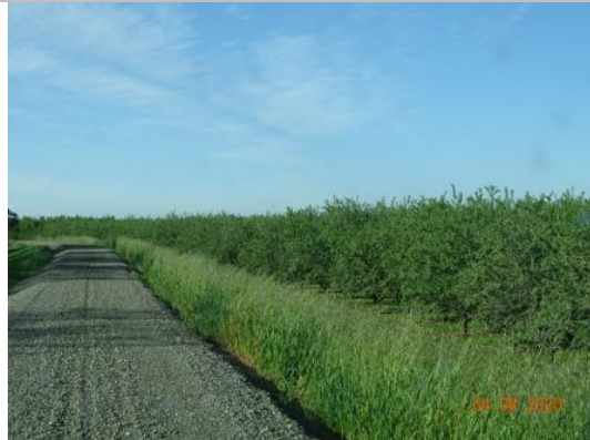
View of the vegetation along the landside toe. Spring 2020.