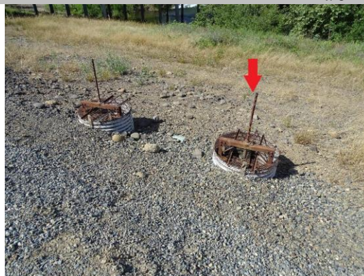
CMP riser and slide gate on WS shoulder