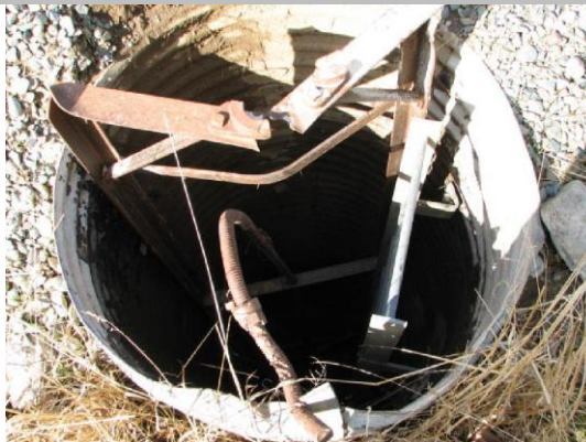
Broken slide gate in CM riser on WS slope.