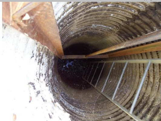
Inside view of CMP riser on WS shoulder