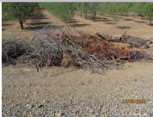
View of the prunings along the landside toe.