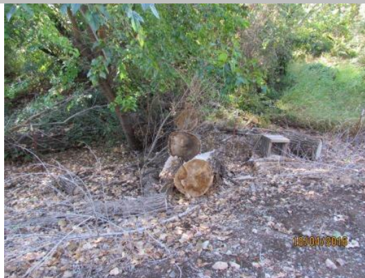
View of the wood logs on the landside slope.