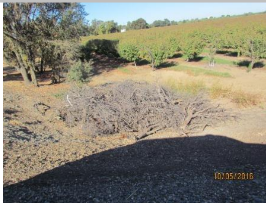
View of the prunings along the landside toe.