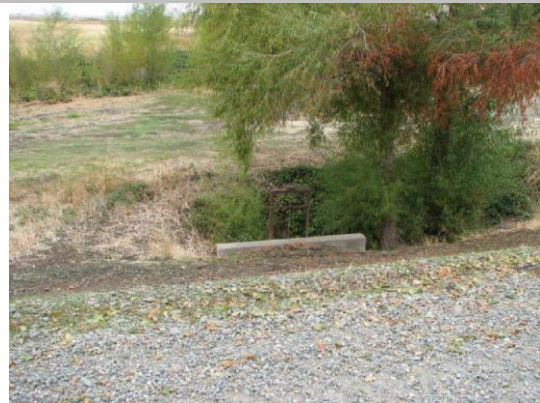
Concrete headwall and slide gate at LS toe.