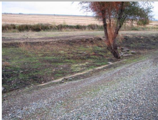
Concrete headwall on LS shoulder