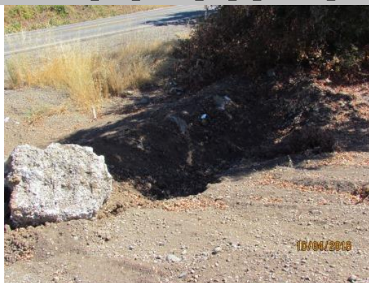
View of the rocks and cut in the landside levee toe.

LS : Land Side N/A : Not Applicable WS : Water Side CR : Crown