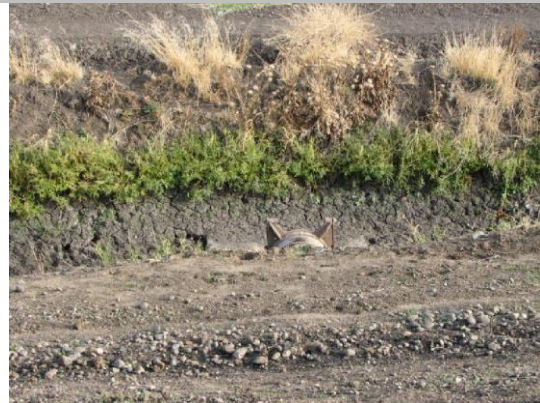
Flap gate and headwall at LS toe in irrigation or drainage ditch.