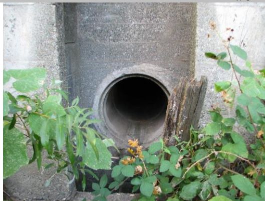
Outlet in Concrete overflow box at WS berm.