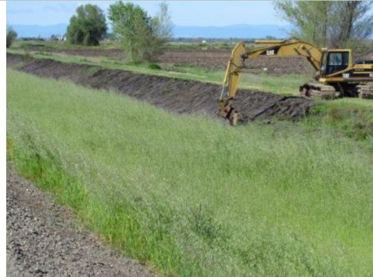
View of the agricultural ditch along the landside toe.