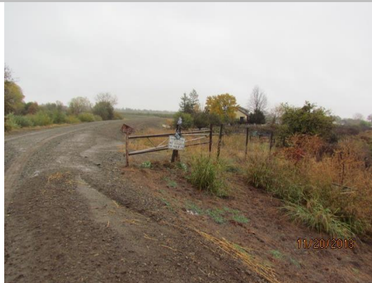
View of the unpermitted gate.