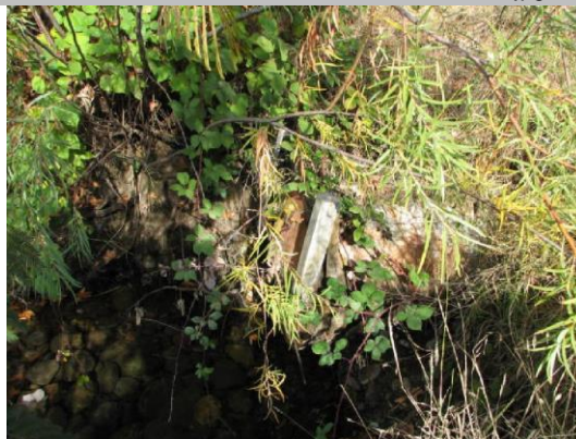
Flap gate in channel at WS toe.