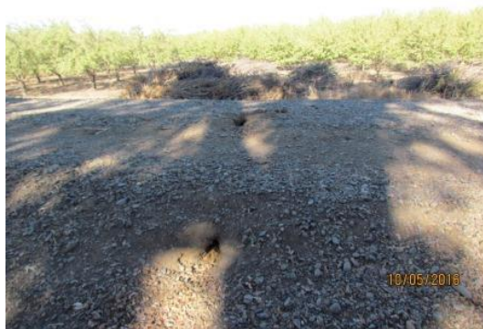
View of the rodent holes along the crown and waterside slope.