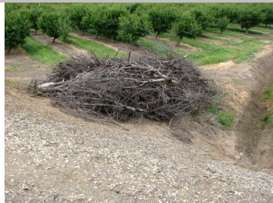
View of the prunings along the landside toe.