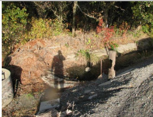
Concrete lined channel on LS toe.