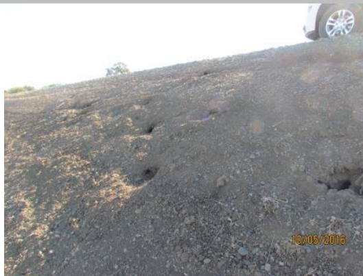
View of the rodent holes along the landside slope.