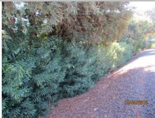
View of the oleanders along the landside toe.

* Location LS : Land Side N/A : Not Applicable WS : Water Side CR : Crown