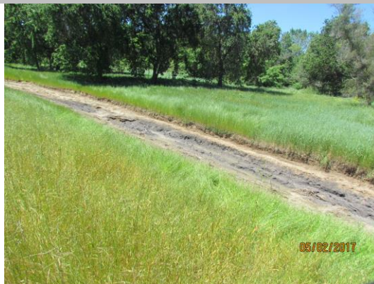
View of the erosion along the waterside toe.