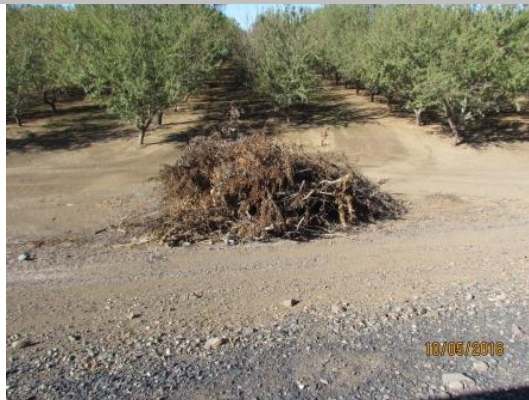
View of the prunings along the landside toe.