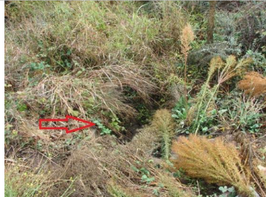
Concrete U shaped outlet and flap gate at WS of Berm.