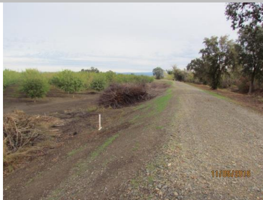
View of the prunings along the landside slope.

* Location LS : Land Side N/A : Not Applicable WS : Water Side CR : Crown