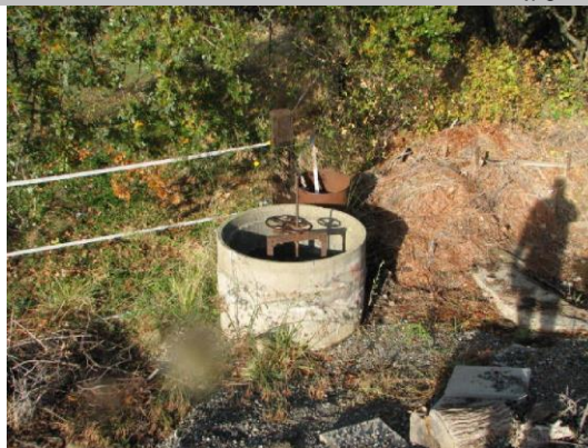
Concrete standpipe and slide gate on LS toe.