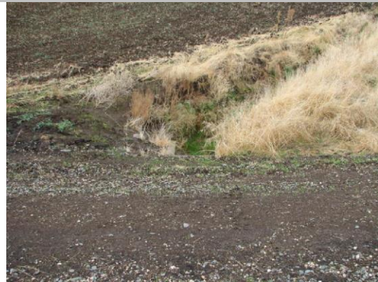
Concrete inlet on LS toe.