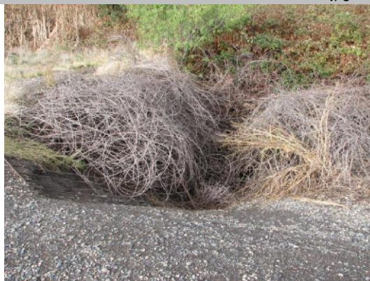
Brambles and soil over pipe at inlet.