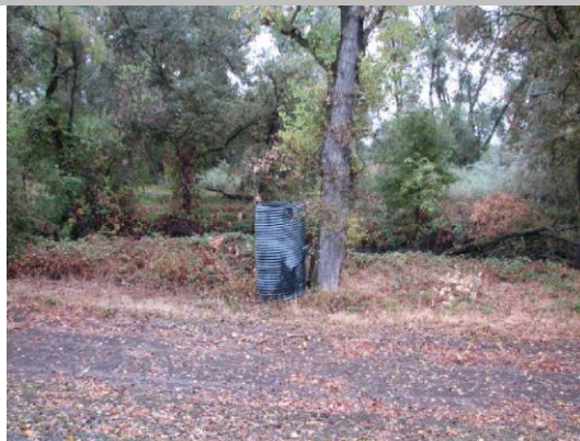
56-inch CMP riser on WS berm.