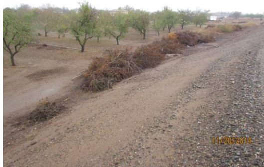
View of the prunings along the landside toe.