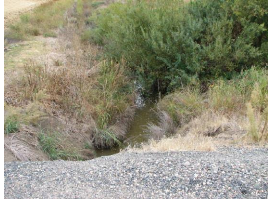
Drainage canal on LS toe.