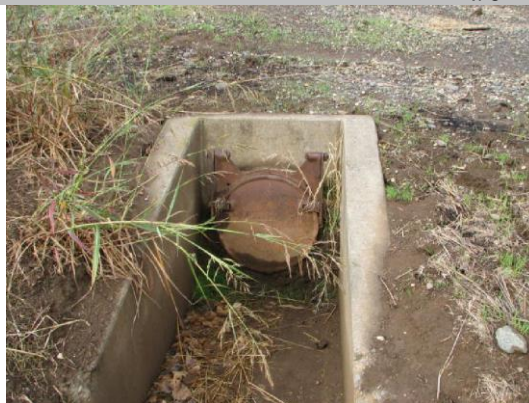
Concrete U shaped headwall and flap gate at WS toe.