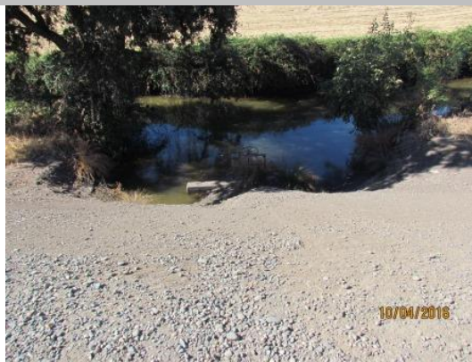
View of the landside toe erosion.