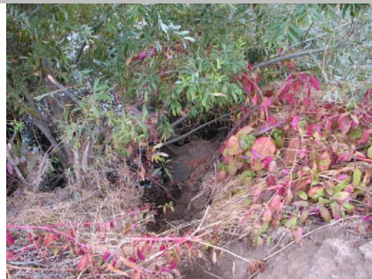
Flap gate on WS slope.