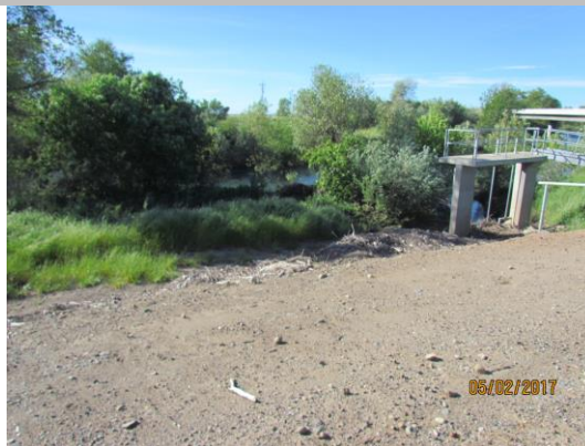
View of the debris along the waterside toe.