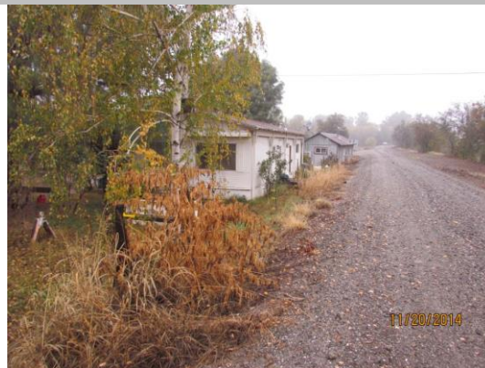
View of the buildings at the landside toe.