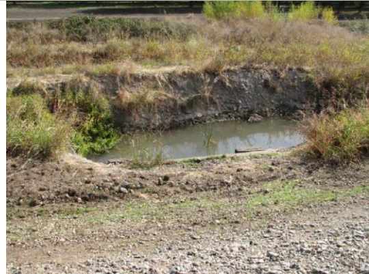
Headwall at LS toe.