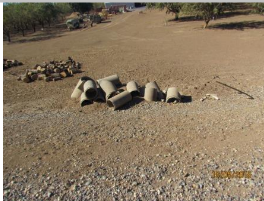
View of the broken concrete pipes along the landside toe.