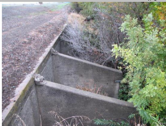
Concrete headwall on WS shoulder.