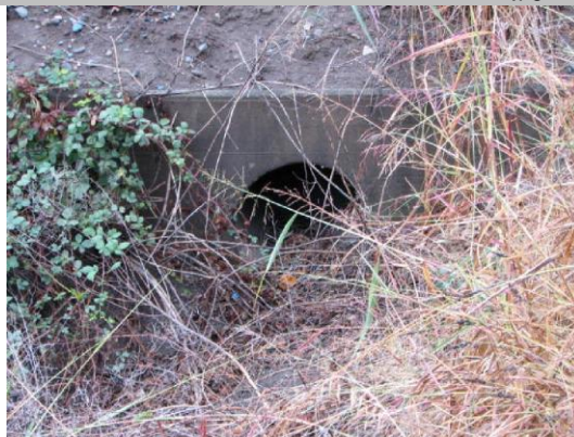
Headwall on LS toe.