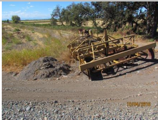
View of soil pile, rocks, and ag equipment.