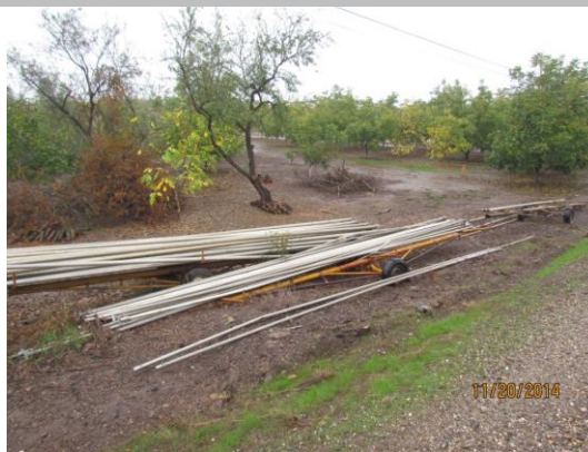
View of the sprinkler pipe and equipment along the landside toe.