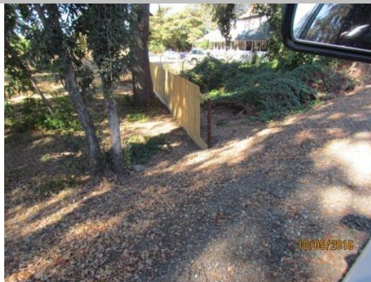
View of a newly constructed fence.

* Location LS : Land Side N/A : Not Applicable WS : Water Side CR : Crown