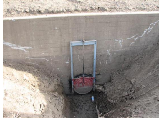
Headwall and slide gate on WS toe.