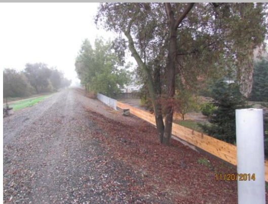
View of the new fence along the landside toe.

* Location LS : Land Side N/A : Not Applicable WS : Water Side CR : Crown