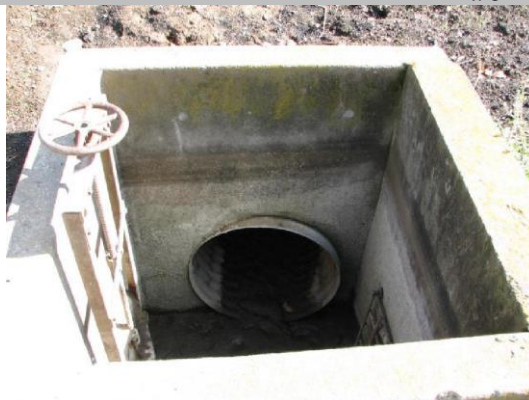
Pipe at inlet to 5X5 concrete distribution box at LS toe.