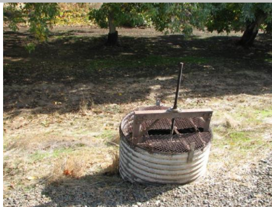
42-inch CMP riser on WS shoulder with slide gate.