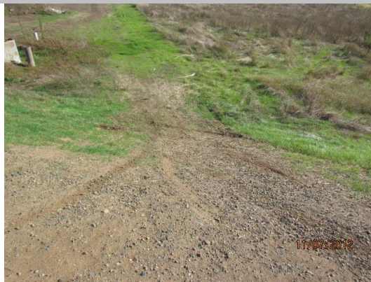
View of the vehicle erosion along the landside slope.