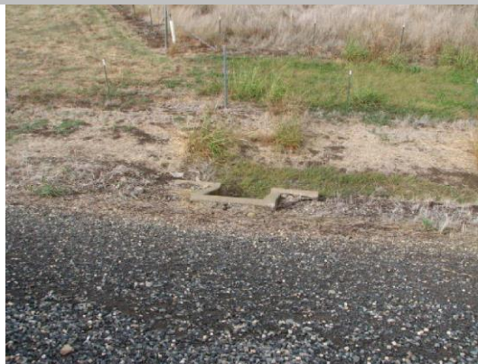
Concrete U shaped headwall on LS toe.