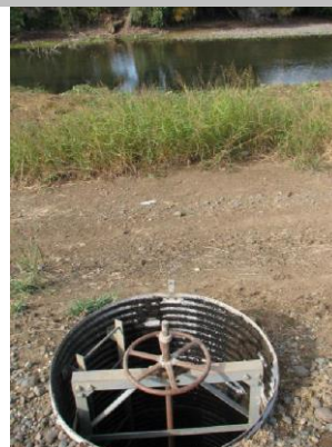
54-inch CMP riser and slide gate on WS shoulder.