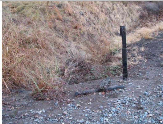
Headwall on LS toe.