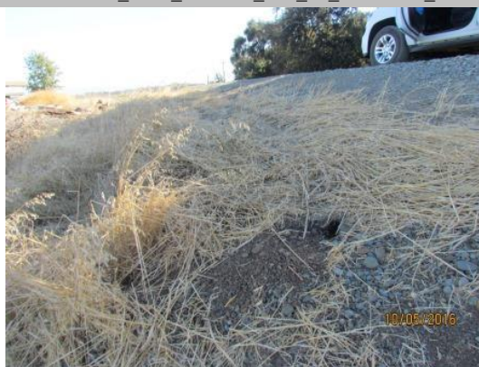
View of the rodent holes along the landside slope.