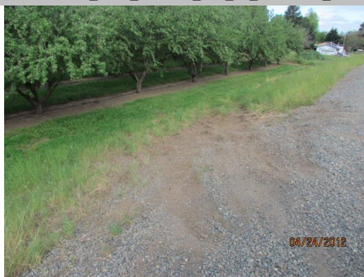
View of the vehicle erosion along the slope of the levee.