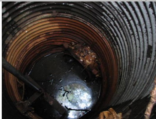
Slide gate and flap gate inside CMP riser on WS berm.