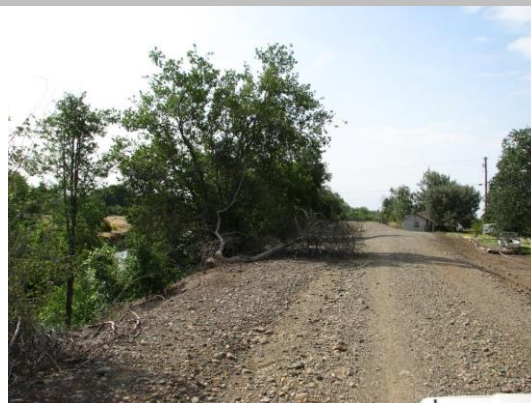
5/5/2016: Remove fallen tree from W/S slope.