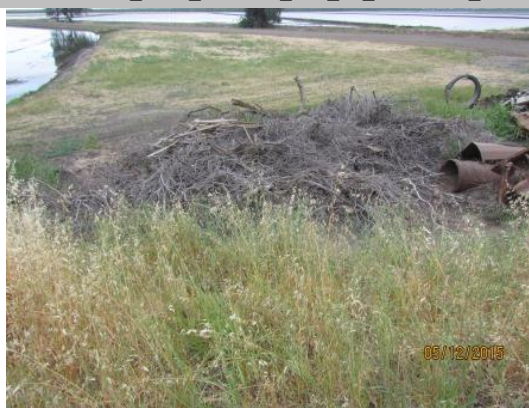
View of the prunings along the landside toe.