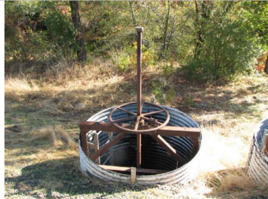
66-inch CMP riser on WS shoulder.