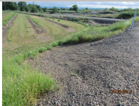
View of the vehicle erosion along the slope.