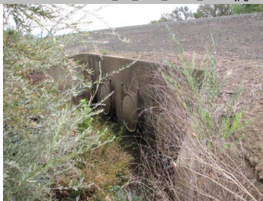
WS headwall and flap gates at WS toe.