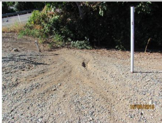
View of the damaged landside slope.