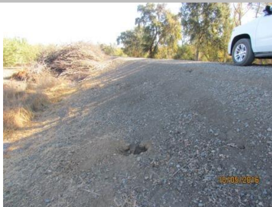
View of the rodent holes along the landside slope.