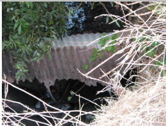
Heavily corroded CMP pipe at WS toe.