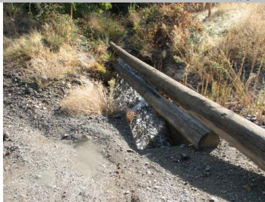
Outlet at U-shaped headwall on WS toe.