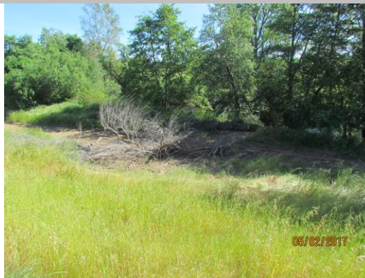
View of the tree along the waterside toe.