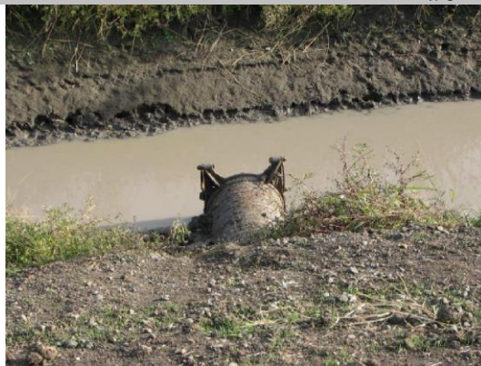
Pipe and flap gate on LS toe.