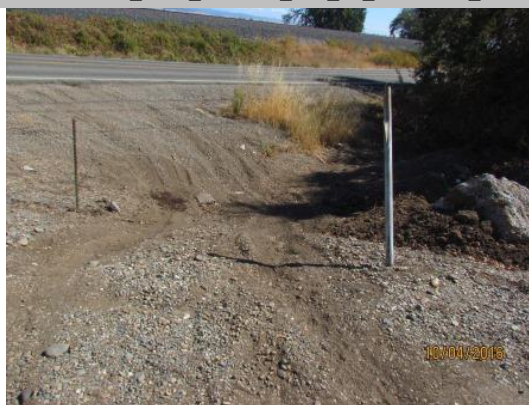
View of the damaged landside slope by vehicle traffic.