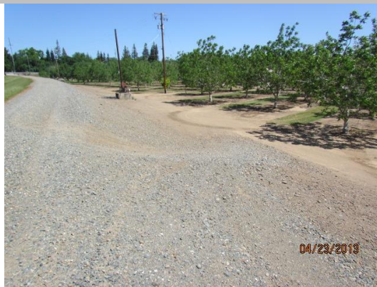
View of the unauthorized vehicle ramp on the landside slope.