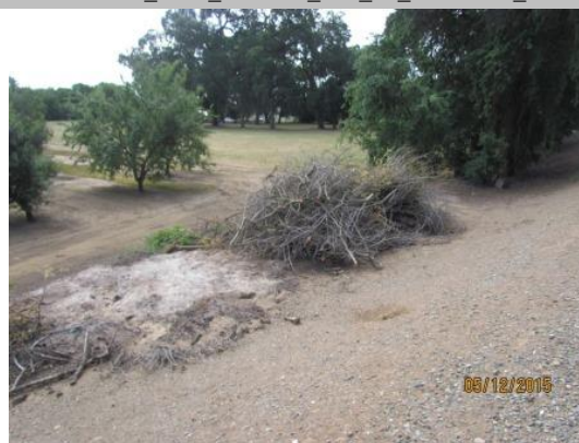
View of the prunings along the landside toe.