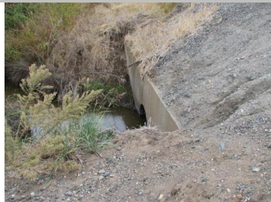
Concrete headwall on LS toe.