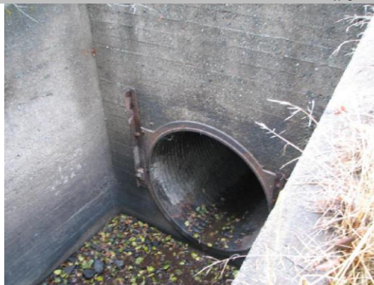
60-inch cmp open on WS.