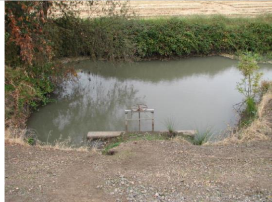
Concrete headwall and slide gate on LS toe.