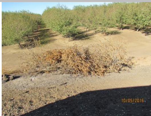
View of the prunings along the landside toe.