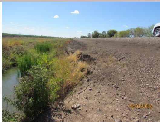
View of the landside toe erosion.