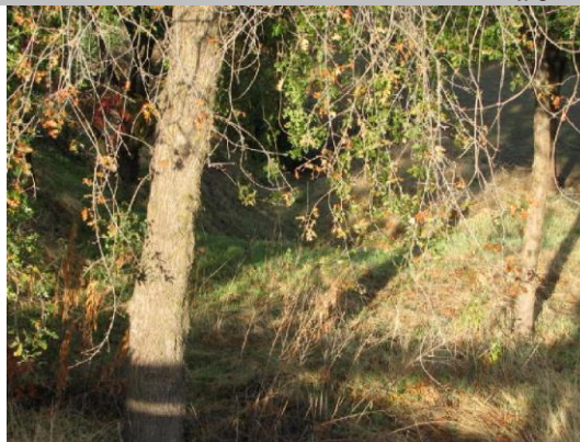
Inlet relocated after bridge replacement away from LS toe.