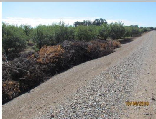
View of the prunings along the landside toe.