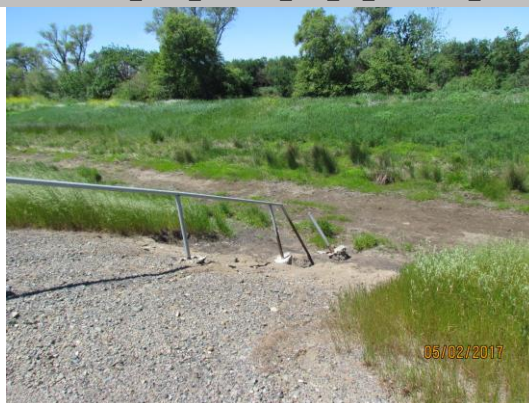
Repair the erosion along the landside slope and toe.