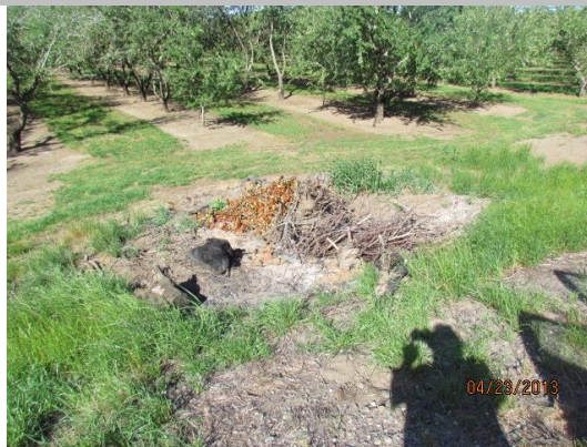
View of the prunings along the landside toe.