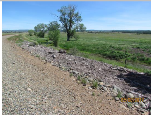
View of the debris along the waterside slope and toe.