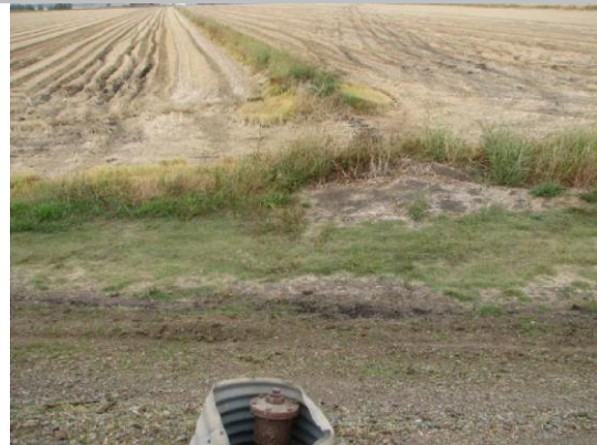
Air vent in 24-inch CMP riser on LS shoulder.