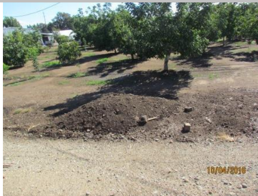
View of the soil and rock pile on the landside toe.