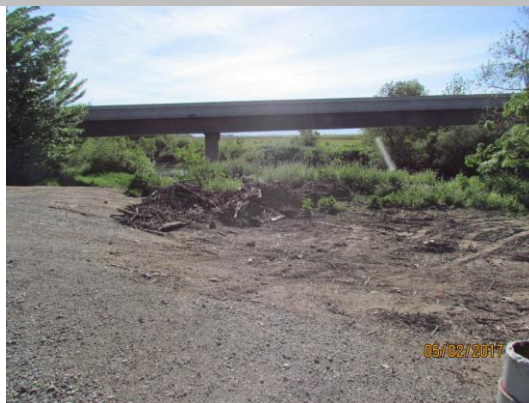
View of the debris along the waterside toe.