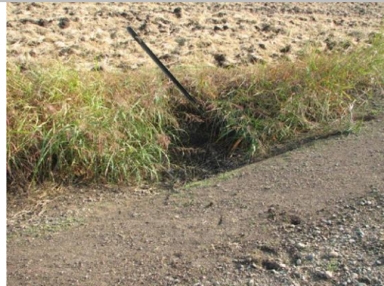
Headwall at LS toe.