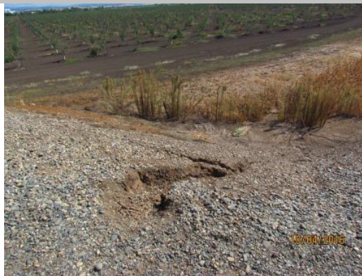
View of the landside slope erosion.