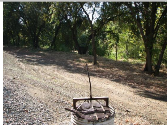
CMP riser with slide gate on WS shoulder. Notice bent screw in open position.