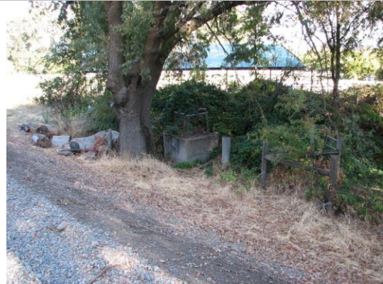
Concrete distribution box on LS toe.