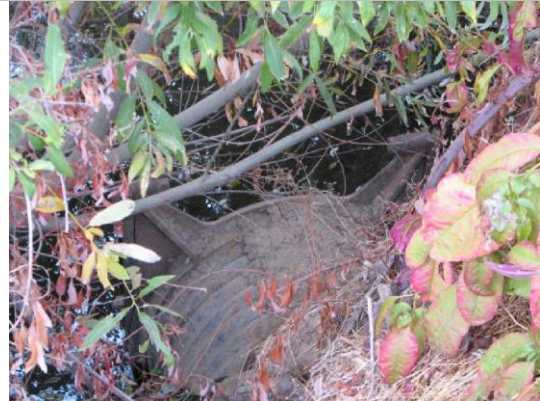
Flap gate on WS slope.