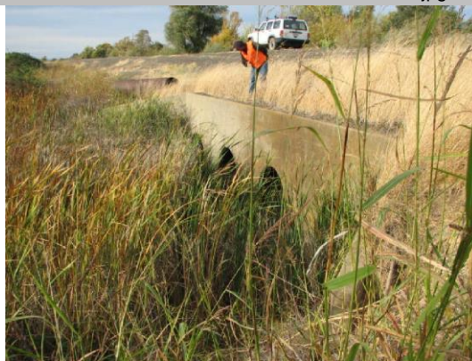
Headwall at LS toe.