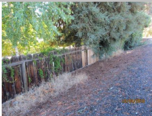
View of the wood plank fence at the landside toe.