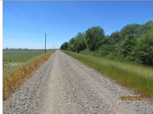
View of native grasses on both slopes.