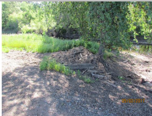
View of the debris along the waterside toe.