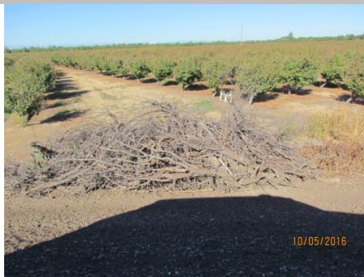
View of the prunings along the landside toe.