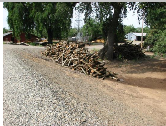
View of the firewood pile at the landside toe.