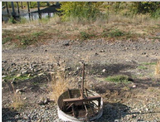
CMP riser and slide gate on WS shoulder.