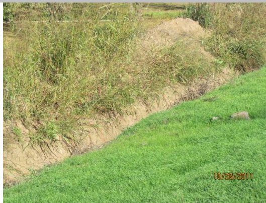
View of the ditch along the Landside toe.