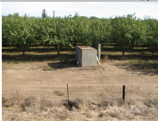
Unable to locate inlet on LS.