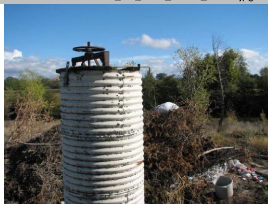
Slide gate in CM riser on WS toe.