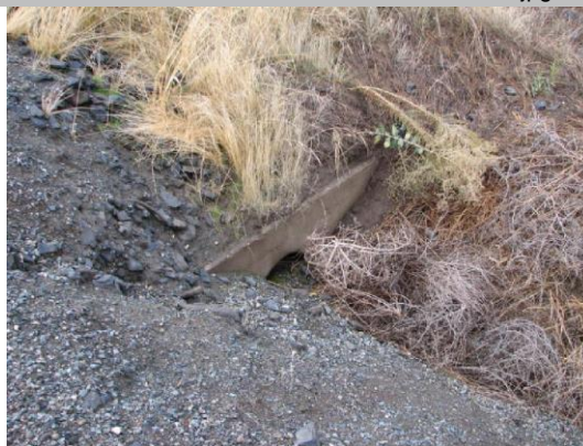
Concrete headwall on LS toe.