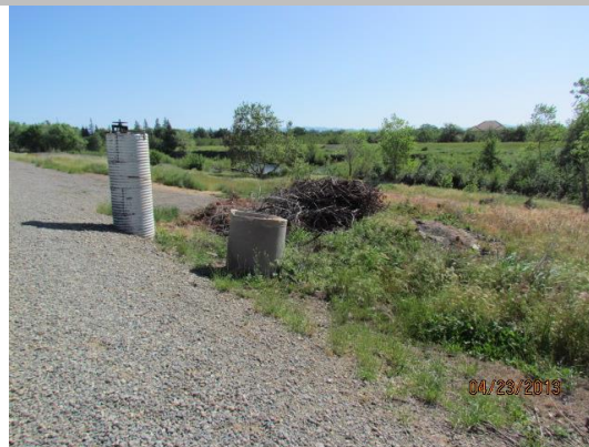
View of the prunings along the waterside toe.