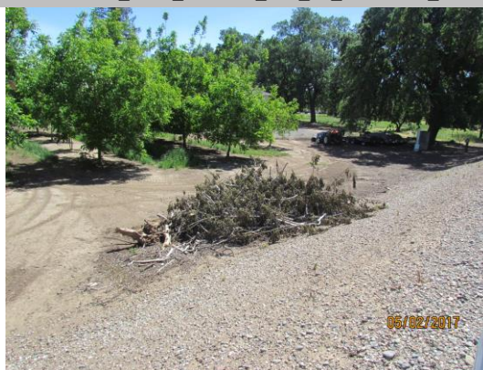
View of the prunings along the landside toe.