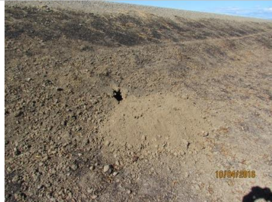
View of the rodent holes along the landside slope.