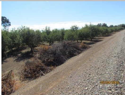
View of the prunings along the landside toe.