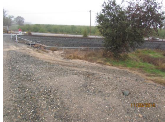
View of the vehicle slope instability along the landside slope.