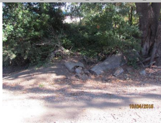
View of the wood logs and soil along the landside toe.