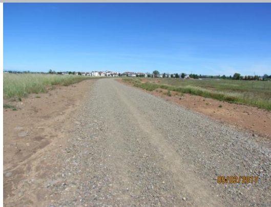
View of no vegetation on both slopes.