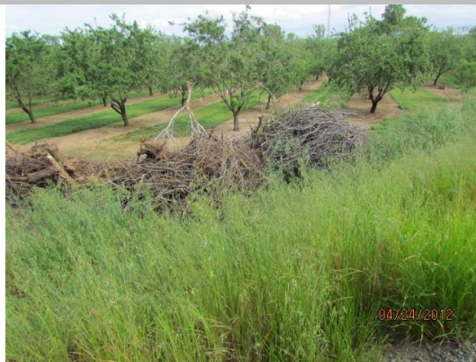
View of the brush pile at the toe of the levee.