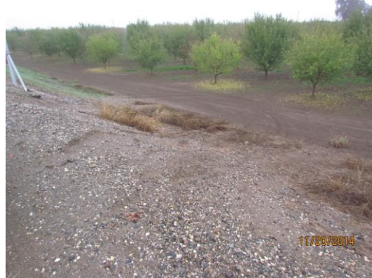
View of the vehicle erosion along the landside slope.