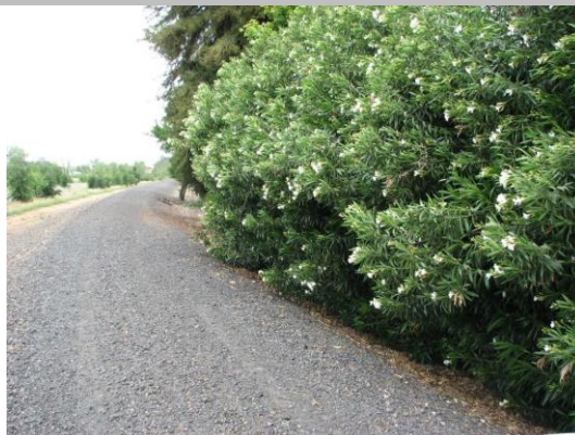
View of oleanders along the landside toe.