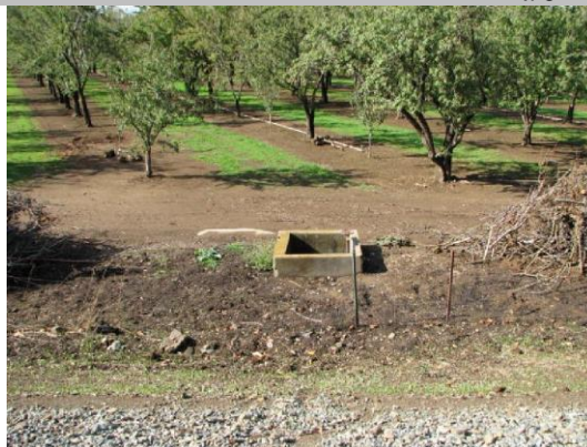
5X5 concrete distribution box at LS toe.