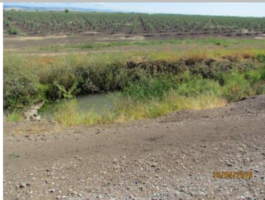
Another view of the landside toe erosion.