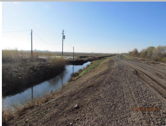
View of the irrigation ditch along the landside toe.