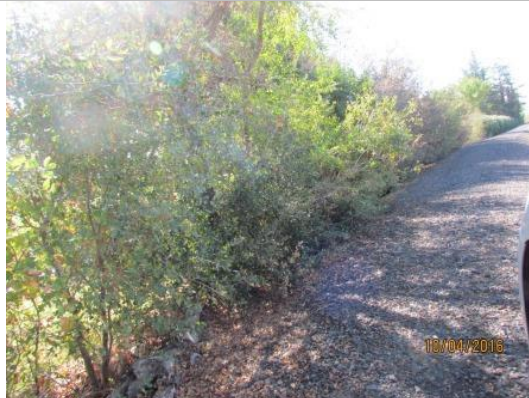
View of the trees along the landside toe blocking visibility.