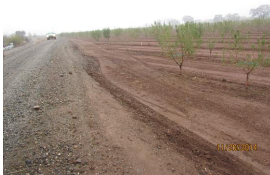
View of the tilling into the landside slope.