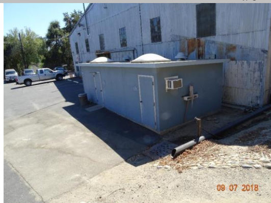
Structures at LS toe where drainage pit is located