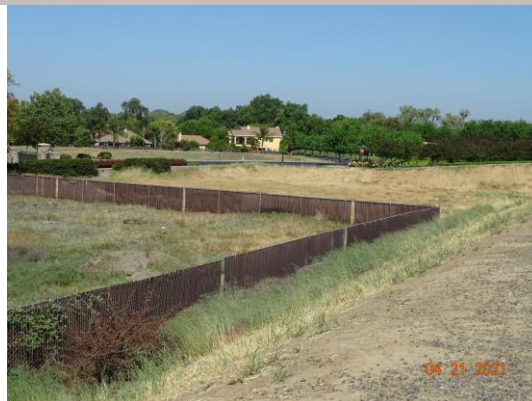
View of the privacy fence along the LS levee slope. Spring 2021.