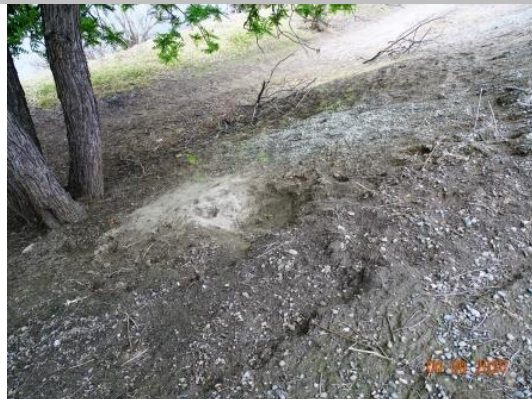
View of a hole dug into the waterside slope. Spring 2020