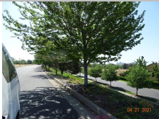
View of the trees on the LS levee shoulder. Spring 2021.