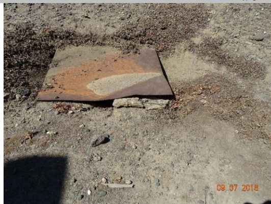
Pipe inlet concrete box is covered with metal sheeting