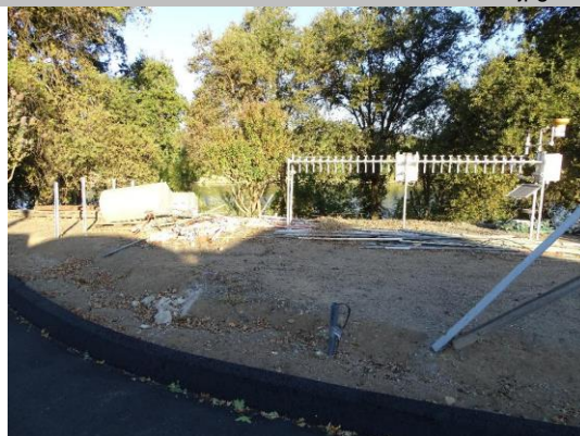
View of levee crown at the crossing