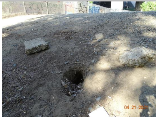
View of the rodent hole on the WS levee slope. Spring 2021.