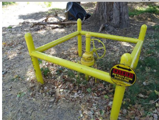
Petroleum line marker on WS