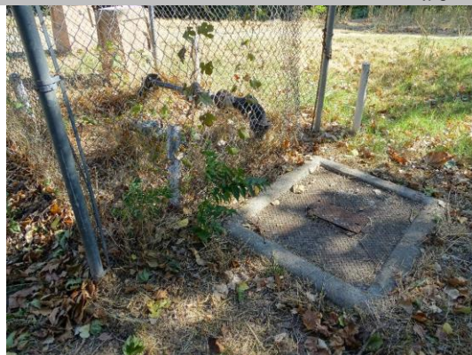
Waterside view: a control valve box with a metal lid