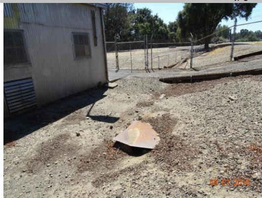
Covered concrete box at LS toe