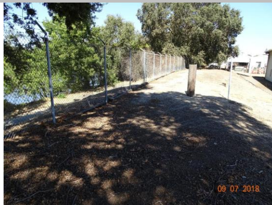
View of levee crown at crossing