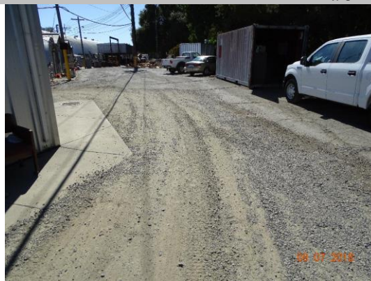
Top of levee at crossing