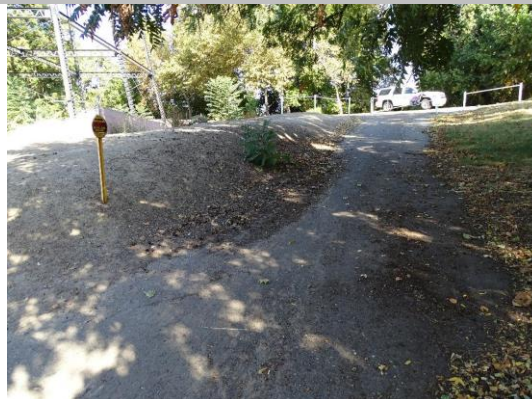
View of landside at the crossing