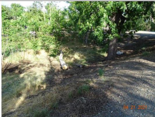
View of the tree limbs on the LS levee toe. Spring 2021.