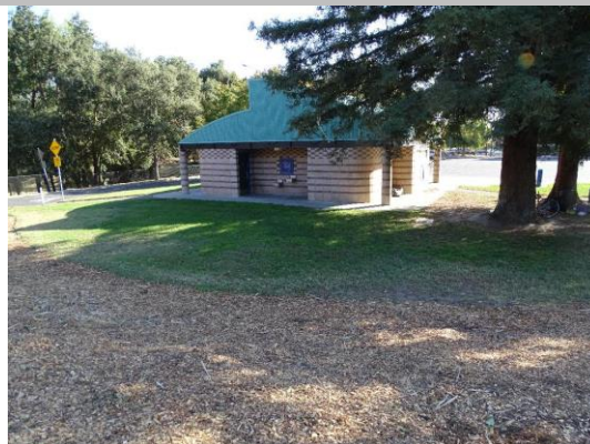
Public restroom on WS