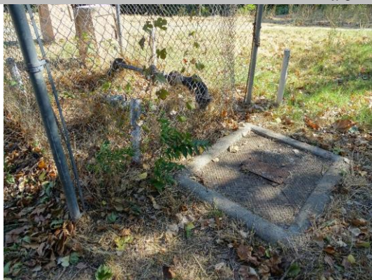
Waterside view: a control valve box with a metal lid