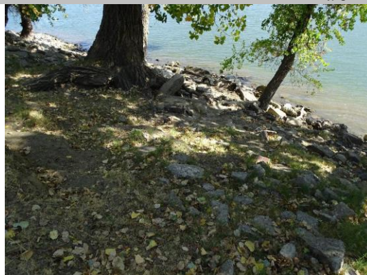
Riverbank near possible crossing