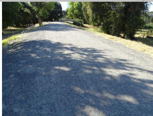
View of levee crown at possible crossing