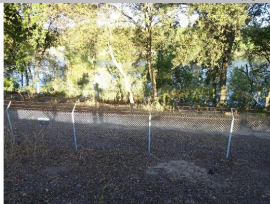
View of WS levee slope