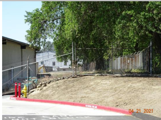
View of the fence across the levee crown on the NE side of the USACE facility. Spring 2021.