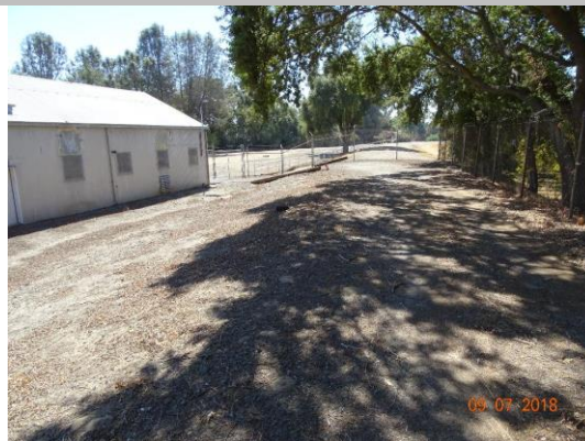
Levee crown near crossing