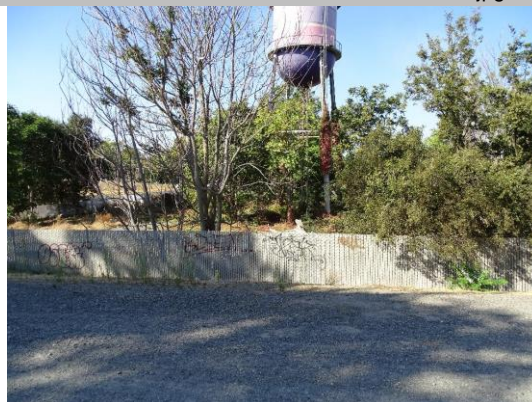
Land side view- inside water tower area