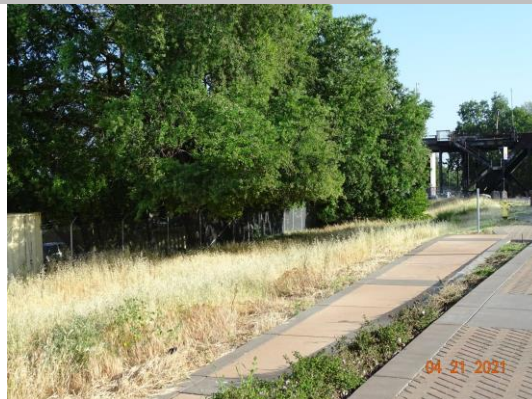
View of the annual grass on the LS levee slope. Spring 2021.