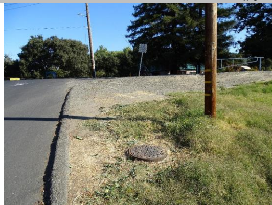
Manhole on the road shoulder on LS