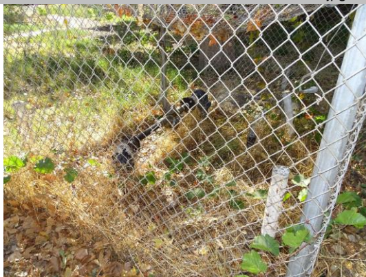
Waterside view: pipe daylights in a metal cage