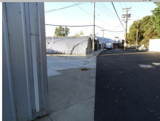
View of crown at crossing