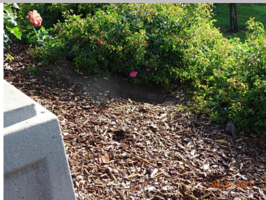
View of the rodent hole on the WS levee slope. Spring 2021.