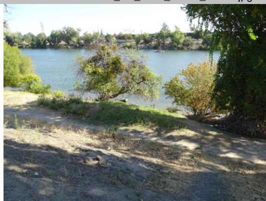
Overview of waterside at pipe crossing