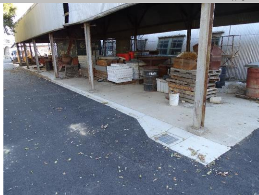
View of drainage box on levee crown