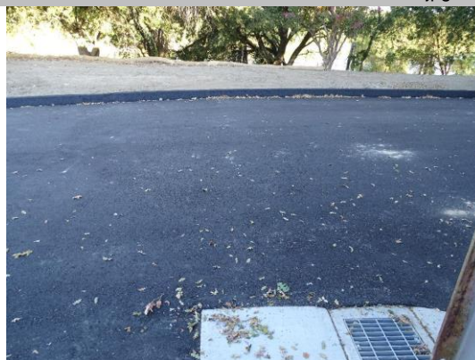
Drainage box on levee crown