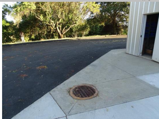
View of crown at crossing