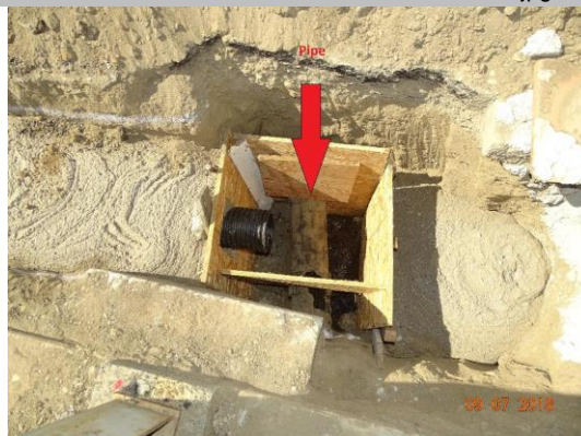
8-inch steel pipe at the bottom of drainage box on LS goes towards levee