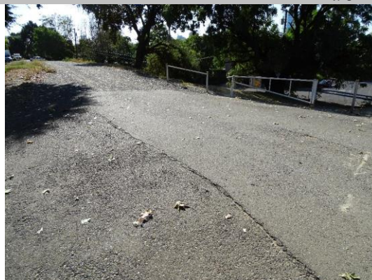
View of levee crown at crossing