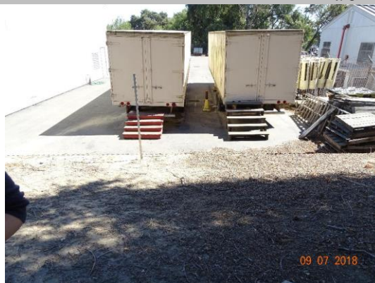
View of landside looking from levee crown