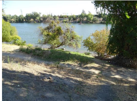
Overview of waterside at pipe crossing