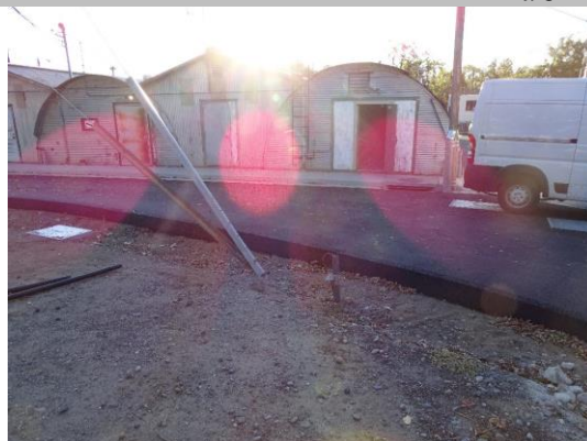
View of levee crown at potential crossing