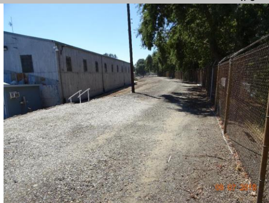
Levee crown at crossing