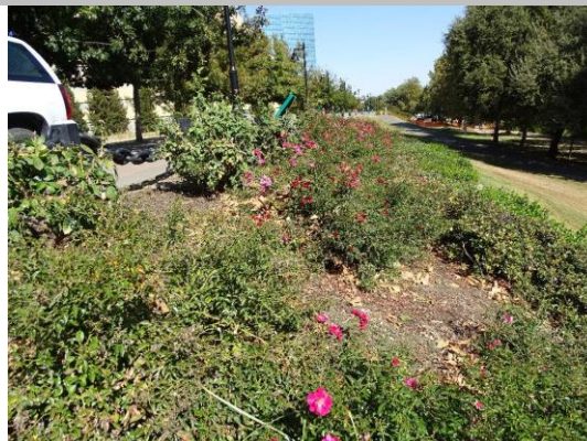
View of WS slope at potential crossing