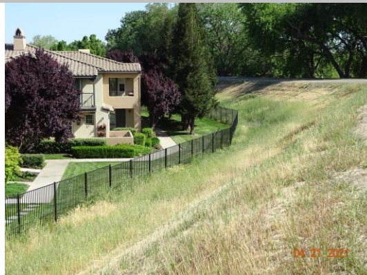
View of the fence along the LS levee toe. Spring 2021.