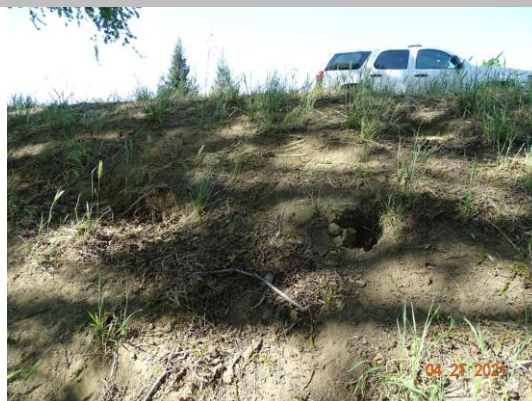
View of the animal holes on the WS levee slope. Spring 2021.

* Location LS : Land Side N/A : Not Applicable WS : Water Side CR : Crown