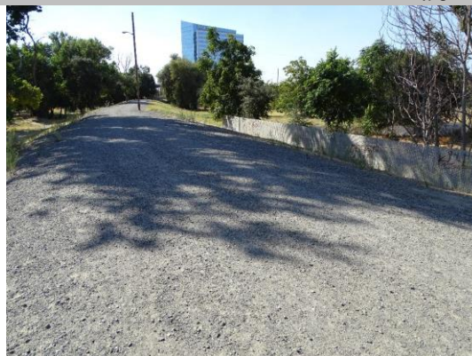
View of levee crown at crossing