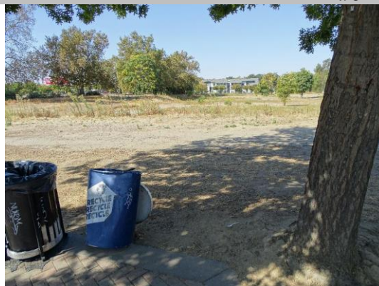
View of LS at potential crossing