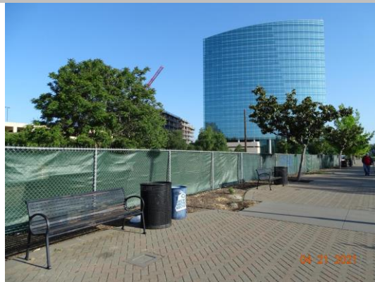
View of the fence on the LS levee shoulder. Spring 2021.