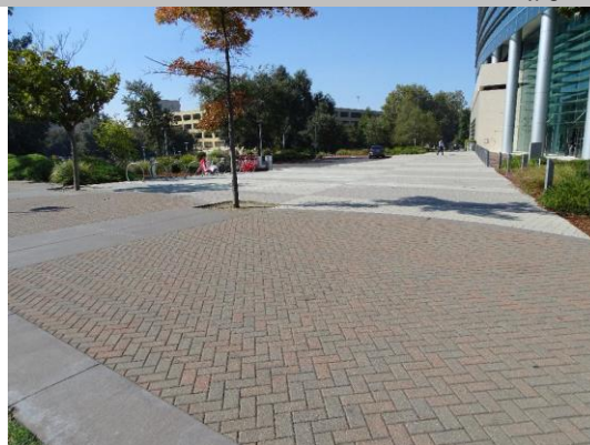
Paved levee crown at possible crossing