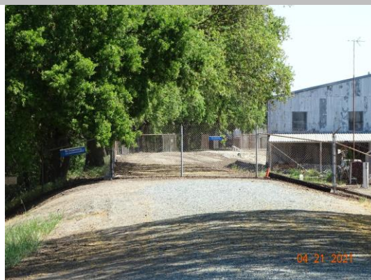
View of the fence across the levee crown at the SW side of the USACE facility. Spring 2021.