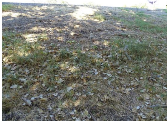
View of WS slope at possible crossing