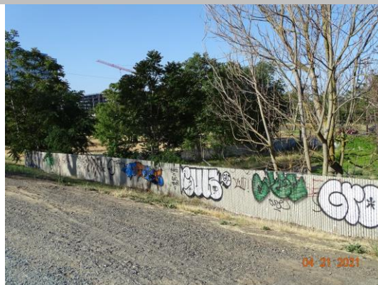
View of the fence on the LS levee slope. Spring 2021.