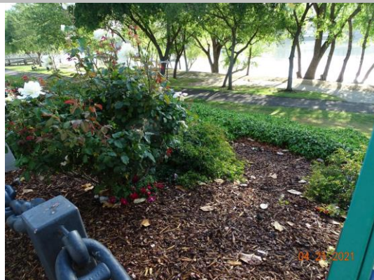
View of the burrowing area covered with mulch on the WS levee slope. Spring 2021.