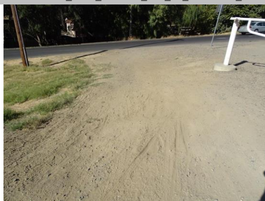
View of slope damage from vehicular traffic bypassing gate. Fall 2018

* Location LS : Land Side N/A : Not Applicable WS : Water Side CR : Crown