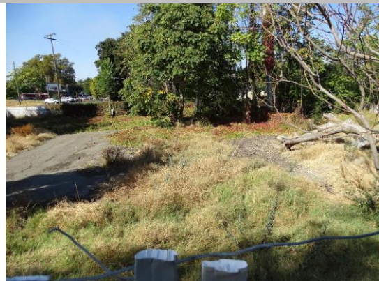
View inside of water tower area