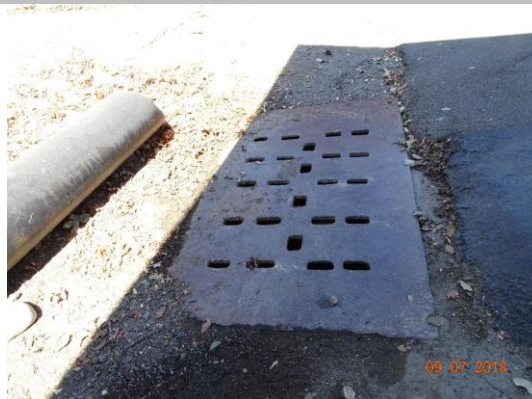
Drainage pit at LS toe