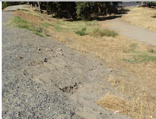
View of slope damage from vehicular traffic. Fall 2018