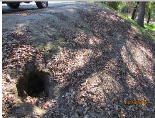
Large diameter animal burrows on LS slope. Fall 2016.

* Location LS : Land Side N/A : Not Applicable WS : Water Side CR : Crown