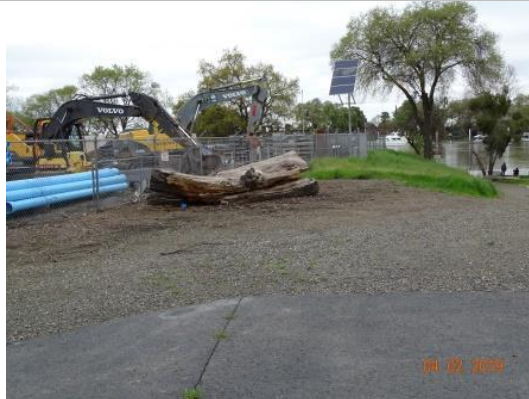
View looking north at tree log on waterside easement. Spring 2019