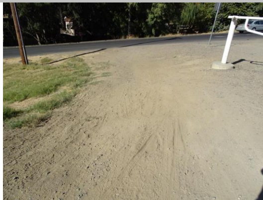
View of slope damage from vehicular traffic bypassing gate. Fall 2018