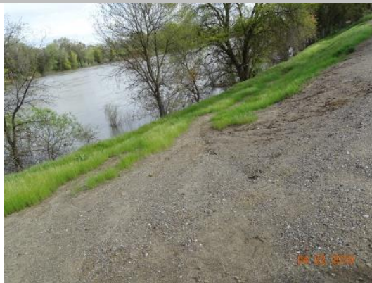
View looking north at footpath and erosion rills. Spring 2019