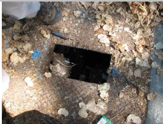
Waterside view- a manhole/control valve box.