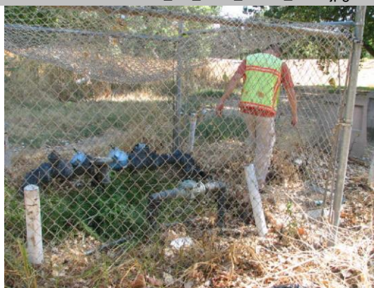
Waterside view- pipe daylight in a cage.