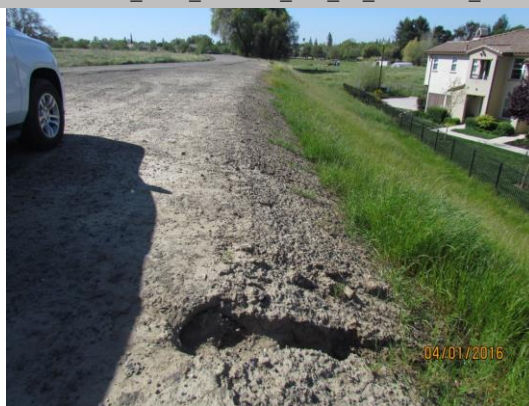
Perspective view of the runoff erosion on the landward side of the levee looking upstream. Spring 2016.