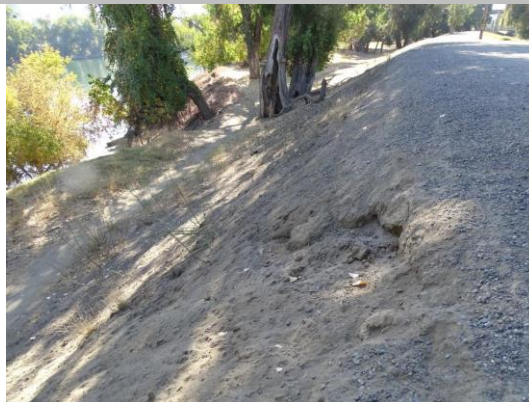
View of slope damage from foot traffic. Fall 2018

LS : Land Side N/A : Not Applicable WS : Water Side CR : Crown