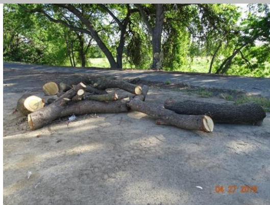
View of tree limbs on the crown. Spring 2018.