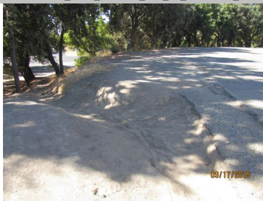
View of the depression on the landward side of the levee due to foot traffic looking upstream. Fall 2015.