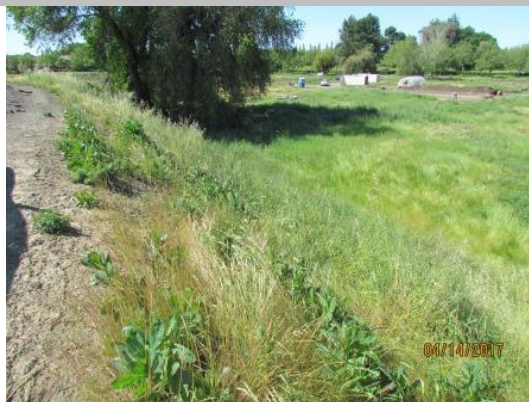
Tall grass on landside levee slope, blocking visibility. Spring 2017.

* Location LS : Land Side N/A : Not Applicable WS : Water Side CR : Crown