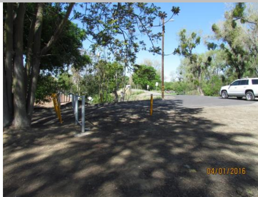
Perspective view of the bollards on the landward side looking upstream. Spring 2016.