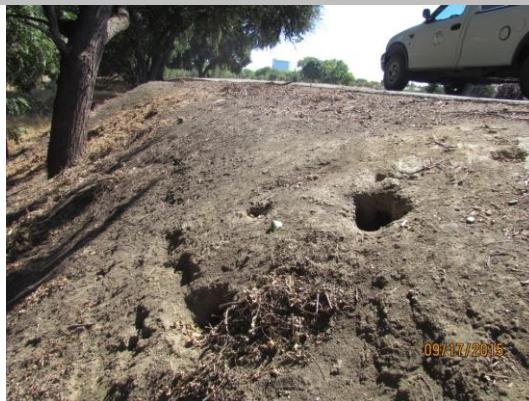
View of the animal holes on the waterward side of the levee looking downstream. Fall 2015.