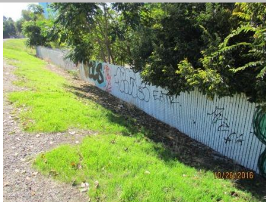
View of fence on LS slope. Fall 2016.