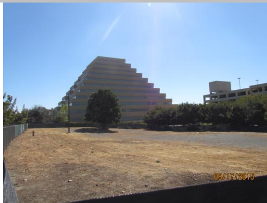
View of the inside of the fence looking downstream. Fall 2015.