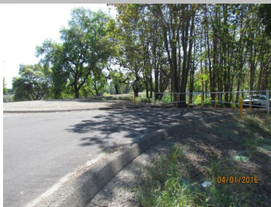
Perspective view of the bollards looking downstream. Spring 2016.