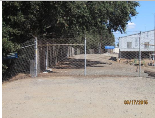
View of the fence blocking access on the crown of the levee looking downstream. Fall 2015.

* Location LS : Land Side N/A : Not Applicable WS : Water Side CR : Crown