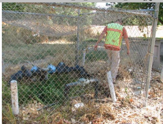
Waterside view- pipe daylight in a cage.