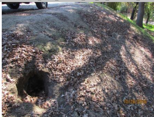
Large diameter animal burrows on LS slope. Fall 2016.

LS : Land Side N/A : Not Applicable WS : Water Side CR : Crown