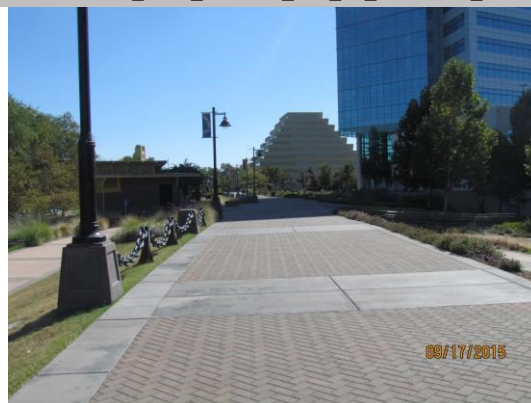
The Riverwalk is part of the landscape on the levee. Fall 2015.