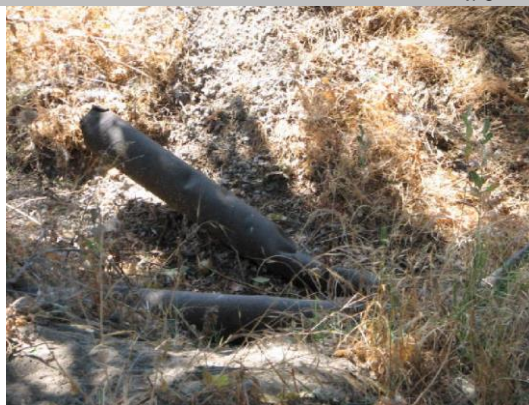
Land side view- abandoned pipes inside the tower area.