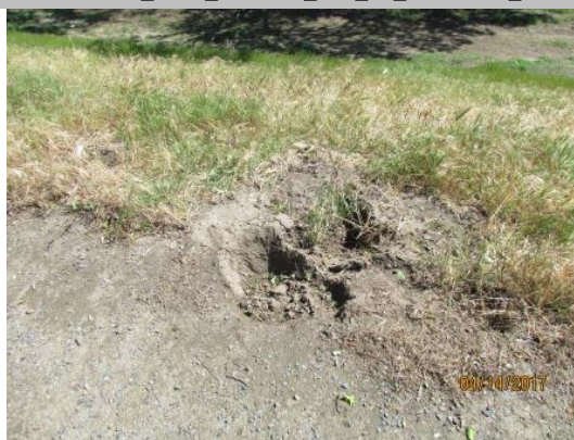
View of one rodent hole on waterside levee slope. Spring 2017.