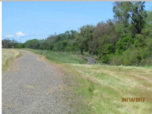
Tall grass on waterside levee slope, blocking visibility. Spring 2017.

* Location LS : Land Side N/A : Not Applicable WS : Water Side CR : Crown