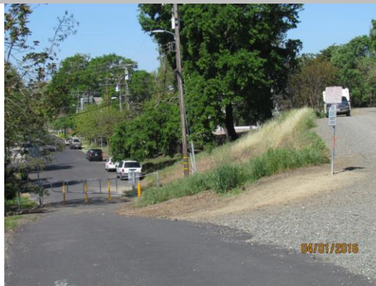
Perspective view of the bollards at the levee toe looking upstream. Spring 2016.