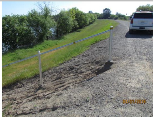
View of the slope stability on the waterward side of the levee looking downstream. Spring 2016.