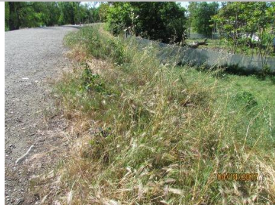
Tall grass on landside levee slope, blocking visibility. Spring 2017.