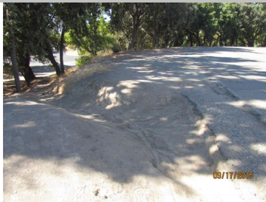
View of the depression on the landward side of the levee due to foot traffic looking upstream. Fall 2015.