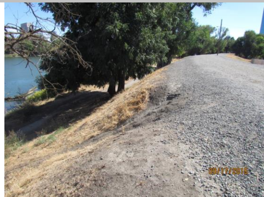
View of the slope stability due to foot traffic on the waterward side of the levee looking downstream. Fall 2015.