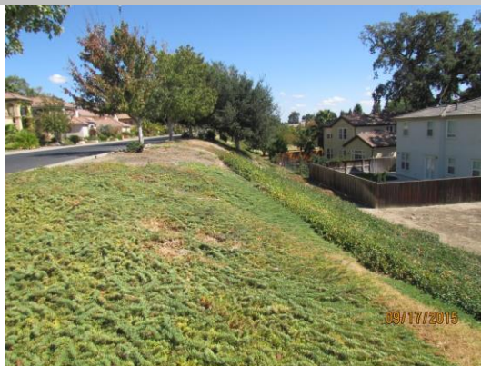
View of the landscaping on the landward side of the levee looking downstream. Fall 2015.