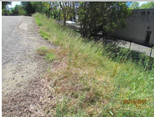
Tall grass on landside levee slope, blocking visibility. Spring 2017.