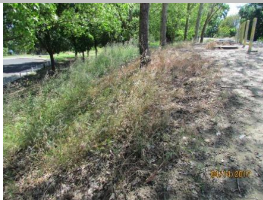
Tall grass on waterside levee slope, blocking visibility. Spring 2017.