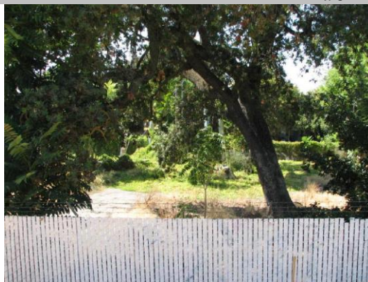
Land side view- Water tower area.