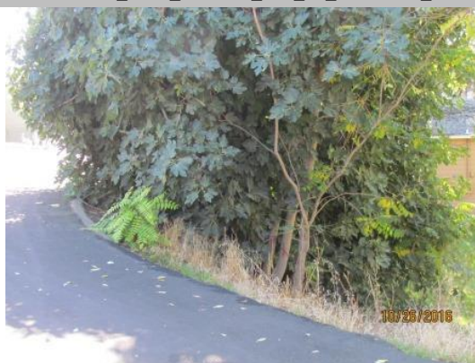
View of small trees that block visibility of LS slope. Fall 2016.