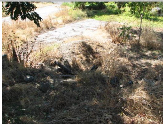
Land side view- abandoned pipes inside the tower area