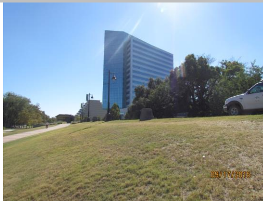
Landscaping and buildings are on the crown and waterward side of the levee. Fall 2015.