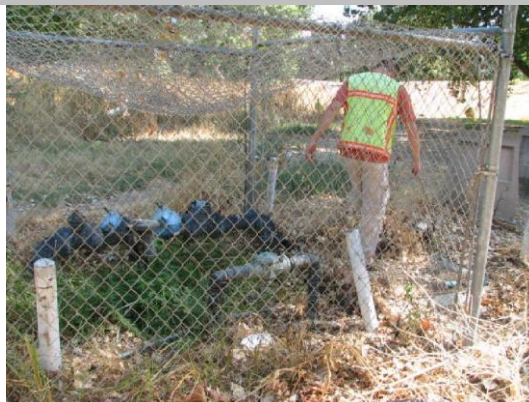
Waterside view- pipe daylight in a metal cage.