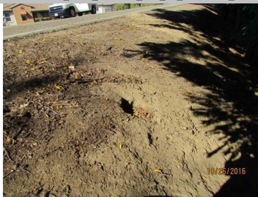
Updated view of animal holes on WS slope. Fall 2016.