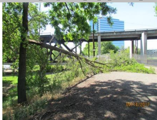
View of fallen tree on levee crown. Spring 2017.