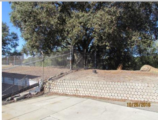
View of fence crossing the crown on NE side of USACE facility. Fall 2016.