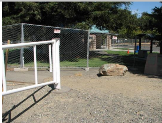
Waterside view- public facility in the background.