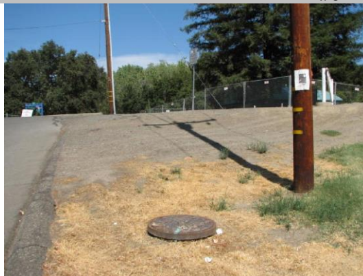
Landside view- manhole on the side of the levee and a road.