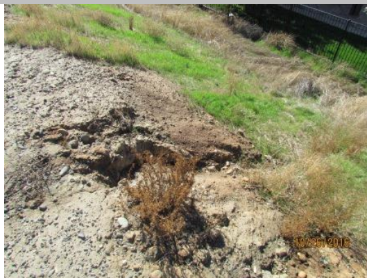
Runoff erosion that causes slope instability. Fall 2016.

LS : Land Side N/A : Not Applicable WS : Water Side CR : Crown