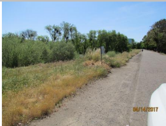
Tall grass on waterside levee slope, blocking visibility. Spring 2017.