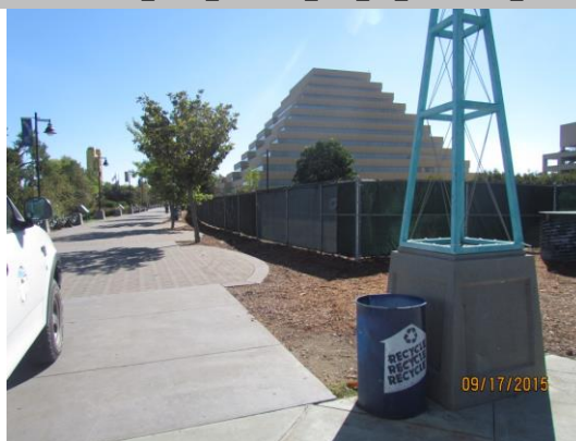
View of the fence on the crown of the levee looking downstream. Fall 2015.