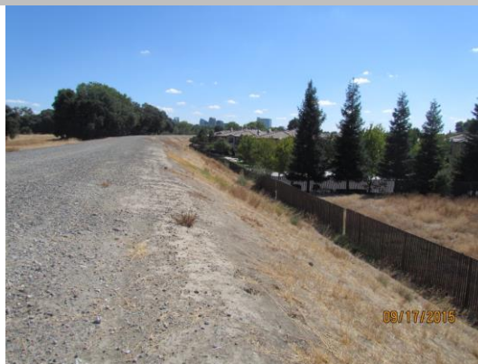
View of the fence running along the toe of the landward side of the levee looking downstream. Fall 2015.