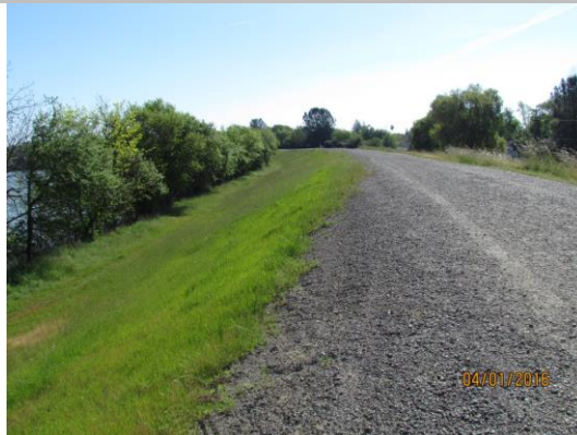
View of the vegetation on the waterward side of the levee looking downstream. Spring 2016.