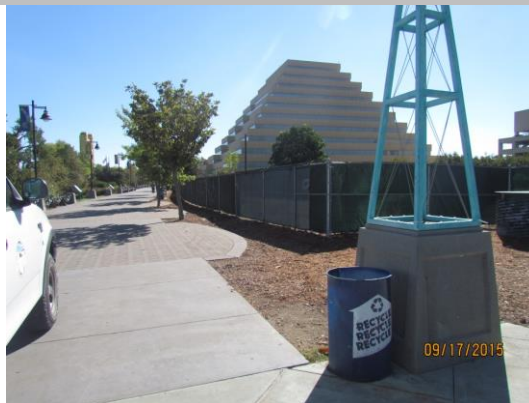
View of the fence on the crown of the levee looking downstream. Fall 2015.