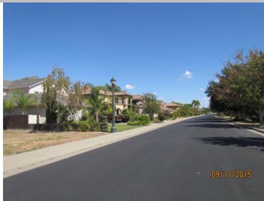
View of the houses on the crown of the levee looking downstream. Fall 2015.

* Location LS : Land Side N/A : Not Applicable WS : Water Side CR : Crown