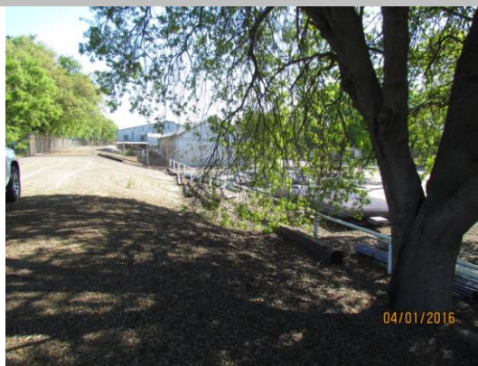
View of the tree branches on the landward side of the levee looking downstream. Spring 2016.