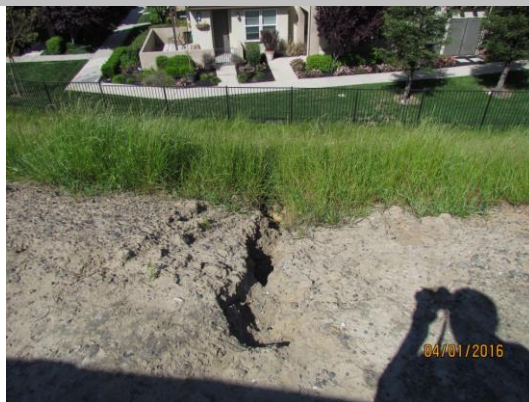
Runoff erosion is on the shoulder of the landward side. Spring 2016.

* Location LS : Land Side N/A : Not Applicable WS : Water Side CR : Crown