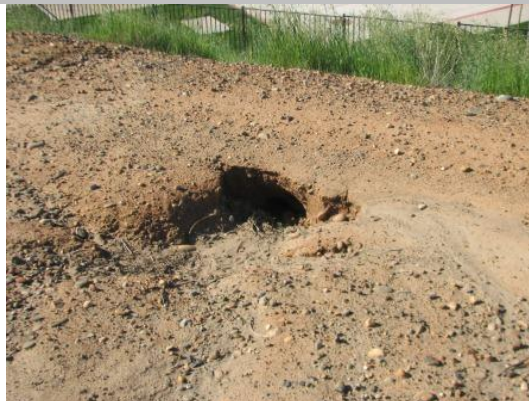
Erosion on levee shoulder entrance side on crown. Spring 2014