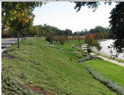
The landside levee slope is landscaped. Fall 2013