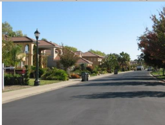
Houses have been built on the crown of the levee. Fall 2013

LS : Land Side WS : Water Side CR : Crown