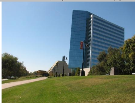
Landscaping and buildings are on the crown and waterside levee. Fall 2013