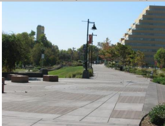
The Riverwalk is part of the landscape on the levee. Fall 2013