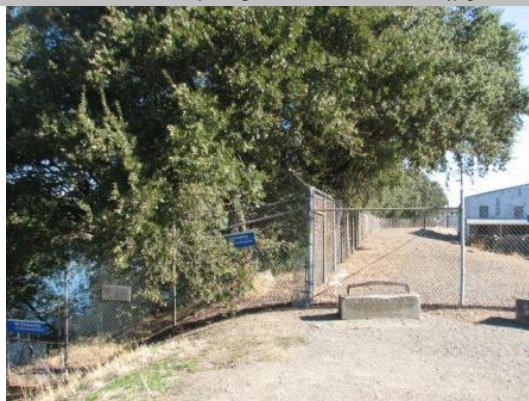
The trees are partially obstructing visibility. Fall 2013

LS : Land Side WS : Water Side CR : Crown