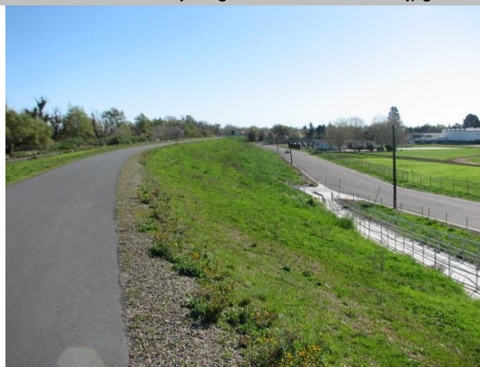
The vegetation is 50% grasses and complies with standards. Spring 2014