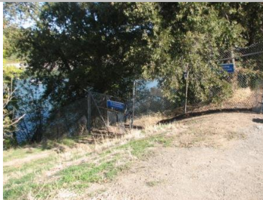
The fence blocks access to the waterside levee slope. Fall 2013