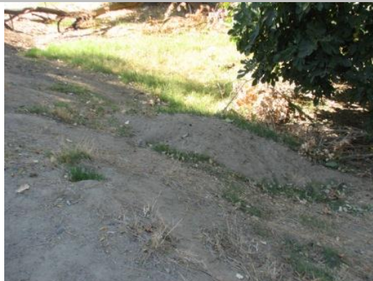
A large rodent hole on the landside levee slope. Fall 2013