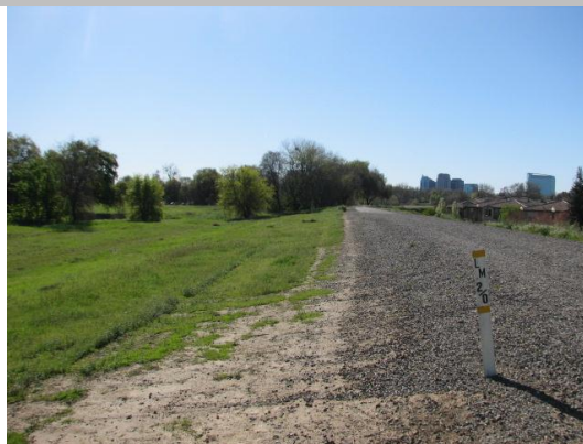
Tall grasses partially blocks visibility. Spring 2014