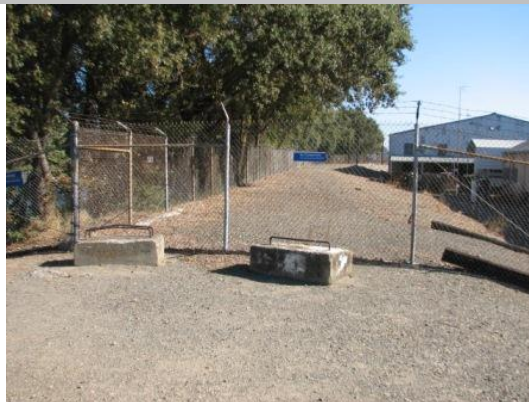
The fence blocks the crown of the levee. Fall 2013

* Location LS : Land Side WS : Water Side CR : Crown