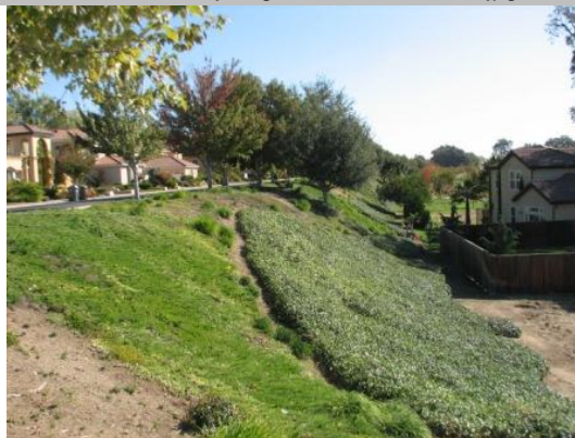
The landside of the levee slope is landscaped. Fall 2013