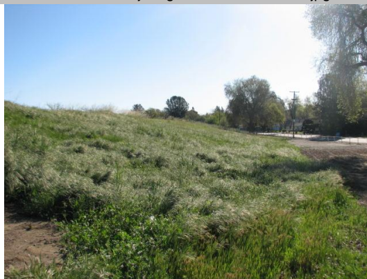
The vegetation complies with standards. Spring 2014