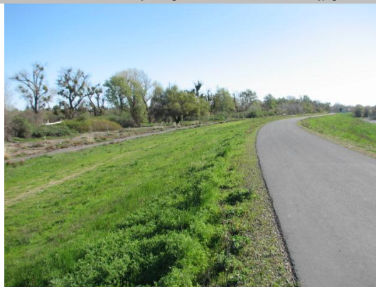
The vegetation is 50% grasses and complies with standards. Spring 2014

* Location LS : Land Side WS : Water Side CR : Crown