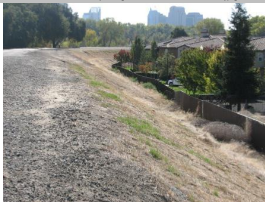
The fence runs along the toe and is within the easement. Fall 2013

* Location LS : Land Side WS : Water Side CR : Crown