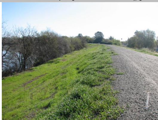
The vegetation complies with standards. Spring 2014