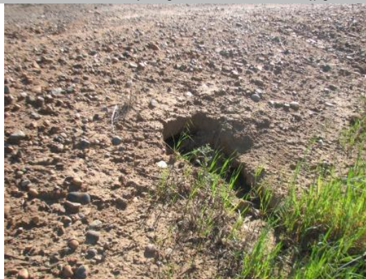
The exit side of the erosion from shoulder. Spring 2014