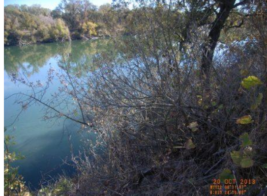
USACE 2013 Photo #2