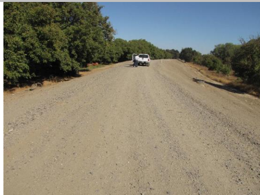
View of levee crown and slopes looking upstream at crossing.