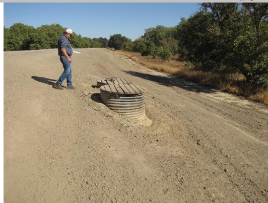
View of CMP risers located on WS slope.