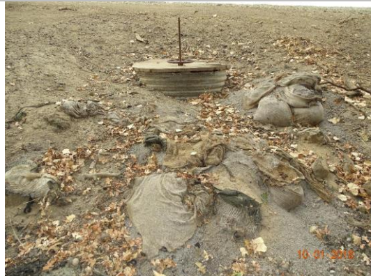
View of CMP riser at WS shoulder.