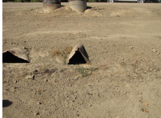
CMP pipe outlet deformed with over 50 percent blockage.