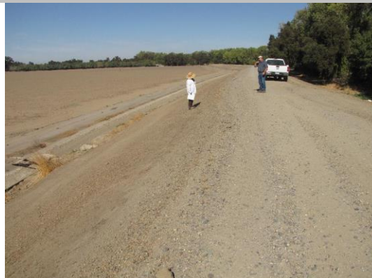
View of LS looking upstream.