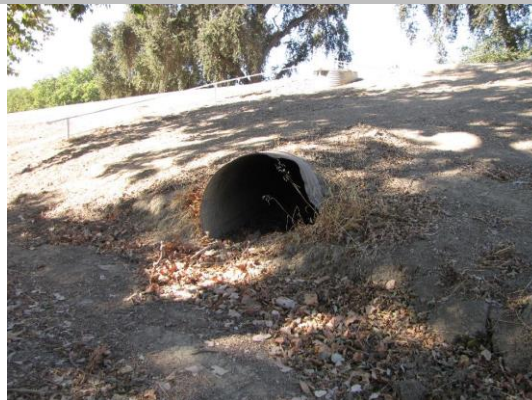
View of outlet located at WS toe.