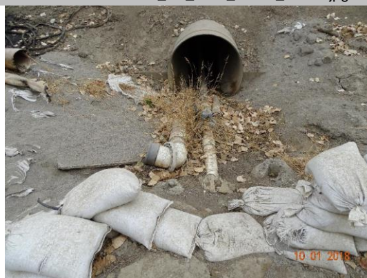
Pipe at LS toe.