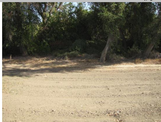
View of WS no structure features visible.