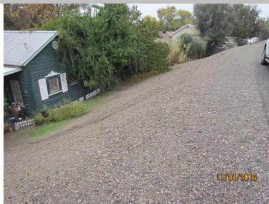
View of the slope instability along the landside slope.

Photo 1 of 1 : SP_2020_MA0001_297_94_20200226_00024.jpg