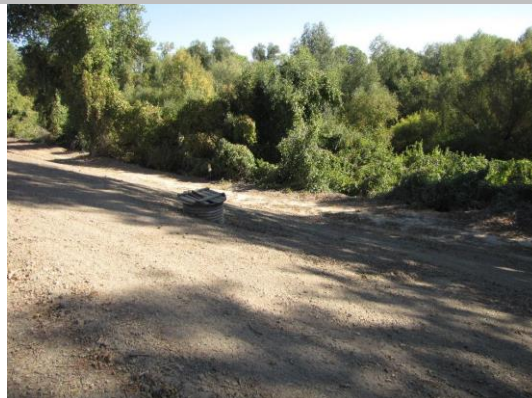
View of WS slope and toe.