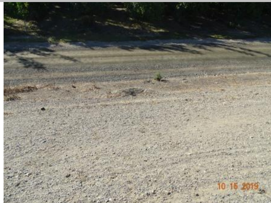
View of the rodent activity at the landside toe. Fall 2019.