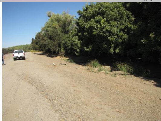
View of WS looking upstream.