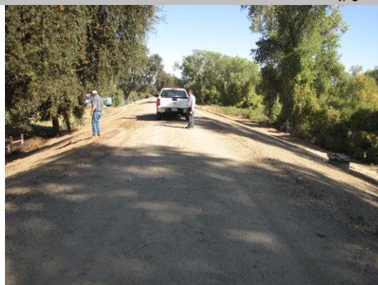
Overview of levee crown looking upstream at crossing.