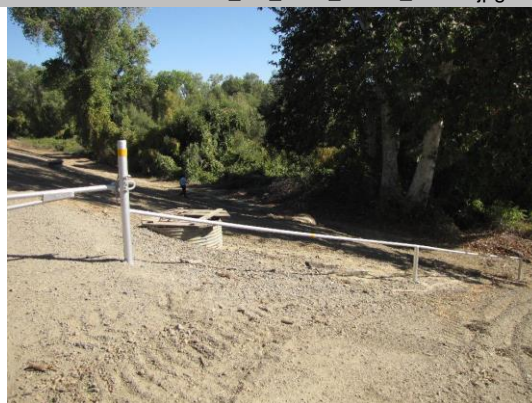
View of WS looking at slope and channel.