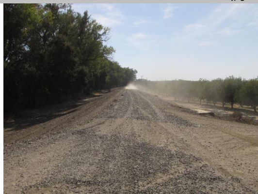
Overview of levee crown looking downstream at crossing.