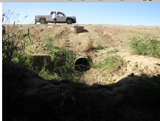
View of WS slope, riser with slide gate, and outlet.