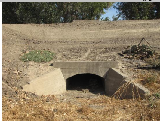
View of structure located in LS.