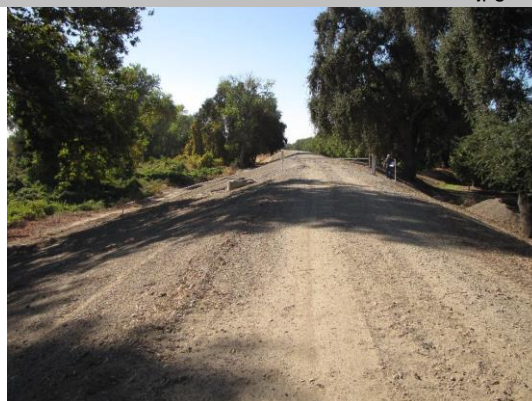
View of levee crown looking downstream at crossing. CMP riser located on WS shoulder.