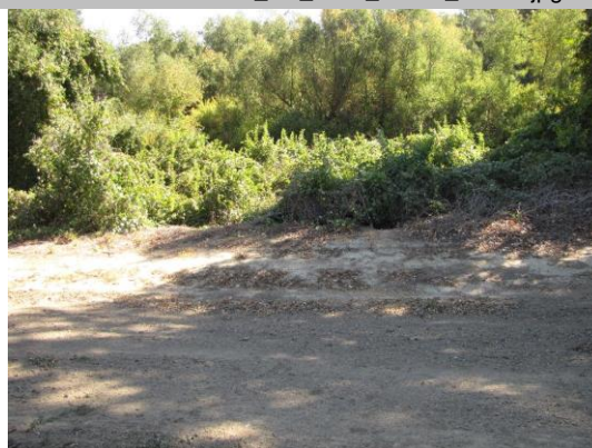
Unable to locate WS outlet.