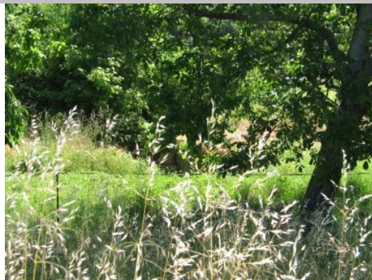
View of the erosion along the waterside of the levee.

* Location LS : Land Side N/A : Not Applicable WS : Water Side CR : Crown