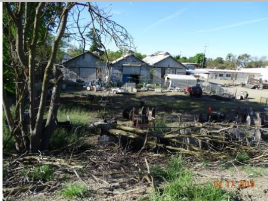
View of the tree branches and limbs at the landside toe. Spring 2019.