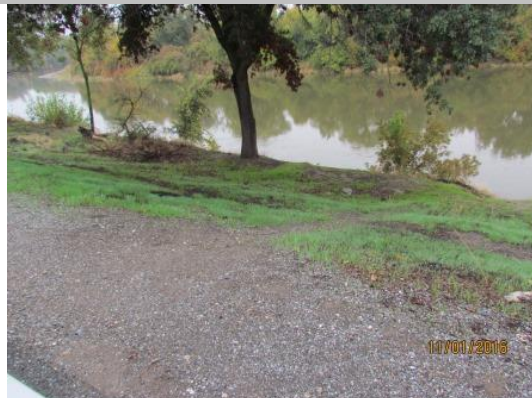
View of the slope instability along the waterside slope.