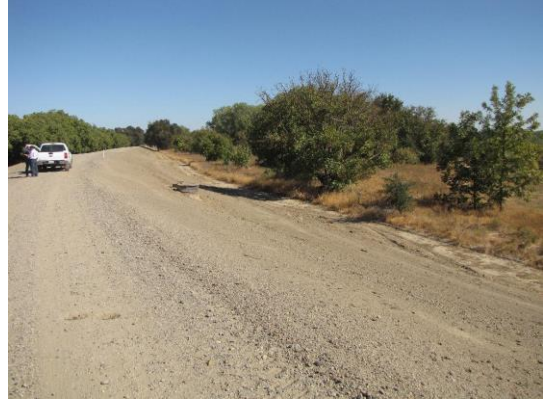
View of WS looking upstream at CMP riser on slope.