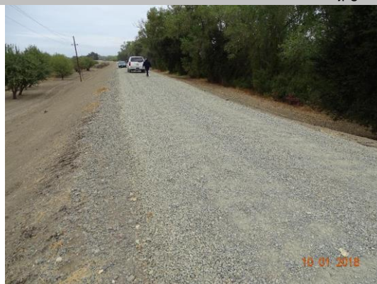
View of levee crown at crossing.