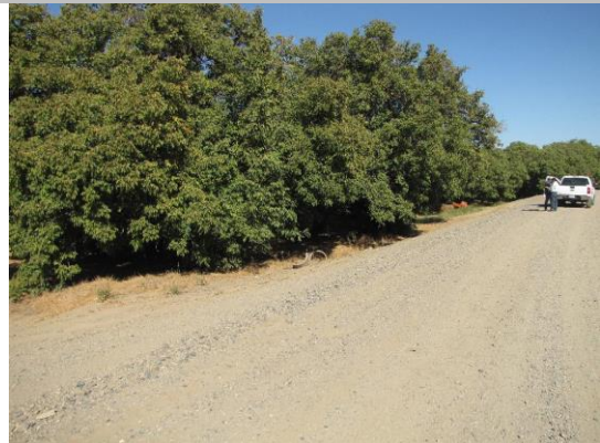
View of LS looking upstream at crossing.