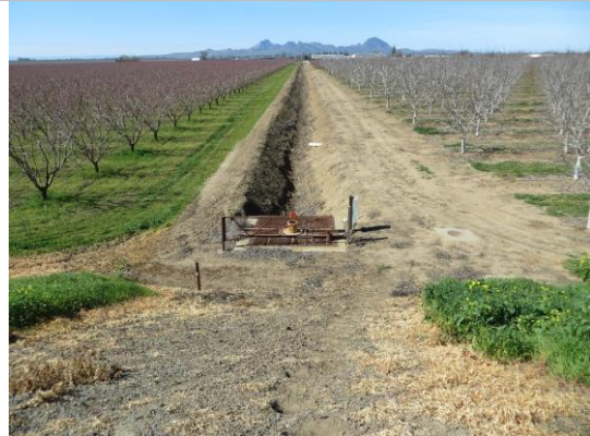
LS at trash rack and pumping plant.