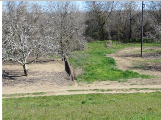
Pipe on WS toe.