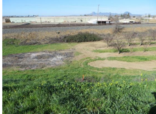
Gasline marker at LS toe.