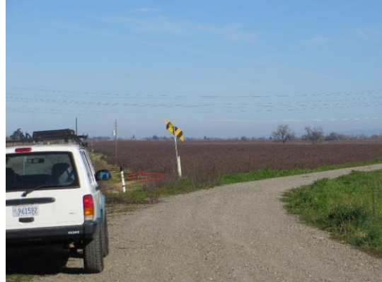
Fiber optic line marker on LS shoulder