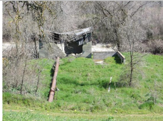
Pipe and pumphouse on WS toe/bench.