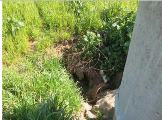
Corroded and damaged pipe at connection to concrete riser on LS toe.