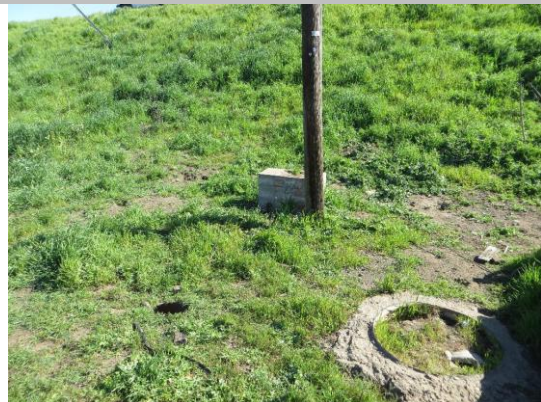
JP at pump on LS toe.