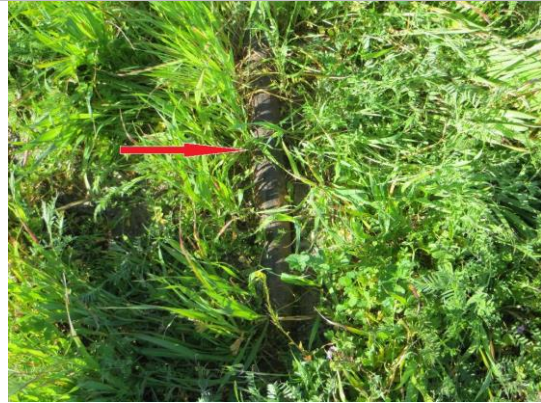
Pipe at crown on LS shoulder.