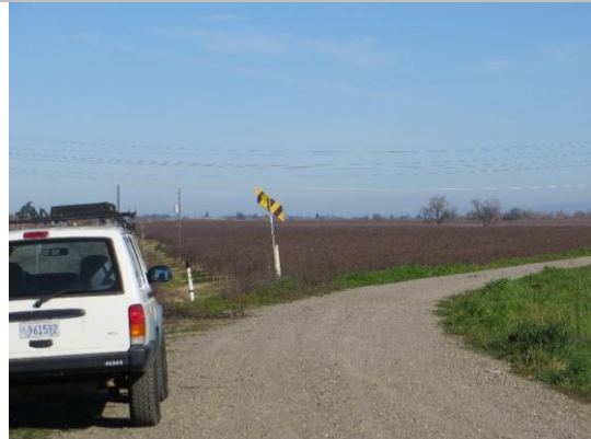
Marker on LS shoulder.