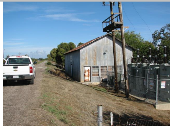
Building at the waterside toe.