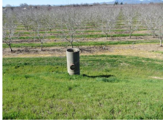
CMP riser on LS toe.