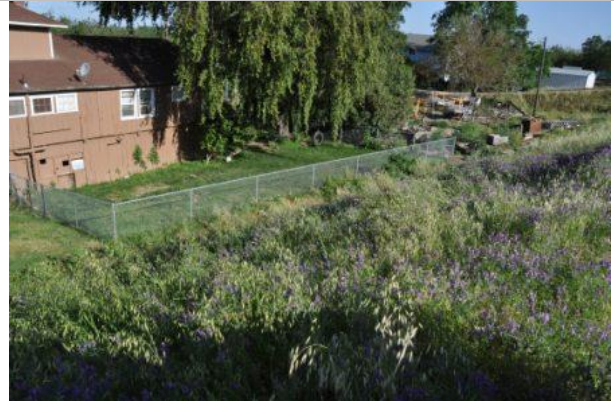
L/S fence along levee toe.