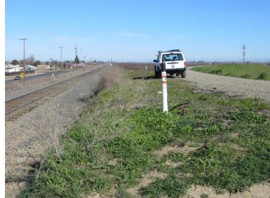
Fiber optic line marker on LS shoulder.