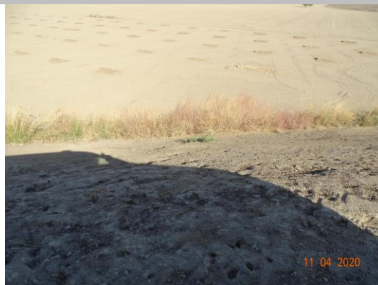
View of the rodent activity along the landside slope. Fall 2020.