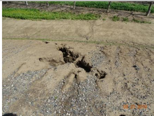
View of the erosion caused by water runoff and rodent holes on the landside slope, facing east. (Spring 2019)