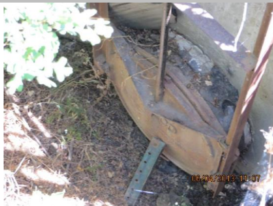
Slidegate inside concrete box on WS slope.