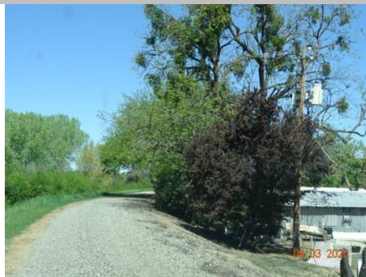
View of the landscaping along the landside slope. Spring 2020.