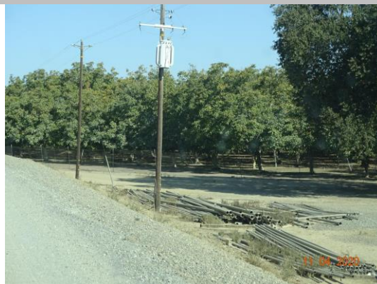
View of the ag pipes along the landside toe. Fall 2020.