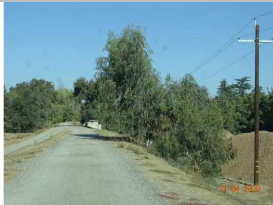
View of the trees that require trimming along the landside slope and toe. Fall 2020.