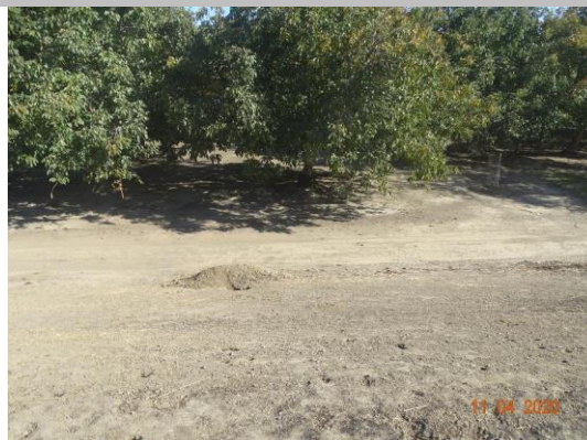
View of the rodent activity along the landside slope. Fall 2020.