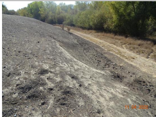
View of the vertical cut along the waterside slope and toe. Fall 2020.