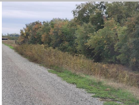
View of the vegetation on the waterside slope. Fall 2021.