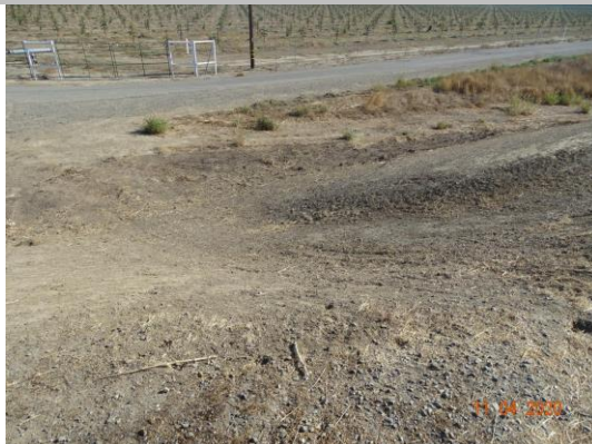
View of the damaged landside slope due to vehicle traffic. Fall 2020.