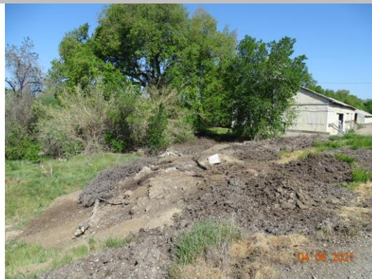
View of the pile of materials and prunings along the waterside slope and toe. Spring 2021.