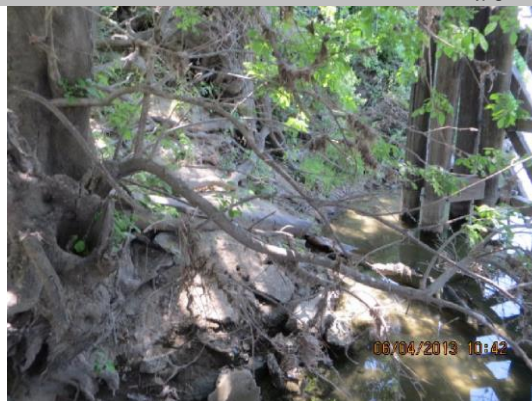
14-inch Pipe debris on WS toe.