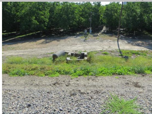
Distribution box on LS toe.