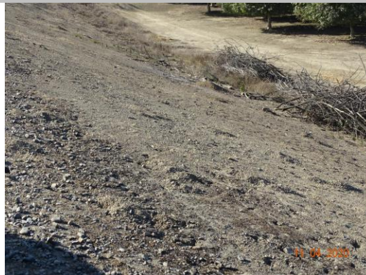
View of the rodent activity along the waterside slope. Fall 2020.