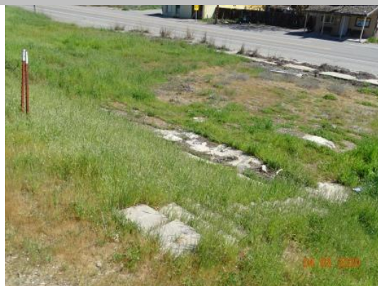
View of the concrete stairs and foundation along the landside slope and toe. Spring 2020.