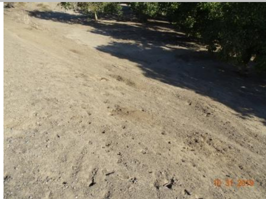
View of the rodent burrows on the landside slope. Fall 2019.