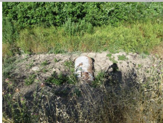
24-inch CMP stormdrain on WS toe.