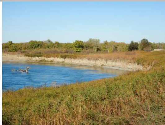
USACE 2018 Erosion Photo #1