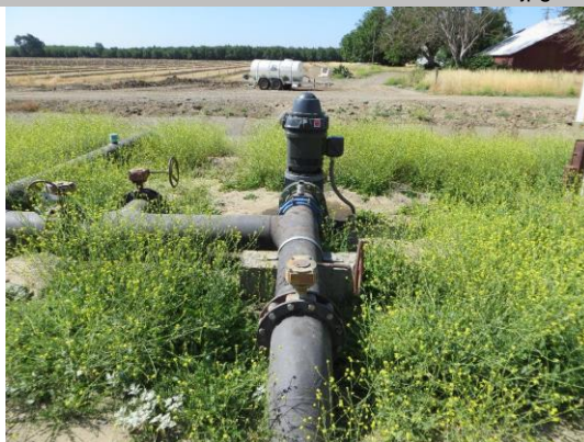
Pump and butterfly valve off LS toe.