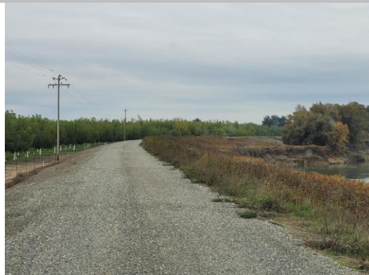
View of the vegetation along the waterside slope. Fall 2021.