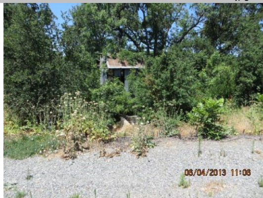
Pumphouse and 7'X12' concrete box on WS slope.