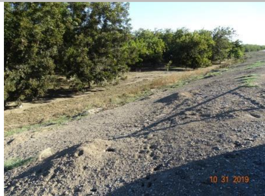
View of rodent burrows along the waterside slope. Fall 2019.