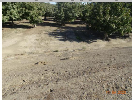
View of the rodent activity along the landside slope. Fall 2020.

* Location LS : Land Side N/A : Not Applicable WS : Water Side CR : Crown