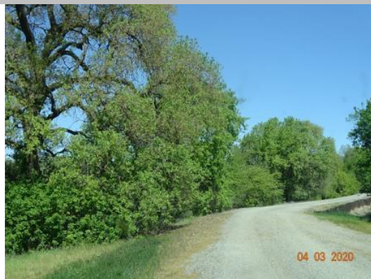
View of the trees that need to be trimmed to at least 5 feet above the ground. Spring 2020.