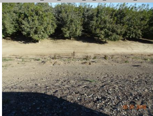
View of the rodent burrows along the waterside slope. Fall 2019.

* Location LS : Land Side N/A : Not Applicable WS : Water Side CR : Crown