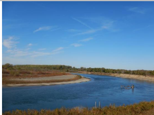
USACE 2018 Erosion Photo #2