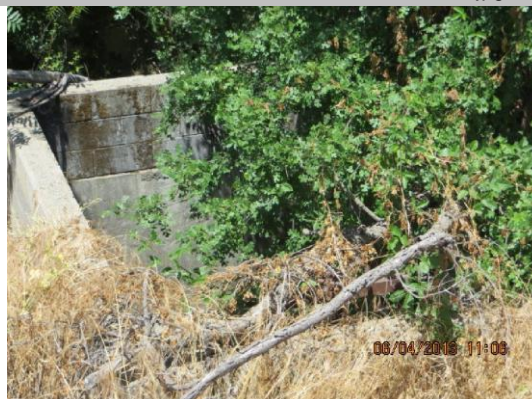
7'X12' Concrete box with flap gate and slide gate on WS slope.