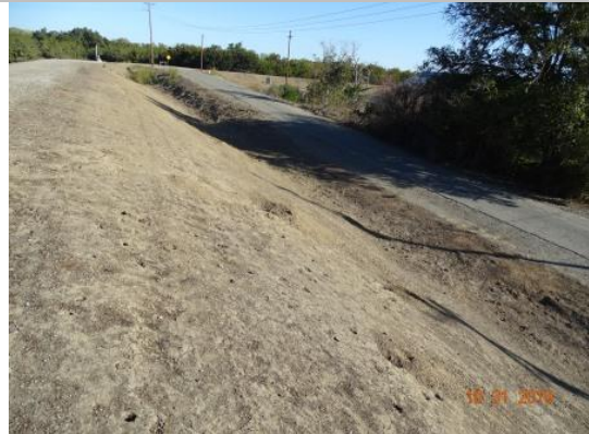
View of the rodent burrows along the landside slope. Fall 2019.