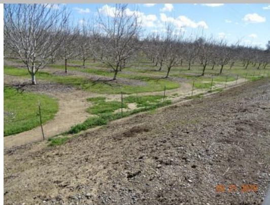
View of the rodent holes along the landside slope, facing downstream. (Spring 2019)

* Location LS : Land Side N/A : Not Applicable WS : Water Side CR : Crown