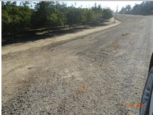
View of the damaged landside slope due to vehicle traffic. Fall 2020.