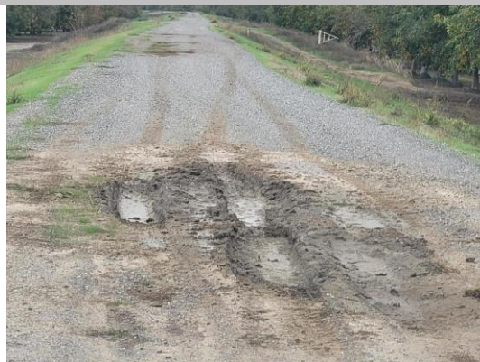
View of the tire ruts on the crown. Fall 2021.