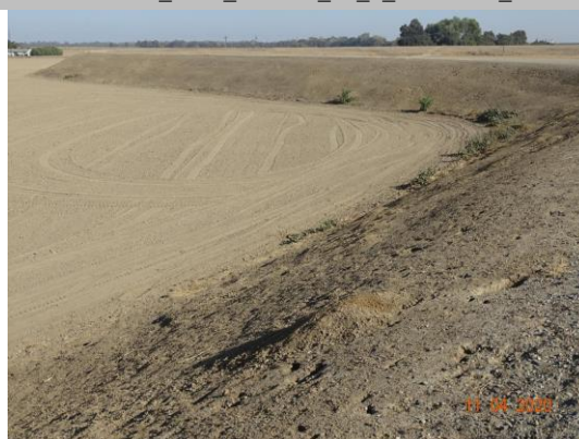
View of the rodent activity along the landside slope. Fall 2020.

* Location LS : Land Side N/A : Not Applicable WS : Water Side CR : Crown