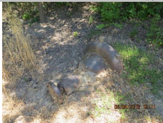
Pump visible off WS toe, next to pond.