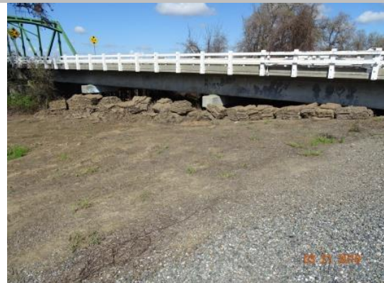
View of the sod piles on the waterside slope within the floodway, facing upstream. (Spring 2019)