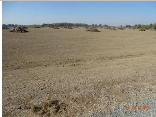
View of the rodent activity along the waterside slope. Fall 2020.