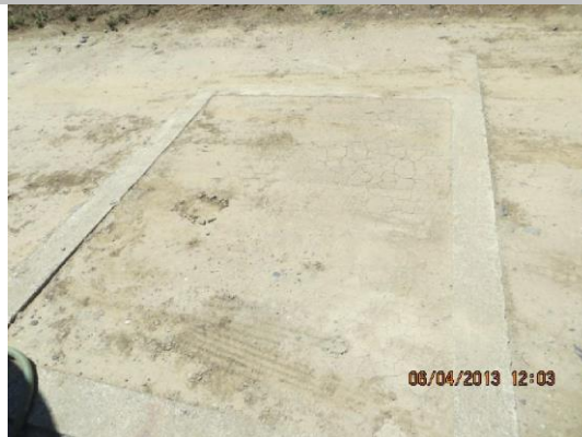
Soil filled concrete distribution box on LS toe.