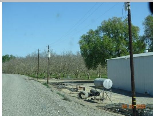
View of the equipment along the landside toe. Spring 2020.

* Location LS : Land Side N/A : Not Applicable WS : Water Side CR : Crown