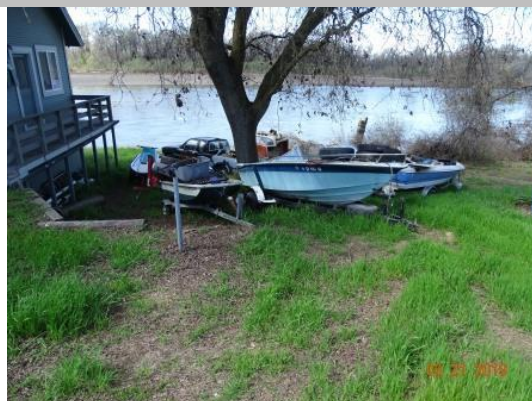
View of the boats on the waterside slope and toe, facing west.

* Location LS : Land Side N/A : Not Applicable WS : Water Side CR : Crown