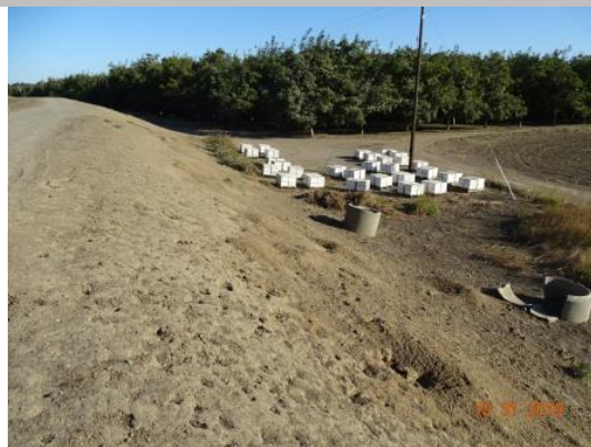
View of the rodent burrows along the landside slope. Fall 2019.