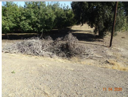
View of the prunings along the landside toe. Fall 2020.