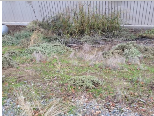
View of the burned out stump hole along the landside toe. Fall 2021.