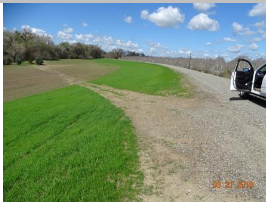
View of the waterside slope damage caused by vehicle traffic, facing upstream. (Spring 2019)