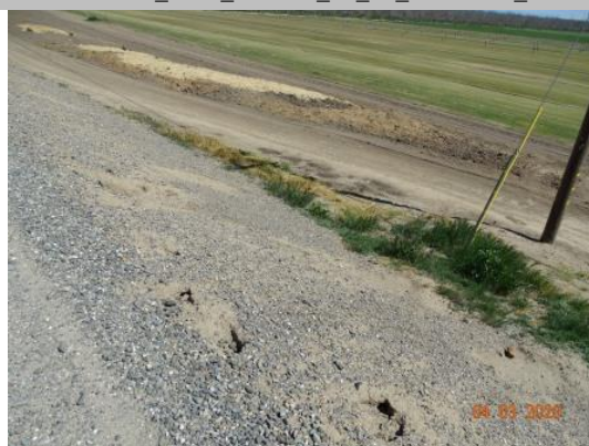
View of the rodent holes along the landside slope. Spring 2020.

Photo 1 of 1 : FA_2021_LD0003_27_71_20210928_00025.jpg