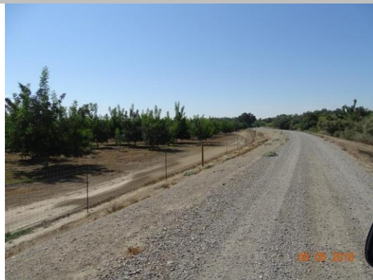
View of the fence along the landside toe.