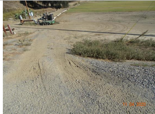
View of the damaged landside slope due to vehicle traffic. Fall 2020.