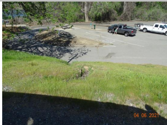
View of the erosion on the waterside slope. Spring 2021.

* Location LS : Land Side N/A : Not Applicable WS : Water Side CR : Crown