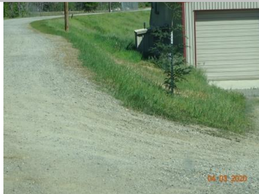
View of damaged landside slope caused by vehicle traffic. Spring 2020.