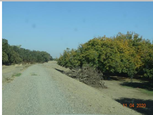
View of the prunings along the landside toe. Fall 2020.

* Location LS : Land Side N/A : Not Applicable WS : Water Side CR : Crown