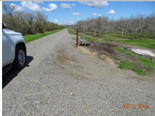
View of the erosion caused by vehicle traffic along the landside slope and crown, facing upstream. (Spring 2019)