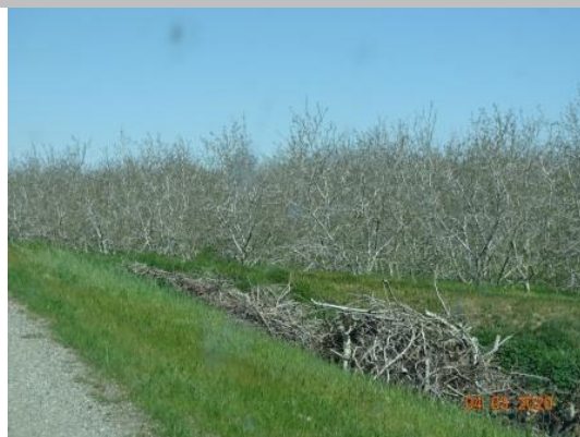
View of the prunings on the landside slope and toe. Spring 2020.

* Location LS : Land Side N/A : Not Applicable WS : Water Side CR : Crown