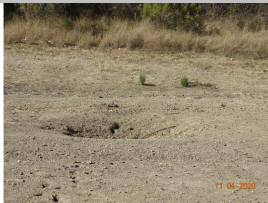
View of a hole on the waterside slope. Fall 2020.