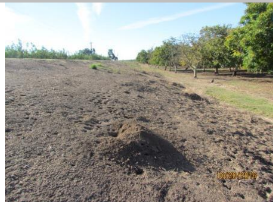
View of the rodent holes along the waterside slope.