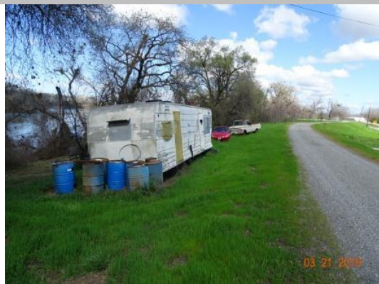
Photo 2. View of an abandoned RV, cars and drums on the waterside slope, facing upstream.