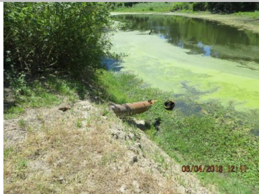
Pipe visible at pond off WS toe.