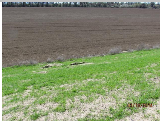
View of the rodent activity along the waterside slope.