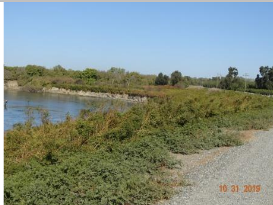
View of the wild growth along the waterside slope. Fall 2019.

* Location LS : Land Side N/A : Not Applicable WS : Water Side CR : Crown