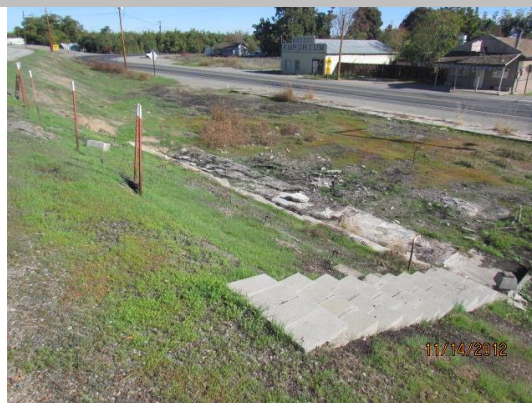
View of concrete stairs &amp; foundation along the slope of the levee.

LS : Land Side N/A : Not Applicable WS : Water Side CR : Crown