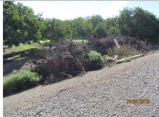
View of the pruning along the landside toe.