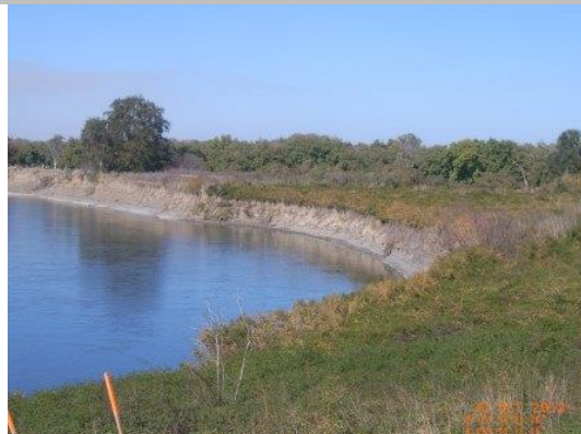
USACE 2013 Photo #3