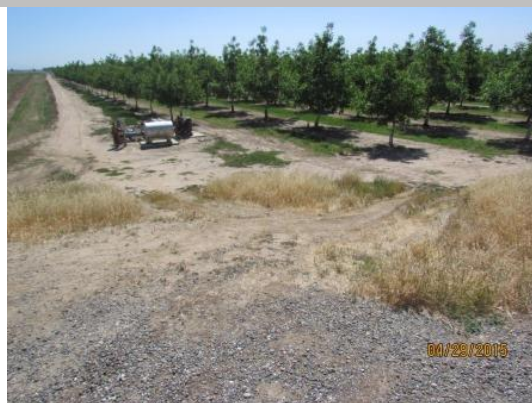
View of the vehicle erosion along the landside slope.