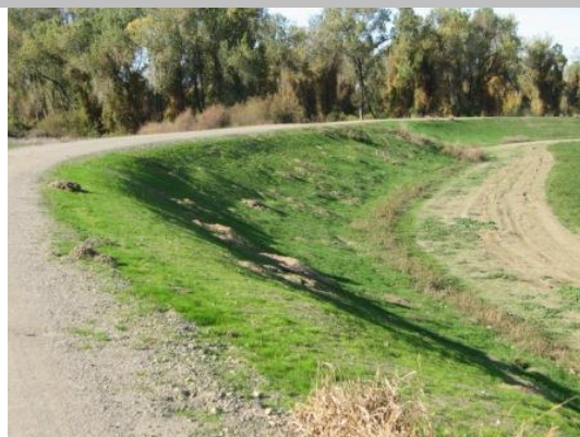
View of squirrel holes along the landside slope.