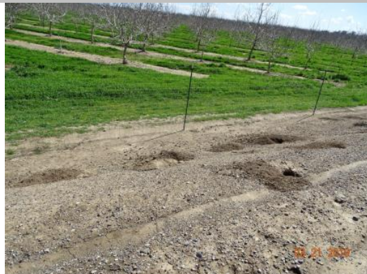
View of multiple large rodent holes on the landside slope, facing downstream. (Spring 2019)