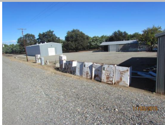
View of the metal boxes along the landside toe.

* Location LS : Land Side N/A : Not Applicable WS : Water Side CR : Crown