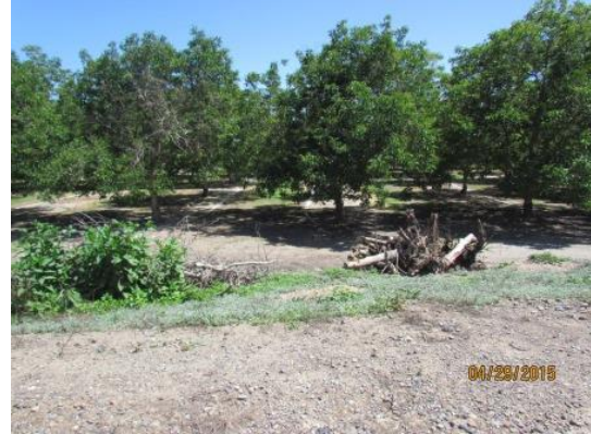
View of the prunings along the landside slope.