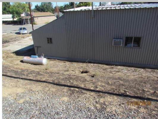
View of the burned out stump hole along the landside toe.