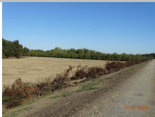
View of tree limbs and prunings along the waterside slope. Fall 2019.