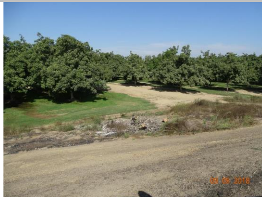
View of the prunings along the waterside toe.