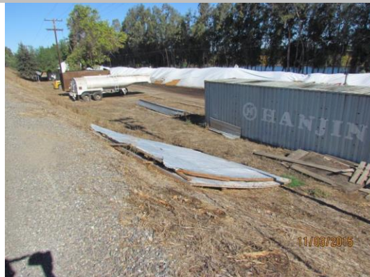
View of the metal roof laying on the landside slope.