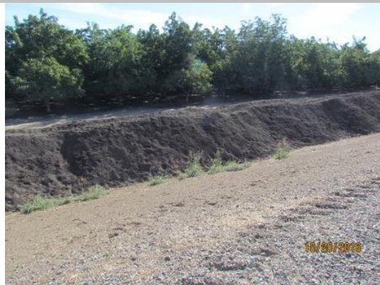
View of a large pile of mulch along the landside toe.