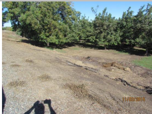
View of the rodent holes along the landside slope.