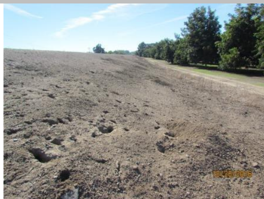
View of the rodent holes along the waterside slope.

* Location LS : Land Side N/A : Not Applicable WS : Water Side CR : Crown