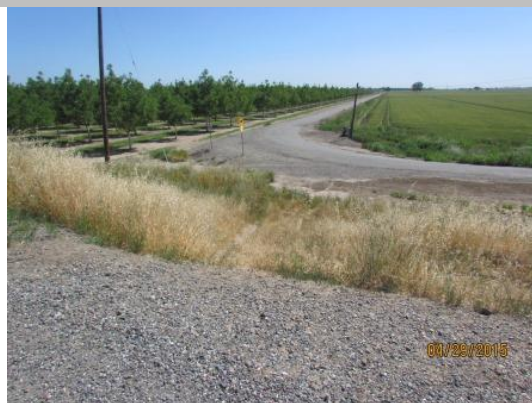
View of the vehicle erosion along the landside slope.