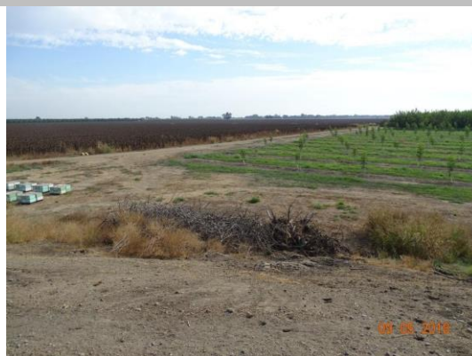
View of the prunings along the landside toe.