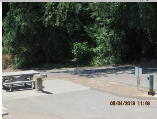
Possible reason for water service (water fountain).