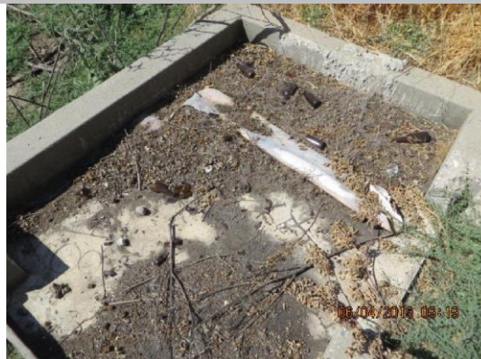
5'X7' concrete distribution box filled in with grout.