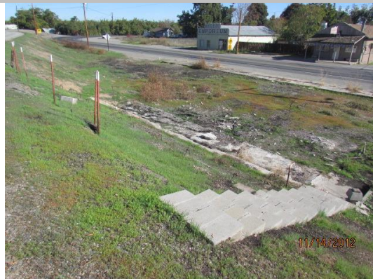
View of concrete stairs &amp; foundation along the slope of the levee.