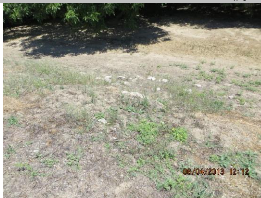
Remnants of concrete distribution box on LS toe.