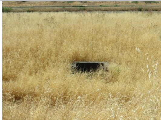
Concrete distribution box on LS toe.