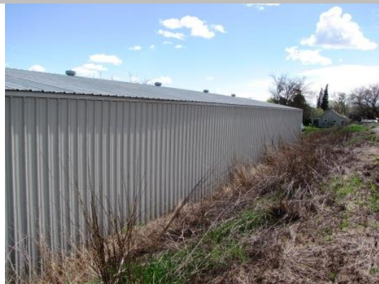
View of the building along the landside toe.

LS : Land Side N/A : Not Applicable WS : Water Side CR : Crown