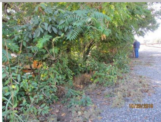
View of the trees that are hanging over the landside slope of the levee.