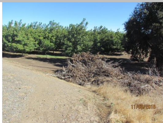
View of the prunings along the landside toe.