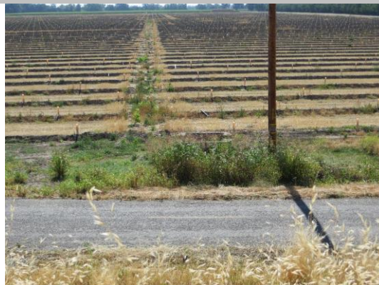
Concrete distribution box off LS toe.