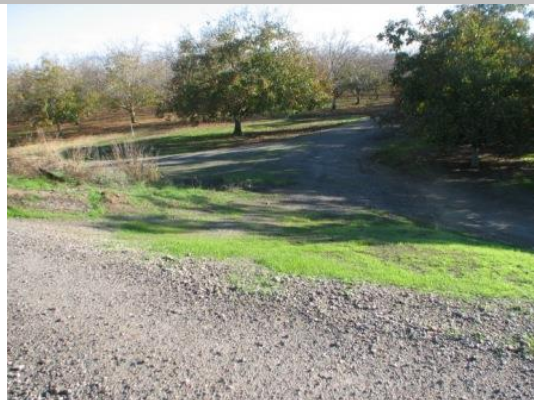
View of the vehicle erosion along the landside slope.