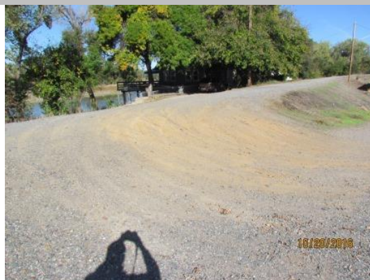
View of slope instability caused by vehicle traffic.

Photo 1 of 1 : FA_2018_LD0003_27_34_20180905_00018.jpg