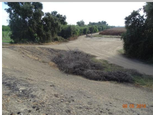
View of the prunings along the landside toe.