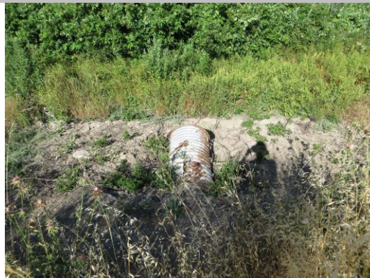
24-inch CMP stormdrain on WS toe.