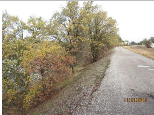
Trim trees 5 feet above ground for better visibility.