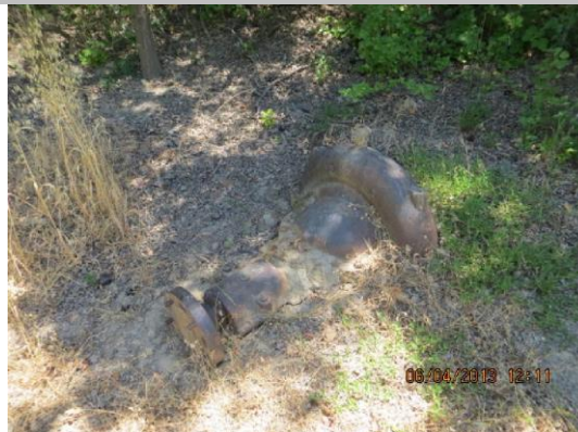
Pump visible off WS toe, next to pond.