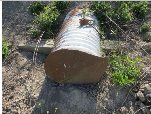
Steel plate welded over end of pipe on WS toe.