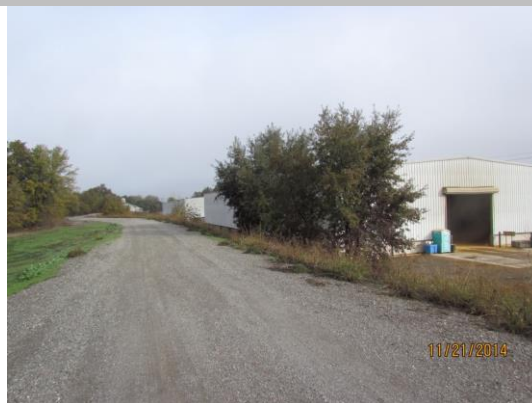
Trim the trees 5 feet for better visibility.