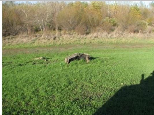
View of the stump along the slope.