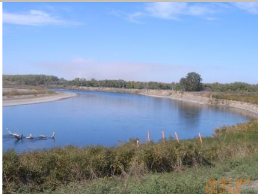
USACE 2013 Photo #2