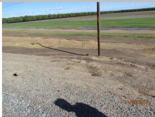
View of the rodent holes along the landside slope.