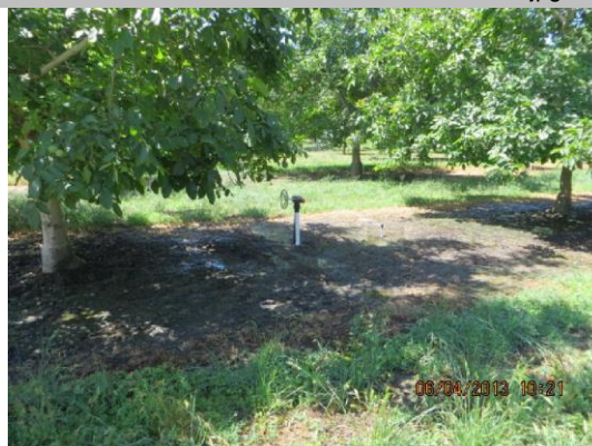
Possible shutoff valve on WS toe.