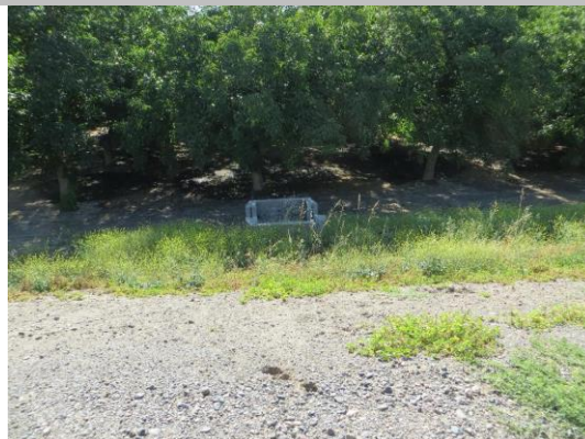
Concrete distribution box at LS toe.