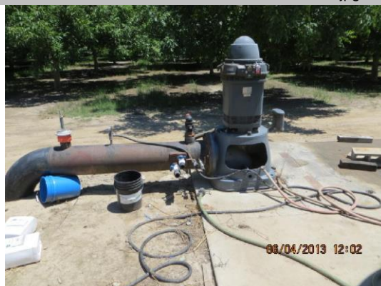
Pump located on LS toe next to concrete distribution box.