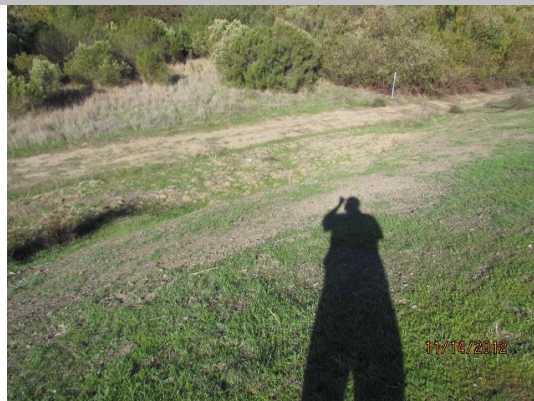
View of the vertical cut along the waterside toe.

LS : Land Side N/A : Not Applicable WS : Water Side CR : Crown