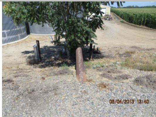
10-inch pipe on LS.