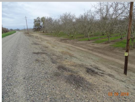
View of the rodent holes along the landside slope.