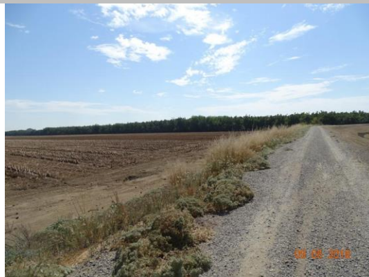
View of the vegetation along the landside slope.

LS : Land Side N/A : Not Applicable WS : Water Side CR : Crown