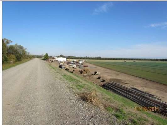
View of the equipment along the landside toe.