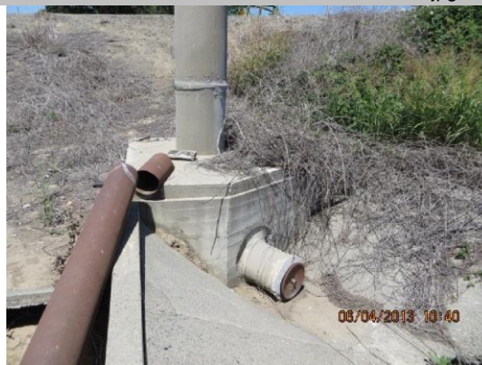
Concrete standpipe and channel on LS toe.