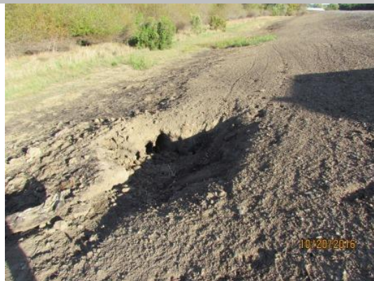
View of a hole along the waterside slope that need to be backfilled and compacted.

LS : Land Side N/A : Not Applicable WS : Water Side CR : Crown