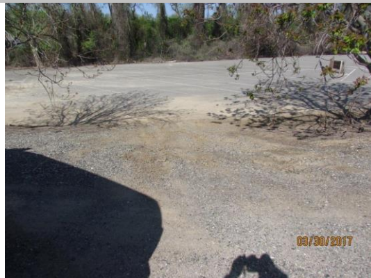
View of the vehicle ruts on the waterside slope.