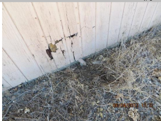
Pipe at side of building on WS shoulder.