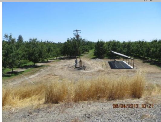
Pumping plant off LS toe.