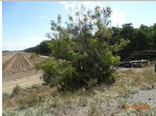
Remove or trim the tree on the landside slope.