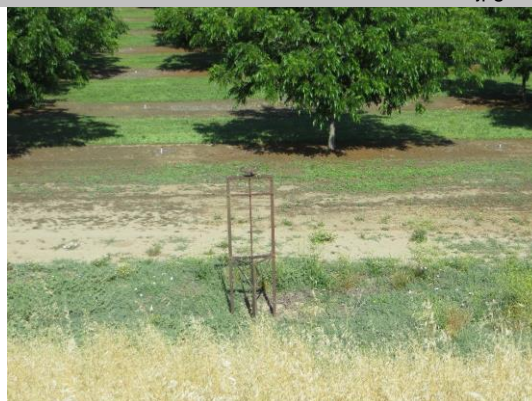
Slide gate buried at WS toe.