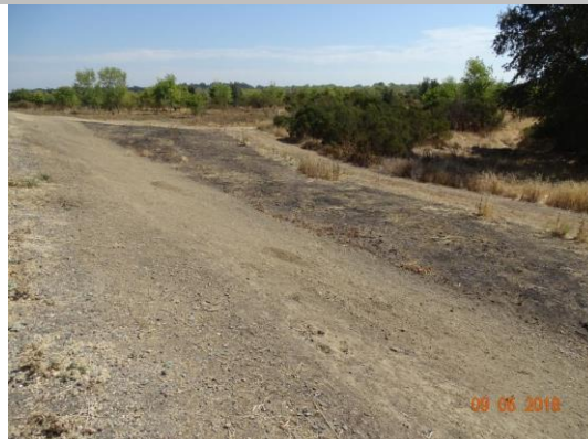
View of the rodent holes along the landside slope.