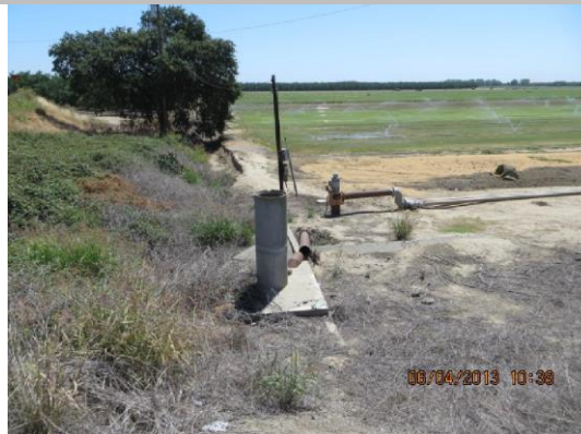
Concrete standpipe on LS toe.