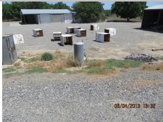
Water tank, pump, and well head on LS toe.