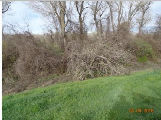
View of the tree down on the slope and toe.