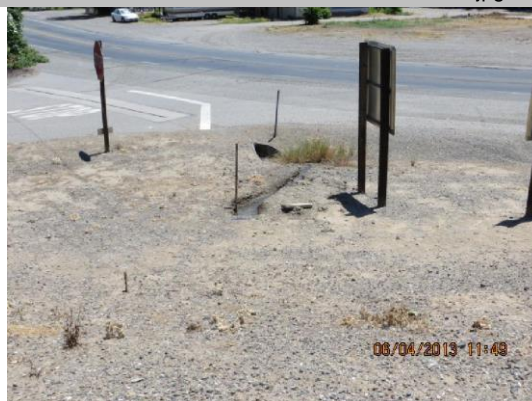
Pipe leaking at LS toe.