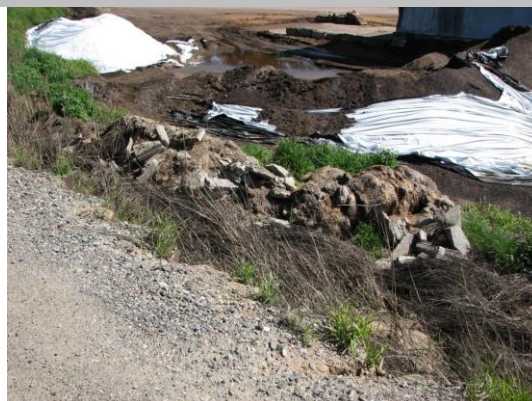
View of concrete and soil obstructing visibility and access.