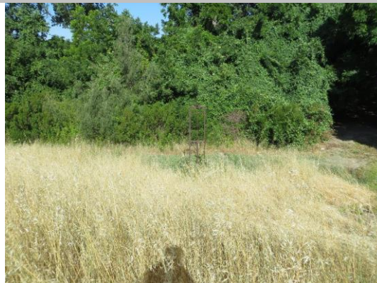
Slide gate at WS toe.