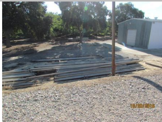
View of the ag pipes along the landside toe.