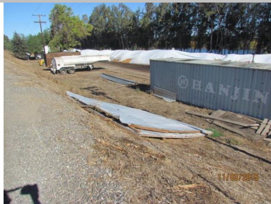
View of the metal roof laying on the landside slope.

LS : Land Side N/A : Not Applicable WS : Water Side CR : Crown