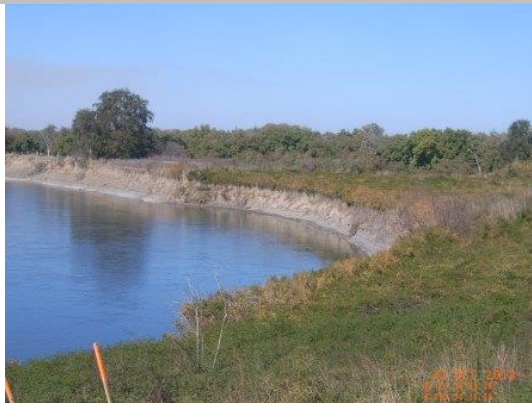
USACE 2013 Photo #3