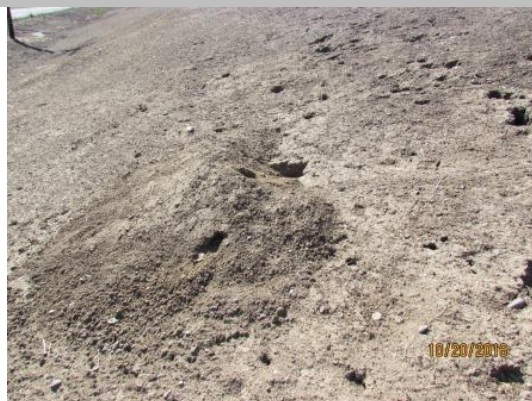
View of the rodent holes along the landside slope.