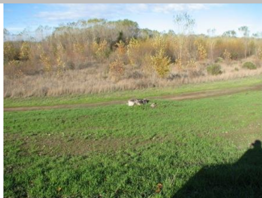
View of the stump along the toe.