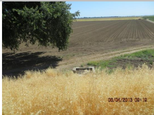
Distribution box on LS toe.