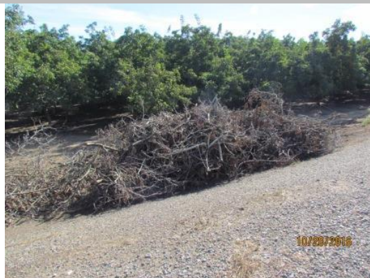
View of the prunings along the landside toe.

LS : Land Side N/A : Not Applicable WS : Water Side CR : Crown