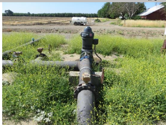
Pump and butterfly valve off LS toe.