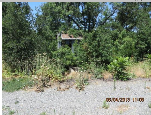
Pumphouse and 7'X12' concrete box on WS slope.