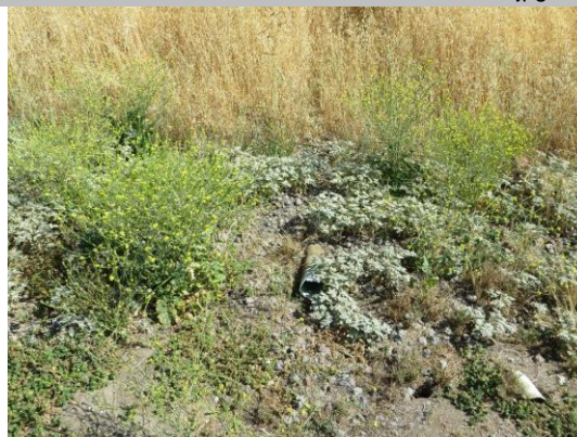
3-inch drain on WS toe (purpose unclear).