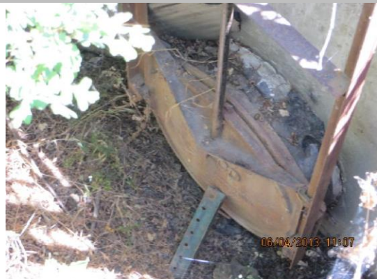
Slidegate inside concrete box on WS slope.