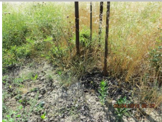
Slide gate at WS toe.