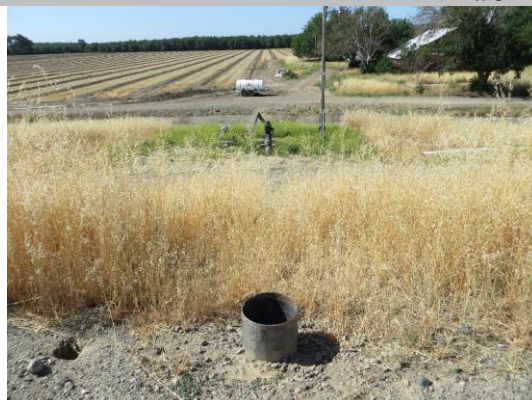
Siphon breaker in steel riser on LS shoulder with pump in background.