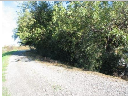
View of the trees along the landside slope.