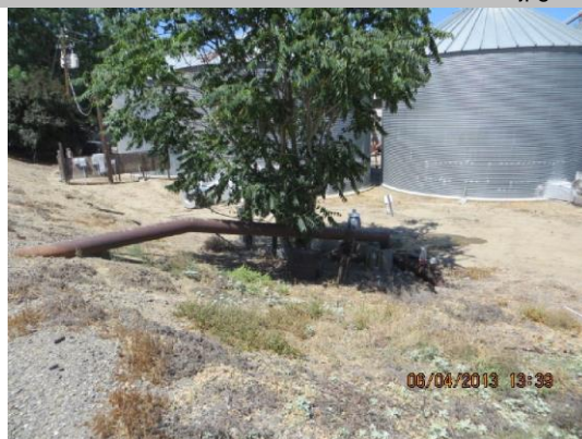
10-inch pipe and pump on LS.