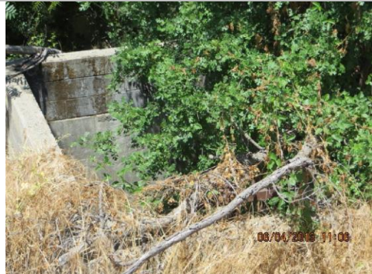
7'X12' Concrete box with flap gate and slide gate on WS slope.