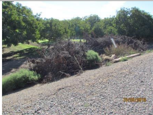
View of the pruning along the landside toe.