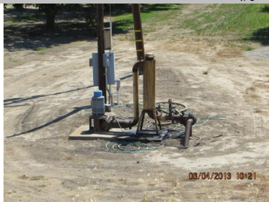
Pumping plant off LS toe.