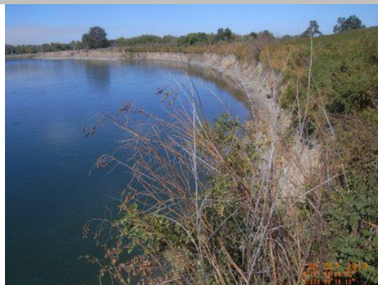
USACE 2013 Photo #1