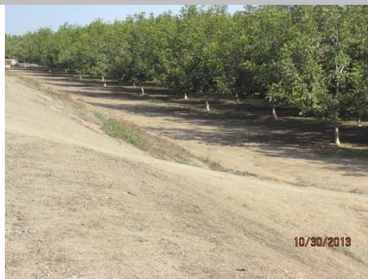
View of the rodent activity along the landside slope.

LS : Land Side N/A : Not Applicable WS : Water Side CR : Crown