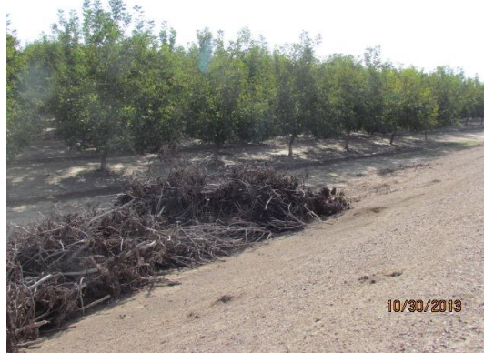
View of the prunings along the landside toe.