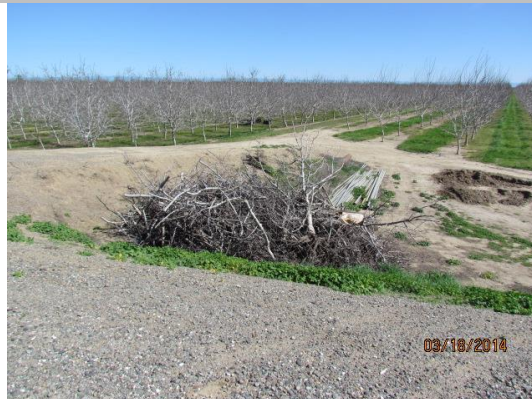
View of the prunings along the landside toe.