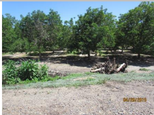
View of the prunings along the landside slope.

LS : Land Side N/A : Not Applicable WS : Water Side CR : Crown