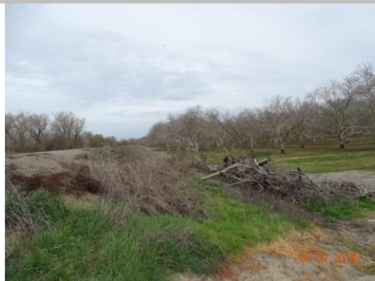
View of the prunings on the landside slope.