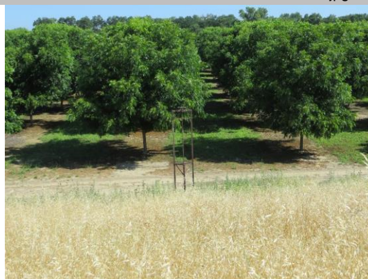
Slide gate at WS toe.