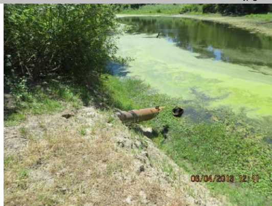
Pipe visible at pond off WS toe.