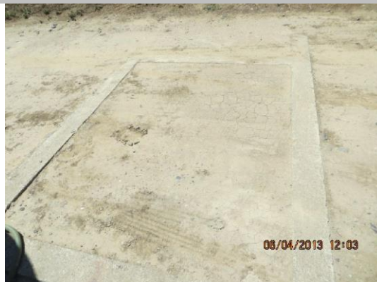
Soil filled concrete distribution box on LS toe.