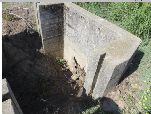
Debris and steel plate blocking inlet on LS toe.