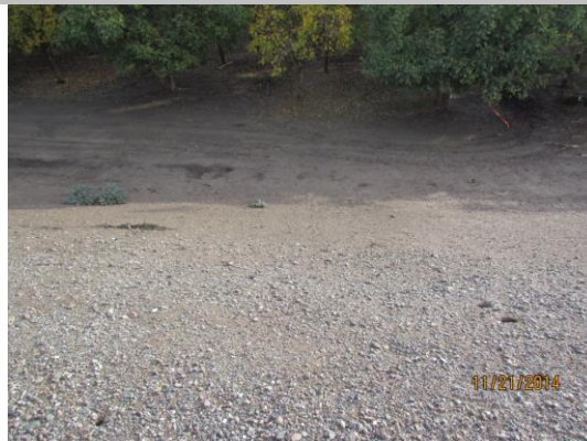
View of the rodent holes along the waterside slope.