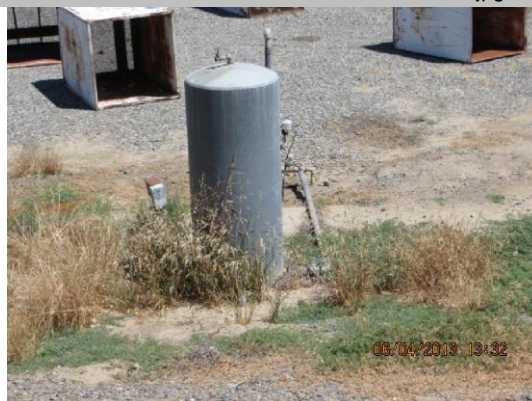
Water tank, pump, and well head on LS toe.