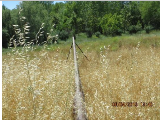
Pipe on WS shoulder.