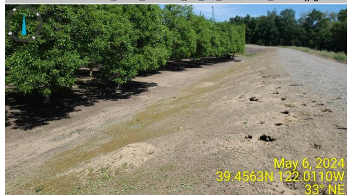
View of the rodent holes along the landside slope. Spring 2024.