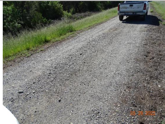
Top of Levee: View of levee crown looking downstream