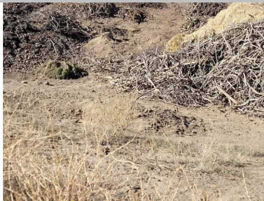
View of rodent activity along the landside slope. Fall 2022.