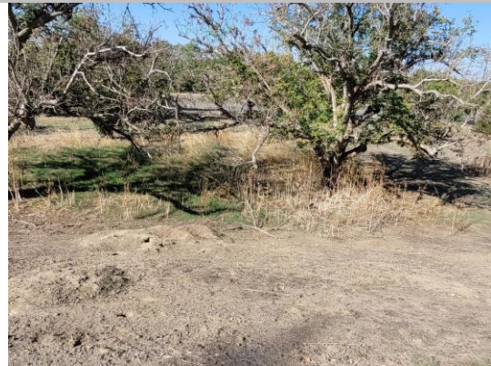
View of the rodent activity along the landside slope. Fall 2022.

Photo 1 of 1 : FA_2024_LD0002_28_15_20240924_00005.jpg