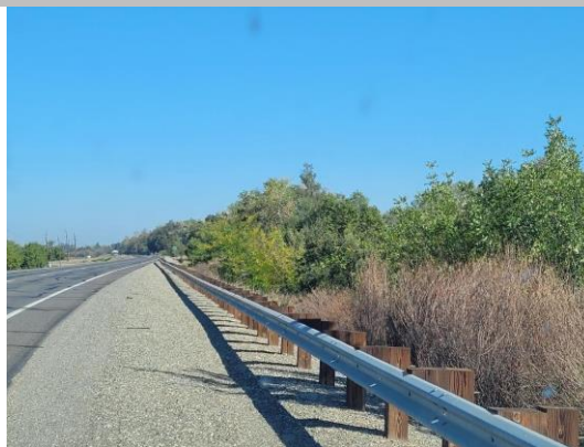
View of the wild growth along the waterside slope. Fall 2022.