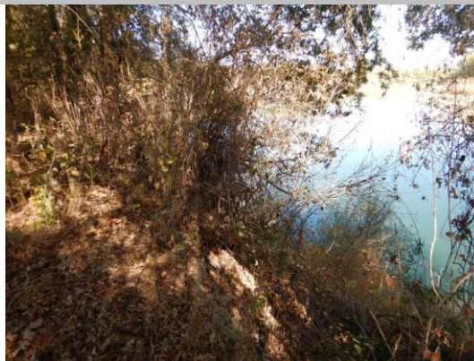
USACE 2018 Erosion Photo #1