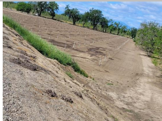
View of rodent activity on the landside slope. Spring 2022.