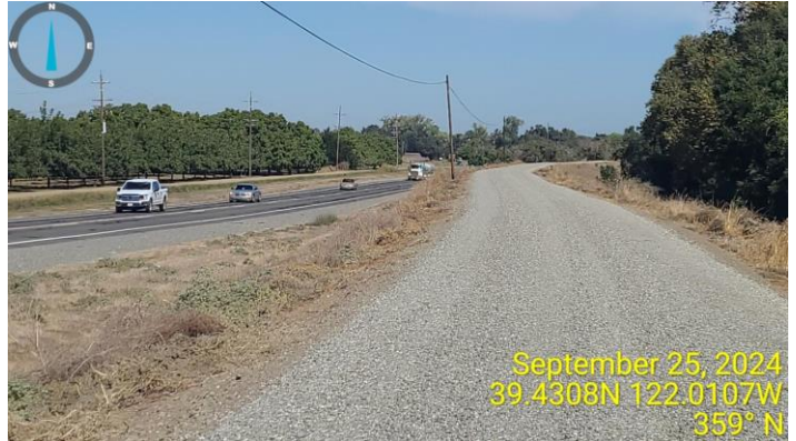
View of the vegetation along the landside slope. Fall 2024.