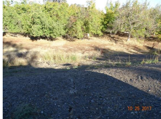
View of the rodent holes along the landside slope.