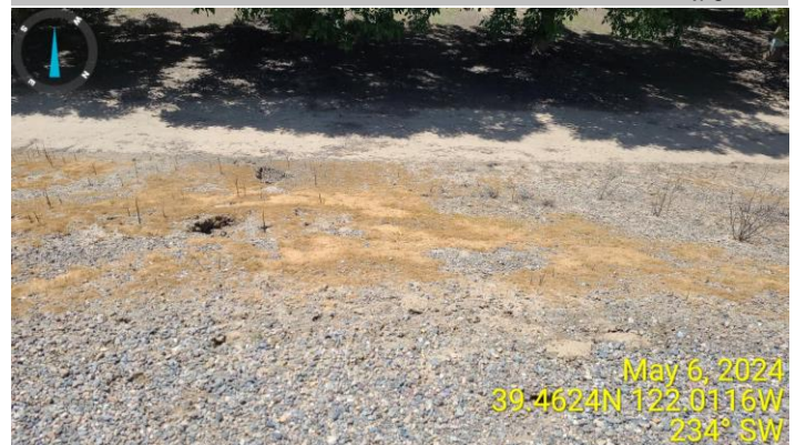
View of the rodent holes on the landside slope. Spring 2024.