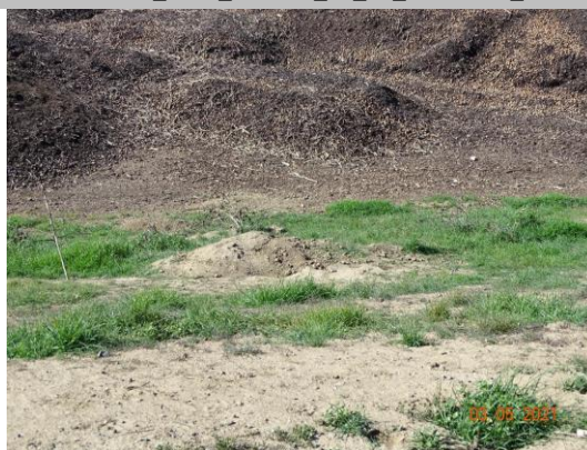
View of the rodent holes along the landside slope. Spring 2021.