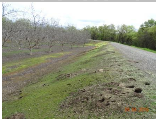
View of the rodent holes along the landside slope. Spring 2019.