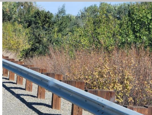
View of the vegetation along the waterside slope. Fall 2021.