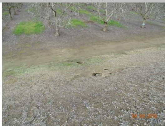
View of the rodent holes on the landside slope. Spring 2019.