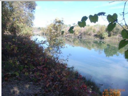
USACE 2013 Photo #1