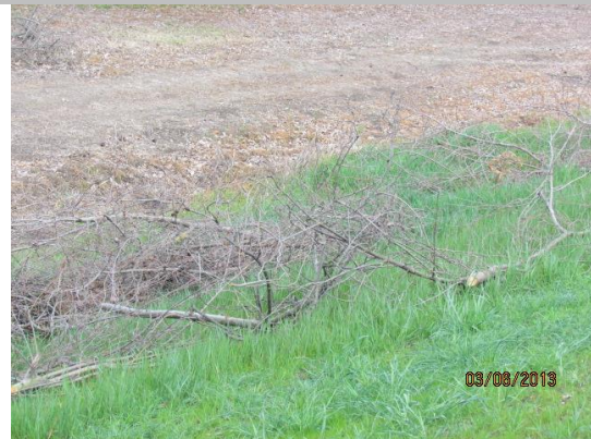
View of the prunings along the landside toe.