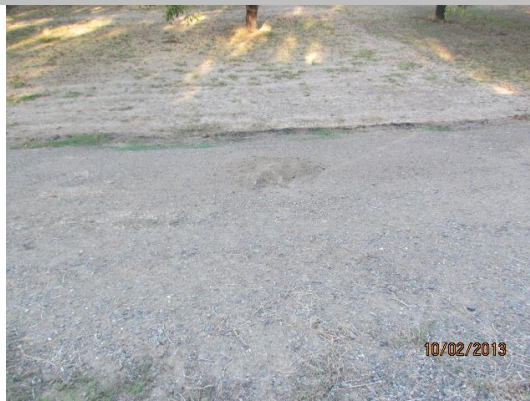
View of the rodent holes along the slope of the levee.