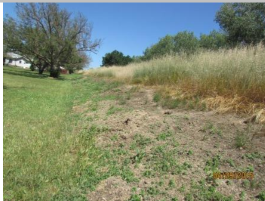
View of the rodent holes along the landside slope.