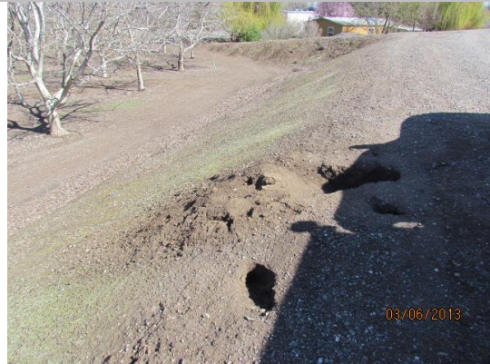
View of the rodent activity along the landside slope.