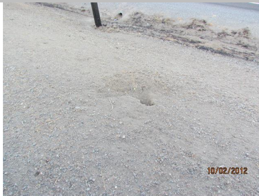
View of the rodent holes along the landside slope.