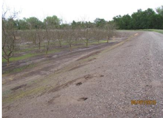
View of the rodent holes along the landside slope.