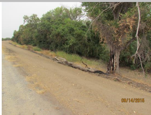
View of the tree limbs along the waterside slope.