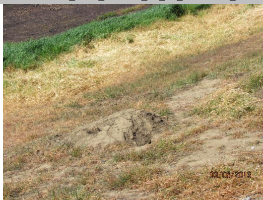
View of the rodent activity along the landside slope.

* Location LS : Land Side N/A : Not Applicable WS : Water Side CR : Crown