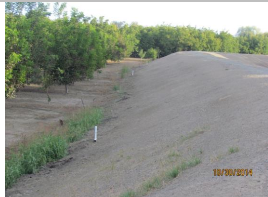
View of the rodent holes and bait station along the landside slope.