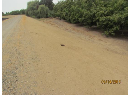
View of the rodent holes along the waterside slope.