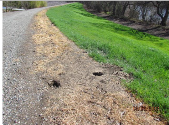
View of the rodent activity along the waterside slope.