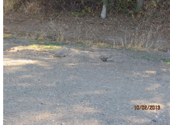
View of the rodent holes along the slope of the levee.