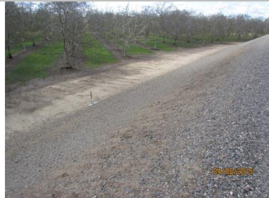
View of the removed rodent holes and bait station.