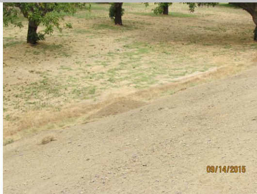
View of the rodent holes along the landside slope.