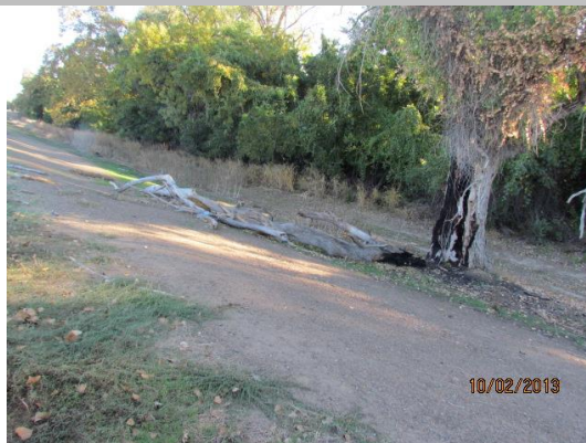
View of the downed tree limb along the slope of the levee.