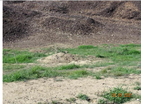
View of the rodent holes along the landside slope. Spring 2021.