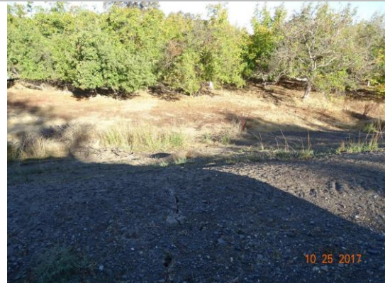
View of the rodent holes along the landside slope.