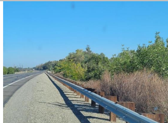
View of the wild growth along the waterside slope. Fall 2022.