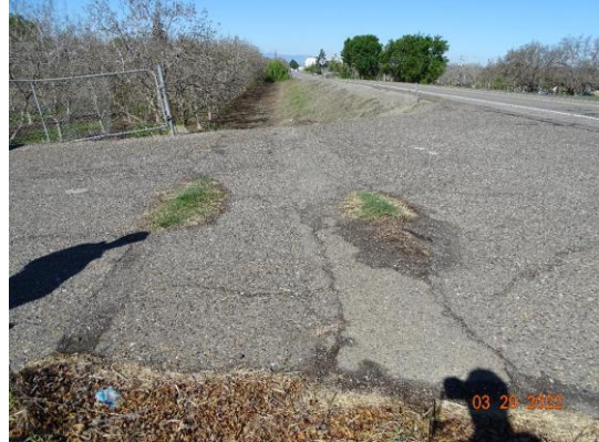
Top of Levee: View of levee crown looking from waterside. Cut in levee crown visible