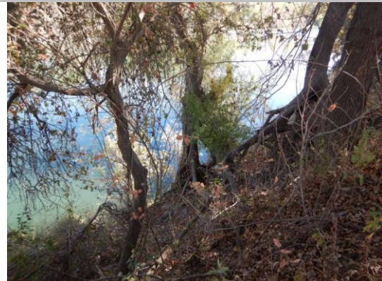
USACE 2018 Erosion Photo #2