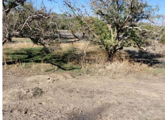
View of the rodent activity along the landside slope. Fall 2022.