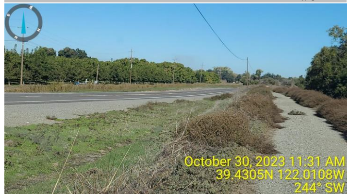
View of the vegetation along the landside slope. Fall 2023.