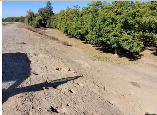
View of the rodent holes along the landside slope. Fall 2022.