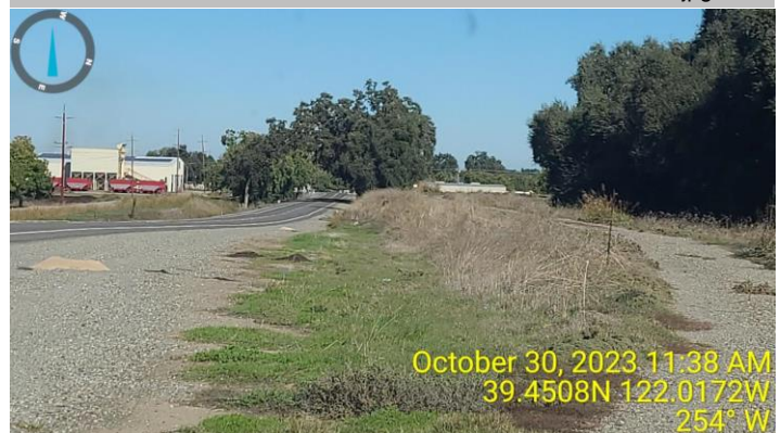
View of the vegetation along the landside slope. Fall 2023.