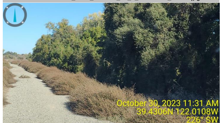
View of the vegetation along the waterside slope. Fall 2023.