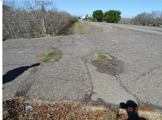
Top of Levee: View of levee crown looking from waterside. Cut in pavement still visible