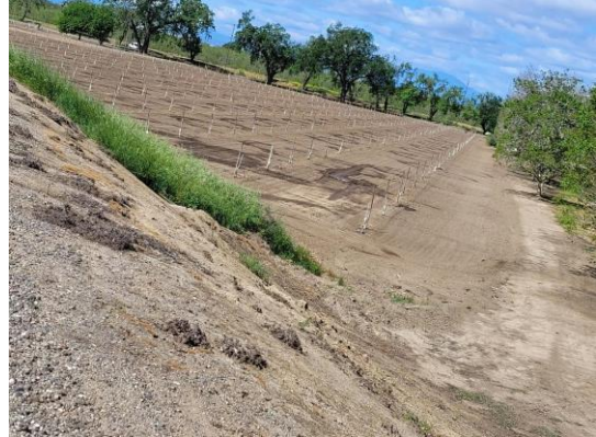
View of rodent activity on the landside slope. Spring 2022.