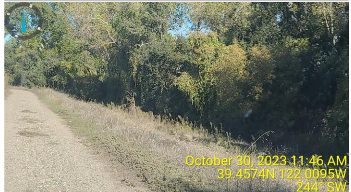
View of the vegetation along the waterside slope. Fall 2023.