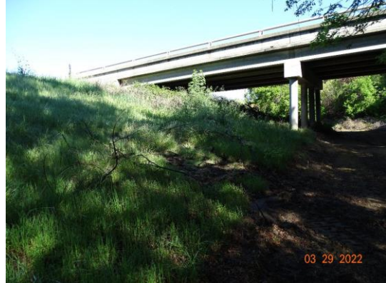
Water-Side: View of levee slope looking from toe. Conduit not found