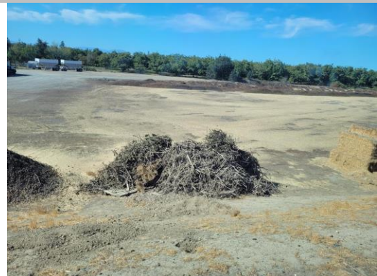
View of the pile of prunings at the landside toe. Fall 2021.