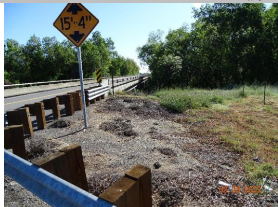
Water-Side: View of levee slope looking from crown. Conduit not found