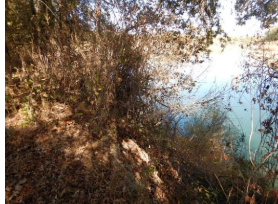
USACE 2018 Erosion Photo #1