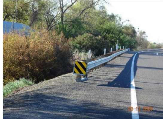
View of the oleanders along the waterside slope. Spring 2020.