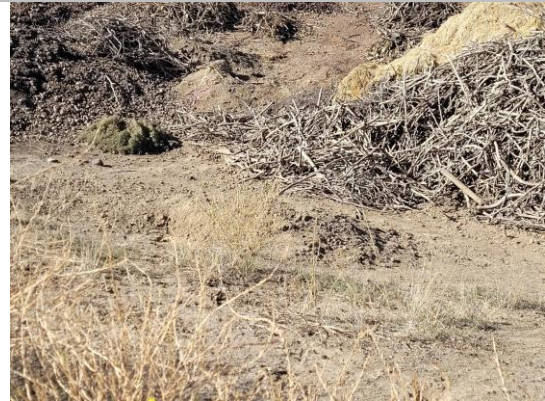
View of rodent activity along the landside slope. Fall 2022.