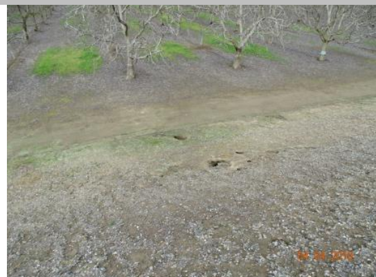
View of the rodent holes on the landside slope. Spring 2019.