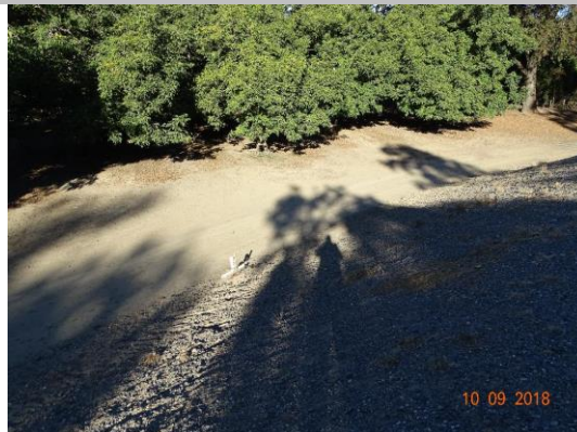
View of landside at crossing.