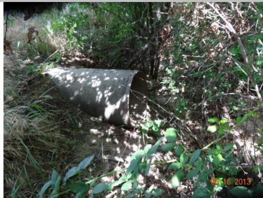
Pipe visible on waterward side.