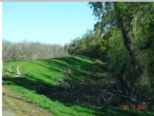
View of the tree and branches on the waterside slope. Spring 2020.

* Location LS : Land Side N/A : Not Applicable WS : Water Side CR : Crown