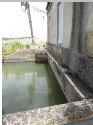
View of landward side-outlet.