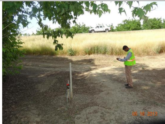
3-inch PVC pipe and vent exposed on waterward toe, likely in alignment with this crossing.