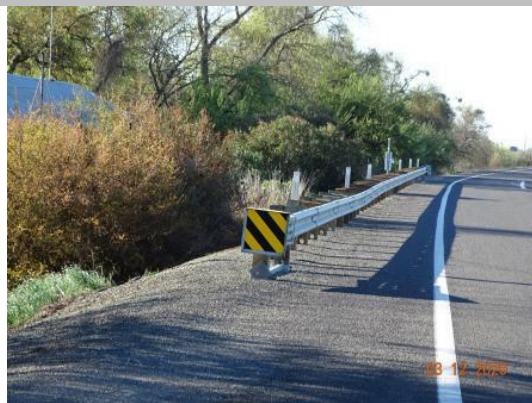
View of the oleanders along the waterside slope. Spring 2020.