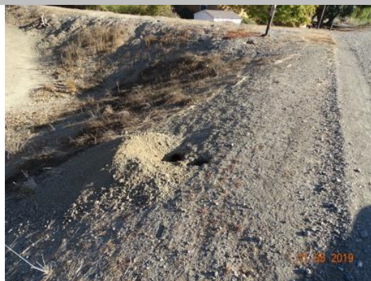
View of rodent activity on the landside slope. Fall 2019.

* Location LS : Land Side N/A : Not Applicable WS : Water Side CR : Crown