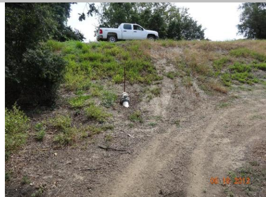
Pipe connection capped with control valve located on landward toe.