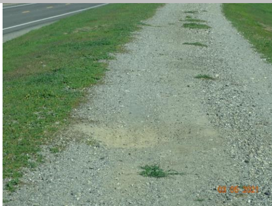
View of a depression on the levee crown looking upstream. Spring 2021.