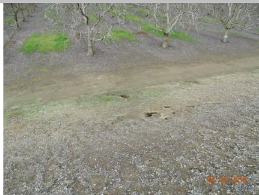
View of the rodent holes on the landside slope. Spring 2019.