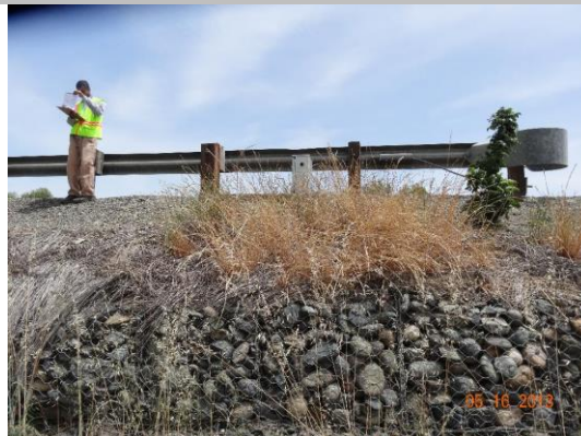
View of landward slope.