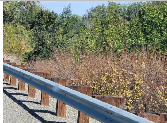
View of the vegetation along the waterside slope. Fall 2021.