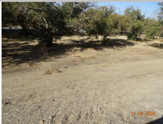
View of the rodent activity along the landside slope. Fall 2020.