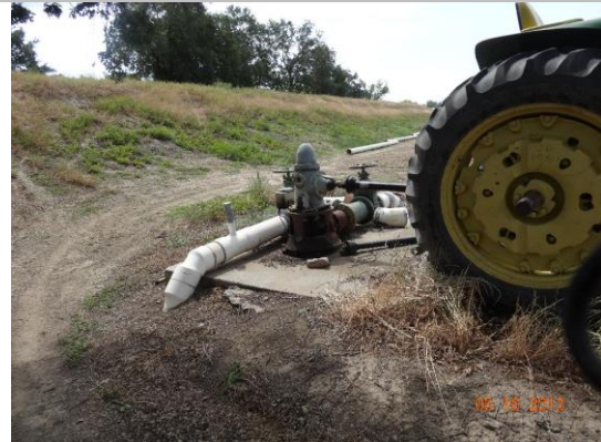
Pump system located near landward toe.