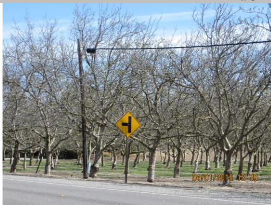
Conduit may be visible on pole about 1000-feet west of levee crown.