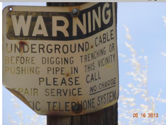
Sign lists Pacific Telephone system.