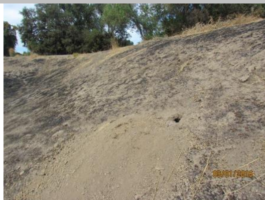
View of the rodent holes along the landside slope.