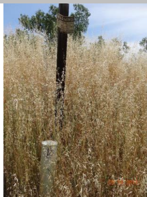
Indicators of existing line visible on slope.