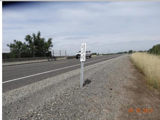
View of levee crown with marker on waterward side.