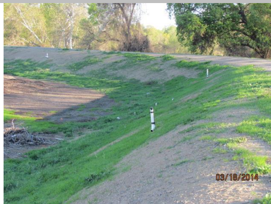
View of the rodent activity along the landside slope.