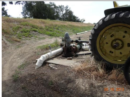
Pump system located near landward toe.