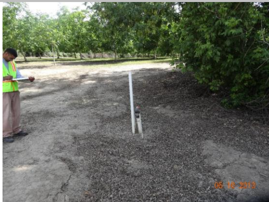
3-inch PVC pipe and vent exposed on waterward toe, likely in alignment with this crossing.