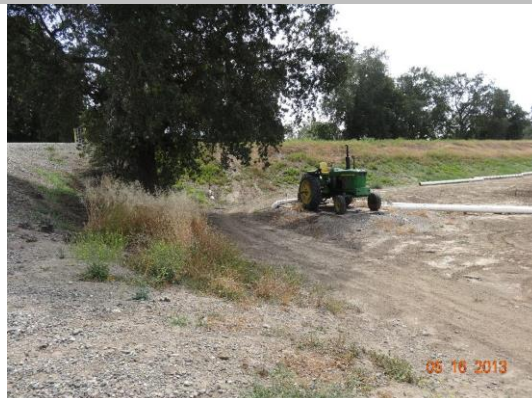
View of pump system on landward side located behind tracker.