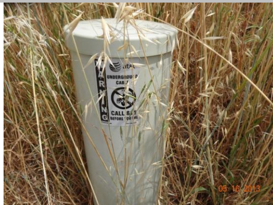
AT&T underground cable line.