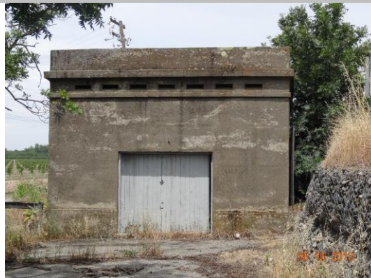
View of Princeton-Cordora-Glenn Irrigation District--Schaad Pumping Plant.