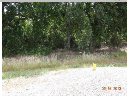
View of waterward side.