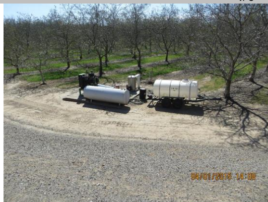
Well and pump visible on LS toe.