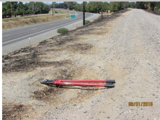
View of a depression on the levee crown looking upstream.

* Location LS : Land Side N/A : Not Applicable WS : Water Side CR : Crown