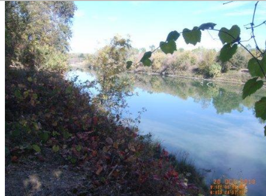
USACE 2013 Photo #1