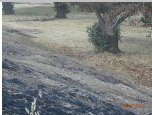
View of the rodent holes along the landside slope.