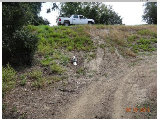
Pipe connection capped with control valve located on landward toe.