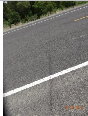
View of levee crown at crossing.