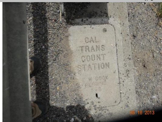
Service box located on landward shoulder.