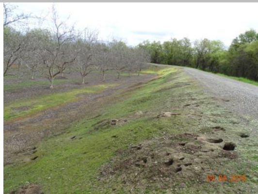
View of the rodent holes along the landside slope. Spring 2019.