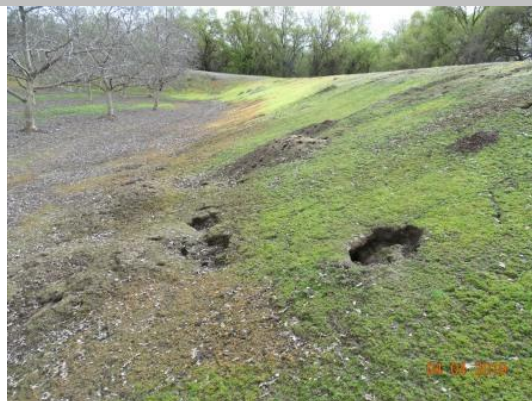
Another view of the rodent holes along the landside slope. Spring 2019.