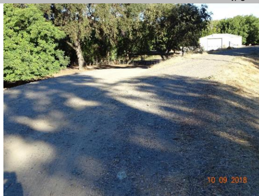
View of levee crown at the crossing.