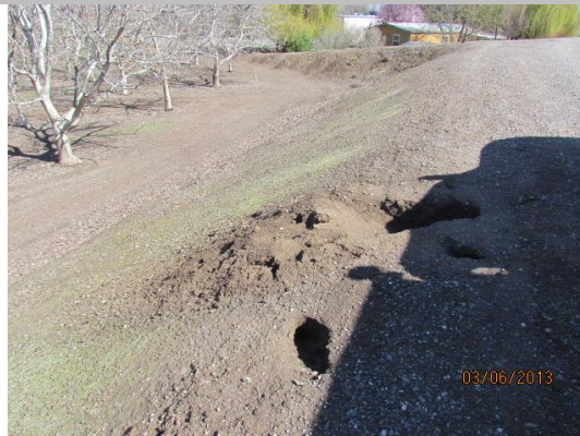
View of the rodent activity along the landside slope.