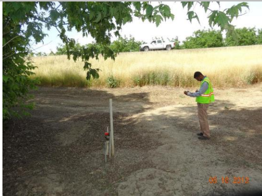
3-inch PVC pipe and vent exposed on waterward toe, likely in alignment with this crossing.