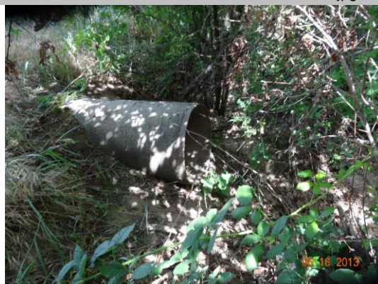
Pipe visible on waterward side.