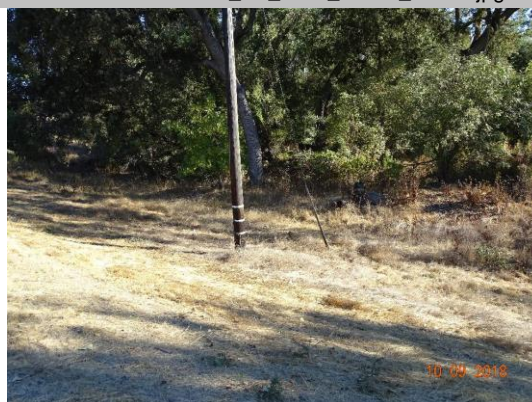
View of waterside at crossing.