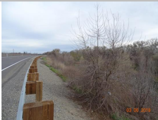
View of the vegetation along the waterside slope.