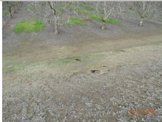
View of the rodent holes on the landside slope. Spring 2019.