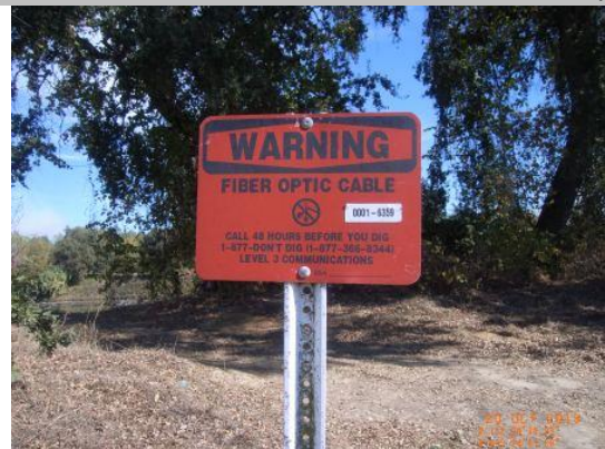
USACE 2013 Photo #2