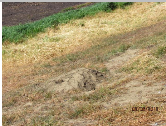
View of the rodent activity along the landside slope.