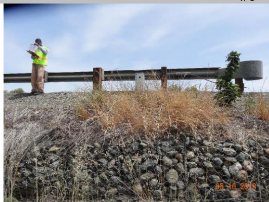
View of landward slope.