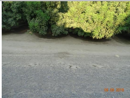
View of the rodent holes along the landside slope.