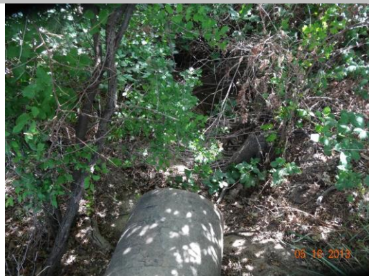
View of channel on waterward side.