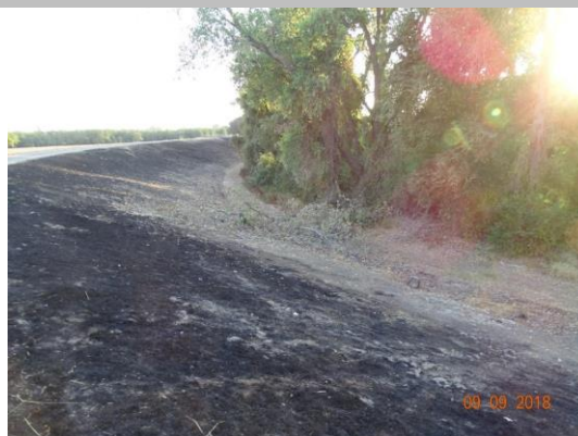
View of the tree limbs along the land waterside slope.