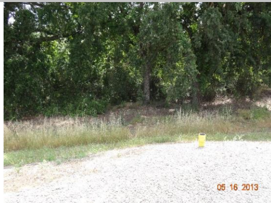
View of waterward side.