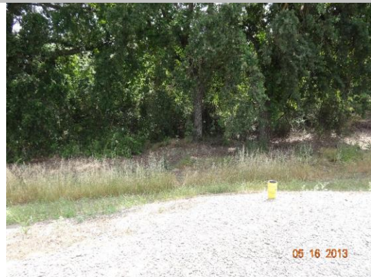
View of waterward side.