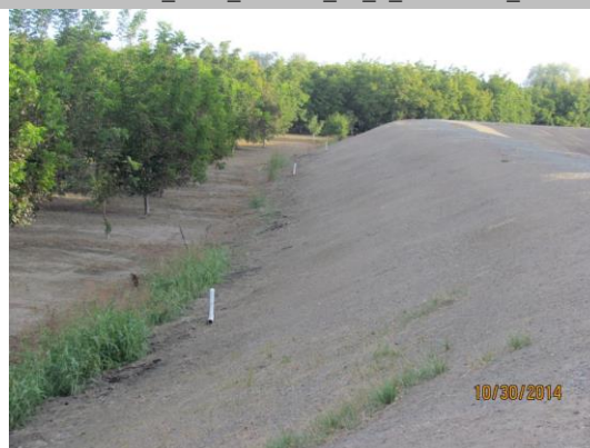
View of the rodent holes and bait station along the landside slope.