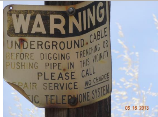
Sign lists Pacific Telephone system.