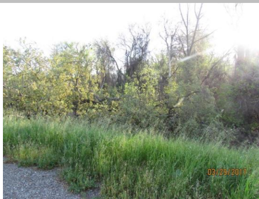
View of the tree on the water side slope and toe.