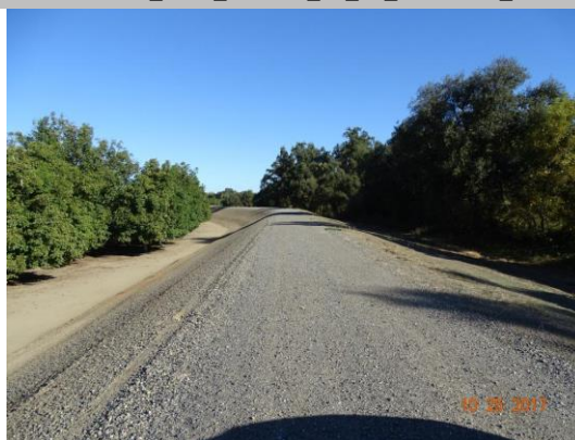
View of no vegetation on both slopes.