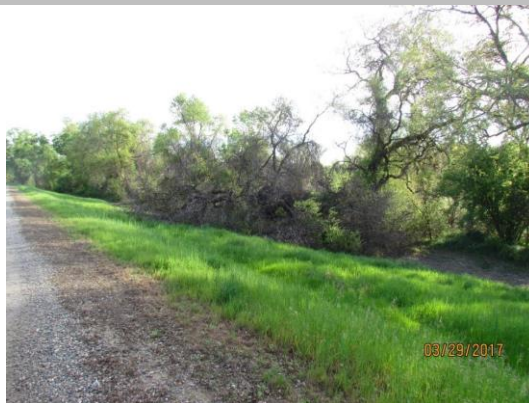
View of the tree along the waterside slope and toe.