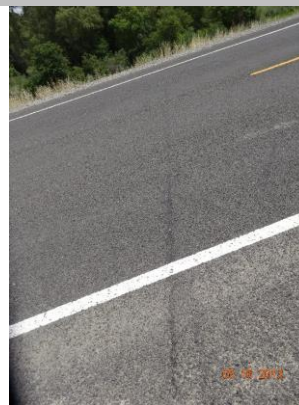
View of levee crown at crossing.