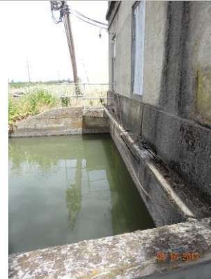
View of landward side--outlet.