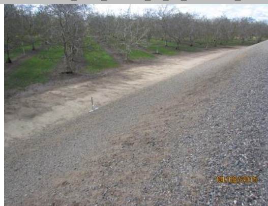
View of the removed rodent holes and bait station.