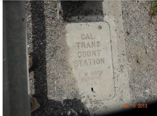
Service box located on landward shoulder.