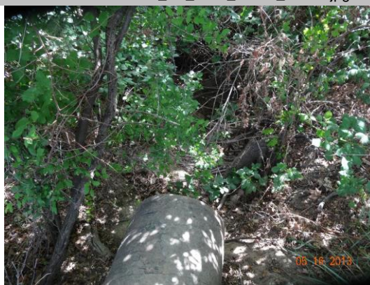
View of channel on waterward side.