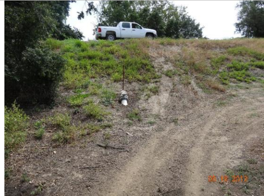
Pipe connection capped with control valve located on landward toe.