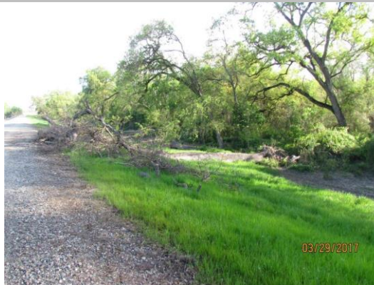
View of the tree on the water sideslope and toe.