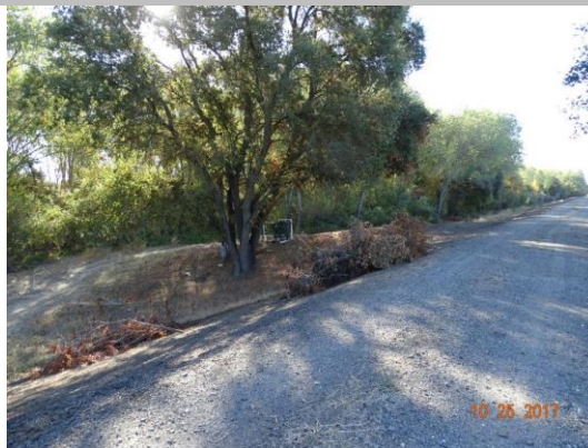
View of the prunings along the waterside slope.