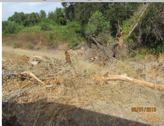
View of a fallen tree along the waterside slope.