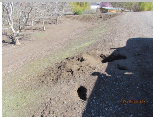
View of the rodent activity along the landside slope.