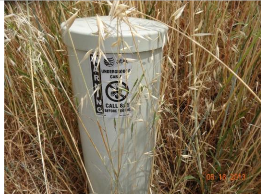
AT&T underground cable line.