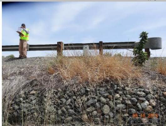
View of landward slope.