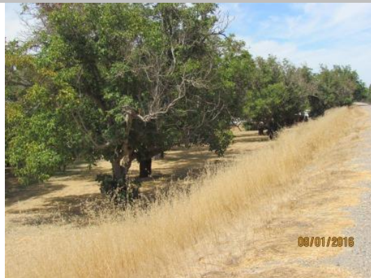
View of the landside vegetation looking upstream.