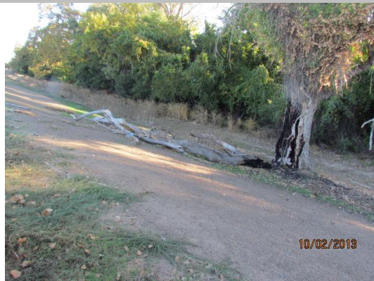
View of the downed tree limb along the slope of the levee.