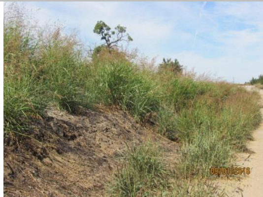
View of the waterside vegetation looking upstream.

LS : Land Side N/A : Not Applicable WS : Water Side CR : Crown