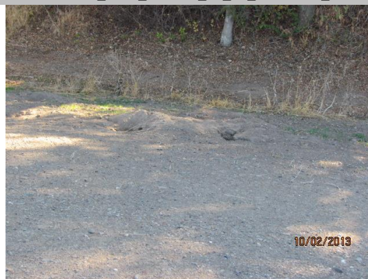
View of the rodent holes along the slope of the levee.