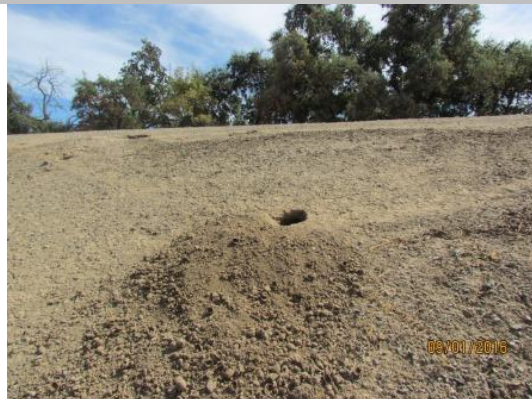
View of the rodent holes along the landside slope.