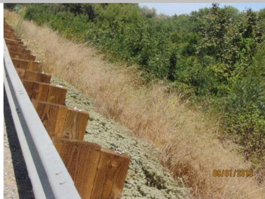
View of the waterside vegetation looking upstream.