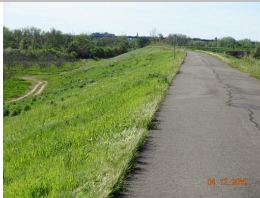
View looking downstream waterside at the well maintained annual vegetation, Spring 2019.