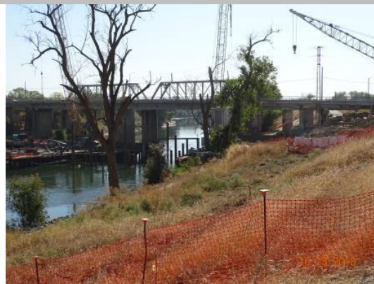
View looking downstream waterside of the 5th Street bridge construction, Fall 2018.