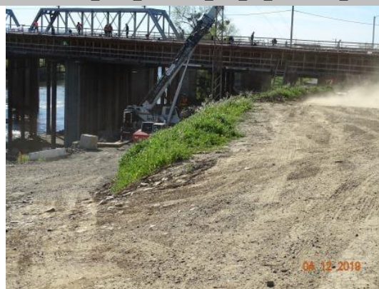
View looking downstream waterside of the 5th Street bridge construction, Spring 2019.