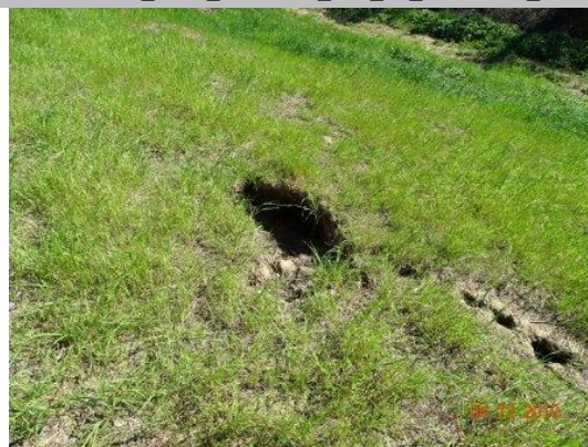
View looking at waterside levee slope of a large rodent/animal hole, Spring 2019.