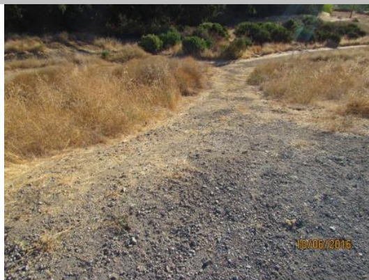
View of waterside slope where vehicles have been driving up and down to go around gate. Fall 2016.