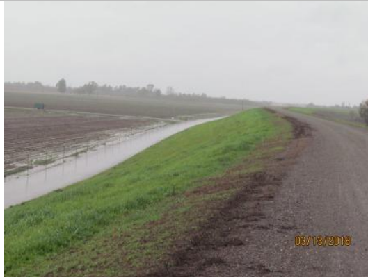
View looking upstream landside of the well maintained annual vegetation at Levee Mile 6.16, Spring 2018.