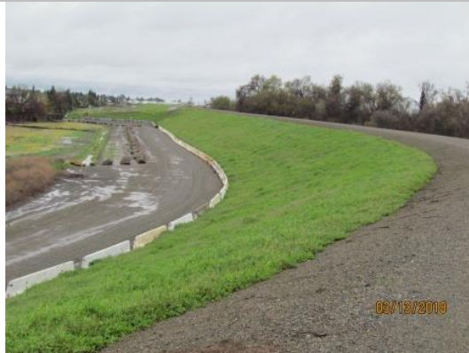
View looking upstream landside of the well maintained annual vegetation at Levee Mile 10.48, Spring 2018.