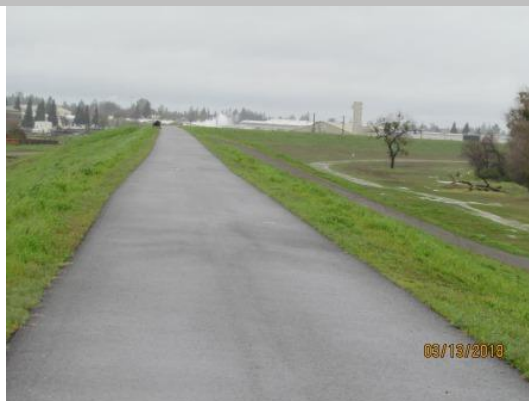
View looking upstream waterside of the well maintained annual vegetation at Levee Mile 10.92, Spring 2018.