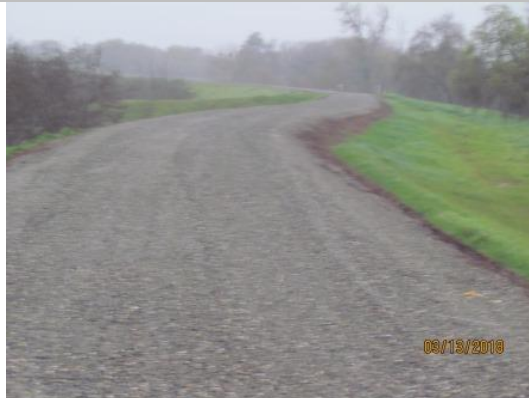
View looking upstream waterside of the well maintained annual vegetation at Levee Mile 6.24, Spring 2018.