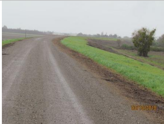
View looking upstream waterside of the well maintained annual vegetation at Levee Mile 0.02, Spring 2018.