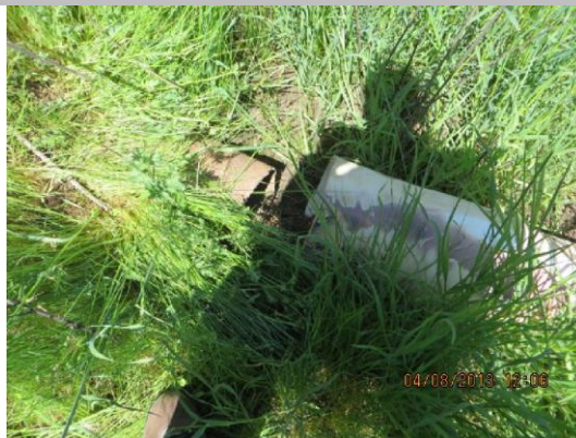
WS- 8-inch steel pipe and disconnected pvc pipe on levee slope