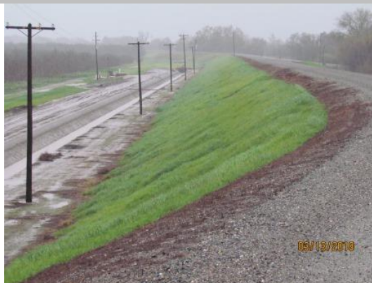
View looking upstream landside of the well maintained annual vegetation at Levee Mile 0.02, Spring 2018.