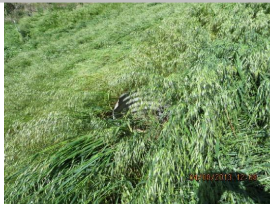
LS- CMP riser on levee slope with dense vegetation.