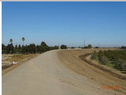
View looking upstream waterside at the well maintained annual vegetation, Fall 2019.