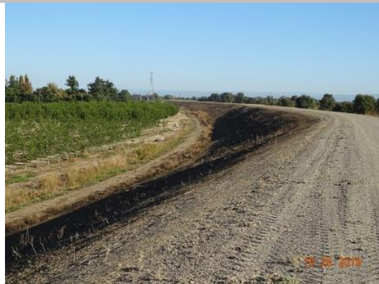
View looking upstream landside at the well maintained annual vegetation, Fall 2019.