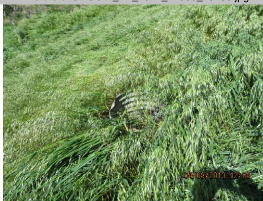
LS- CMP riser on levee slope with dense vegetation.