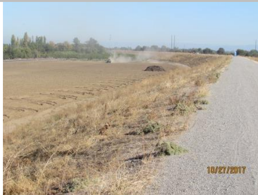
View looking upstream landside of annual vegetation that needs to be maintained, Fall 2017.