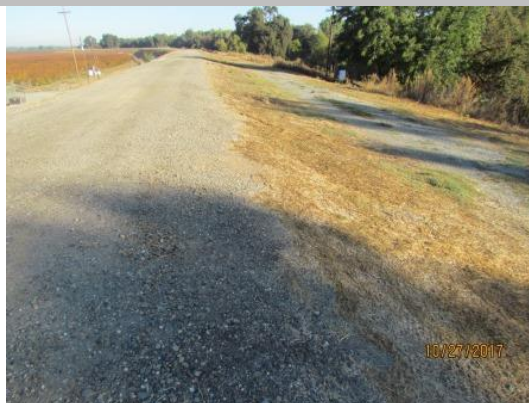
View looking upstream waterside levee mile 6.96 of the well maintained annual vegetation, Fall 2017.