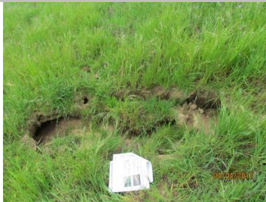
View of mid point on waterside slope of the same large animal burrow that needs to be repaired, Spring 2017.