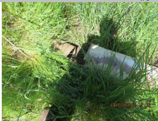
WS- 8-inch steel pipe and disconnected pvc pipe on levee slope