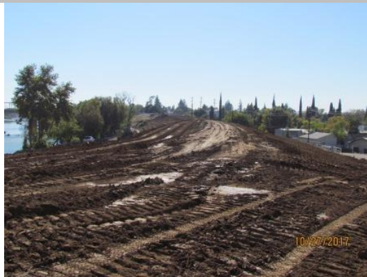
View looking downstream from the 10th Street Bridge of the new construction of the levee, Fall 2017.