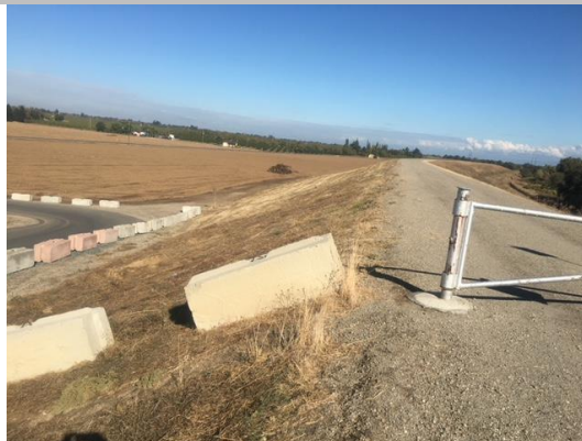
View looking upstream landside. The LD was in the process of mowing this section, they finished after the Fall 2017 inspection.