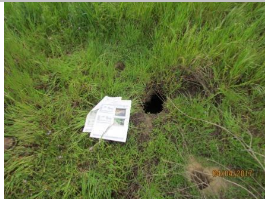
View of highest point on waterside slope of large animal burrow that needs to be repaired, Spring 2017.