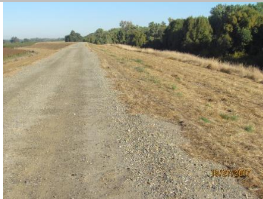
View looking upstream waterside levee mile 0.14 of the well maintained annual vegetation, Fall 2017.