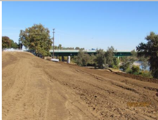
View looking upstream at the 10th Street Bridge of the new construction of the levee, Fall 2017.