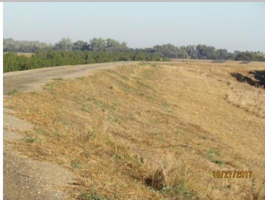
View looking upstream waterside levee mile 3.24 of the well maintained annual vegetation, Fall 2017.