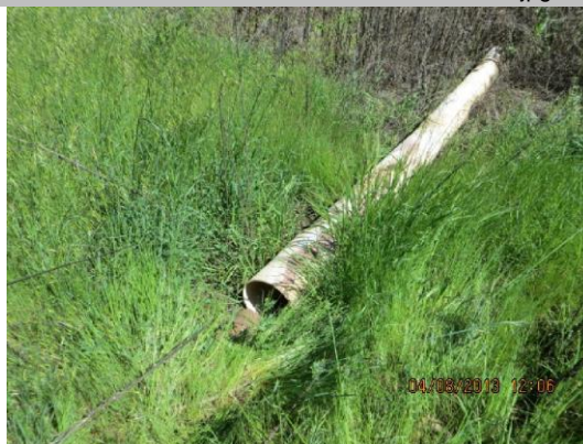
WS-a disconnected pvc pipe on levee slope