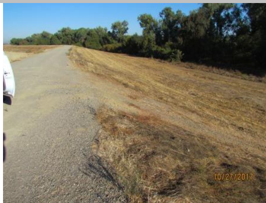
View of waterside slope where vehicles have been driving up and down to go around gate. Fall 2017.