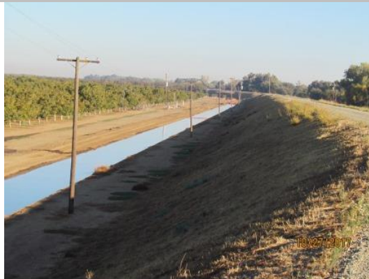
View looking upstream landside levee mile 0.04 of the well maintained annual vegetation, Fall 2017.