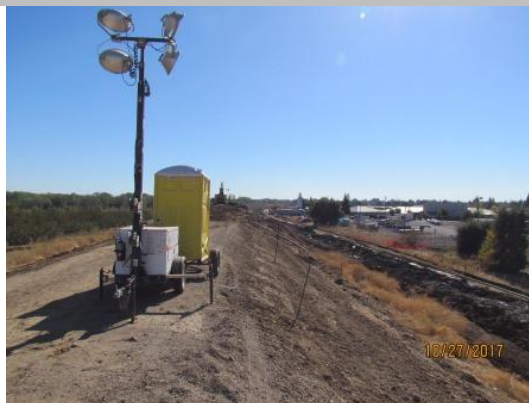
View looking downstream at the end point of the new construction of the levee, Fall 2017.