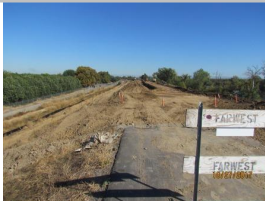
View looking upstream at the start point of the new construction of the levee, Fall 2017.