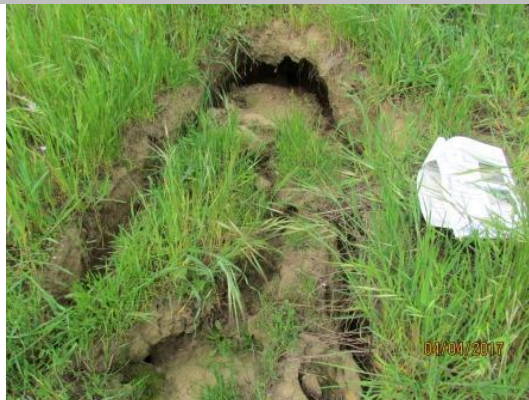
View looking up from bottom of waterside slope at the same large animal burrow that needs to be repaired, Spring 2017.

* Location LS : Land Side N/A : Not Applicable WS : Water Side CR : Crown